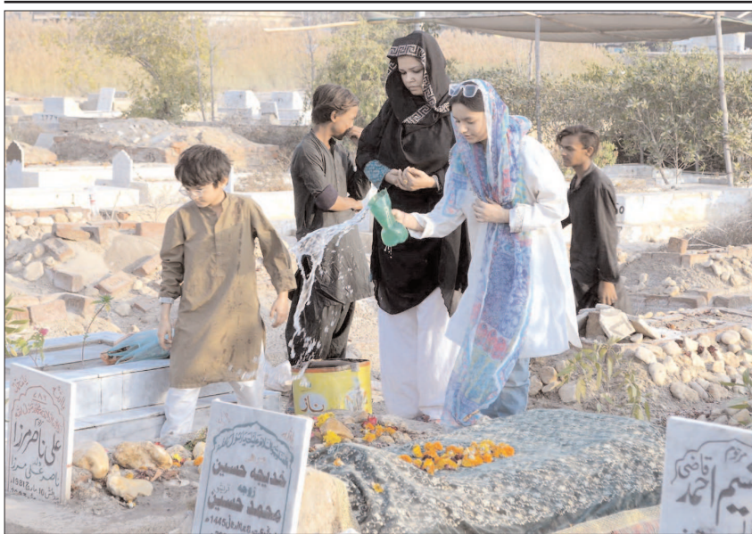
HYDERABAD: Woman washing and cleaning graves of their loved ones on the occasion of Shab-e-Barat.

The two sides also signed cooperation agreement in the field of water. The documents were exchanged between Minister for National Food Security and Research Rana Tanveer Hussain, and Turkish Minister of Agriculture and Forestry Ibrahim Yumakli. Minister of Information and Broadcasting Attaulah Tarar and Director of Communications Fahrettin Altun exchanged the signed documents of MoUs on cooperation in the field of public relations and communications, and cooperation in the field of media and communications. Meanwhile, the two sides signed MoU on cooperation in the fields of religious services and religious education.