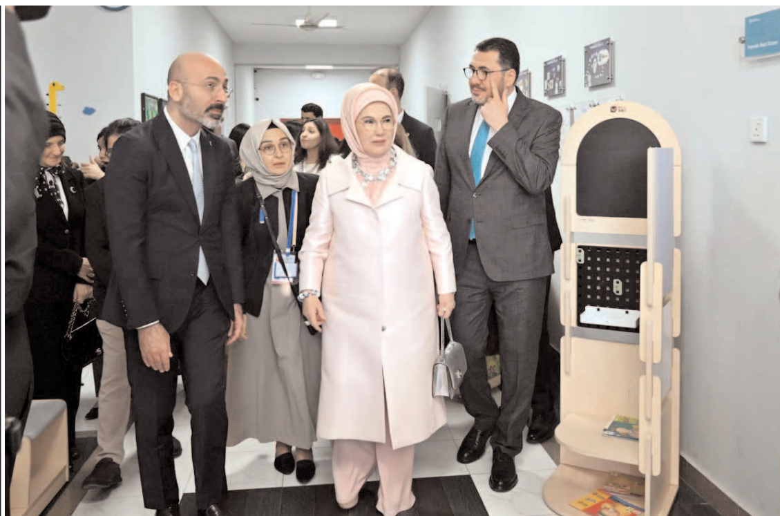
ISLAMABAD: First Lady of Türkiye Emine Erdogan visiting Maarif School in Sector H-8.

He stressed the need for Pakistan to embrace modern, sustainable practices in alignment with global trends, noting that effective collaboration between policy-makers, industry leaders, and stakeholders is crucial for the successful implementation of EV infrastructure regulations. The collaboration between ICCI and NEECA marks a significant step towards fostering the development of electric vehicle infrastructure in Pakistan, paving the way for a more sustainable and eco-friendly future, he concluded.