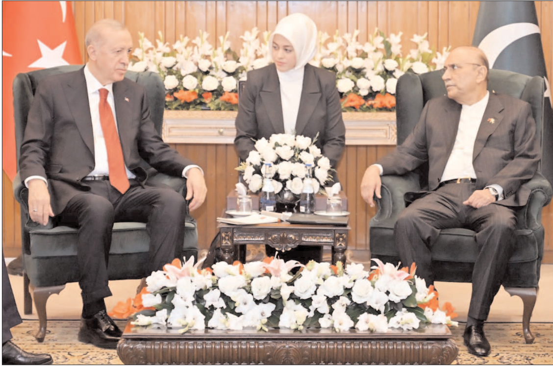
ISLAMABAD: President Asif Ali Zardari in a meeting with President of Türkiye, Recep Tayyip Erdoğan at Aiwan-e-Sadr.