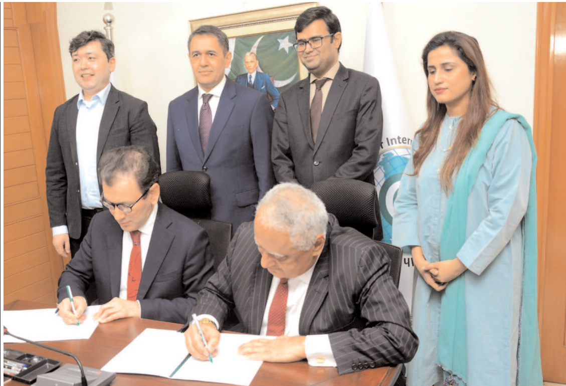
KARACHI: A view of MoU signing ceremony between International Institute of Central Asia and Center for International Strategic Studies Sindh.

The price of gold in the international market increased by $25 to $2,913 from $2,888 whereas the prices of silver in international market increased by $0.55 to $32.25, the Association reported.