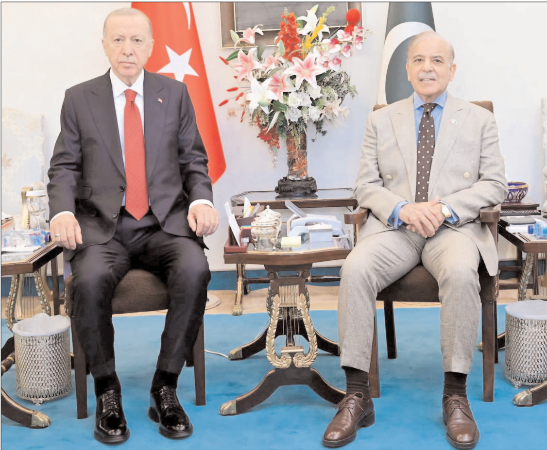
ISLAMABAD: Prime Minister, Shehbaz Sharif and President of Turkiye, Recep Tayyip Erdogan exchanging views during meeting.