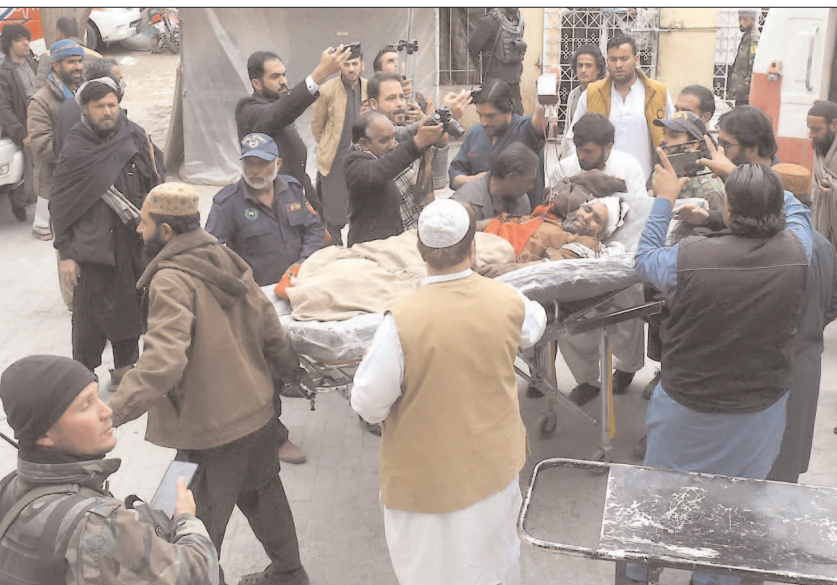
QUETTA: People shifting an injured person to civil hospital after bomb blast in Harnai.