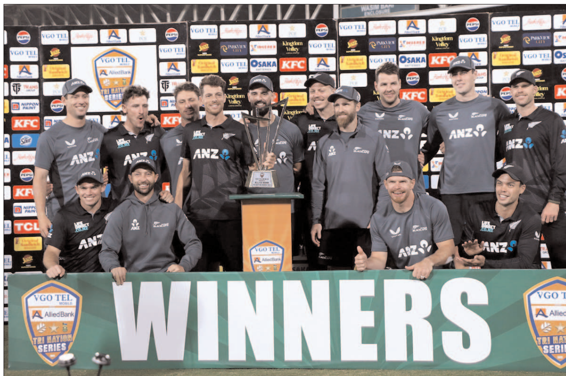
KARACHI: A group photo of New Zealand's Cricket team after winning the Tri-Nation series trophy-2025 beating Pakistan in final match at the National Stadium.

Player of the series – Salman Ali Agha (Pakistan).