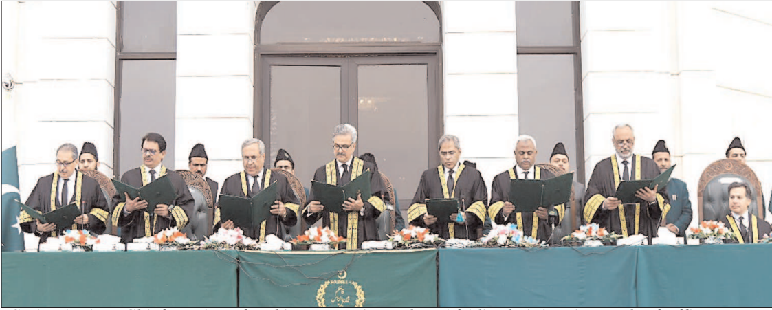
ISLAMABAD: Chief Justice of Pakistan, Justice Yahya Afridi administering oath of offices to new Supreme Court judges.

As regards al-Qaeda, the report said it sought to strengthen cooperation with regional terrorist organizations of non-Afghan origin that operate in the country (TTP, Islamic Movement of Uzbekistan, ETIM/TIP, Jamaat Ansarullah) to expand their presence in neighbouring countries. "Member States judged Sayf al-Adl's strategy to reorganize Al-Qaeda's presence in Afghanistan and reactivate sleeper cells in Iraq, Syria, Libya, and Europe indicative of the group's longer-term intent to carry out external operations." "The Taliban maintained a permissive environment allowing Al-Qaeda to consolidate, with the presence of safe houses and training camps scattered across Afghanistan," the report added.