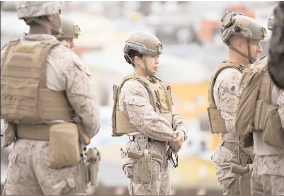
WASHINGTON: US Marines wait to be deployed along US-Mexico border near the San Ysidro Port of Entry.