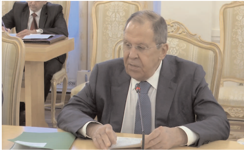
KABUL (Ariana News): Russian Foreign Minister Sergey Lavrov has expressed concern over the situation in Afghanistan, saying it

poses a serious threat to neighboring countries.