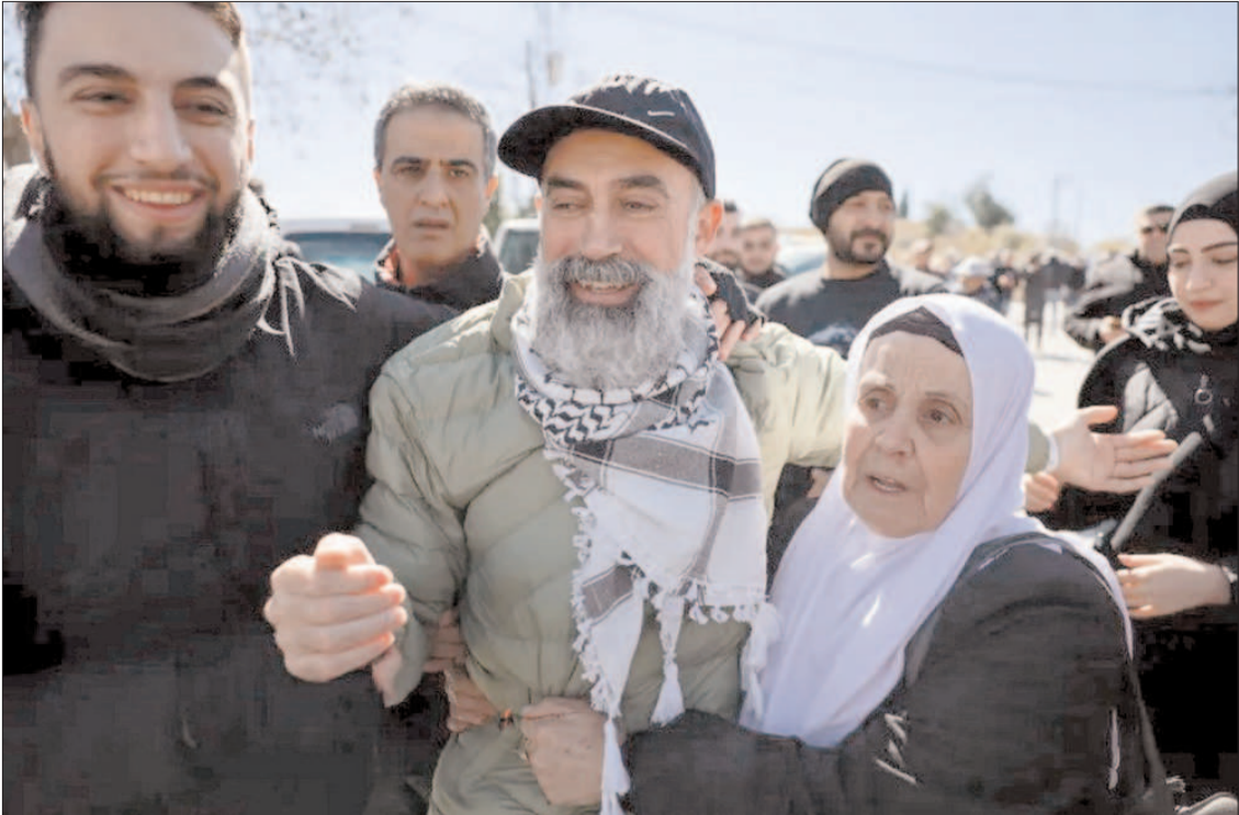
WEST BANK: A freed Palestinian prisoner reacting in Ramallah after being released from an Israeli jail.