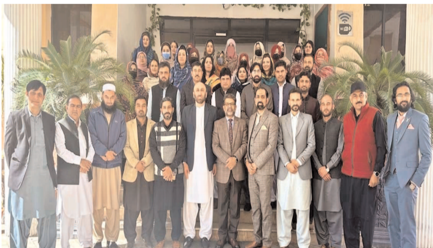
PESHAWAR: A group photo of teachers with chief guest of 2-day training workshop.

The event marked a significant step forward in advancing endoscopic ultrasound services in KP, paving the way for improved patient care and professional development in the region.