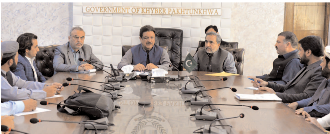
PESHAWAR: A delegation led by Mayor Mardan Himayat Ullah Khan meeting with Provincial Minister for Local Government Arshad Ayub Khan.

Therefore, they urged government and law enforcement agencies to ensure safe and early recovery of the abducted president of the Waziristan Chamber and custom officer.