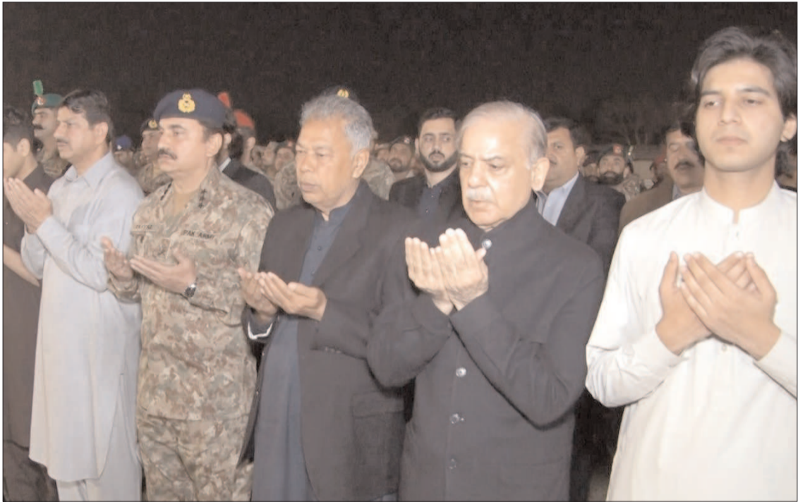
LAHORE: Prime Minister Shehbaz Sharif and others offering dua during the funeral prayer of Lieutenant Muhammad Hassan Ashraf Shaheed, who embraced martyrdom in North Waziristan.

Vol. XXXIXII No. 20 Regd. No. 241 SHABAAN 17 1446 -- SUNDAY, FEBRUARY 16 2025 PESHAWAR EDITION 12 PAGES PRICE. 30