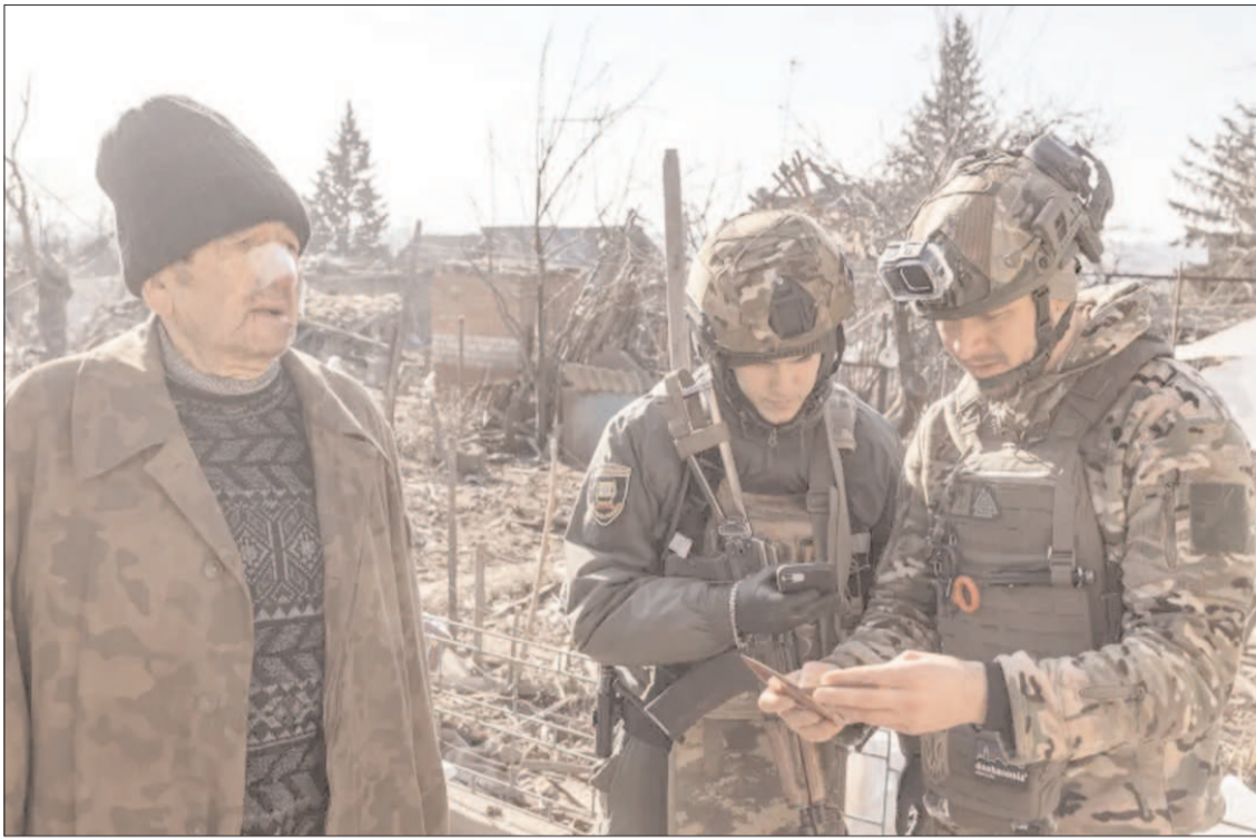
KYIV: Paramedics treating a wounded man in his home after Russian shelling as the Russia-Ukraine war continues in Kostiantynivka, Ukraine.