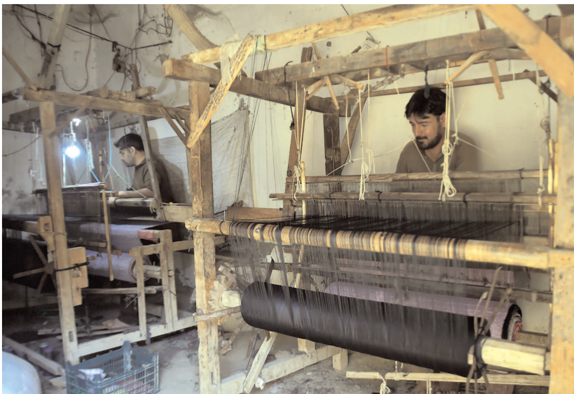
PESHAWAR: Workers busy in making traditional warm shawl on his workplace at Charsada Road.