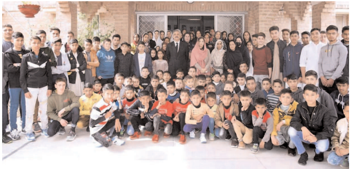
PESHAWAR: Chief Justice of Pakistan Justice Yahya Afridi in a group photo with children and management of SOS Village in Hayatabad.