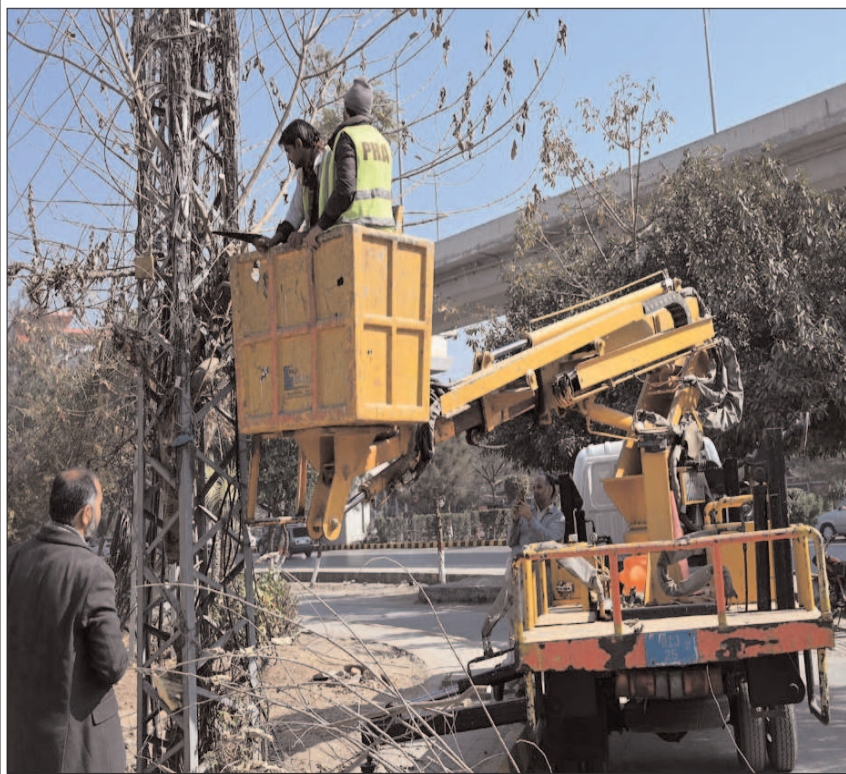
RAWALPINDI: PHA workers carefully trim trees interfering with electricity pylons and cables to prevent hazards near Pindi Cricket Stadium.

IGP Rizvi further stated that maximum arrests of declared suspects should be made. The protection of citizens' lives and property is our top priority, and no negligence will be tolerated in this regard.