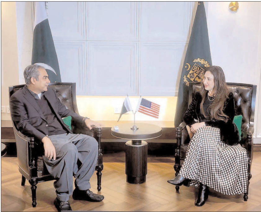
ISLAMABAD: Federal Interior Minister Mohsin Naqvi in a meeting with Acting US Ambassador Natalie Baker.