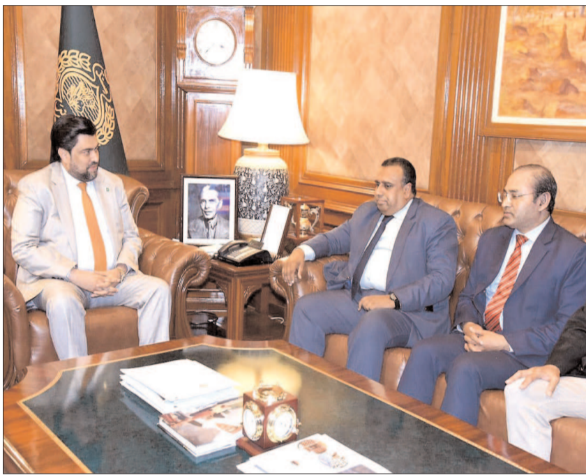
KARACHI: Governor Sindh Kamran Khan Tessori meeting with High Commissioner of Bangladesh, Iqbal Hussain Khan at Governor House.

The minister reaffirmed that Maryam Nawaz's vision and policies are entirely focused on the welfare and uplift of the common people.