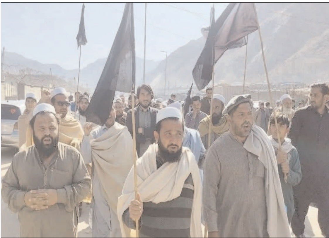
LANDI KOTAL: Labourers and daily wagers holding a protest in favour of their demands at Torkham border.

NAWABSHAH (INP): A joint team of WAPDA officials, Police and Rangers conducted massive action against electricity theft, illegal connections and recovery of electricity dues in different areas of city including Jamshed Colony, Ghulam Hyder Shah Colony, Rao Hanif colony and Mumtaz colony. During the joint operation illegal connections were disconnected and huge amount was recovered in arrears. Team officials said that the action was initiated with the objective of taking strict measures against electricity theft and preventing national loss. Officials said that operations would remain in process till objective is achieved. Officials said that during operation Rs 625000 were recovered from defaulters while 17 connections were disconnected and 4 persons were arrested for recovery of pending dues.