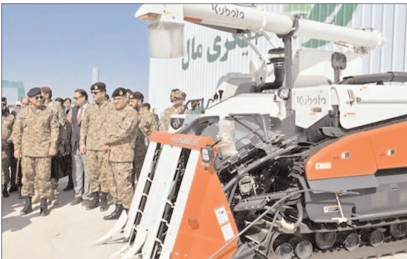
CHOLISTAN: Chief of Army Staff, General Azim Munir inspecting agriculture machinery at the launching ceremony of Green Pakistan Initiative.