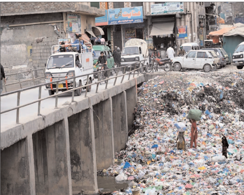
ISLAMABAD: Gypsy children searching for valuables in heaps of garbage under the bridge on Korang Nullah are creating environmental problems, which require the attention of the concerned authorities.