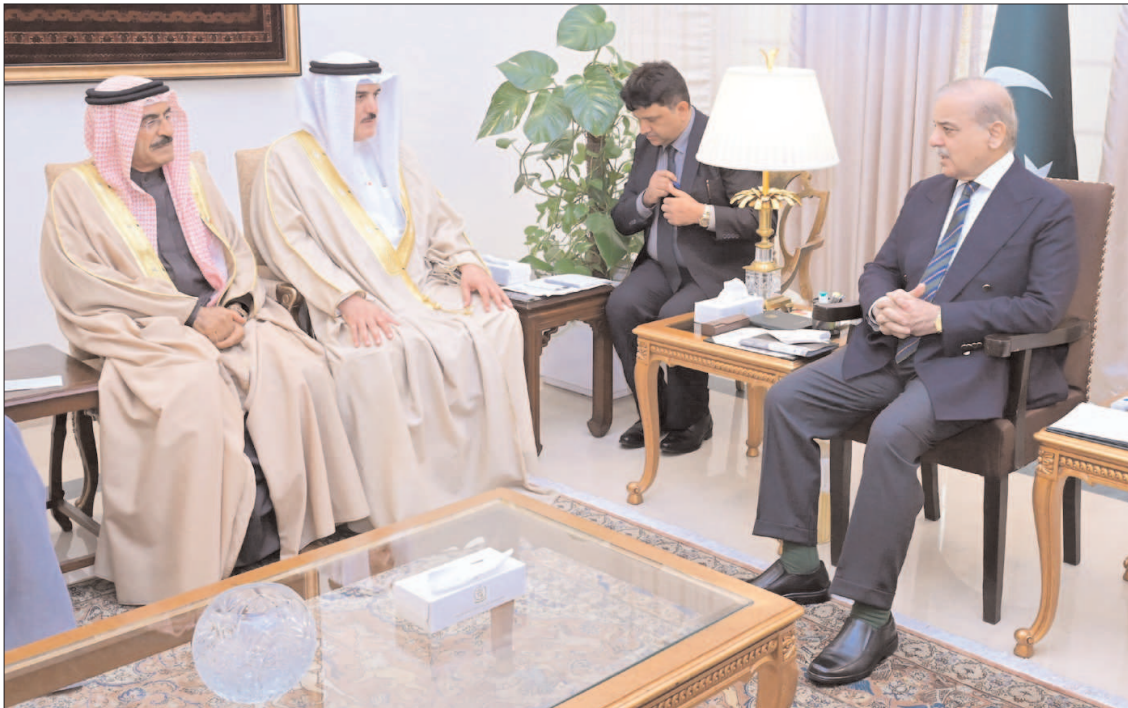
ISLAMABAD: Speaker of Council of Representative of Bahrain, Ahmed bin Salman al-Musallam called on Prime Minister Shehbaz Sharif.