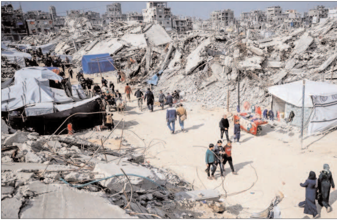
GAZA: Palestinians walk on a street among the rubble of buildings destroyed during Israeli offensive.