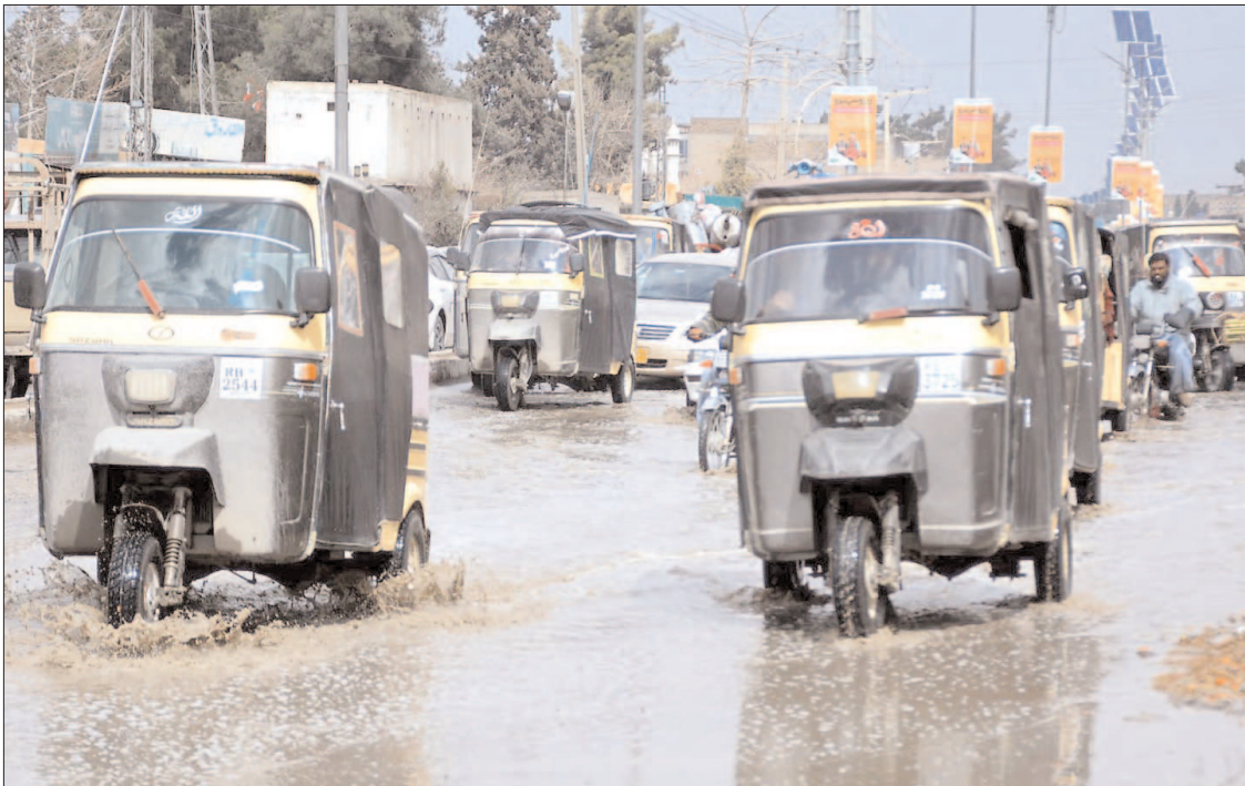
QUETTA: A view of accumulated rainwater at Saryab Road.

ALI PUR (INP): An accident in Alipur claimed three lives, leaving more than 10 others critically injured when a motorcycle and a passenger van collided on Wednesday.