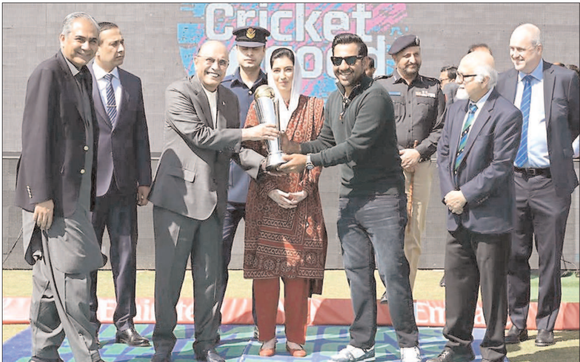
KARACHI: President Asif Ali Zardari and First Lady, MNA Aseef Bhutto Zardari being presented with Champion Trophy by former captain of Pakistan Cricket Team, Sarfraz Ahmad, at National Stadium.