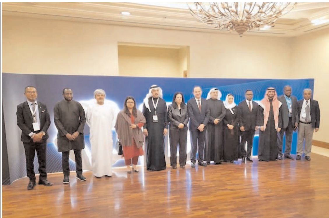
JORDAN: Minister of State for Information Technology and Telecommunication Shaza Fatima Khawaja attending Ministerial gathering of 4th Digital Cooperation Organization General Assembly.

On a month-on-month basis, the petroleum imports into the country however decreased by 12.31 percent during January 2025, as compared to the imports of $ 1,565.019 million in December 2024.