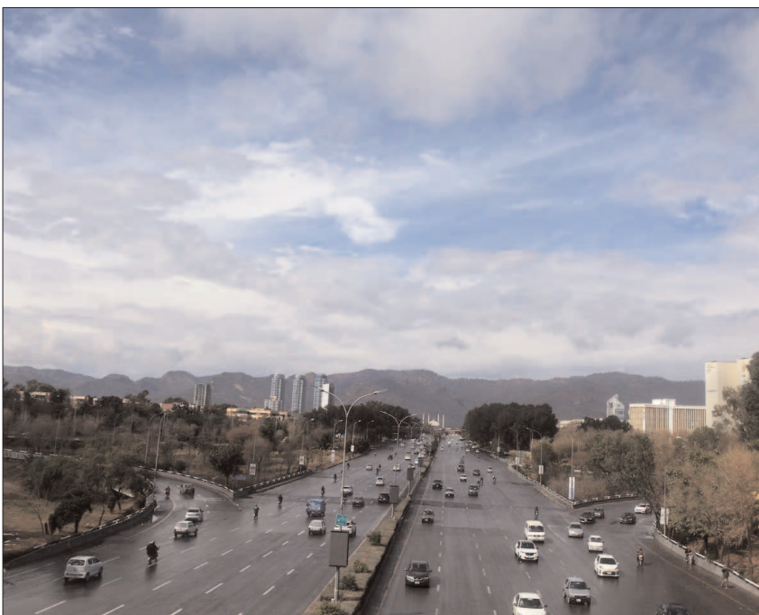
ISLAMABAD: A beautiful view of clouds hovering in the sky after rainfall in the Federal Capital.

The Senate Chairman also lauded Azerbaijan's government and parliamentary leadership for successfully hosting the Asian Parliamentary Assembly, extending his congratulations on the achievement.