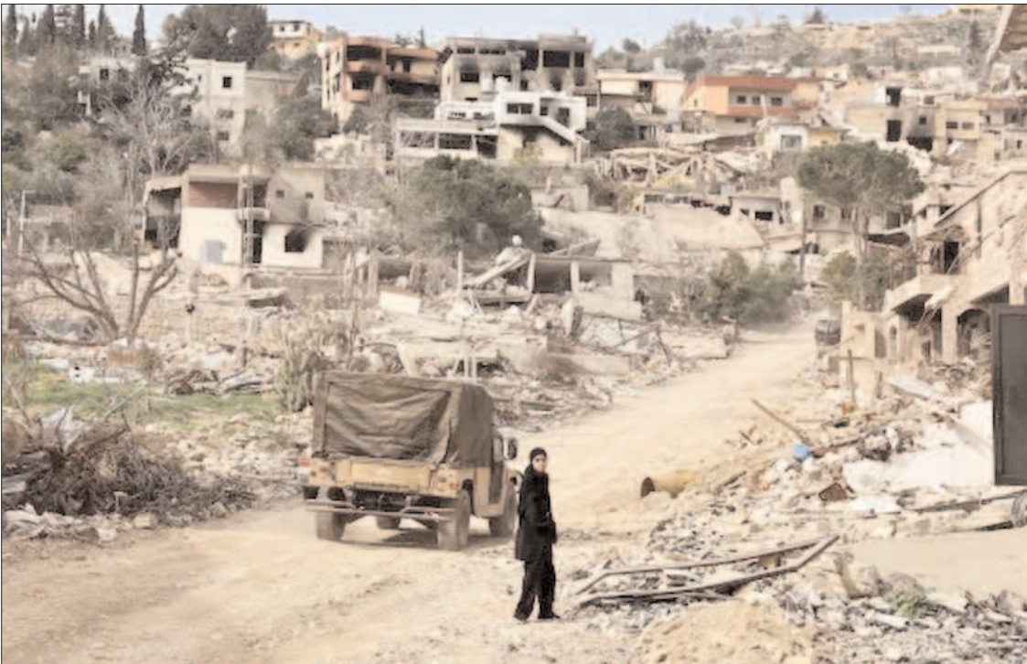
BEIRUT: A returning resident walking near a damaged site amid destroyed buildings, as Israeli troops withdrew from most of south Lebanon.

According to the website of the US Embassy and Consulates in China, the Beijing embassy complex houses more than 1,300 American and locally hired staff representing almost 50 different US federal agencies. Martin Romualdez assassinated if she herself were fatally attacked amid an escalating political rivalry between the two highest leaders of one of Asia's most unwieldy democracies. The vice president has denied that her remarks in an online news conference in November amounted to a threat to kill Marcos although that was what she literally said. The International Criminal Court has been investigating the large number of killings that happened under the former president's crackdowns against illegal drugs, which left thousands of mostly poor suspect dead, as a possible crime against humanity. Duterte has denied he authorized extrajudicial killings under his anti-drugs crackdowns while he was in office, but he has openly and repeatedly threatened to kill suspected drug dealers while in power.