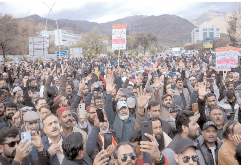
ISLAMABAD: Government employees holding a protest for acceptance of their demands.