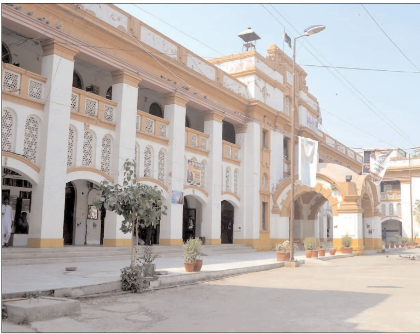
HYDERABAD: A deserted view of Session Court after lawyers' boycott.

Later, the Wafaqi Mohtasib, Qureshi also held a meeting with the heads of Federal Government agencies. He called upon the government officials to intensify efforts for prompt redressal of public complaints. Following the meeting, he informally spoke to the journalists and media representatives and highlighted the key initiatives of his office like the Informal Resolution of Disputes (IRD), Inspection Visits, Khuli Katcheries etc. which have been instrumental in providing effective redressal to public complaints.