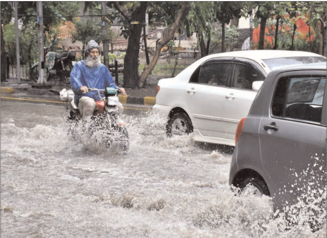
LAHORE: A motorcyclist wears rain suit to protect him from rain and cold on his way during the first rain of the season in the provincial capital.