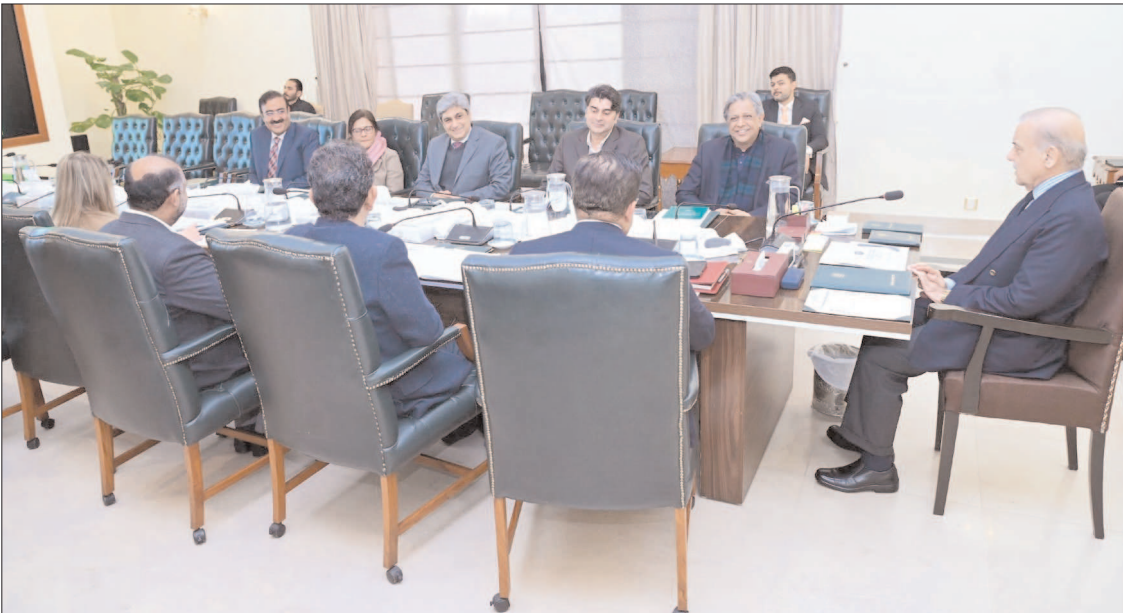
ISLAMABAD: Prime Minister Shehbaz Sharif chairing a meeting on health and pharmaceutical sector reforms.

"Out of Pakistan's 240 million population, 180 million people use the internet and we have a vibrant young population as more than 60 percent of population is under the age of 30", Attaullah Tarar informed the audience. "We are the people of Indus Valley civilization and guardians of an ancient civilization that lives on the banks of the Indus River," he said.