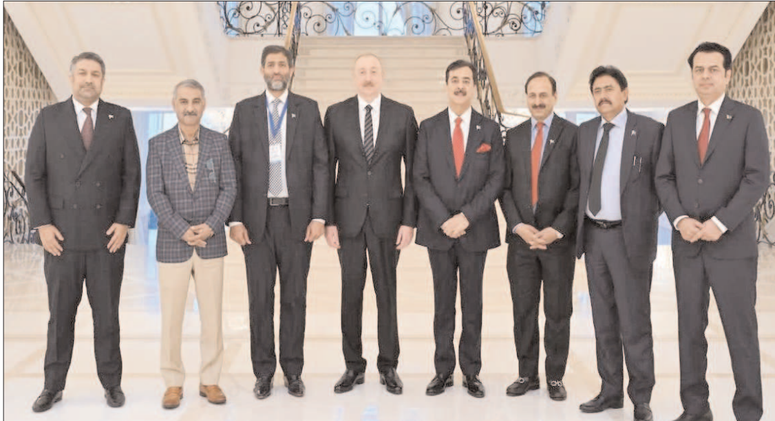
BAKU: Chairman Senate, Syed Yousuf Raza Gillani in a group photo with President of Azerbaijan, Ilham Heydar Oghlu Aliyev.

"The country's acting president, Choi Sang-mok, has not even spoken on the phone with [United States President] Donald Trump, the leader of South Korea's most important ally," he added. Yoon's vocal supporters, hundreds of whom rioted at the Seoul Western District Court after it authorised his arrest last month, have protested against the legal action being taken against him. Yoon has also maintained a defiant stance, continuing to express contempt for his liberal rivals and endorsing baseless conspiracy theories about election fraud. — Aljazeera