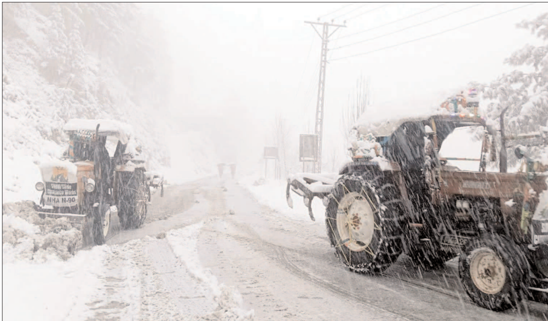
SHANGLA: Administan staff with the help of tractors removing ice from Khwaza Khela, Alpuri main highway after snowfall.