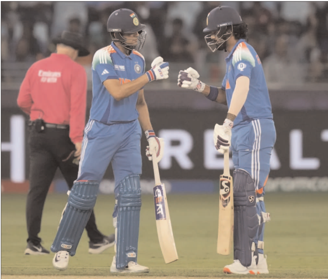
DUBAI: Shubman Gill and KL Rahul forged a steady partnership.

ABU DHABI (AFP): Italy's Jonathan Milan prevailed in a tight sprint to claim Thursday's wind-battered UAE Tour fourth stage with Tadej Pogacar retaining the leader's red jersey. Milan added to his opening day success, edging out Belgian duo Tim Merlier and Jasper Philipsen at the line. Pogacar, who won Wednesday's third stage, remained in command of the general classification after the 181km ride from Fujairah Qidfa Beach to Umm al Quwain. Lidl-Trek rider Milan will be hoping to add another win in Friday's sprinter-friendly 160km fifth stage. The 24-year-old has established himself as one of the top sprinters around and will be one to watch in next month's Milan-SanRemo one-day classic. "It's true that this type of race is very important for the classics," Milan noted. "It was windy today so in terms of position and managing the nerves it will help to gain experience," he added.