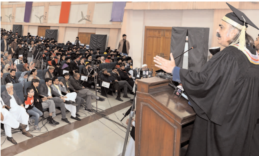
PESHAWAR: Chief Minister KP Ali Amin Khan Gandapur addressing convocation of University of Engineering & Technology Peshawar.

According to the official notification on Friday, the age limit has been raised from 30 to 35 years for PMS exam candidates. Additionally, the number of PMS test attempts has been increased from three to four for the next two years.