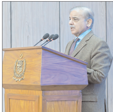
Sharif's leadership in driving government reforms, particularly in modernizing Pakistan's justice sector.

Country Representative of UNODC Troels Vester highlighted that the Office was committed to improving the justice system by making it faster, more efficient, and fairer for all through effective oversight mechanisms. He extended appreciation to Prime Minister Shehbaz