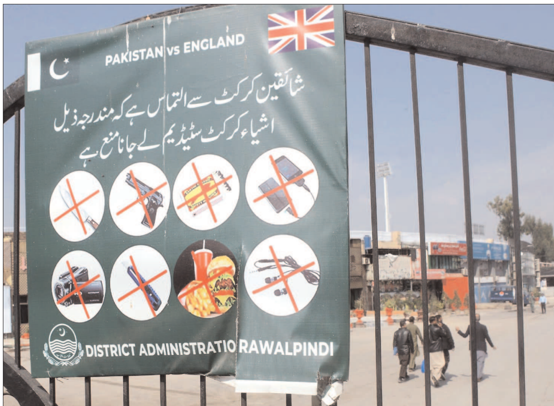
RAWALPINDI: District Administration placed a notice on the gate during arrangements for the ICC Champions Trophy cricket matches at Pindi Stadium.