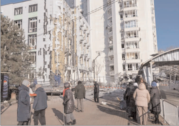
attack drones for almost three years," he said.

The temperature in the Black Sea port was about minus 6 degrees Celsius (21 F). "Rescue operations are underway in Odesa after another Russian attack on the energy infrastructure," Zelenskyy wrote after the first attack. "It is civilian energy facilities against which the Russian army has not spared neither missiles nor