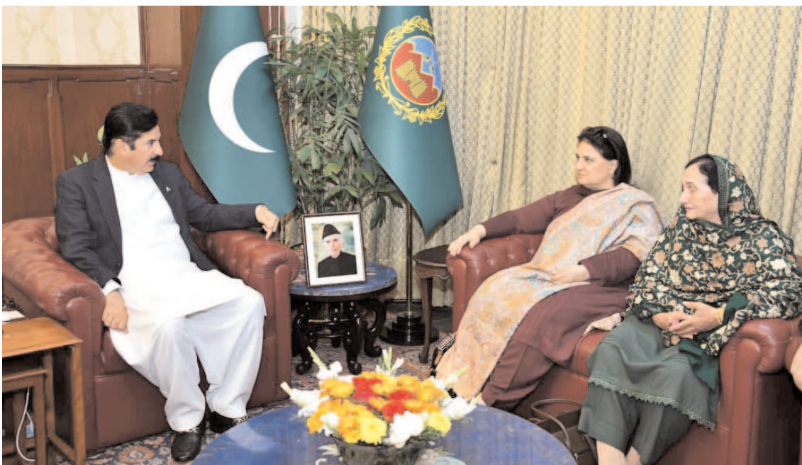
PESHAWAR: Chairperson Benazir Income Support Program Rubina Khalid meeting with Governor Khyber Pakhtunkhwa Faisal Karim Kundi at Governor's House.