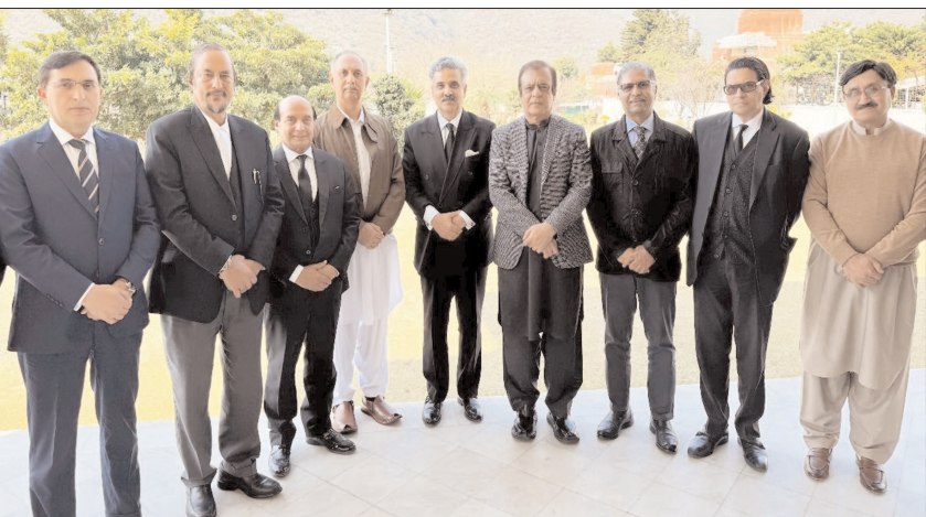
ISLAMABAD: Chief Justice of Pakistan, Justice Yahya Afridi in a group photo with opposition leadership at Chief Justice House.

As the tension over the Gaza ceasefire rose, Netanyahu ordered the Israeli military to intensify operations in another Palestinian territory, the occupied West Bank, after a number of explosions blew up buses standing empty in their depots near Tel Aviv. No casualties were reported but the explosions were a reminder of the campaign of suicide attacks on public transport that killed hundreds of Israeli civilians during the Second Intifada in the early 2000s.