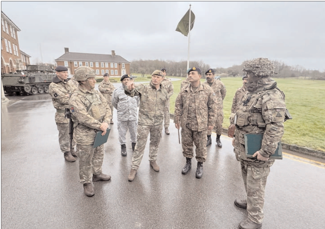
RAWALPINDI: General Syed Asim Munir, NI (M), Chief of Army Staff on the invitation of General Roland Walker, CGS UK Army had a field visit to Warminster and Larkhill Garrisons. COAS was briefed on the modernisation plan of British Army and Deep Recce Strike Brigade. Niche technologies including AI and uncrewed systems were also showcased by the British Army during the visit.