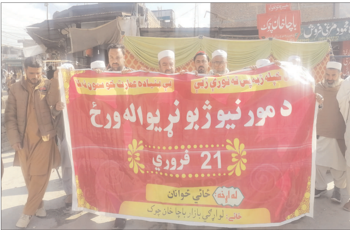
LANDI KOTAL: Tribesmen holding a banner during a rally to mark International Mother Language Day.