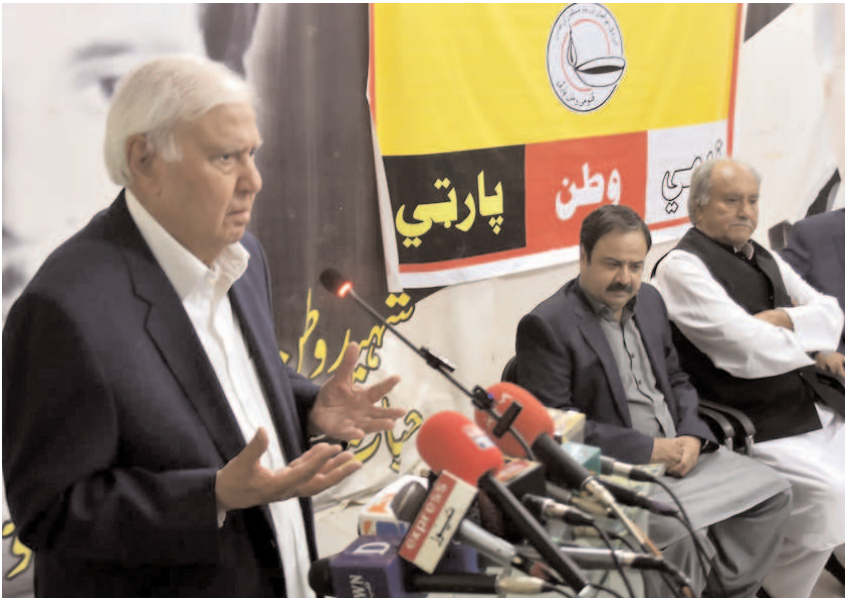
PESHAWAR: Chairman Qaumi Watan Part Aftab Ahmad Khan Sherpao addressing on "Mother Languages Day" ceremony at Watan Kor.

The QWP leader said that promises made at the time of merger of ex-Fata should be honoured. "The integration of Fata into Khyber Pakhtunkhwa was a step towards mainstreaming the region, but the government must fulfill its promises to ensure lasting benefits," he added.