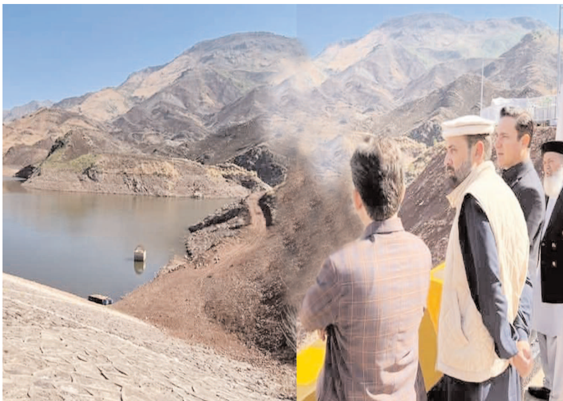
NOWSHERA: Khyber Pakhtunkhwa Minister for Irrigation Aqib Ullah Khan visiting Jaroba Dam in District Nowshera.

FAISALABAD (INP): Federal Minister for Maritime Affairs Qaiser Ahmed Sheikh said that education was imperative for national progress and the government was utilizing all available resources to provide quality education at doorsteps of the masses. He expressed these views while addressing the Silver Jubilee ceremony of Chiniot Islamia school and College Faisalabad where he also announced a donation of Rs.1 million for the institution. He said that Pakistan was passing through a crucial stage. "However, the government under dynamic leadership of Prime Minister Shehbaz Sharif, dragged the country out of multifaceted crisis and put it on the road to progress and prosperity.