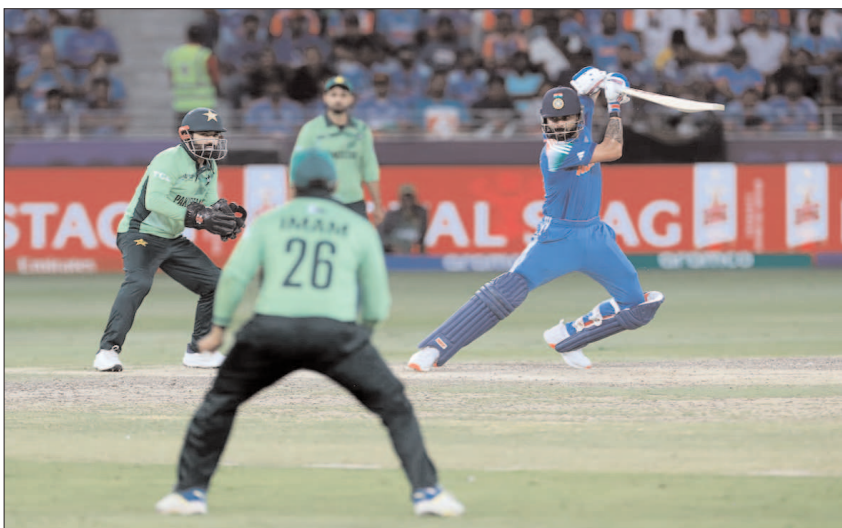
DUBAI: India's Virat Kohli in action during a match-winning inning in a match against Pakistan.