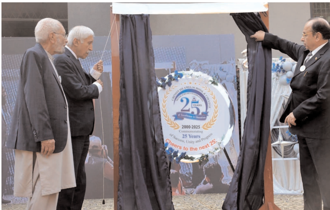
CHINIOT: Federal Minister for Maritime Affairs Qaiser Ahmed Sheikh inaugurating the 25 years celebration of Islamia College.