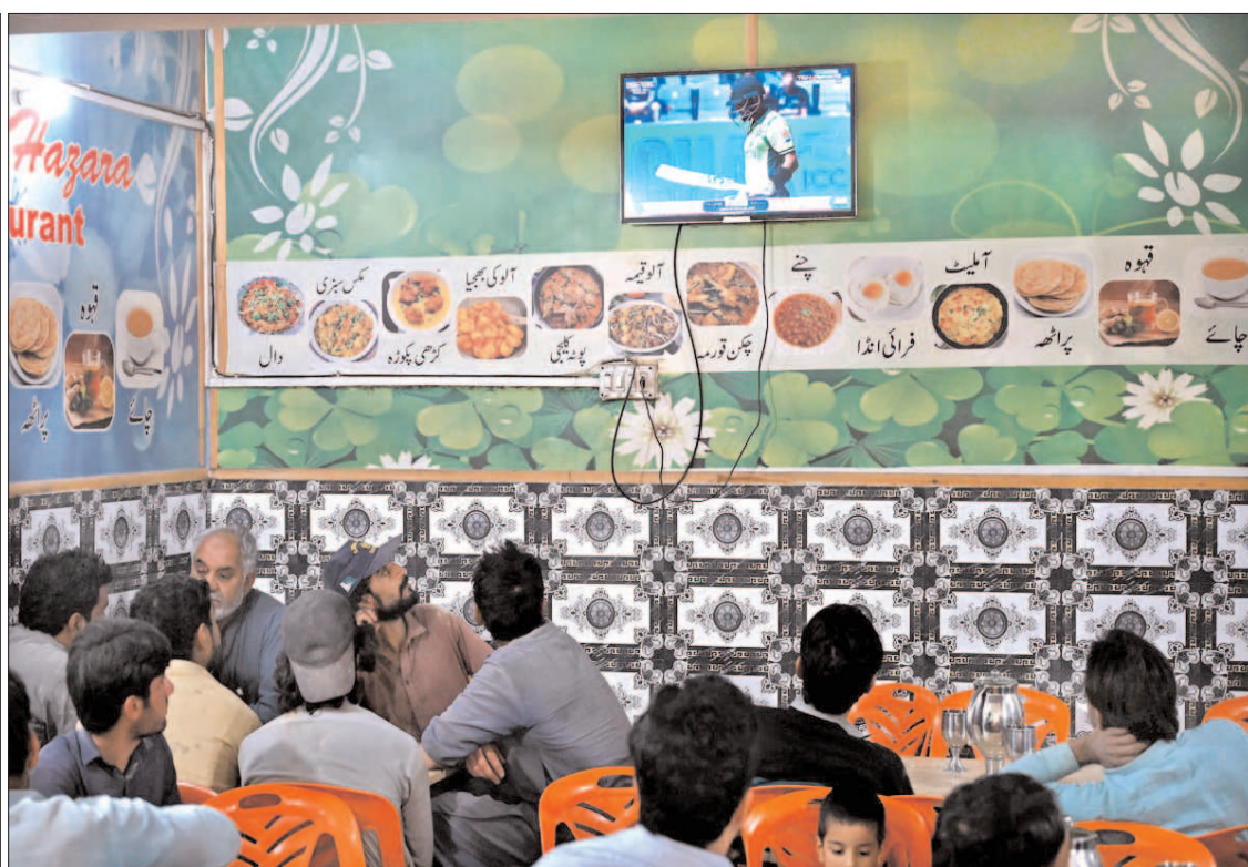
ISLAMABAD: People watching ICC Champion Trophy cricket match playing between Pakistan and India on TV in a local restaurant in the federal capital.

She advised limiting screen time to 1-2 hours daily can ensure a healthy balance adding that encourages kids to engage in outdoor games and sports to promote physical activity and teamwork. She recommended monitoring children's mobile phone use to set responsible boundaries and limits, while also encouraging social interaction to foster essential communication skills and emotional intelligence.