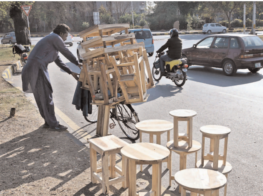
ISLAMABAD: A vendor selling hand-made wooden stools along the roadside in the city.

However, she expressed concern that despite its benefits, commuters are forced to wait for an extended period only to board a jam-packed bus, highlighting the need for improvements to the service.