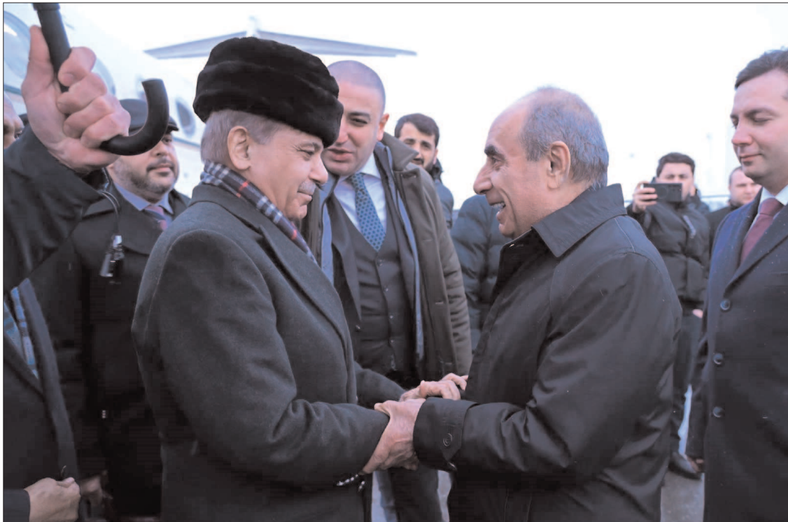
BAKU: Deputy Prime Minister of Azerbaijan Yaqub Abdulla Oglu Eyyubov received Prime Minister Muhammad Shehbaz Sharif upon arrival at Heydar Aliyev International Airport.

The Prime Minister is accompanied by a high-level ministerial delegation, including Deputy Prime Minister and Foreign Minister Muhammad Ishaq Dar, Minister for Commerce Jam Kamal Khan, Minister for Investment & Privatization Abdul Aleem Khan, Minister for Overseas Pakistanis & Human Resource Development Chaudhry Salik Hussain, Minister for Information & Broadcasting Ataullah Tarar, and Special Assistant to the Prime Minister Syed Tariq Fatemi.