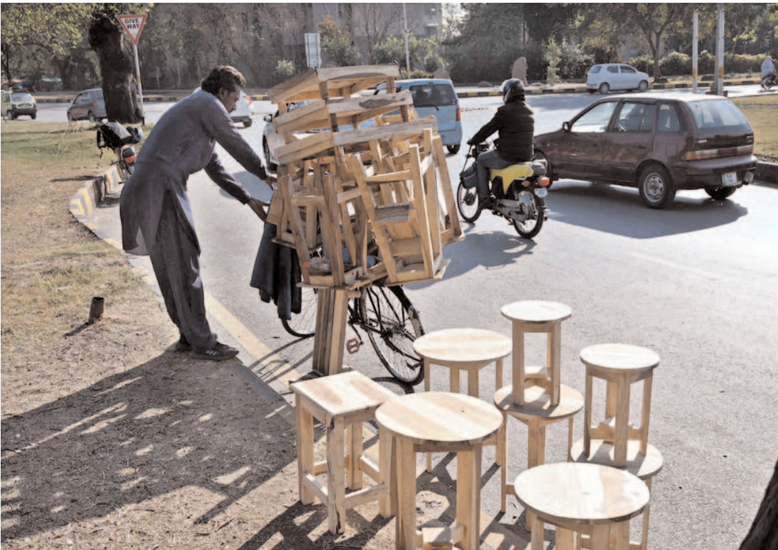
ISLAMABAD: A vendor selling hand-made wooden stools along roadside.

of the country. Sialkot represents an industrial setup producing specialized products that are supplied to top brands and buyers all over the world. We produce sports goods, surgical instruments, leather products, gloves of all sorts, textiles items, sports wear, martial arts uniform and accessories, musical instruments, kitchen ware & table ware, hollow ware, hunting knives, table cutlery/flatware, and military uniform badges,” he added. He said that Sialkot-made footballs, field hockey sticks, cricket gear and boxing gloves were used in international games including the Olympics and World Cups. Earlier, the ambassador visited several leading industrial units in Sialkot. He witnessed the craftsmanship of artisans and took keen interest in the production process of sports goods and surgical instruments.