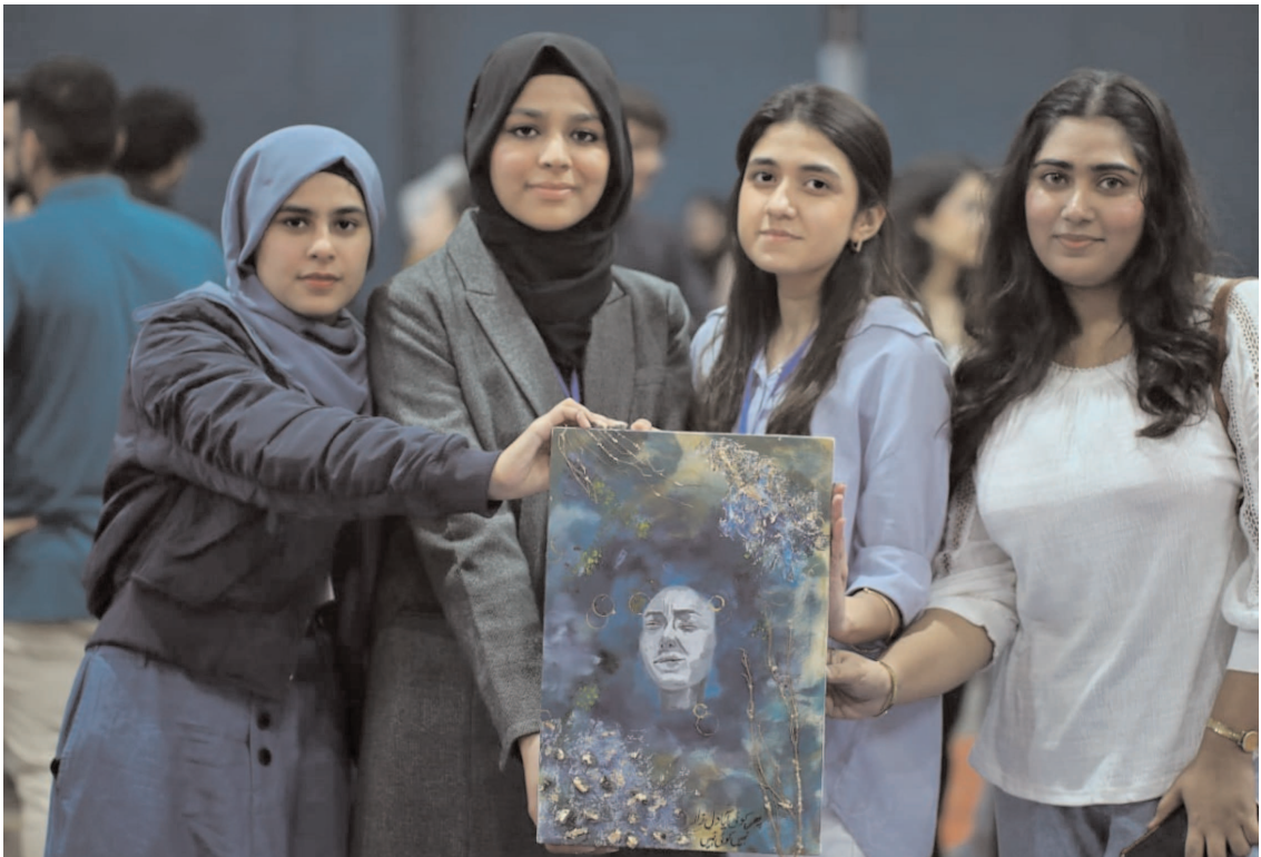
PESHAWAR: Students presenting their painting during Art and Fashion Show organized jointly by KP Cultural and Tourism Authority and Ghulam Ishaq Khan Institute.