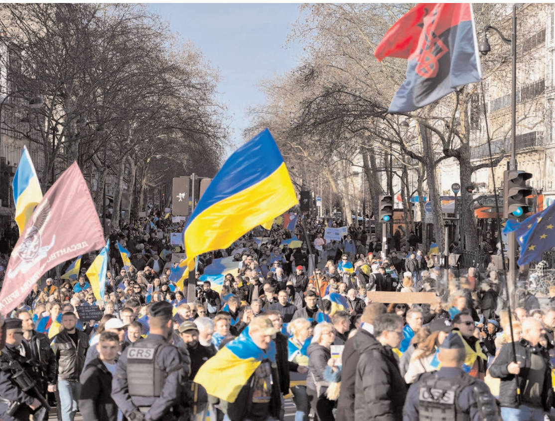
PARIS, FRANCE: Thousands of people gather on the Place de la Bastille to remember the third year of war in the Ukraine after the invasion of the country by Russia in 2022 on Sunday.

major domestic political opponents. The Ukrainian president also said he wanted to see Trump as a partner to Ukraine and more than a simply a mediator between Kyiv and Moscow. “I really want it to be more than just mediation... that’s not enough,” he told a press conference in Kyiv.