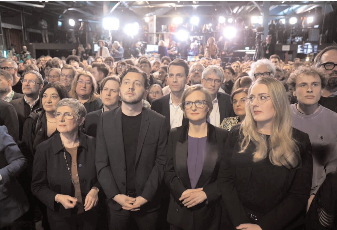
BERLIN, GERMANY: Co-leaders of Germany's Green party Felix Banaszak (2nd L) and Franziska Brantner (2nd R) attend the Greens Party election evening gathering to initial results in snap federal parliamentary elections on Sunday in Berlin, Germany.

“very good, solid businessman.” “If there’s any conflict, he will stop it. But if he didn’t, I’d stop it,” Trump said. “We’re talking about big stuff, but he’s under a pretty big microscope. I mean, everybody’s watching him.” Musk said DOGE was publicizing its actions on its website and that the transparency would hold him accountable. “The possibility of me getting away with something is zero percent,” Musk said. “I’m scrutinized to a ridiculous degree.” Musk has also waded into the Ukraine conflict this week, attacking President Volodymyr Zelensky and claiming Ukrainians “despised” their president — reinforcing Trump’s criticism of the wartime leader.