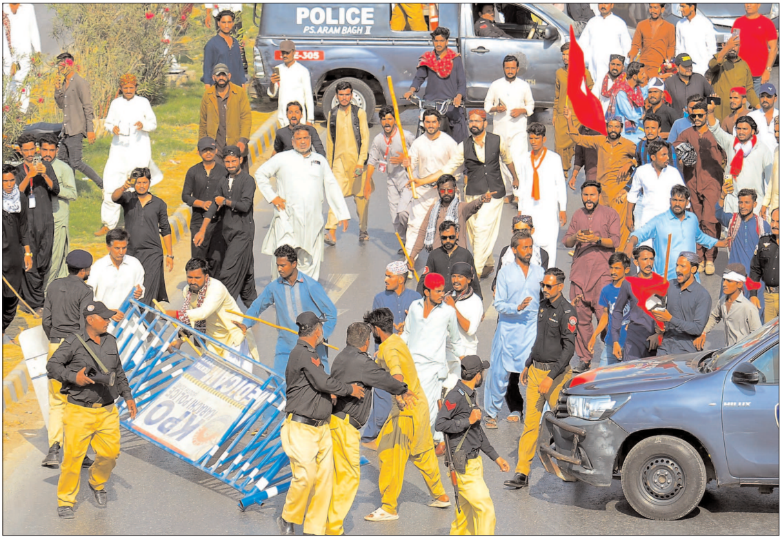
KARACHI: Police trying to stop the workers of Resistance Movement who hold a rally for no to canals on Indus River at Sharjah e Faisal.