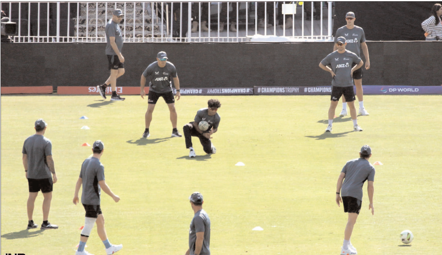
RAWALPINDI: Palyers of New Zealand cricket team take part in practice session ahead of their fixer with Bangladesh in ongoing ICC Champions Trophy at Rawalpindi Cricket Stadium.

Statistically, Shiffrin is a phenomenon with a 36 per cent win ratio in all the races she starts. She also reaches the podium in 56 percent of her races: indeed her win on Sunday gave her 155 podiums finishes, equalling another Stenmark record. She has won 16 Crystal Globes, five of which are overalls.