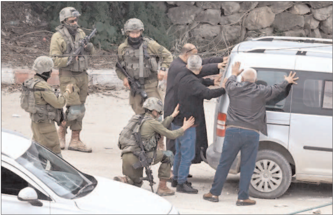
WEST BANK: Israeli soldiers detain Palestinian men during a raid in one of the refugee camps.