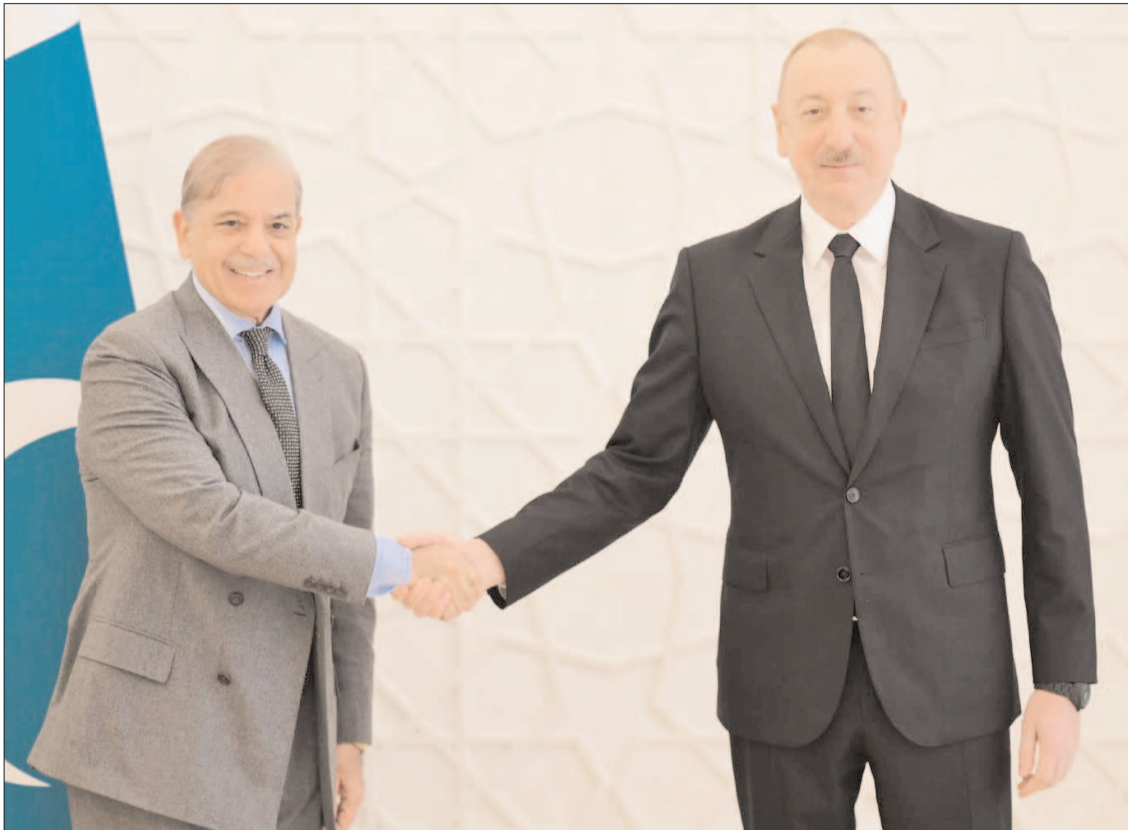
BAKU: Prime Minister Shehbaz Sharif shaking hands with President of Azerbaijan, Ilham Aliyev during one to one meeting.