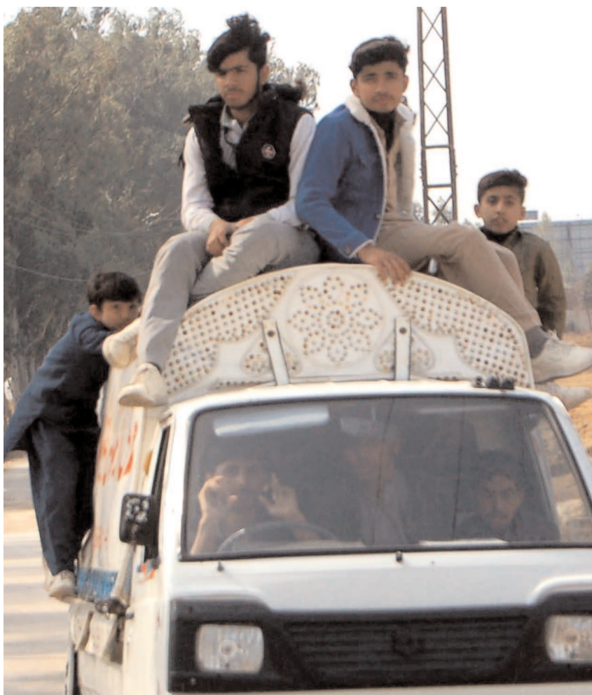
ISLAMABAD: Children sitting on the roof top of the passenger van at tarnol area may cause serious incident.

resident netted at Lahore International Airport. 3 kg ice was recovered from a vehicle stopped near Tonmi Mor, DG Khan and two suspects were arrested. 12 kg hashish was recovered from a suspect rounded up near Fateh Chowk, Hyderabad. In 10th operation, 200 grams hashish was recovered from a suspect in DI Khan. In 11th operation, 20,000 intoxicated tablets and 600 grams weed were recovered from an abandoned motorcycle in a non-inhabited area of Gwadar. Cases have been registered against the arrested suspects under the Narcotics Control Act and further investigations are under process.