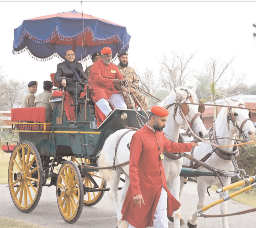
SARGODHA: President Asif Ali Zardari visiting remount depot, Mona.

Ahsan Iqbal criticized Pakistan Tehreek-e-Insaf (PTI), stating that despite holding numerous rallies before May 9, the government never created any obstacles. However, he claimed that PTI is now running a campaign against Pakistan that is more damaging than that of RAW (India's intelligence agency). Referring to financial corruption, Ahsan Iqbal said that money recovered in London was meant to be returned to the people of Pakistan, but instead, PTI returned it to the original thief. "Today, the entire PTI is defending that criminal," he remarked, adding that PTI executed the world's most transparent theft, leaving behind a complete money trail. He concluded by accusing PTI of stealing £190 million from the public and then playing the victim, stating, "They give stolen public money back to the thief and then claim political persecution."