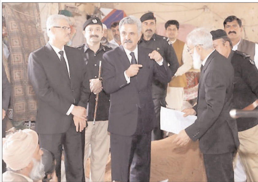
DT I KHAN: Chief Justice of Pakistan, Justice Yahya Afridi interacting with prisoners during his visit to prison.

According to the Seismological Center, the earthquake had a magnitude of 4.2 on the Richter scale. The depth of the earthquake was recorded at 140 kilometers, with its epicenter located at the Afghanistan-Tajikistan border. A few days ago, tremors were also felt in Buner and other areas of Khyber Pakhtunkhwa. That earthquake had a magnitude of 4.1 on the Richter scale, with its epicenter in Swat.