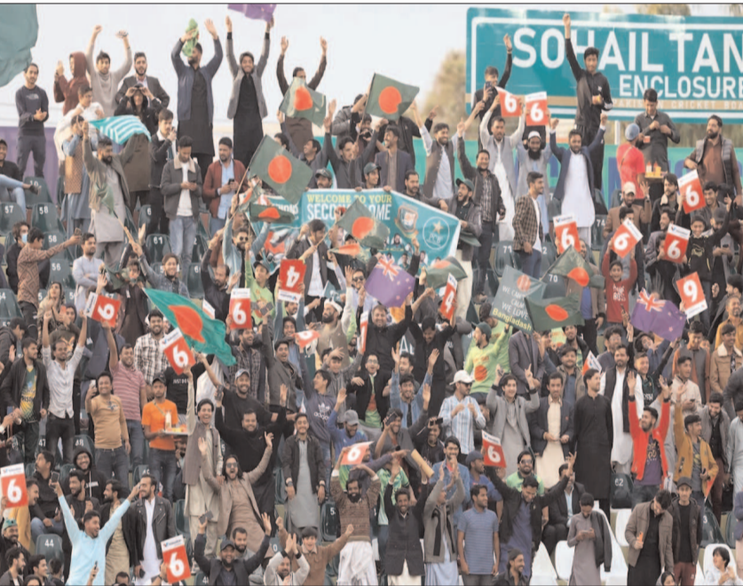
LAHORE: The Bangladesh fans make themselves heard.

Pakistan, India, Bangladesh and New Zealand are in Group A. The top two teams from each Group will qualify for the semi-finals.