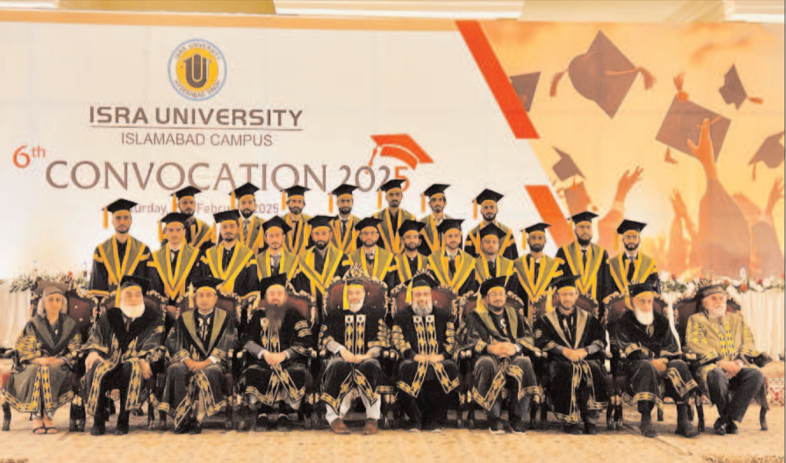
ISLAMABAD: A group photo of chief guest with staff and students during 6th convocation of ISRA University.

He emphasized the provincial government's commitment to providing financial assistance and support to minority students in higher education institutions. Both sides discussed the potential for developing religious tourism in Punjab, particularly for Sikh and Christian communities. Minister Arora stressed the importance of promoting religious tourism as a means of cultural exchange, economic growth, and fostering mutual respect between different communities.