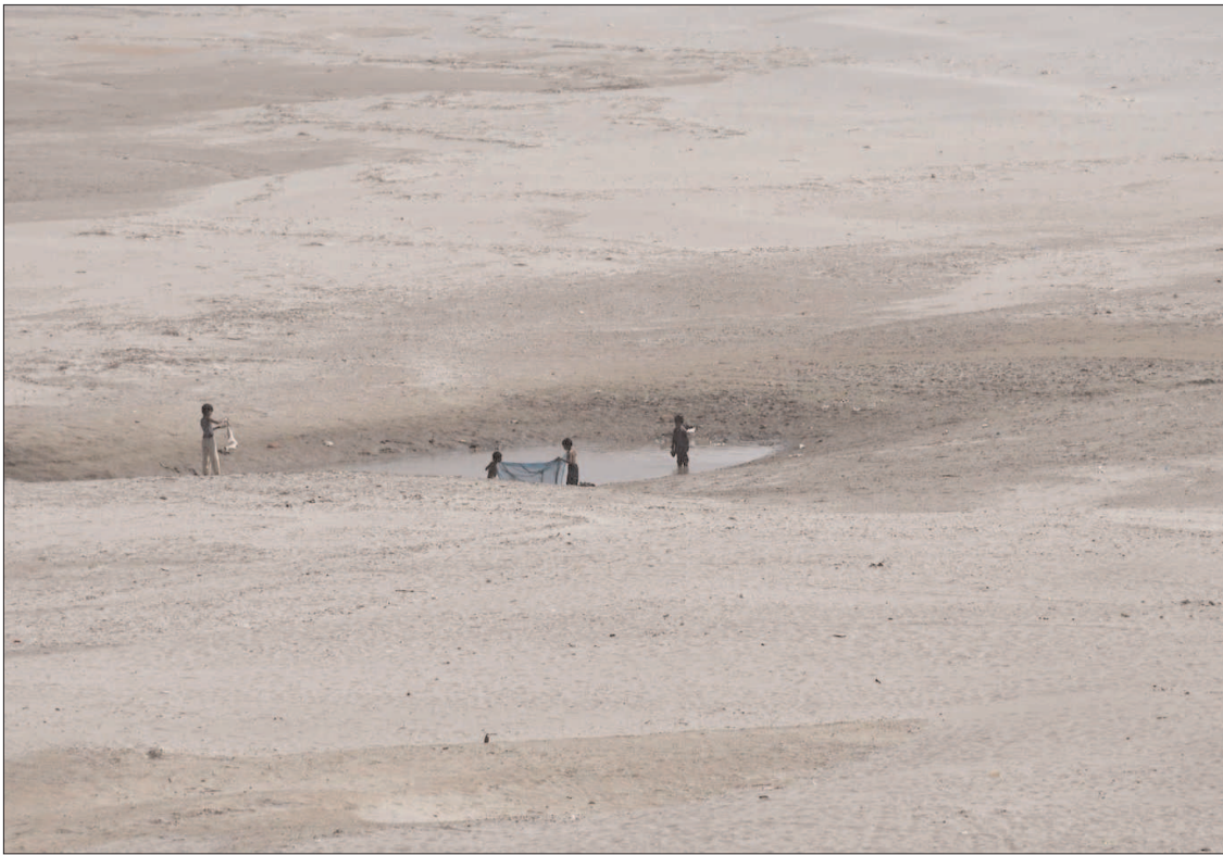
HYDERABAD: A view of dried part of Indus River due to acute shortage of water.