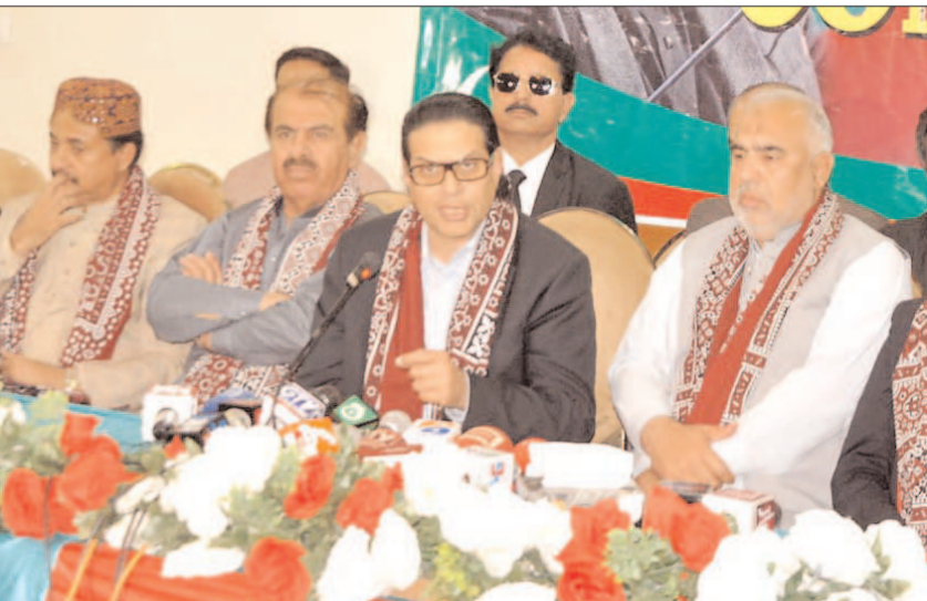
HYDERABAD: Secretary general of Pakistan Tehreek-e-Insaf, Salman Akram Raja along with other leaders addressing a press conference.