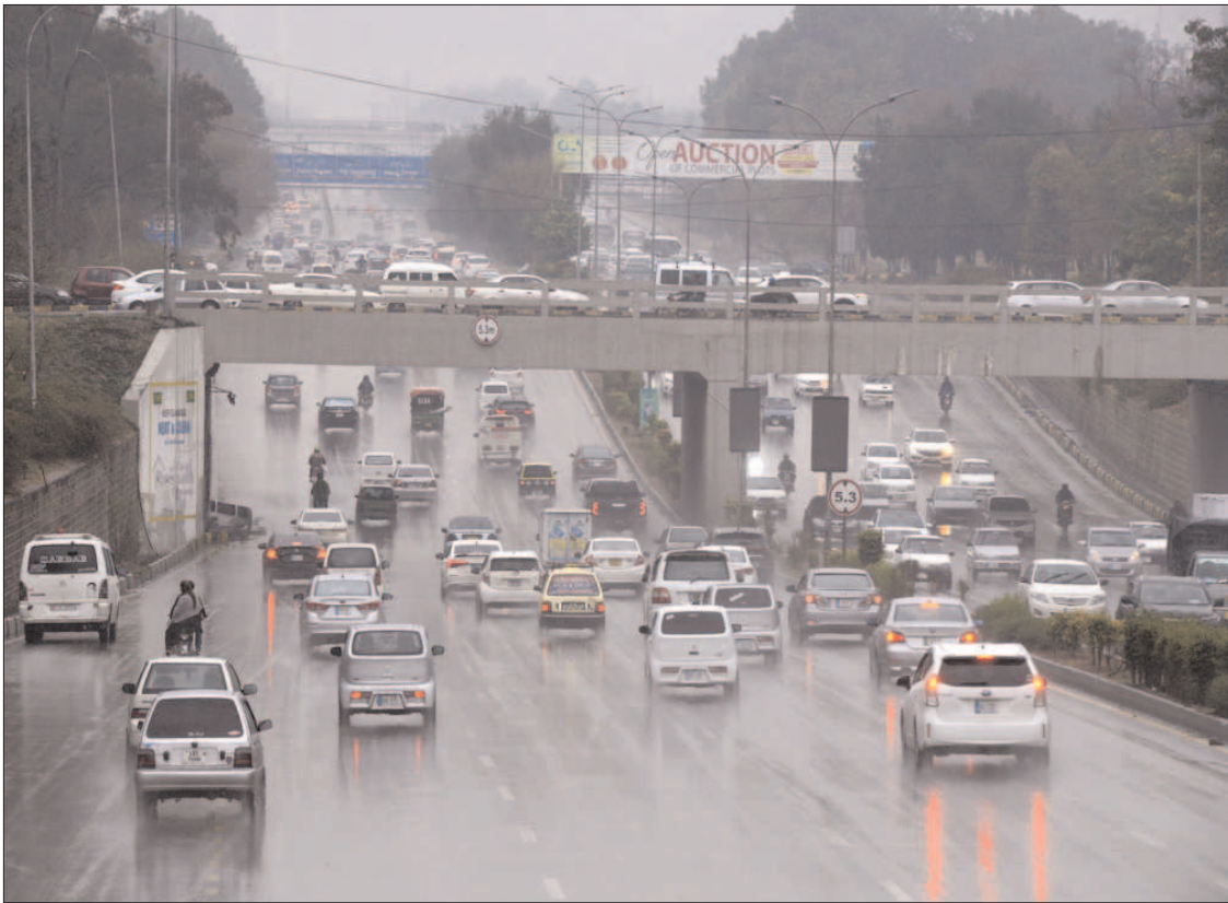
ISLAMABAD: Commuters on their way during light rain that experienced in the twin cities.