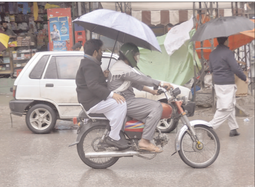
PESHAWAR: A motorcyclist on way holding umbrella during rain at Saddar Road.

"We know children are often deeply traumatised from this journey, and it can take a long time for them to be able to talk about their frightening ordeal in these boats. "It's horrifying so many children have died on this unnecessary journey. This is a clear consequence of the lack of safe routes which would save children's lives." — Arab News