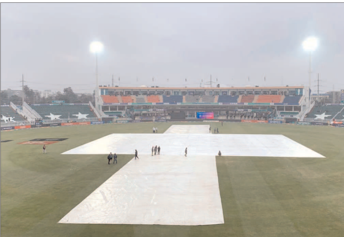
RAWALPINDI: Ground staff swiftly cover the field during a downpour to safeguard the pitch as rain delays the ICC Champions Trophy clash between Australia and South Africa at Rawalpindi Cricket Stadium.

India and New Zealand qualified for the semi-finals from Group A on Monday as title-holders Pakistan and Bangladesh crashed out of the tournament.