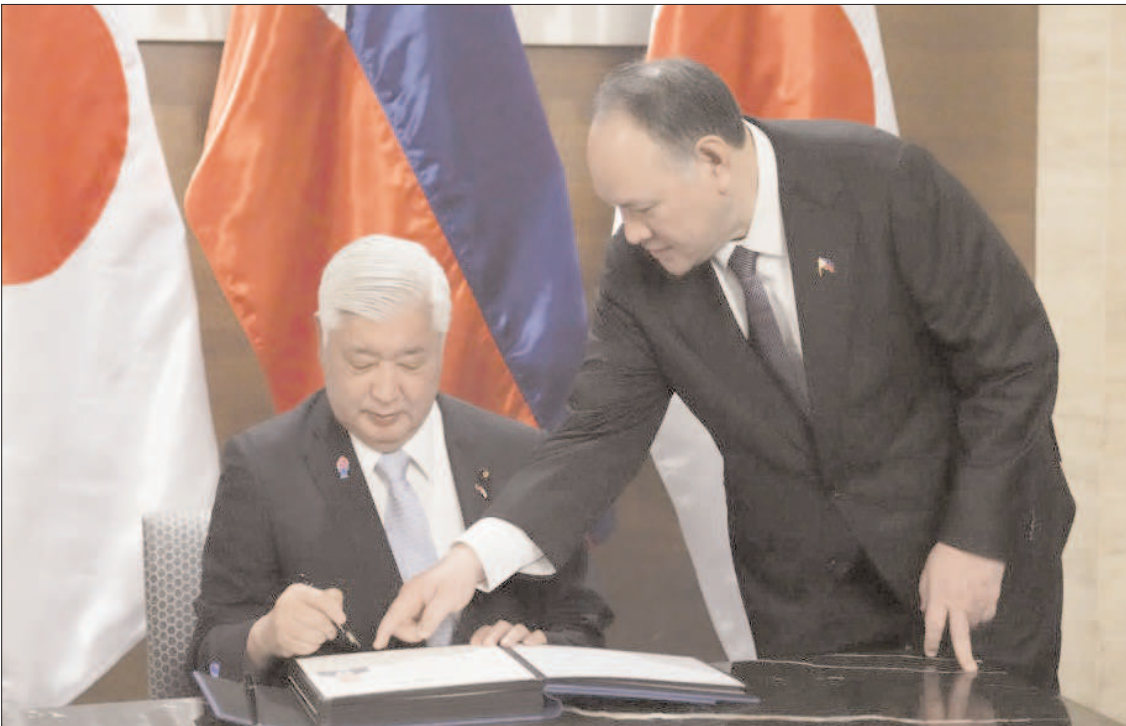
MANILA: Philippine Defense Secretary Gilberto Teodoro instructs Japanese Defense Minister Gen Nakatani during signing the guestbook in Makati city, Philippines.

It has been urging India to repatriate Hasina to face charges of crimes against humanity and money laundering, among other allegations. The UN says Hasina's government's crackdown on protesters during the uprising killed about 1,400 people. So far India has showed no sign of extraditing Hasina, who denies the charges.