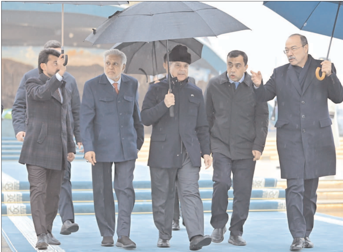
TASHKENT: Prime Minister Shehbaz Sharif and Prime Minister of Uzbekistan Abdulla Nigmatovich Aripov visiting Independence Monument.

Zelenskyy last week rejected US demands for $500 billion in mineral wealth from Ukraine to repay Washington for wartime aid, saying the United States had supplied nowhere near that sum so far and offered no specific security guarantees in the agreement. Trump, asked if it was possible that Ukraine might have to cede some territory to Russia, said, "Well, we're going to see." Macron said any deal should include sovereignty for Ukraine. British Prime Minister Keir Starmer also is to visit Trump later in the week, amid alarm in Europe over Trump's hardening stance toward Ukraine and overtures to Moscow on the conflict.