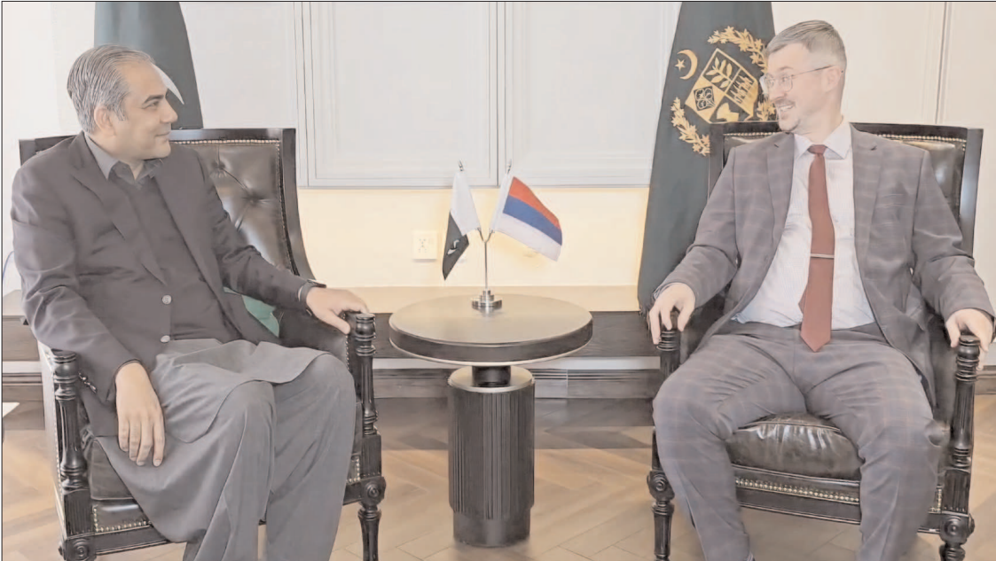
ISLAMABAD: Federal Minister for Interior Mohsin Naqvi in a meeting with Russian Ambassador Albert P. Khorev.

He also said that Israel demands the complete demilitarization of southern Syria, including the areas surrounding Suwaida, Daraa and Quneitra, and committed to "not tolerating any threat" to the Druze community. Demonstrators in Suwaida, a predominantly Druze city, rejected the statements on Tuesday and called on national actors to oppose the Israeli plan. — Arab News