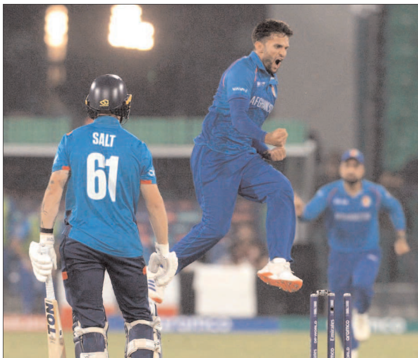
LAHORE: Afghanistan bowler Azmatullah celebrates the wicket of "Phil Salt" during the ICC Champions Trophy one-day international (ODI) cricket match between Afghanistan and England at the Gaddafi Stadium.

"They already look very strong, and they have got that obvious benefit of playing all their games there." However, England skipper Jos Buttler played down the controversy. "Not really," Buttler said after being asked if the schedule gave India an advantage. "I think it's a unique tournament already, isn't it, with being hosted here with one team playing in a different place but that's not something I'm sort of worried too much about at the moment."