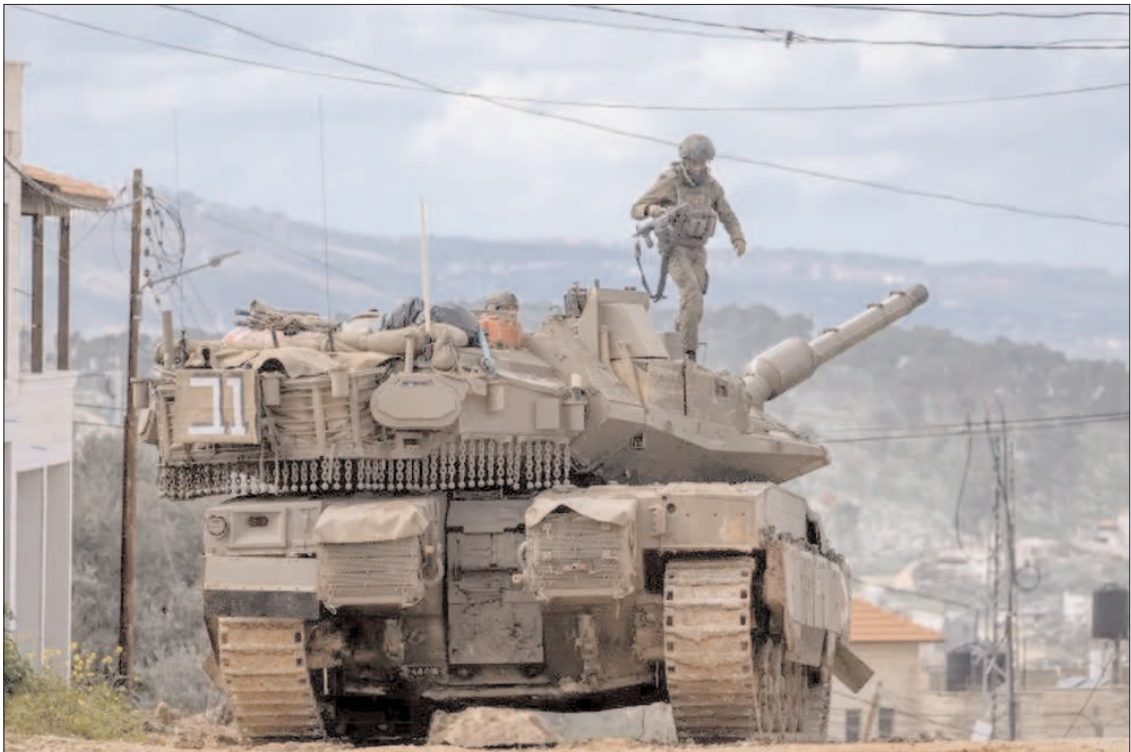
WEST BANK: Israeli tanks are deployed during an ongoing army operation in Jenin refugee camp.