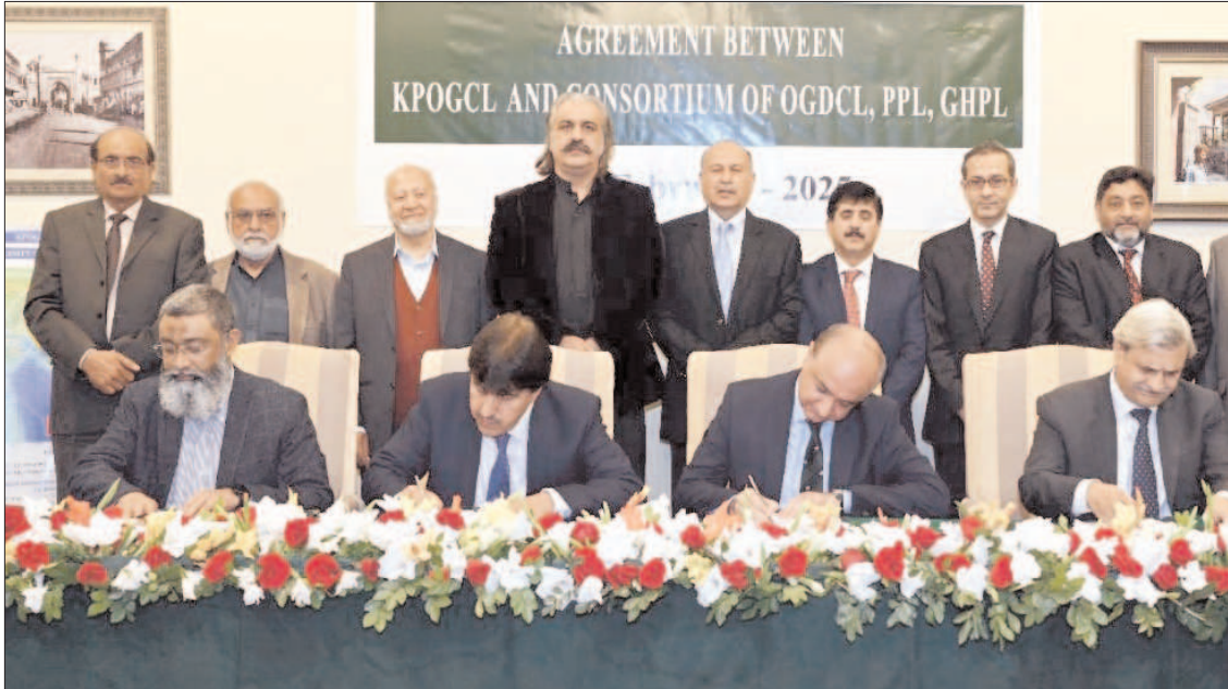
ISLAMABAD: Chief Minister of Khyber Pakhtunkhwa, Ali Amin Gandapur witnessing an agreement signing for exploration of oil and gas in Miran Block North Waziristan.