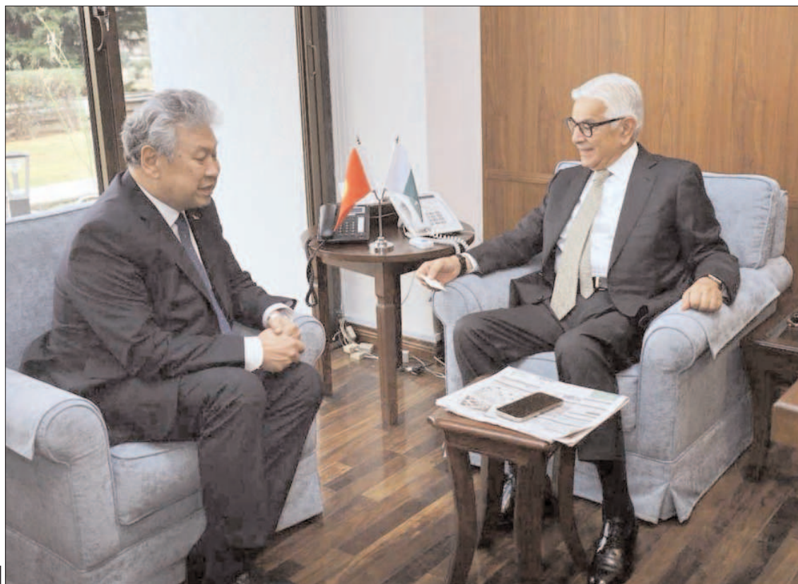
ISLAMABAD: Ambassador of the Kyrgyz Republic, Avazbek Atakhanov calls on Federal Minister for Defence and Defence Production Khawaja Muhammad Asif.

The Green Industrialization Policy Framework will serve as a blueprint for a sustainable industrial future, addressing both the environmental and economic needs of the country. As Pakistan seeks to become a global leader in green manufacturing, the emphasis on sustainability and the circular economy will pave the way for a cleaner, more efficient industrial sector that is both competitive and resilient.