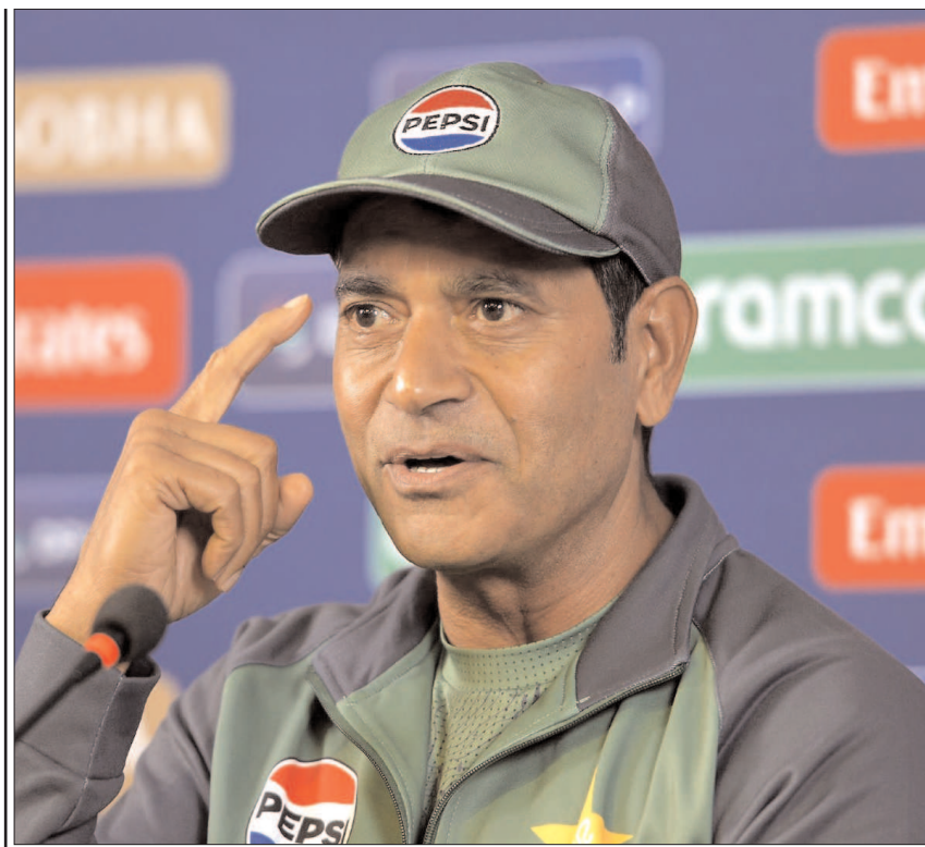
RAWALPINDI: Interim head coach and de facto chief selector Aaqib Javed speaking at a press conference at Rawalpindi Cricket Stadium.

"He has had the full support of Australian cricket and he can now move forward to the next phase of his international career with great confidence."