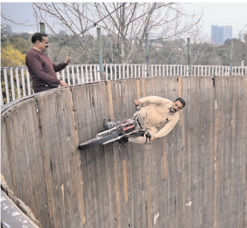
ISLAMABAD: A motorcyclist demonstrates his skills while riding a motorcycle in the 'Well of Death' at the Lucky Irani Circus in F-9 Park.

Ayaz Sadiq, in his concluding remarks, reaffirmed Pakistan's commitment to strengthening ties with Hungary and the broader European community, advocating for deeper collaboration in trade, education, and diplomacy.