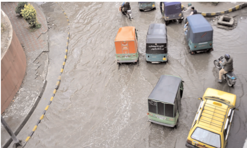
PESHAWAR: Traffic passing through accumulated rainwater at Bacha Khan Chowk.