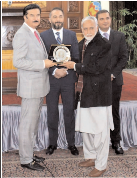
PESHAWAR: Country Manager Interlink Communications receiving "Award of Excellence" from Governor Khyber Pakhtunkhwa Faisal Karim Kundi at Governor's House.

The price of gold in the international market decreased by $29 to $2,887 from $2,916 whereas the prices of silver in international market remained stagnant at $31.79, the Association reported.