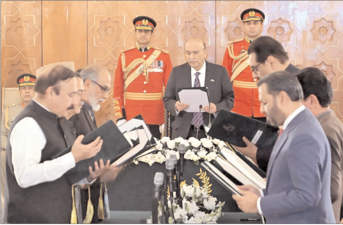
ISLAMABAD: President Asif Ali Zardari administering oath of office to Federal Ministers at Aiwan-e-Sadr.

Even so, several key leaders involved in the withdrawal are no longer serving in the military. The commander of US Central Command at the time of the withdrawal, Gen. Kenneth McKenzie, has since retired, and in 2024 took full ownership for the loss of US troops. Additionally, former Chairman of the Joint Chiefs of Staff, Gen. Mark Milley, said at the time that he believed the evacuation should have occurred sooner and that multiple factors contributed to failures in the withdrawal. Both McKenzie and Milley had also said they advised Biden to keep some US troops in Afghanistan after pulling most US forces.