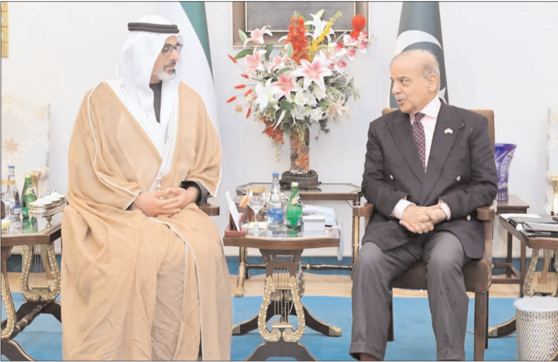
ISLAMABAD: Crown Prince of Abu Dhabi and Chairman Abu Dhabi Executive Council, Sheikh Khaled bin Mohammed bin Zayed Al Nahyan called on Prime Minister Shehbaz Sharif.

The national anthems of Pakistan and the United Arab Emirates were played as the guest stood at the salute dias along with Prime Minister Shehbaz. The smartly-turned out contingents of the armed forces presented a guard of honour which the crown prince reviewed.