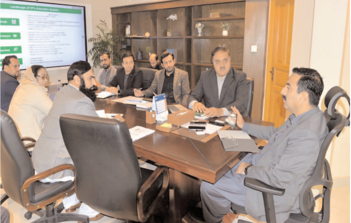
PESHAWAR: Chief Secretary Khyber Pakhtunkhwa chairing a comprehensive briefing on the Elementary and Secondary Education Department.