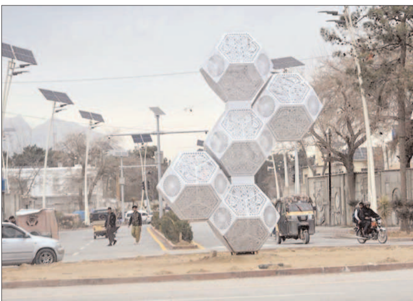
QUETTA: An attractive block structure installed by District administration for beautification of the city.

Following multiple sessions with the tenants and landowners, a final meeting was held on Wednesday, where a mutually agreeable solution was reached. Both tenants and landowners appreciated the efforts of the Grand Jirga. Moving forward, all Assistant Commissioners have been tasked with resolving similar chronic land issues through Jirgas.