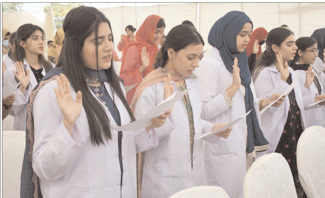
THATTA: Students of Liaquat Institute of Medical and Health Sciences taking oath during 'White Coat Day.'

Meanwhile, in all the districts of Kohat division including Kohat, Karak, Hangu, Orakzai and Kurram, the plantation and transplanting campaign is in the full swing under the supervision of their respective deputy commissioners.