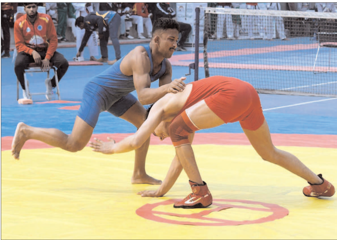
LAHORE: Players in action during 'Khelta Punjab' Inter-Division Games 2025 at Punjab Stadium.

LONDON (Agencies): Arsenal rubbed salt into Manchester City's wounds after a miserable week with victory in a frantic Women's Super League meeting at Joie Stadium. It is a boost to Arsenal's hopes of securing a top-three spot and qualification for next season's Women's Champions League. Stina Blackstenius' late winner capped off the seven-goal thriller after City had battled to get themselves back into the game. During a week when England international Chloe Kelly's loan move to Arsenal ended a turbulent transfer saga, this result sees City drop to fourth in the table. Arsenal had taken a stunning 2-0 lead within eight minutes when Mariona Caldentey and Lotte Wubbren-Moy punished City's weak defending. Mary Fowler got one back for City before half-time and former Arsenal striker Vivianne Miedema drew them level minutes into the second half.