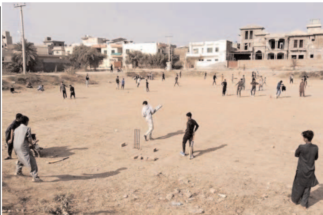
SARGODHA: Youngsters are playing cricket in the local ground at Qasim Park.