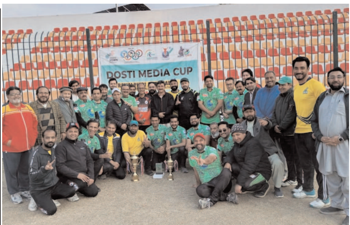
PESHAWAR: Sports journalists posing for photographers after friendly match between KP Sports Writer Association and Rawalpindi Islamabad Sports Journalists.