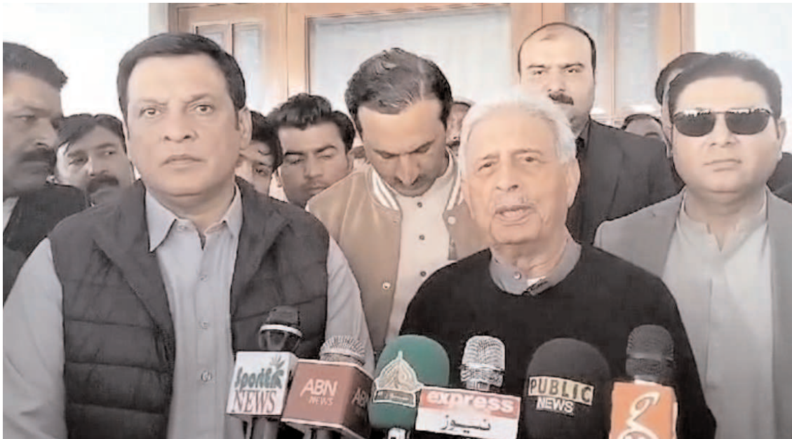
SHEIKHUPURA: Federal Minister for Industries and Production Rana Tanveer Hussain talking to media.