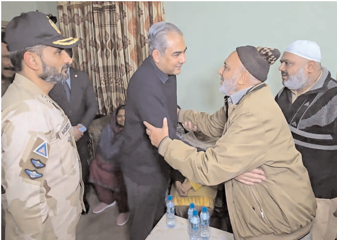
LAHORE: Federal Minister for Interior and Narcotics control Mohsin Naqvi meeting the innocent family who were detained in Saudi Arabia upon their release.

According to the data 1138 motorbikes, 70 autorickshaws, 126 motorcars, 34 vans, 19 passenger buses, 41 truck and 103 other types of auto vehicles and slow-moving carts were involved in these road traffic accidents.