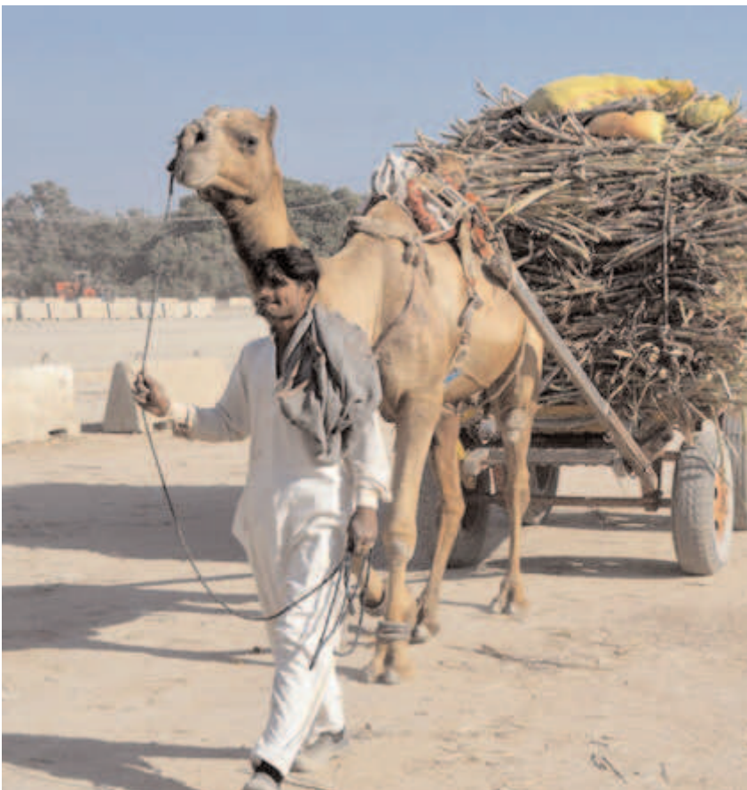
HYDERABAD: A camel cart holder on the way loaded with sugarcane to deliver sugar factory near Matari.

The company has vowed to continue these efforts to combat gas theft and illegal activities, ensuring uninterrupted gas supply to consumers.