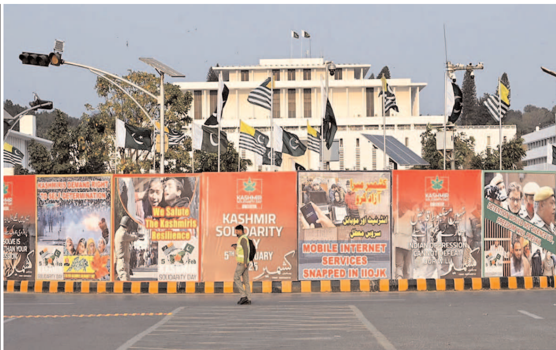
ISLAMABAD: Banners displayed at Front of Parliament House in connection with 5th February Kashmir Solidarity day.

Civil society members, however, emphasized the need for a comprehensive plan to ensure the success of the initiative, including the establishment of a reliable charging infrastructure and the training of drivers.