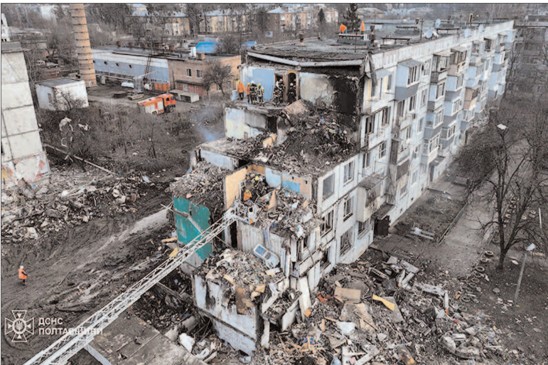
POTLAVA: This handout photograph taken and released by the Ukrainian State Emergency Service on February 2 shows rescuers working at a damaged residential building a day after a missile strike in Potlava.

Dozens of homes and roads have been destroyed by Israeli forces in the latest campaign. The Palestinian state news agency also said that a 27 year-old man had been killed on Sunday by Israeli forces raiding a refugee camp near Hebron.