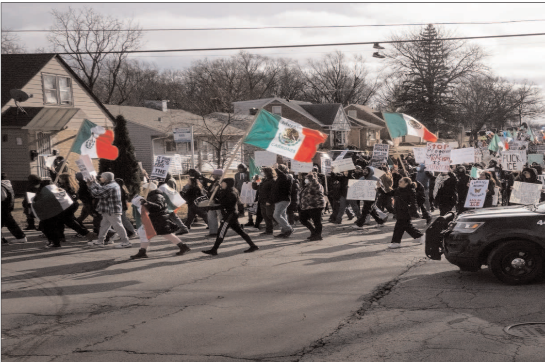
WAUKEGAN, ILLINOIS: Activists march through a neighborhood protesting a recent increase of activity in the area by Immigration and Customs Enforcement (ICE) agents.

Benjamin Netanyahu's office said he would begin negotiations on phase two of the agreement on Monday in Washington, when he is set to meet U.S. President Donald Trump's Middle East Envoy, Steve Witkoff. During his meeting with Witkoff, Netanyahu will discuss Israel's positions in respect to the ceasefire, the prime minister's office said. Witkoff will then speak with officials from Egypt and Qatar, who have mediated between Israel and Hamas over the past 15 months with backing from Washington.