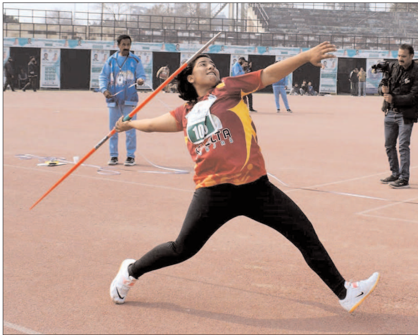
LAHORE: Player in action during 'Khelta Punjab' Inter-Division Games 2025 at Punjab Stadium.

"The guy you've been fighting in your last fight, he ain't all that. Trust me, I'm coming baby. It's still marinating, but when I do fight him, I'm going to teach him a lesson."