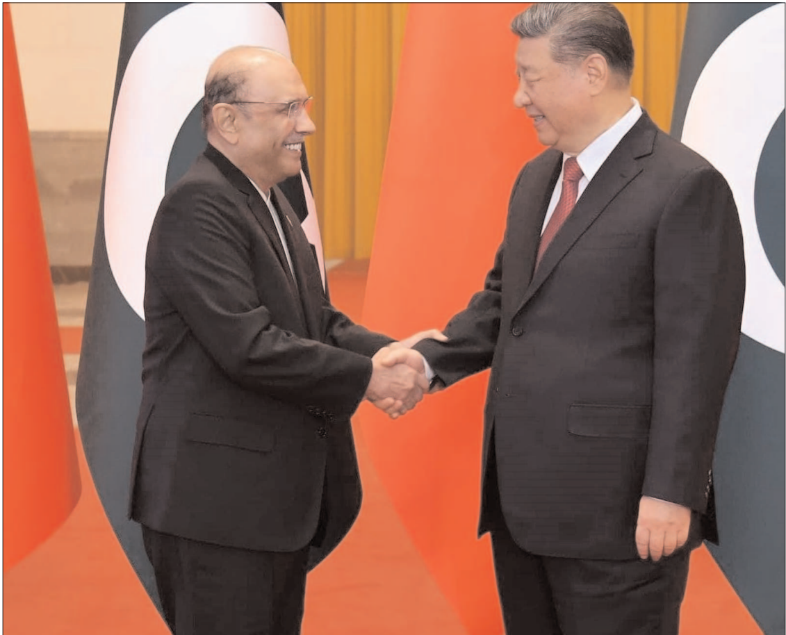
BEIJING: President Asif Ali Zardari on Wednesday met with his Chinese counterpart Xi Jinping during his visit to China.

Nawaz condoles LAHORE (APP): PML-N President Mian Muhammad Nawaz Sharif on Wednesday expressed deep sense of grief and sorrow over the sad demise of Prince Karim Aga Khan, the spiritual leader of Ismaili community. In his condolence message issued here, he said that services of Prince Karim Aga Khan for promotion of education, health and culture would be remembered.