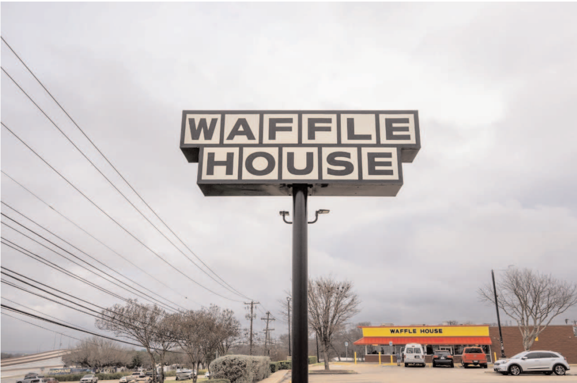
AUSTIN, TEXAS: A Waffle House sign is displayed outside of the storefront in Austin, Texas. Waffle House has announced that it will be adding a 50-cent surcharge to all egg products because of soaring egg prices caused by the bird flu. The average price for a dozen eggs in the U.S. has increased approximately 50% in the last year.