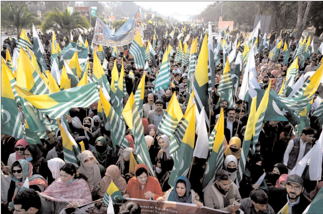
ISLAMABAD: A large number of women participating in Kashmir Solidarity walk at D Chowk to show solidarity with the people of Jammu and Kashmir against the occupation of India and facing atrocity in IOJK.

The chairperson appealed to the world leaders to uphold international human rights obligations and help implement the relevant UN Security Council Resolutions on Kashmir to find lasting and durable solution to the conflict.