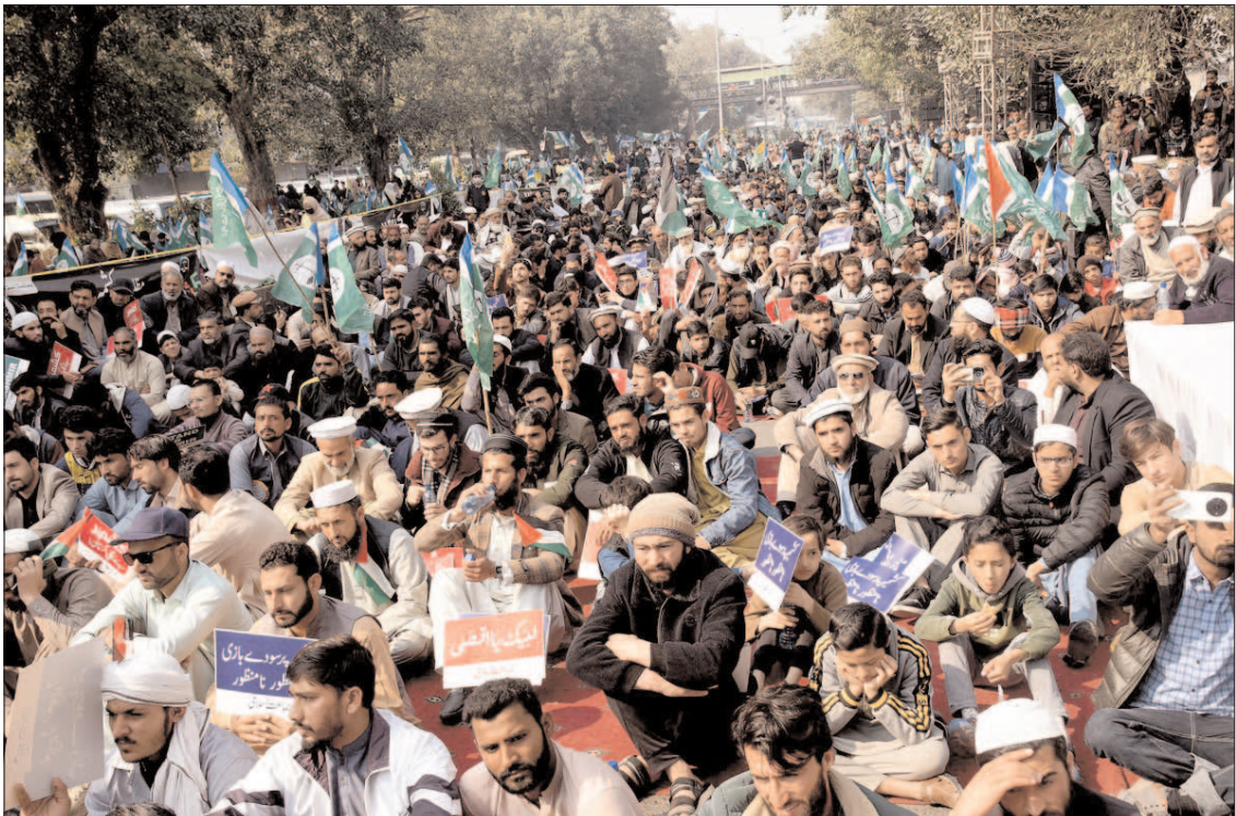
LAHORE: Jamaat-e-Islami workers participate in 'Kashmir Solidarity Day walk at Mall Road.