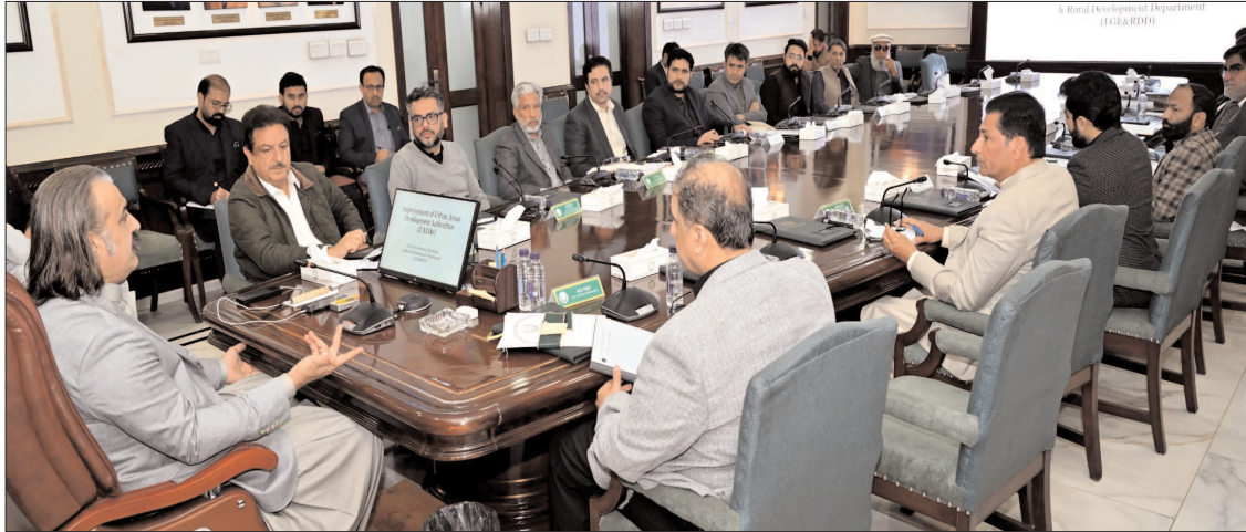
PESHAWAR: Khyber Pakhtunkhwa Chief Minister Ali Amin Khan Gandapur chairing a meeting regarding improvement of Urban Areas Development Authority.

"The provincial government is committed to strengthening and stabilizing these institutions", he added.