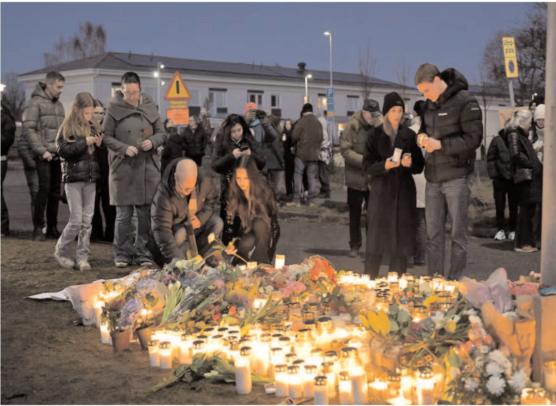
OREBRO: Mourners gather to place flowers and candles outside Risbergkska School in Orebro the day after the school shooting in which over 10 people lost their lives, in Sweden.

Ten people were killed in seven incidents of deadly violence at schools between 2010 and 2022, according to the Swedish National Council for Crime Prevention.