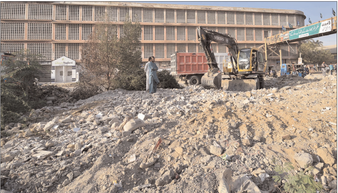
KARACHI: Work in progress on the footpath of New MA Jinnah Road.