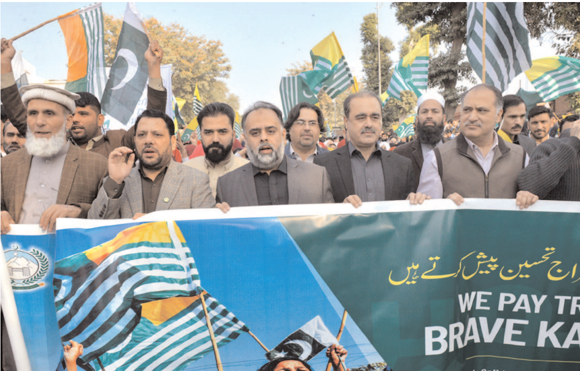
PESHAWAR: Kashmir Solidarity Rally is passing through Sahibzada Abdul Qayyum Road.

The Governor reaffirmed that Pakistan would continue moral, political and diplomatic support for oppressed Kashmiris until they achieve freedom from Indian yoke. Despite political differences, he said that all Pakistanis are united on the Kashmir issue. He expressed confidence that the days of oppression at the held Kashmir would soon end.