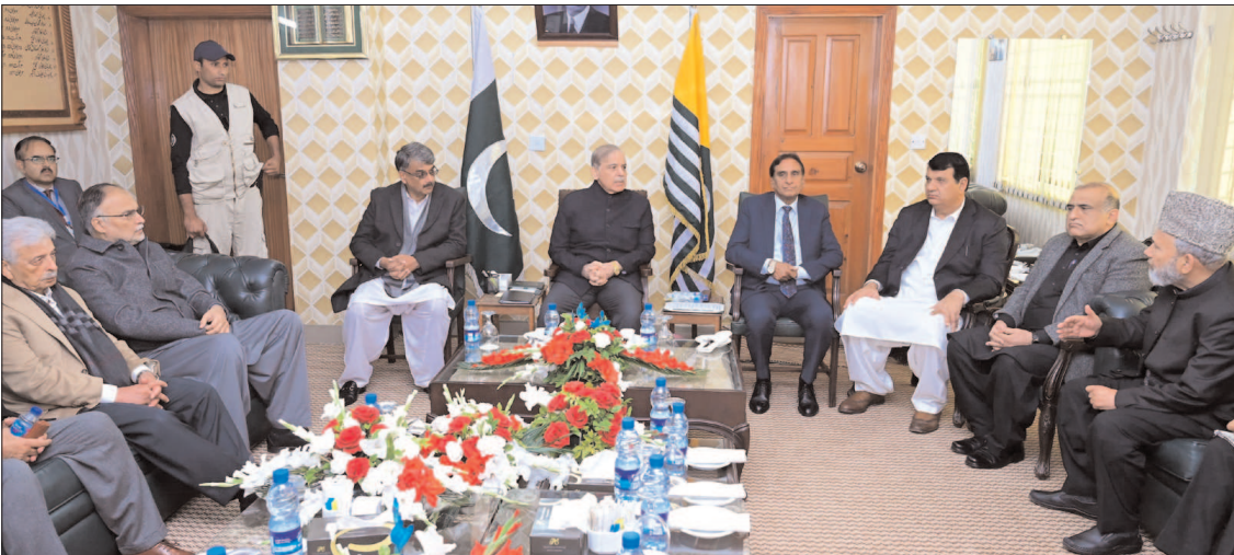
MUZAFFARABAD: Prime Minister Muhammad Shehbaz Sharif talking to a delegation of the All Parties Hurriyat Conference.

leader and as a special friend of Pakistan. The meeting was followed by an MoU signing ceremony where the two leaders witnessed the signing of MoUs to enhance cooperation in the fields of science & technology, media, clean energy and socio-economic development, among others. Earlier, President Asif Ali Zardari was warmly welcomed by President Xi and presented with the guard of honour upon his arrival. A group of children also extended a warm welcome and offered a heartfelt reception to the President. After the ceremony, President Xi Jinping hosted a state banquet in honour of President Asif Ali Zardari and his accompanying delegation.