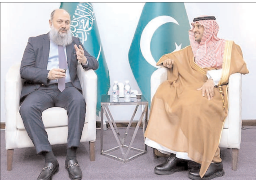
JEDDAH: Federal Minister for Commerce, Jam Kamal Khan, meeting with Deputy Governor of General Authority of Foreign Trade, Abdul Aziz Alsakran.

The letter has also stated that the internment centers are a violation of basic human rights, and the PTI itself has become a victim of this law after the events of May 9. Therefore, the provincial government should withdraw the appeal filed in the Supreme Court.