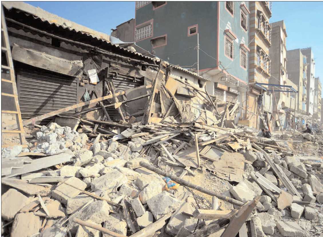
KARACHI: A view of destroyed Hijrat Colony after removing of encroachments.