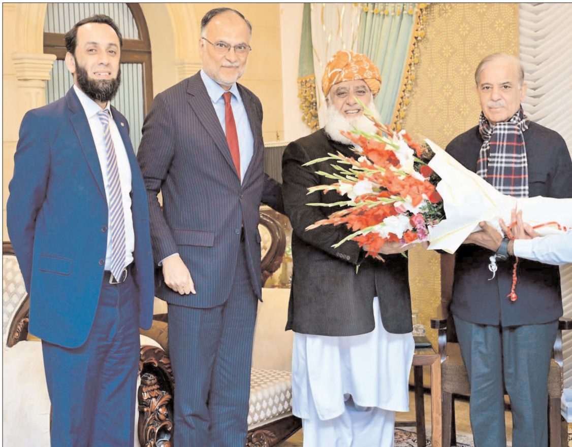
ISLAMABAD: Prime Minister Shehbaz Sharif meets with JUI-F Chief, Maulana Fazlur Rehman.

He also expressed gratitude to international organizations for their support in various welfare projects and emphasized the need for continued cooperation in implementing green initiatives like the Billion Tree Plus project. The Chief Minister concluded by stating that climate change is not just a challenge for Pakistan but for the entire world, and collective efforts are needed to address it. "InshaAllah, together we will successfully transform Khyber Pakhtunkhwa into a truly Green Khyber Pakhtunkhwa," he affirmed.