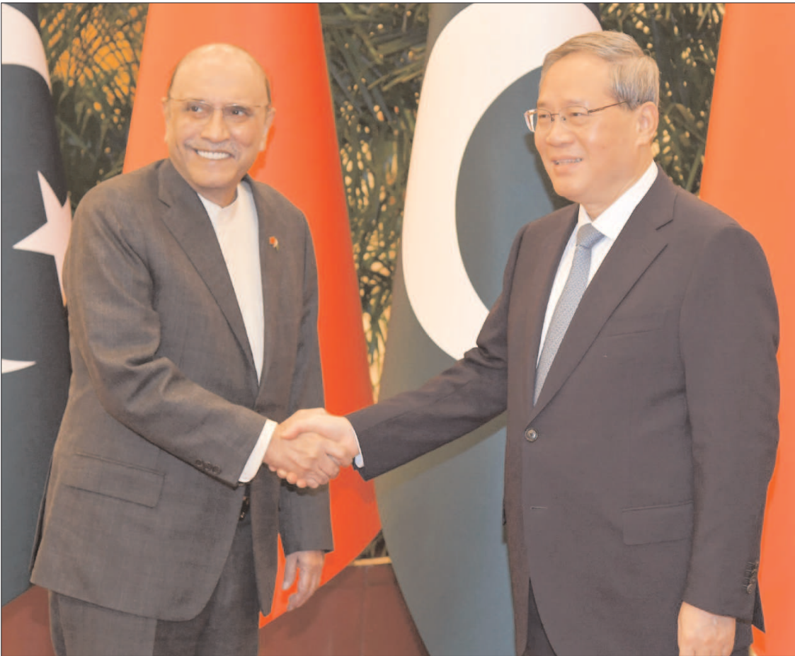
BEIJING: President Asif Ali Zardari meeting Premier of China, Li Qiang, at Great Hall of the People.

The Chinese side gladly noted Pakistan's National Economic Transformation Plan (Uraan), applauding the new achievements attained by Pakistan in economic reform and national development and wished Pakistan stability, security, development and prosperity.