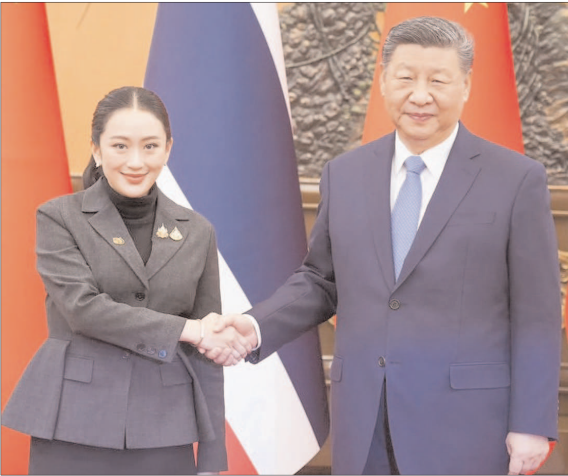
BEIJING: Chinese President Xi Jinping shaking hands with Thailand's Prime Minister Paetongtarn Shinawatra.