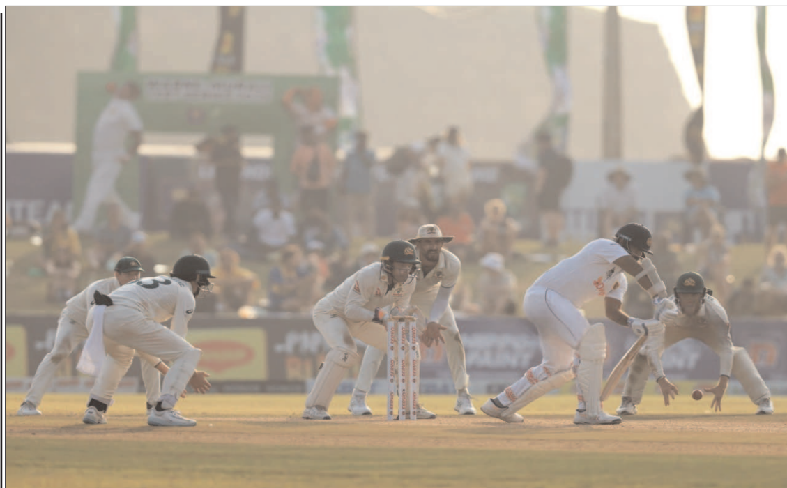
GALLE, SRI LANKA: Lahiru Kumara of Sri Lanka bats during day one of the Second Test match in the series between Sri Lanka and Australia at Galle International Stadium on Thursday.

The meeting was attended by MNAs Anjum Aqeel Khan, Sheikh Aftab Ahmed, Sardar Muhammad Yaqoob Khan Nasar, Ms. Shaista Khan, Haji Rasool Bux Chandio, Syeda Shehla Raza, Dr. Mahreen Razzaq Bhutto, Muhammad Iqbal Khan, Khawaja Izhar-Ul-Hassan, Muhammad Miqdad Ali Khan, Jamshed Ahmed, and Syed Sami Ullah. The Additional Secretary IPC, representatives from NHA, KP & Punjab and other officers and official also attended the meeting.