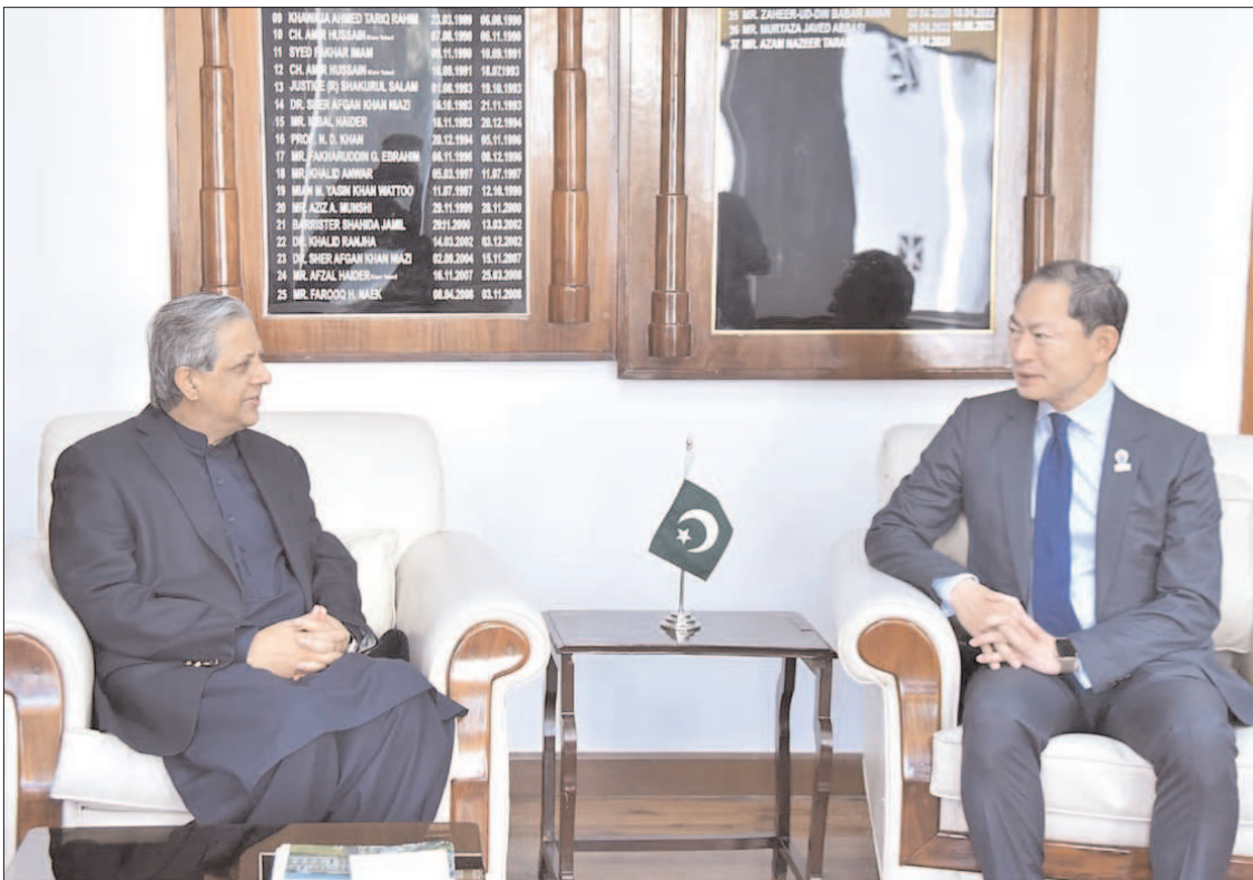
ISLAMABAD: Ambassador AKAMATSU Shuichi pays a courtesy call on Federal Minister for Law and Justice Senator Azam Nazeer Tarar.

However, admissions for Matric, FA, Associate Degree, and B.Ed programs could also be obtained through the manual process. The admission forms for these programs were available at the university's regional offices across the country. Prospective students were advised to complete their enrollment within the specified deadlines to avoid late fees. They could also seek assistance in the admission process from the regional offices, where facilitation centers had been established to guide and support them.