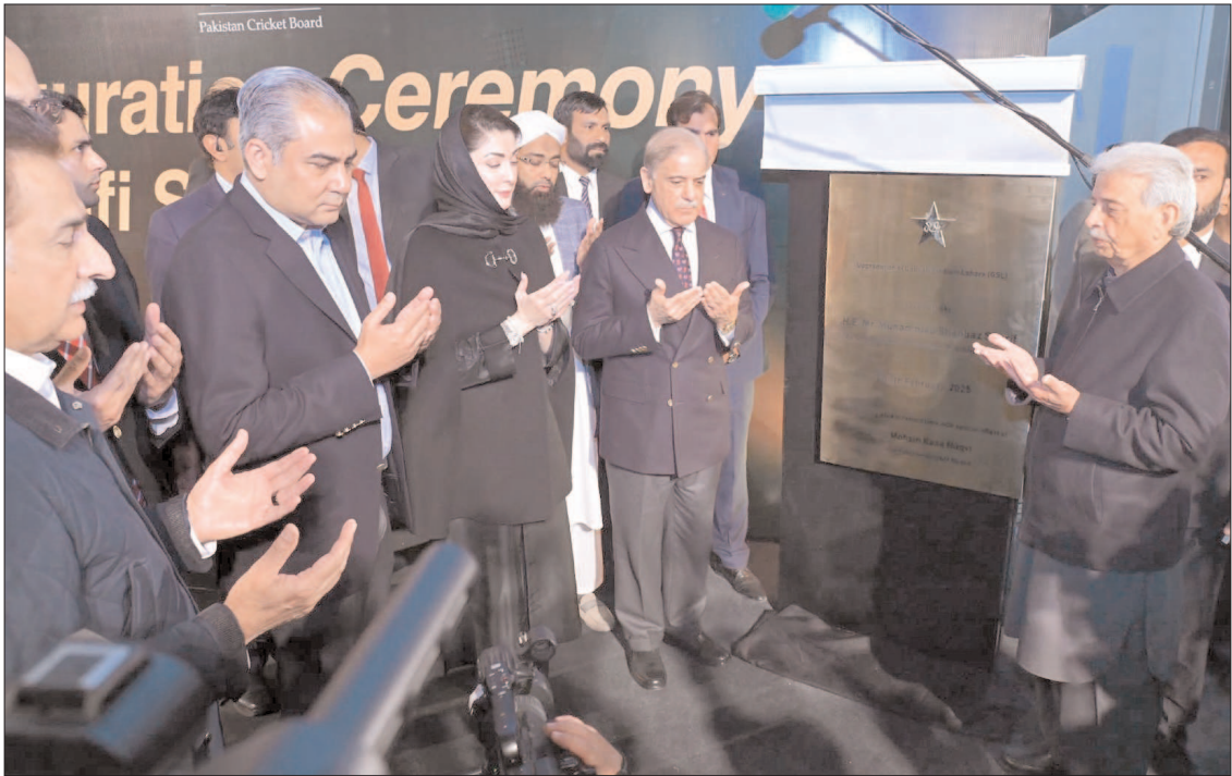
LAHORE: Prime Minister Shehbaz Sharif inaugurating renovated and refurbished Qaddafi Stadium.