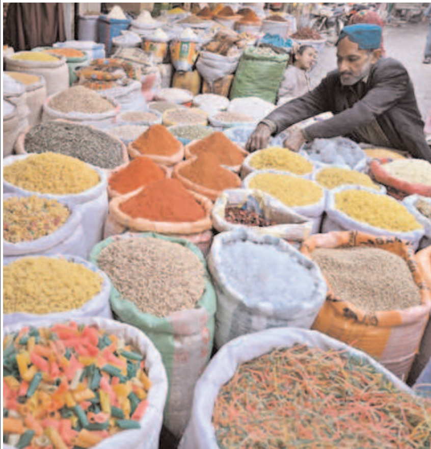
LARKANA: A vendor displays aromatic spices with rich colors and grocery essentials at his shop in Royal Bazaar.

The commodities which recorded an increase in their average prices on year-on-year basis included, ladies sandal (75.09%), pulse moong (31.08%), pulse gram (30.36%), powdered milk (25.80%), potatoes (23.42%), beef (22.35%), vegetable ghee 1 kg (17.15%), garlic (16.30%), gas charges for q1 (15.52%), vegetable ghee 2.5 kg (14.84%), shirting (14.11%), and firewood (13.07%).