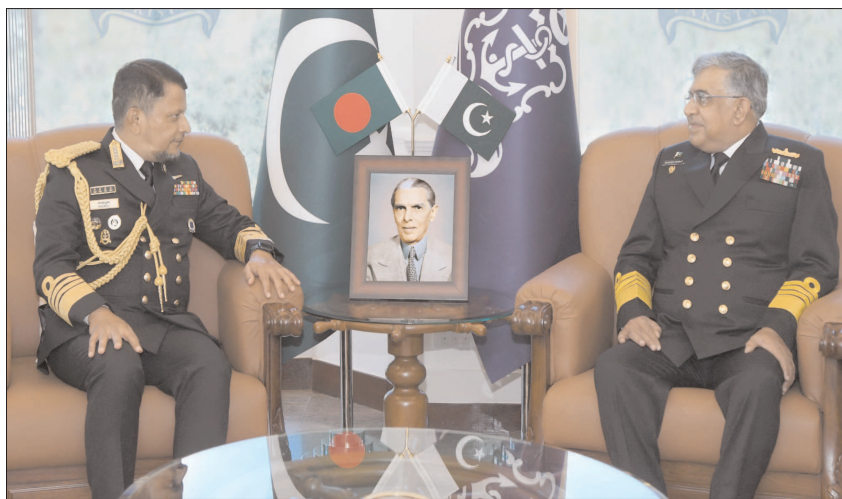
ISLAMABAD: Chief of the Naval Staff of Bangladesh, Admiral Mohammad Nazmul Hassan, called on Chief of the Naval Staff of Pakistan, Admiral Naveed Ashraf, at Naval Headquarters.