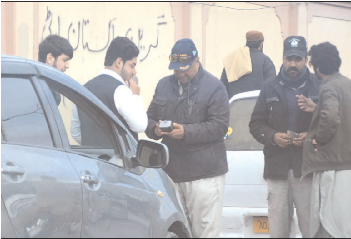
QUETTA: Traffic police official issuing challan ticket after violation at road.