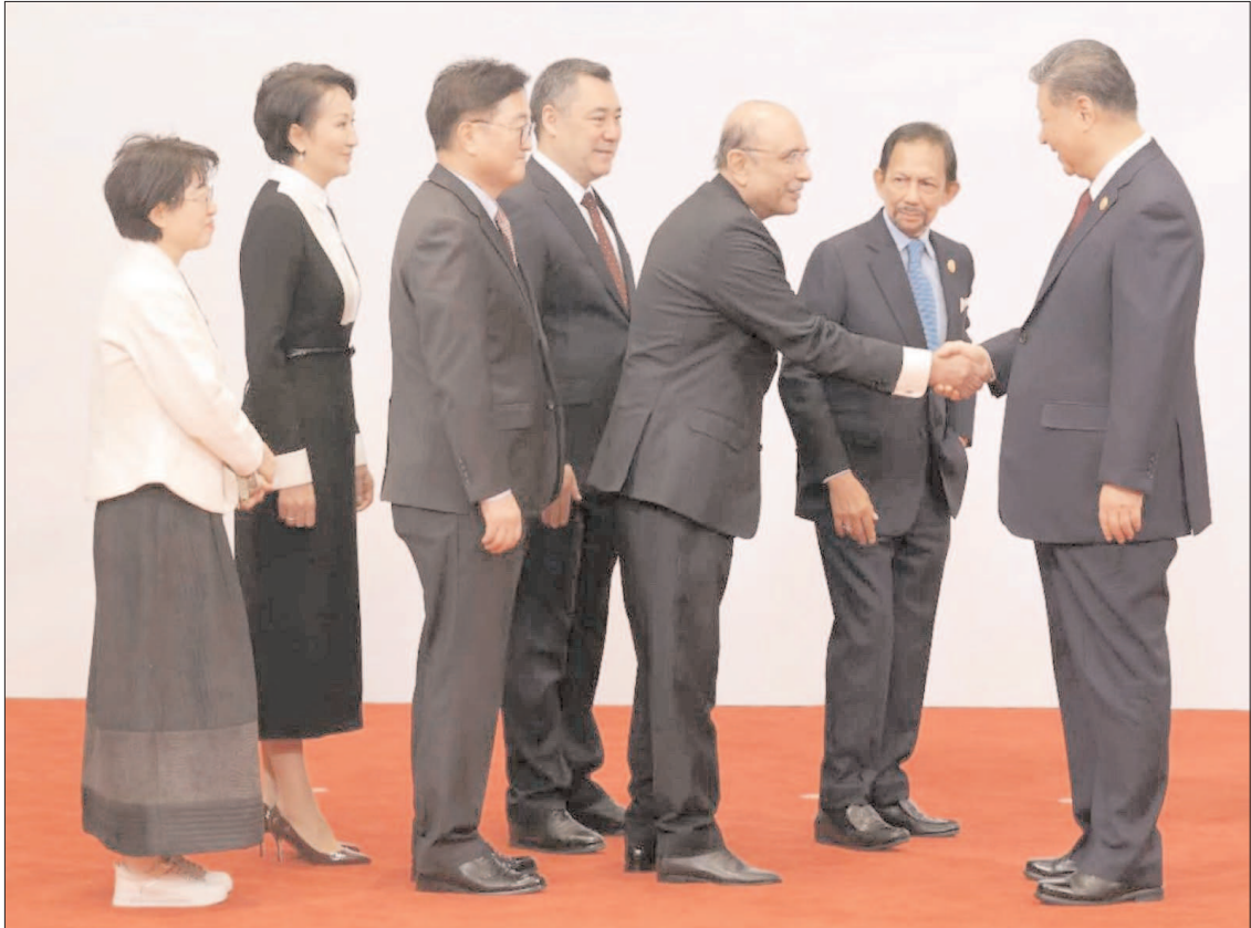
HARBIN: Chinese President Xi Jing Ping welcoming President Asif Ali Zardari, along with others heads of states / governments upon their arrival, at state banquet before opening ceremony of 9th Asian Winter Games 2025.