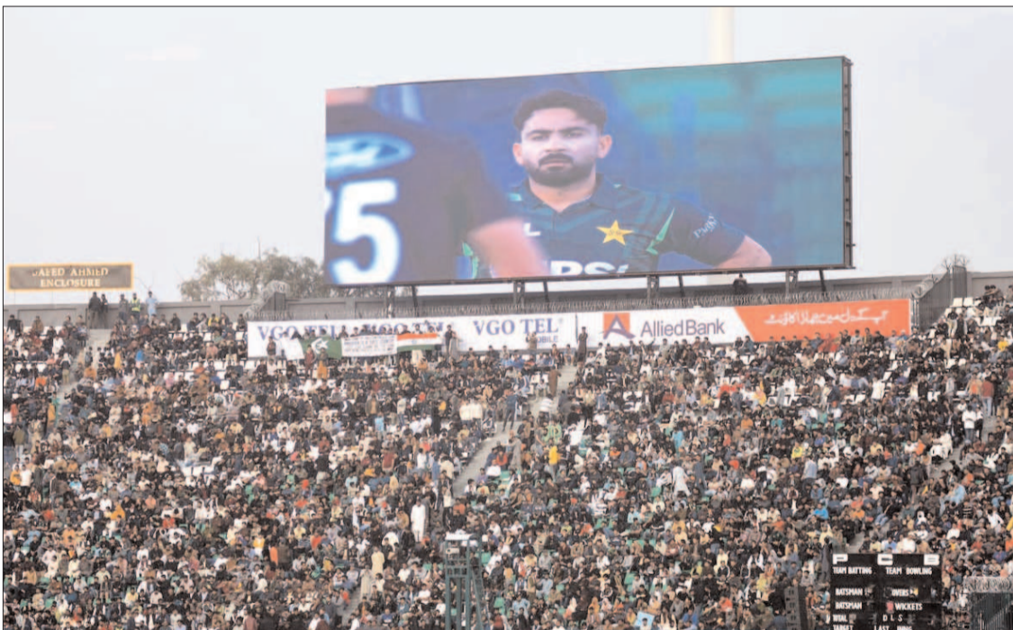
LAHORE: Spectators enjoy while watching first match of the Tri-Nation Series played between Pakistan and New Zealand cricket teams at Gaddafi Stadium.

Pakistan will play their second match against South Africa in National Bank stadium, Karachi on February 12 (Wednesday) and they must win to keep their hopes alive of playing the tri-nation final of February 14 (Friday).