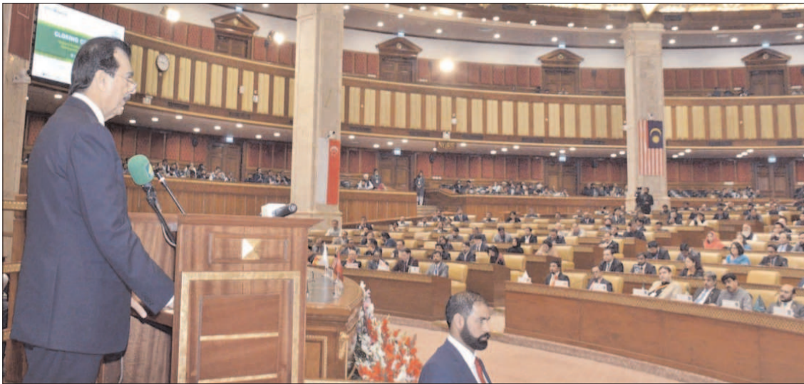
LAHORE: Acting President of the Islamic Republic of Pakistan, Syed Yousaf Raza Gilani addressing at the closing ceremony of 1st Joint CPA Asia & South-East Asia Regional Conference.