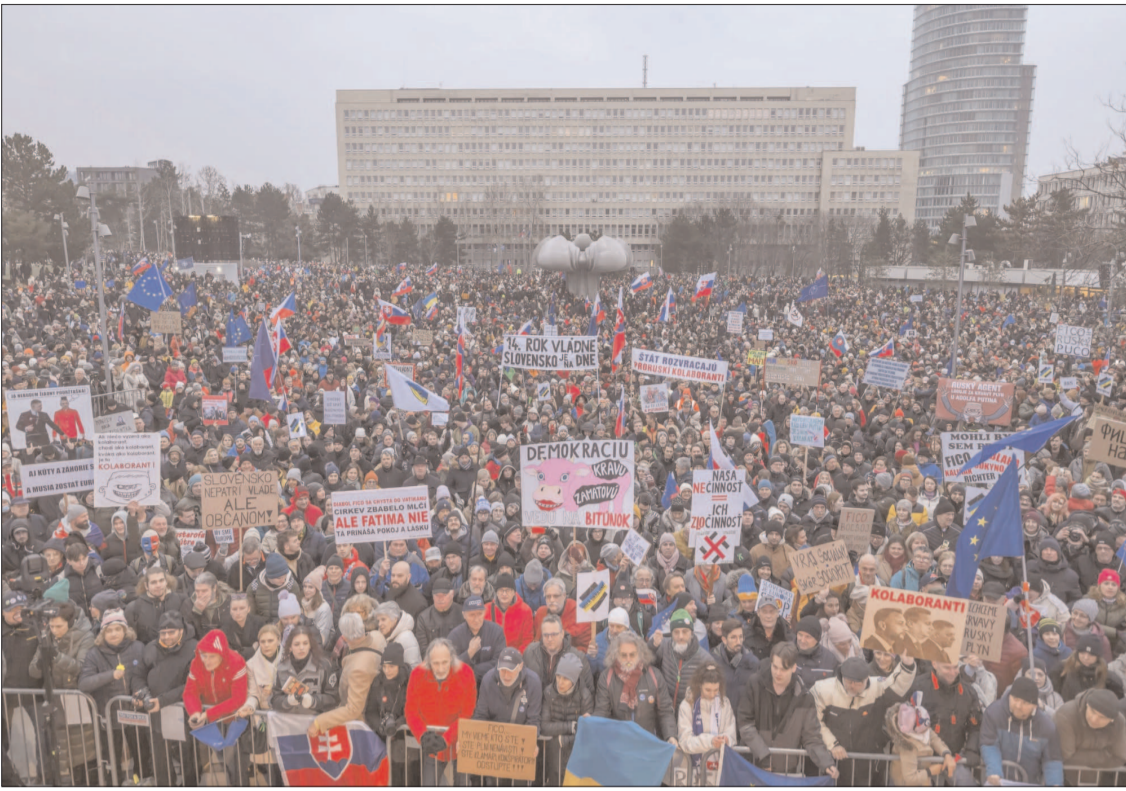
BRATISLAVA: People of Slovakia gathered to oppose policies of populist Prime Minister Robert Fico.

MOSCOW (Reuters): The Russian Foreign Ministry said that the United States needed to formulate its policy on ending the conflict in Ukraine and that Moscow could then base its own position on specific US action. US President Donald Trump and Russian President Vladimir Putin have not spoken by phone since Trump’s inauguration, according to public statements from officials on both sides. Russia’s RIA state news agency quoted a senior lawmaker as saying that preparations for a meeting between Putin and Trump were at an “advanced stage” however. Russian Foreign Ministry spokeswoman Maria Zakharova said separately that Moscow had heard many words and statements from Washington on Ukraine, but that for now there was no clarity on what exactly the US envisaged when it came to trying to strike a deal to end the conflict there. “As for the role or possible role of the United States in resolving the crisis around Ukraine, once again: everything will depend on concrete actions and on the plans of the new administration embodied in those actions,” Zakharova told a news briefing in Moscow.