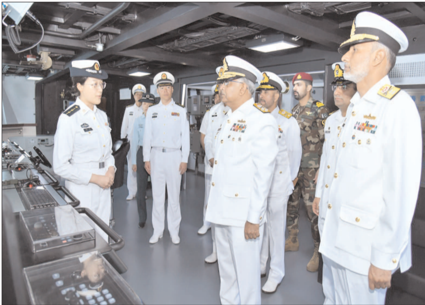
KARACHI: Chief of Naval Staff Admiral Naveed Ashraf during his visit to PLA (N) Gaoyouhu Ship in 9th Multinational Maritime Exercise Aman-25.

The AMAN Exercise demonstrates Pakistan's commitment to peace, reinforce regional maritime security and enhance interoperability between regional and extra regional navies. The Naval Chief further expressed that cooperation and partnership generated through AMAN will grow in future and shall bring us closer to the mutual goal of peace and prosperity. He appreciated their participation in AMAN Exercise to fulfill the common resolve of "Together for Peace".