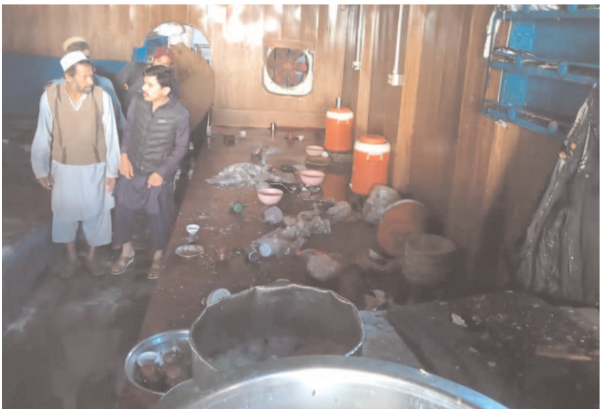
PESHAWAR: Peoples standing in a hotel after cylinder blast near Khyber Teaching Hospital.

The petitioners requested the court to restrain the respondents from collecting the increased toll tax until a final decision is made on the petition. They also requested the court to declare the increase in toll tax as unconstitutional and against public interest.