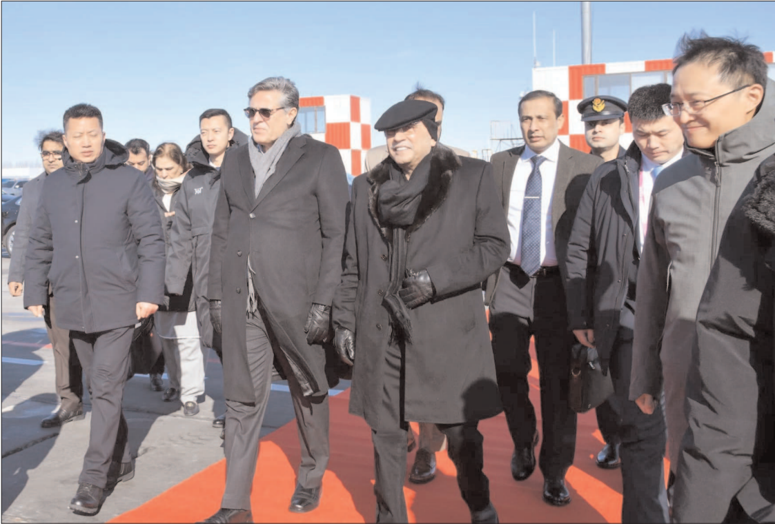
HARBIN: President Asif Ali Zardari departing for Pakistan after completing his 5-day visit to China.

The federal minister said that they were trying to eliminate terrorists and the war would continue until terrorism is eradicated from its root and our youths are making sacrifices in the war. He said that the language of the PTI is neither political nor are these people political. "Their leader is a mentally ill person who puts his hand in the pocket of every person sitting next to him," he claimed.