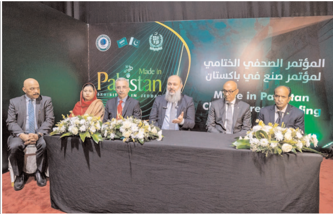
JEDDAH: Federal Minister Jam Kamal Khan taking to media on strengthening Pakistan-Saudi trade ties after ‘Made in Pakistan’ Exhibition.

About NexGen Auto: NexGen Auto is a newly established company in Pakistan’s automotive sector. Dedicated to delivering premium vehicles and exceptional after-sales services, NexGen Auto is committed to innovation and aims to make a significant impact on the nation’s automotive industry.