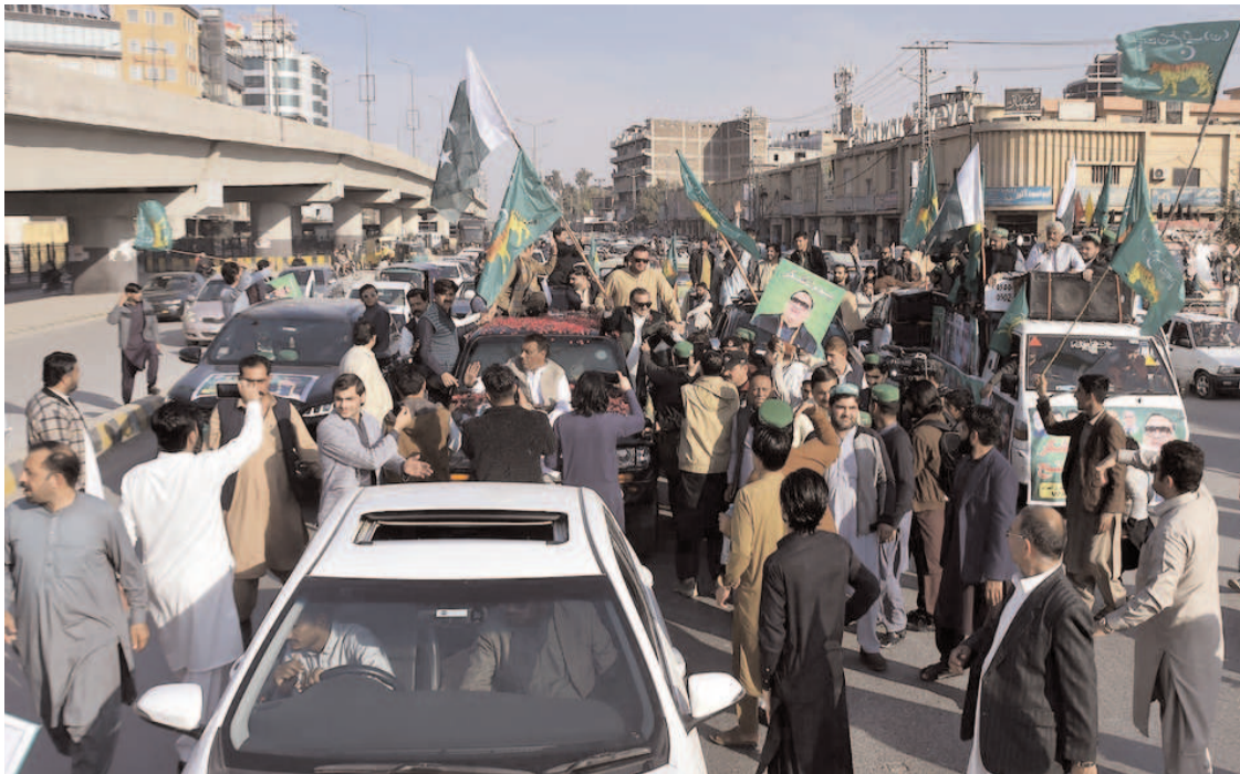
PESHAWAR: Workers of Pakistan Muslim League hold Youm-e-Tashakur at Qila Bala Hisar.

World Cancer Day at KTH served as a reminder of the ongoing battle against cancer and the need for continued support, research, and policy reforms to enhance patient care in the region.