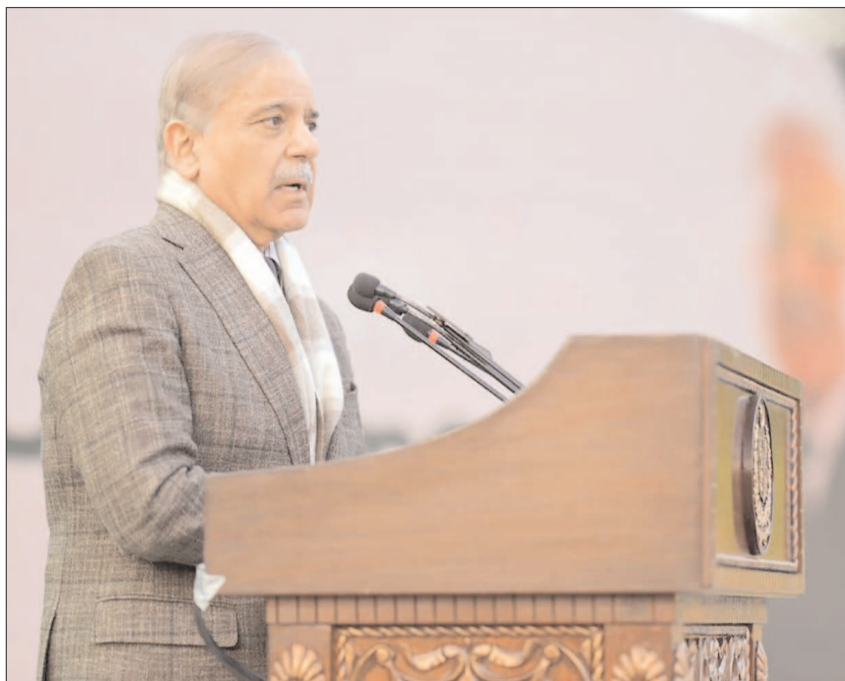
ISLAMABAD: Prime Minister Shehbaz Sharif addressing a ceremony organized in connection with Youm-e-Tameer-o-Taraqqi.