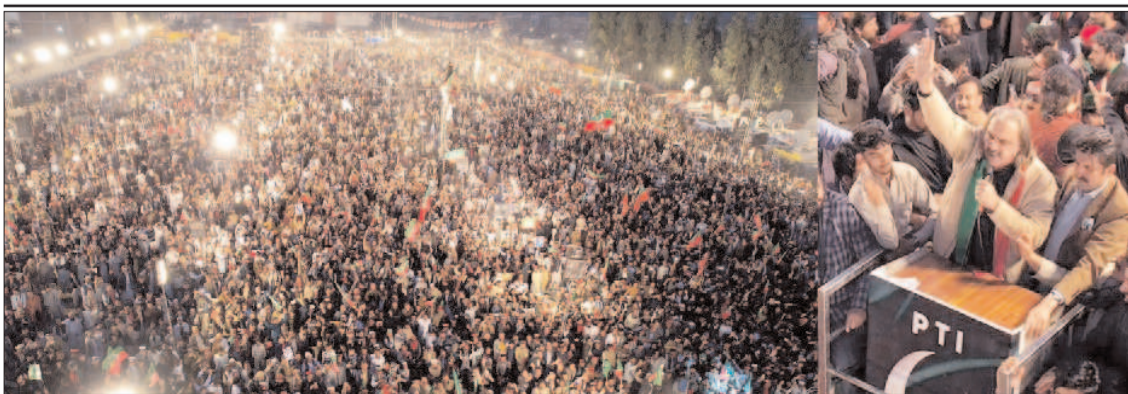
SWABI: Chief Minister of Khyber Pakhtunkhwa, Ali Amin Gandapur addressing PTI public gathering.