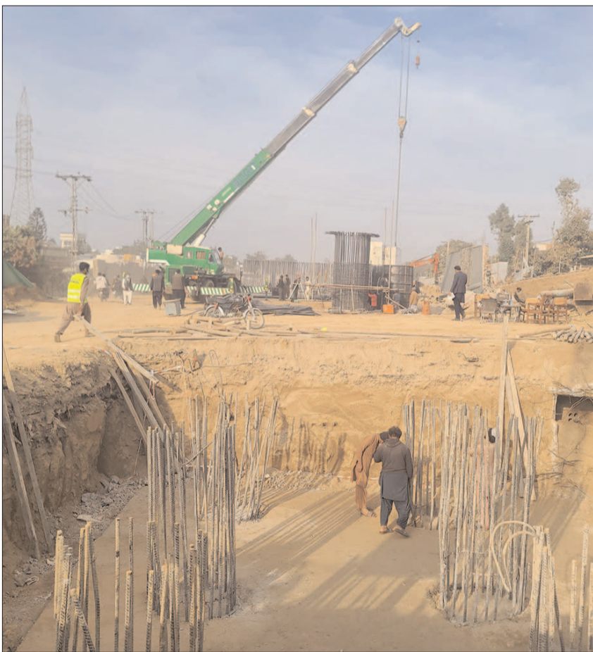
RAWALPINDI: A view of ongoing work of Flyover at Adyala road.

The kite flying is a dangerous game and a crime. After the amendment in the law, kite flying is a non-bailable crime, which could be punished with imprisonment from 03 to 07 years and a fine of Rs 500,000 to 5 million. Rawalpindi District Police on the directives of the CPO are utilizing all available resources to prevent kite flying, he said adding, the civil society, citizens especially parents should discourage kite flying.