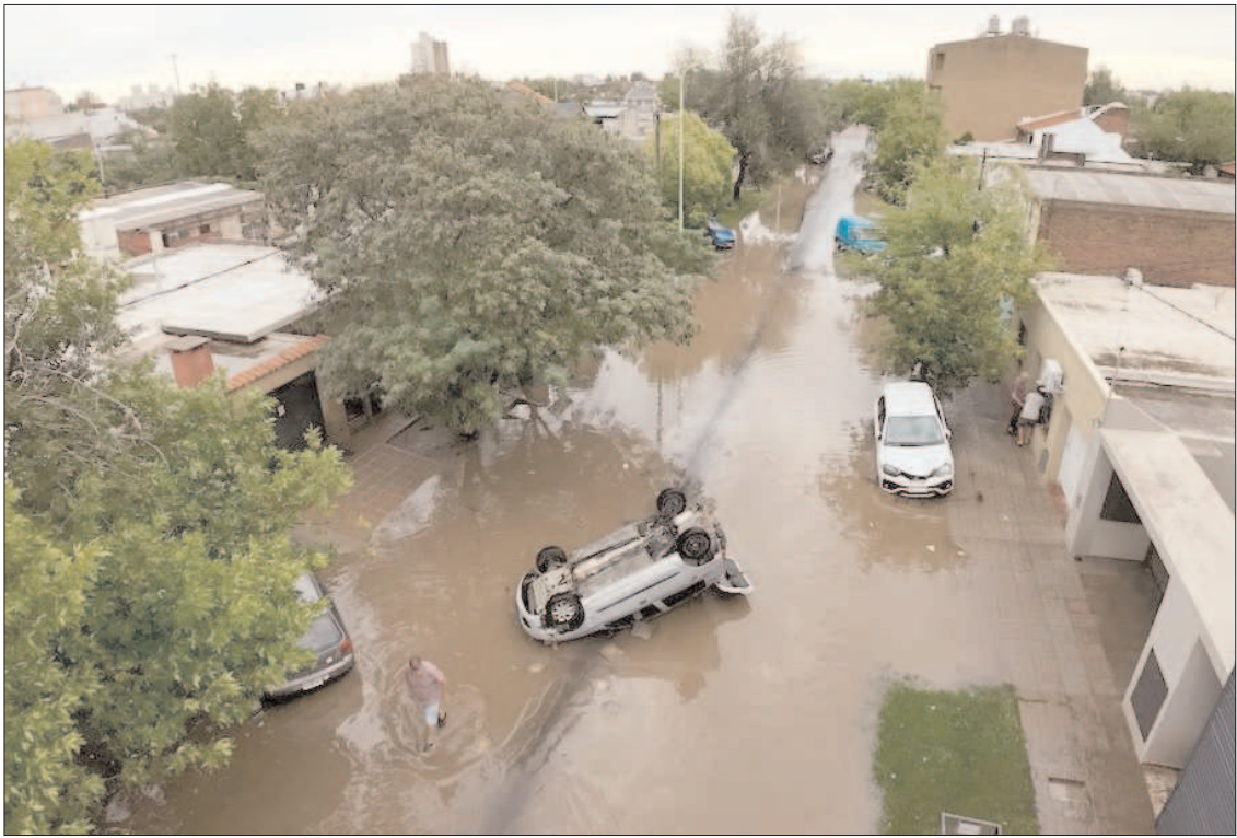
BUENOS AIRES: A flipped vehicle sits in flood waters after a storm in Bahia Blanca, Argentina.