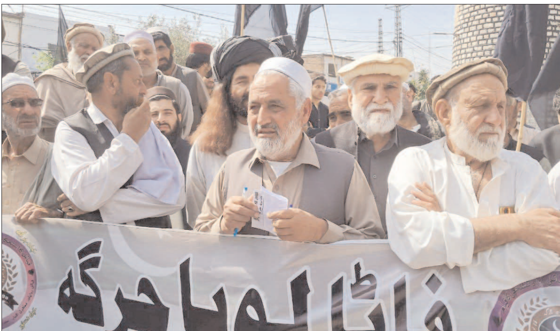
JAMRUD: Activists of FATA Loya Jirga holding a rally for acceptance of their demands.