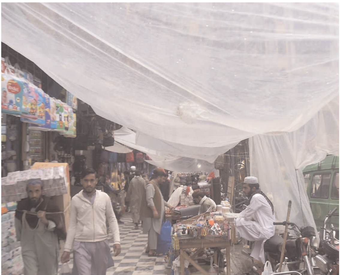
PESHAWAR: Shopkeepers covered their stalls with plastic sheet during rain to keep the items safe.

residents and visitors from other districts and even overseas Pakistanis, who often place orders for frozen siri paye to take home when traveling abroad. The popularity of siri paye is not limited to Peshawar's residents. International food bloggers, like Thai vlogger Mark Wiens, who visited in 2018, have praised the dish, calling it one of the best things they have tasted in Pakistan. Alongside siri paye, the iftar parties also bring an increased demand for other food delights in Peshawar. The streets are filled with food stalls offering Chapli Kebab, rice beef polao and grilled fish with green tea, contributing to the city's vibrant food culture. Temporary stalls selling these hot favorites have sprung up across the city, catering to the growing demand for these warming dishes during Iftar. The eateries at Fawara Chowk, Qissa Khwani and Namak Mandi are especially crowded, with food lovers gathering from Iftar into late night, enjoying qehwa (traditional tea). In a city where food and tradition are closely intertwined, Ramadan's iftar parties bring both a rich culinary experience and a thriving business for local food vendors. Despite the challenges posed by inflation in KP, siri paye remains a symbol of Peshawar's enduring food legacy—its irresistible flavors drawing people from all walks of life to experience the essence of the city's hospitality.