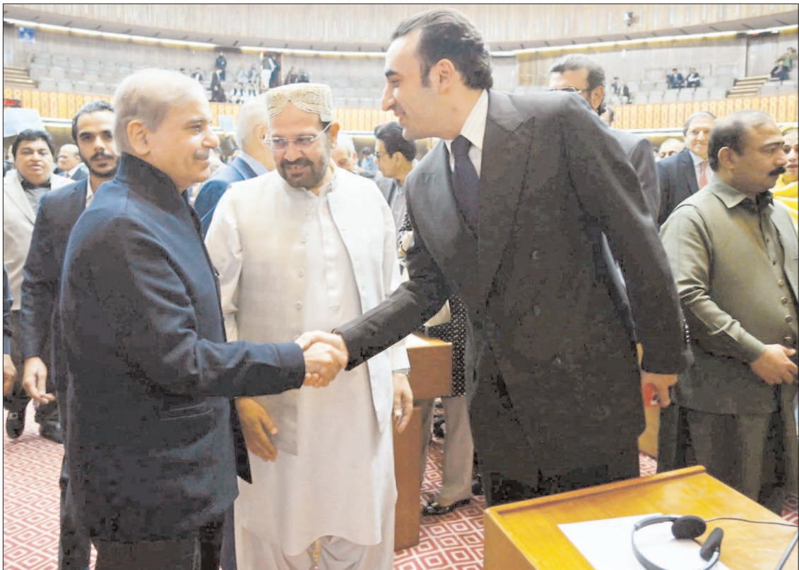
ISLAMABAD: Prime Minister Shehbaz Sharif interacting with PPP Chairman MNA Bilawal Bhutto Zardari during joint session of Parliament.