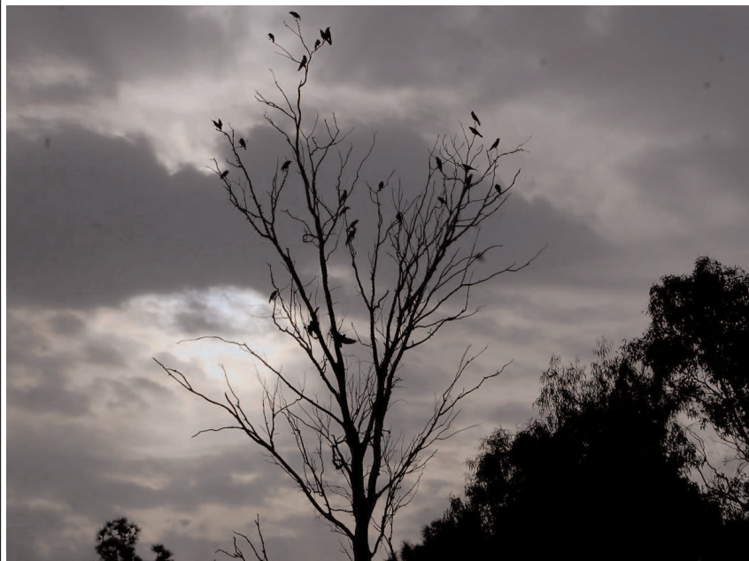
ISLAMABAD: Birds sitting on leafless tree during the cloudy evening in Capital city.

Cases have been registered against the arrested suspects under the Narcotics Control Act and further investigations are under process.