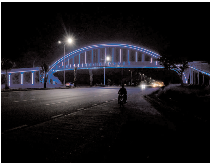
ISLAMABAD: An attractive view of pedestrian bridge over 7th avenue beautifully decorated with lights in the holy fasting month of Ramadan.

that PPOD received a total of 53,030 pay orders instead of the expected 500,000 and made every effort to distribute as many as possible within the prescribed timeline. The Chairman of the committee directed that the assigning authority of PPOD project and other responsible for this task be summoned to the next meeting. He also expressed concerns over the poor performance of Pakistan Post Office compared to private entities. Furthermore, he instructed the department to submit a concrete proposal aimed at strengthening and improving the Pakistan Post Office services. Additionally, the Chairman emphasized the need to print new postage stamps and directed officials to present samples of both old and new stamps for comparison in the next meeting.