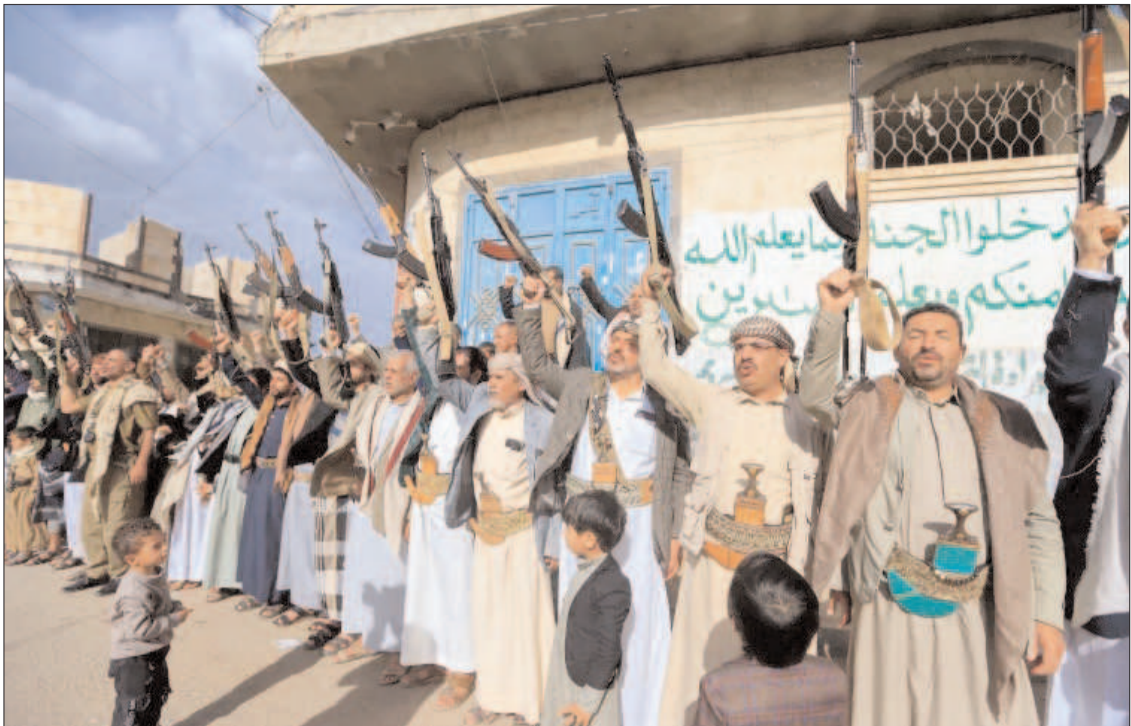
SANAA: Houthi supporters holding up their weapons during a protest against Israel's blockade of aid into the Gaza Strip, in Yemen.