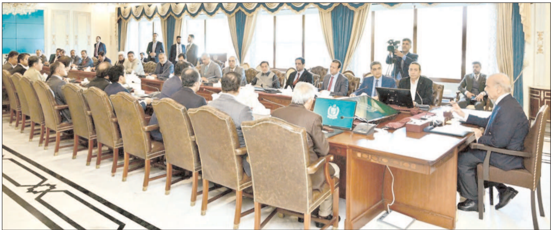
ISLAMABAD: Prime Minister Shehbaz Sharif meeting with presidents of Chambers of Commerce across country.