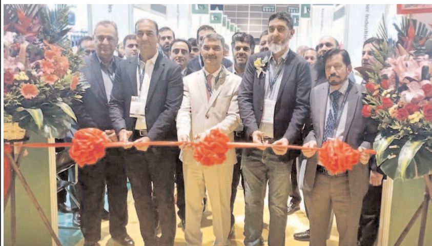
HONG KONG: Consul General Riaz Ahmed Shaikh cutting a ribbon to inaugurate Pakistan Pavilion at APLF Leather Exhibition.

Chaudhry Ashraf said that the country's economic conditions are also an important issue and the poultry feed ingredients imported from foreign countries are very expensive, in which soybean is important.