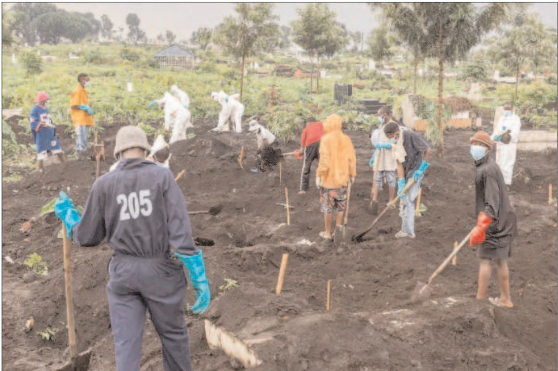
DR CONGO: Following M23's takeover of the city of Goma, members of Congolese Red Cross and volunteers buried victims of the fighting.