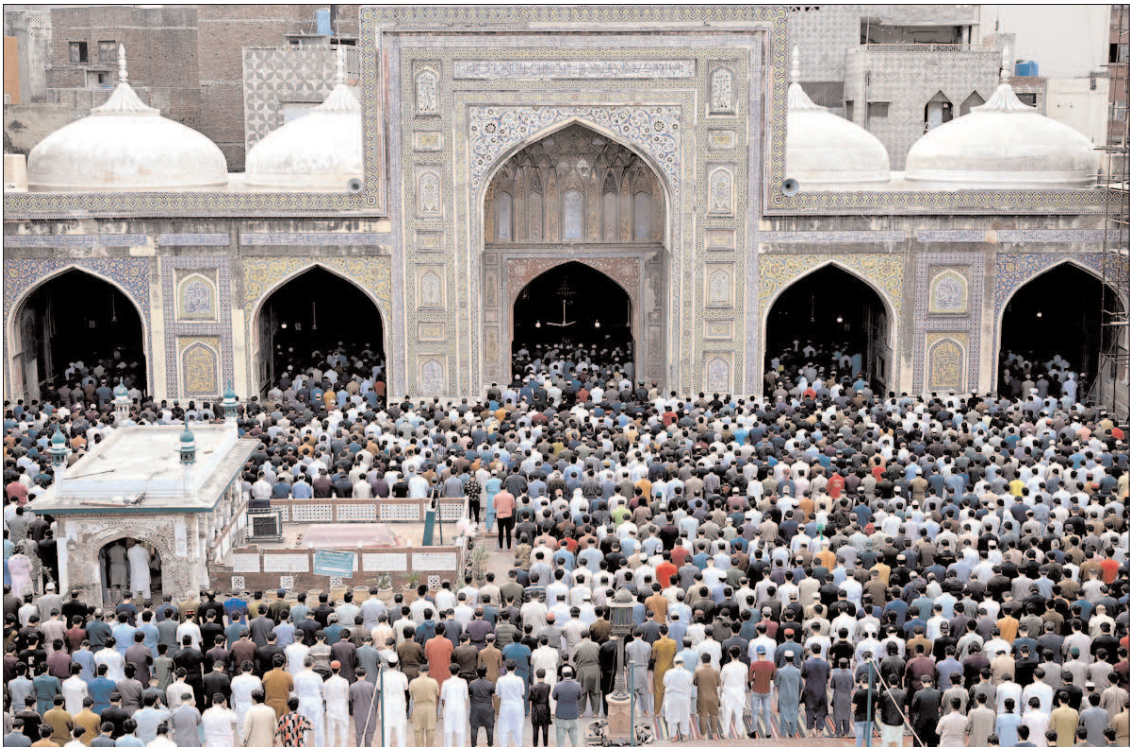
LAHORE: Muslim worshipers offer Friday prayers during the holy fasting month of Ramadan at historical Mosque Masjid Wazir Khan.