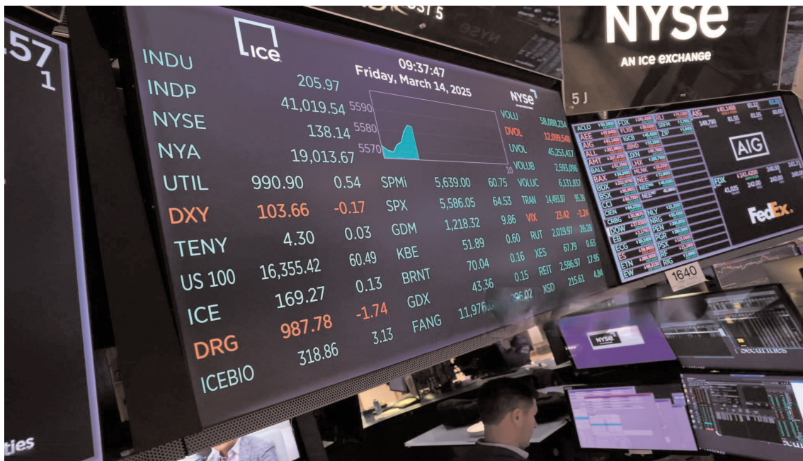
NEW YORK: Stock market numbers are seen as raders work on the floor of the New York Stock Exchange during morning trading in New York City. The market opened on an upward swing a day after the S&P 500 went into correction territory and with the Dow Jones on its way to a second-straight losing week and its worst weekly decline since June 2022.