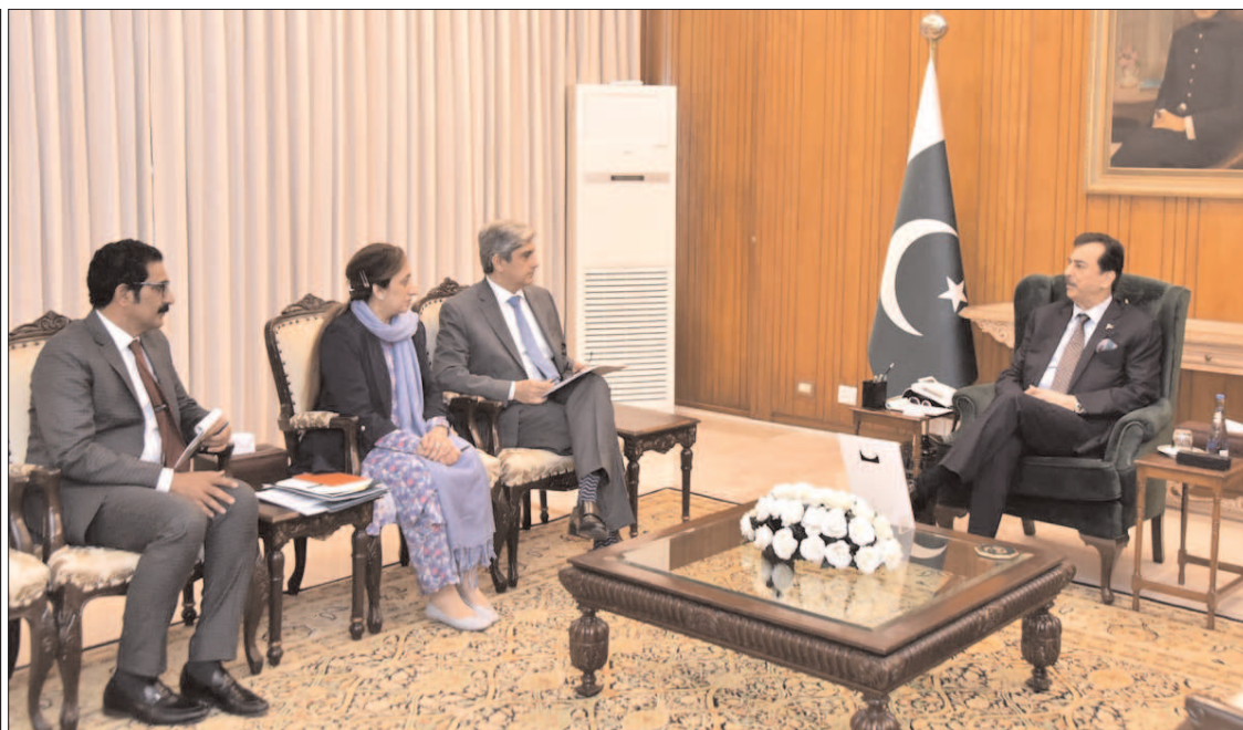
ISLAMABAD: President Syed Yousuf Raza Gillani chairs a meeting on population at Aiwan-e-Sadr.