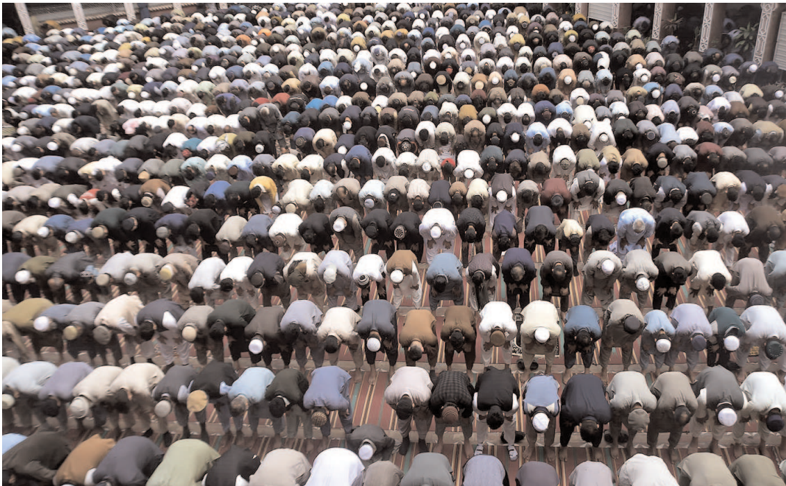
PESHAWAR: People offering Friday prayers at Sunehri Masjid during the Holy month of Ramadan.