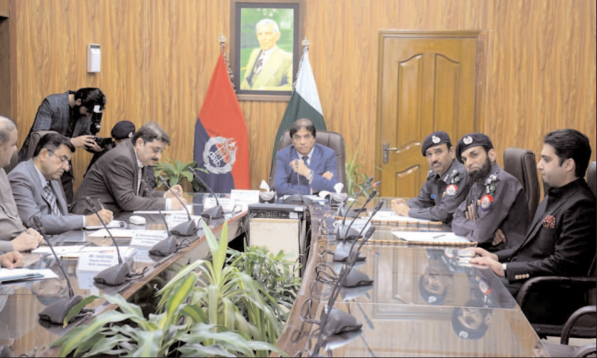
LAHORE: Federal Minister Hanif Abbasi is being briefed by the IG Railways Police on the performance of the Railway Police and the security of the Railways.

In continuation of which 13 gangs involved in heinous incidents were smashed and 28 operatives were arrested during the last 24 hours. Similarly, 280 proclaimed offenders, 199 court fugitives and 67 targeted offenders were arrested. Two Kalashnikovs, 13 rifles, 90 pistols, 09 guns, revolvers and hundreds of bullets were recovered from the possession of the criminals, while 2.70 crore rupees in cash, 4 vehicles, 85 motorcycles, 15 mobile phones, 05 cattle and gold were also recovered from the possession of the accused. The IG Punjab said that intelligence-based operations and crackdowns should be continued without interruption to eliminate organized crime.