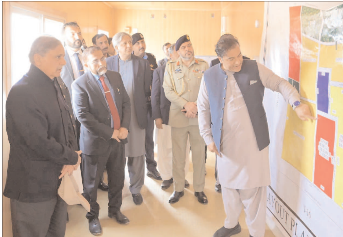
ISLAMABAD: Prime Minister Shehbaz Sharif being briefed about the layout plan of Danish University of Emerging Sciences.

He reaffirmed the nation's unwavering support for the security forces in their fight against terrorism, saying that the entire country stands united in eradicating this menace. "We salute the sacrifices of our martyrs for the security and sovereignty of the nation," he added.