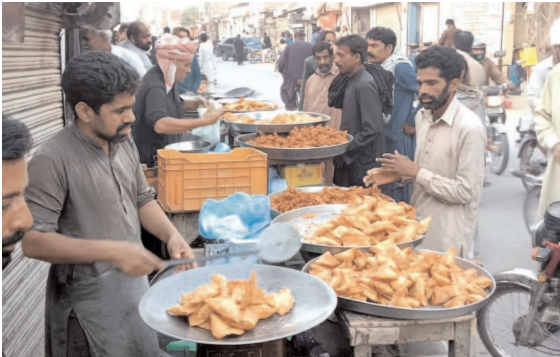
BAHAWALPUR: People purchasing traditional food items for iftar from roadside stall.