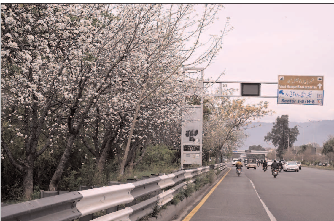
ISLAMABAD: A beautiful view of flowers blooming on trees along expressway marking the arrival of the spring season in the Federal Capital.