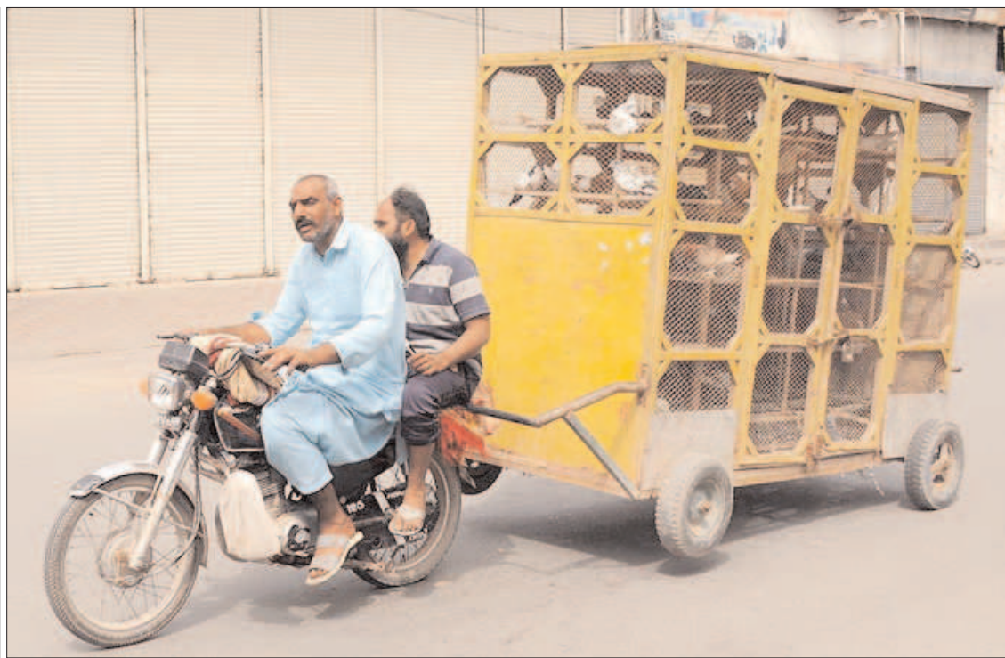
MULTAN: A motorcyclist riding along the road with a huge birdcage attached to his motorcycle, heading towards his destination.

Speaking on the occasion, the RPO said that police can never forget martyrs who rendered sacrifice and laid down their lives in the line of duty to protect the countrymen from the evil designs of criminals and enemies of Pakistan. The RPO spent considerable time with the kids of the martyrs and exchanged pleasantries with them besides giving them gifts.