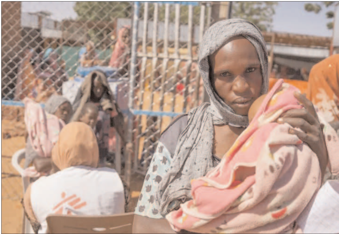
DARFUR: A woman and baby at the Zamzam displacement camp, close to El Fasher in Sudan.

Security forces poured into the region to crush the insurrection, while mosques in areas loyal to the government issued calls for jihad, or holy struggle. During violence that followed, the Syrian Observatory for Human Rights says more than 1,200 civilians were killed, the vast majority of them Alawites.