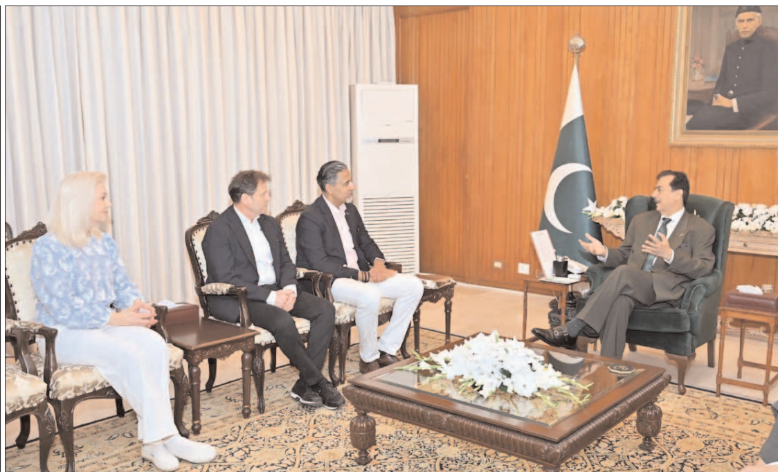
ISLAMABAD Norway's Former Minister of culture and Former Deputy Speaker of Norwegian Parliament, Mr Abid Raja, along with his delegation called on President Syed Yousaf Raza Gilani at Aiwan-e-Sadr.