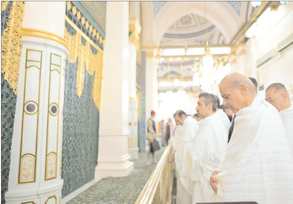
MADINA: Prime Minister Shehbaz Sharif offering jumma prayer at Masjid-e-Nabvi.