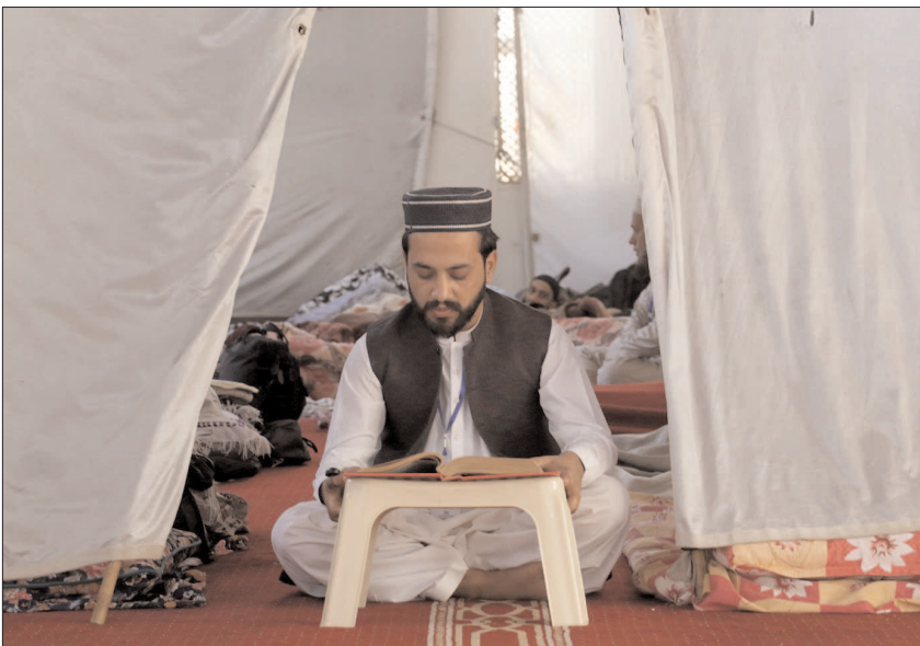
ISLAMABAD: A man reciting the holy Quran during 'Itikaf' at Faisal mosque.