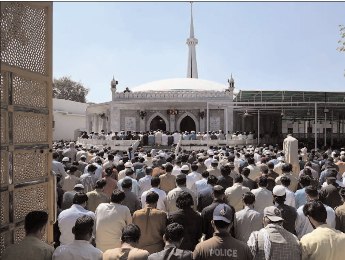
LAHORE: A large number of faithful offering third Friday prayer of Holy Fasting Month of Ramzan ul Mubarak at Masjid Al-Shuhada.