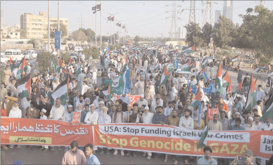
KARACHI: Workers of Jamat-e-Islami holding a protest rally to show solidarity with Palestinian people.

Erdogan said it was "a dead end" to take to the streets. "Pointing to the streets instead of the courts to defend theft, looting, illegality, and fraud is gravely irresponsible," he said. Authorities imposed a four-day ban after the detention and said that 53 people were detained during protests on Thursday.