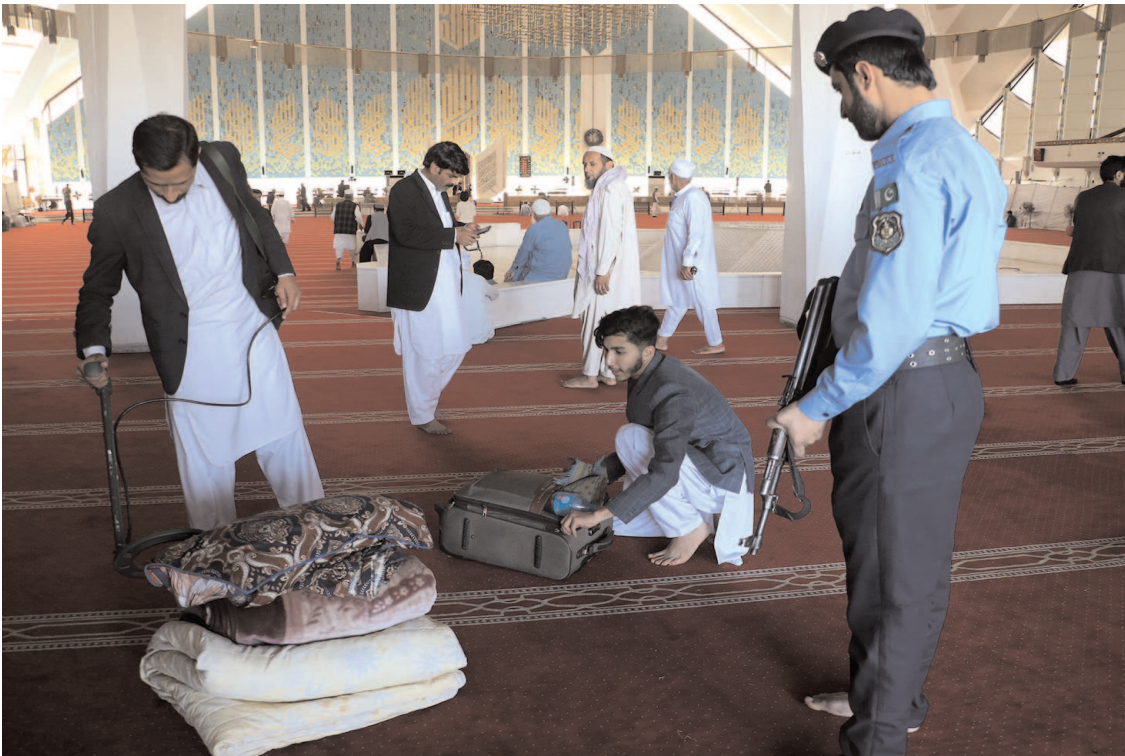
Security personal searching the languages of those who sit in ‘Itikaf’ at Faisal Mosque during holy month of Ramadan.

RAWALPINDI (APP): The Cantt Police in a major crackdown against professional beggars on Friday busted a begging mafia racket arresting two ‘contractors’ and 47 beggars. According to the Rawalpindi Police spokesman, the beggars, including men and women of all ages, were taken into custody in raids on various hotels, inns and plazas. The arrested beggars included 14 women, 31 men and two transgenders, the spokesman said. He said the two contractors were running the begging network in an organized manner. They used to bring people from Lahore, Ferozwala, Borewala and D G Khan to beg in Rawalpindi. The spokesman further said the contractors would drop the beggars at a specific point in their transport.