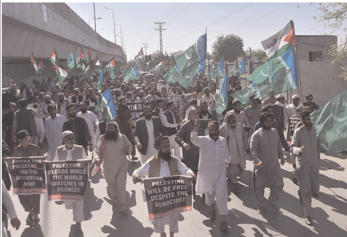
PESHAWAR: Activists of Jamaat-e-Islami protesting against Israeli occupation in Palestine.

deputed in examination centers would convene a meeting to discuss preparations. He said that government would take all the necessary measures to prevent unfair means in matriculation examination and added that center with extraordinary arrangement would be appreciated and given commendation certificates.