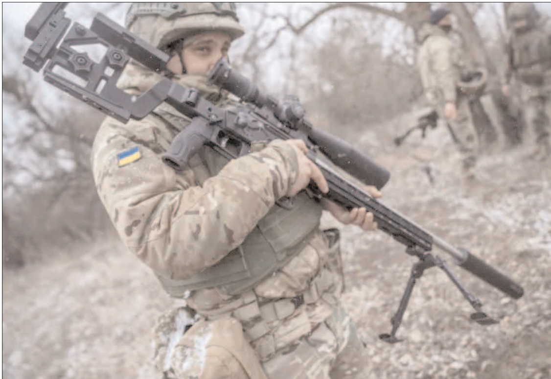
KYIV: A Ukrainian soldier from a sniper unit with a Savage 110 elite prestige 338 rifle prepares to fire at a shooting range in Kharkiv region, Ukraine.

Peace talks between Congo and Rwanda were unexpectedly canceled in December after Rwanda made the signing of a peace agreement conditional on a direct dialogue between Congo and the M23 rebels, which Congo refused at the time. The conflict in eastern Congo escalated in January when the Rwanda-backed rebels advanced and seized the strategic city of Goma, followed by Bukavu in February.