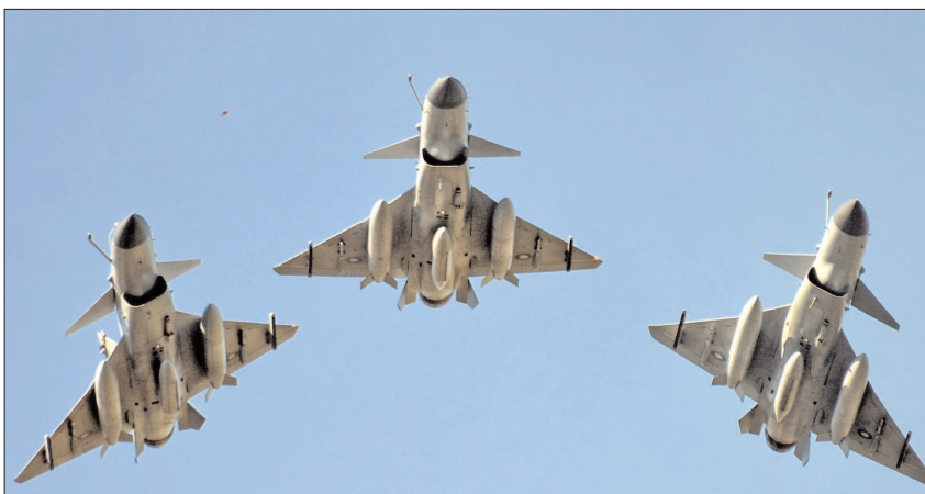
ISLAMABAD: PAF jets taking part in rehearsal for 'Pakistan Day'.

He said, "Our commitment to renewable energy expansion, plastic waste reduction, and green job creation is laying the foundation for long-term environmental stewardship. However, policies alone are not enough—true change begins at home. Every action, no matter how small, strengthens the collective momentum toward a sustainable tomorrow." "This Earth Hour beginning 8:30 pm tonight, let us unplug to reconnect—with our families, our communities, and the Earth itself—for a brighter and more sustainable tomorrow," he added.