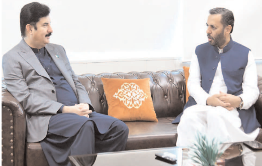
ISLAMABAD: Governor Khyber Pakhtunkhwa Faisal Karim Kundi visits Ministry of health meets federal Minister of health Mustafa Kamal.

The minister added that ML-1 will bring major improvements to Pakistan Railways. “It will reduce accidents, increase the number of trains, and make them faster. Once the project is complete, travel times are expected to drop by 40%, making train journeys safer, quicker, and more efficient for passengers,” Kayani concluded.