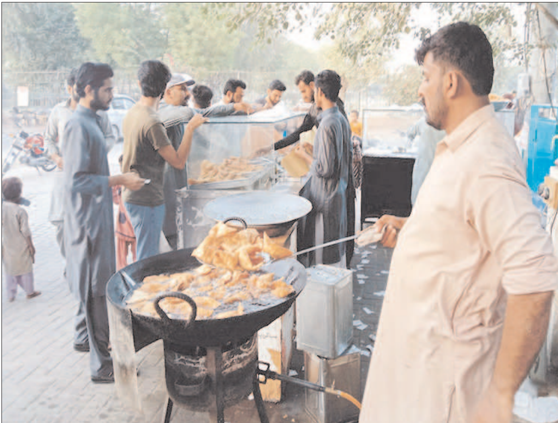
BAHAWALPUR: A man frying samosas to sell at his roadside stall.

FAISALABAD: Minister of State for Interior, Talal Chaudhry criticized the Khyber Pakhtunkhwa (KP) government for its reluctance to take decisive action against terrorism. Talking to media, he accused the Pakistan Tehreek-e-Insaf (PTI) of harboring a "soft corner" for terrorists, citing their boycott of the recent Parliamentary Committee on National Security meeting as evidence. He also criticized the KP Chief Minister for making contradictory statements regarding the civil-military meeting, emphasizing that no military operation was discussed during the session.