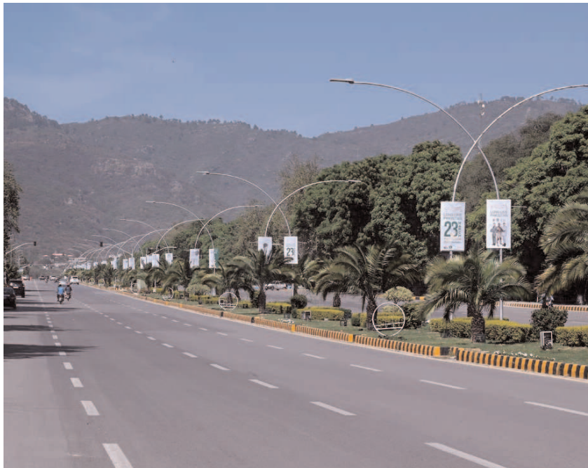
ISLAMABAD: A view of Banners displayed on green belt in connection with Pakistan Day at Constitution Avenue in the Federal Capital.

The CDA has urged all businesses and property owners to comply with building regulations to avoid legal action and contribute to the city's sustainable development.