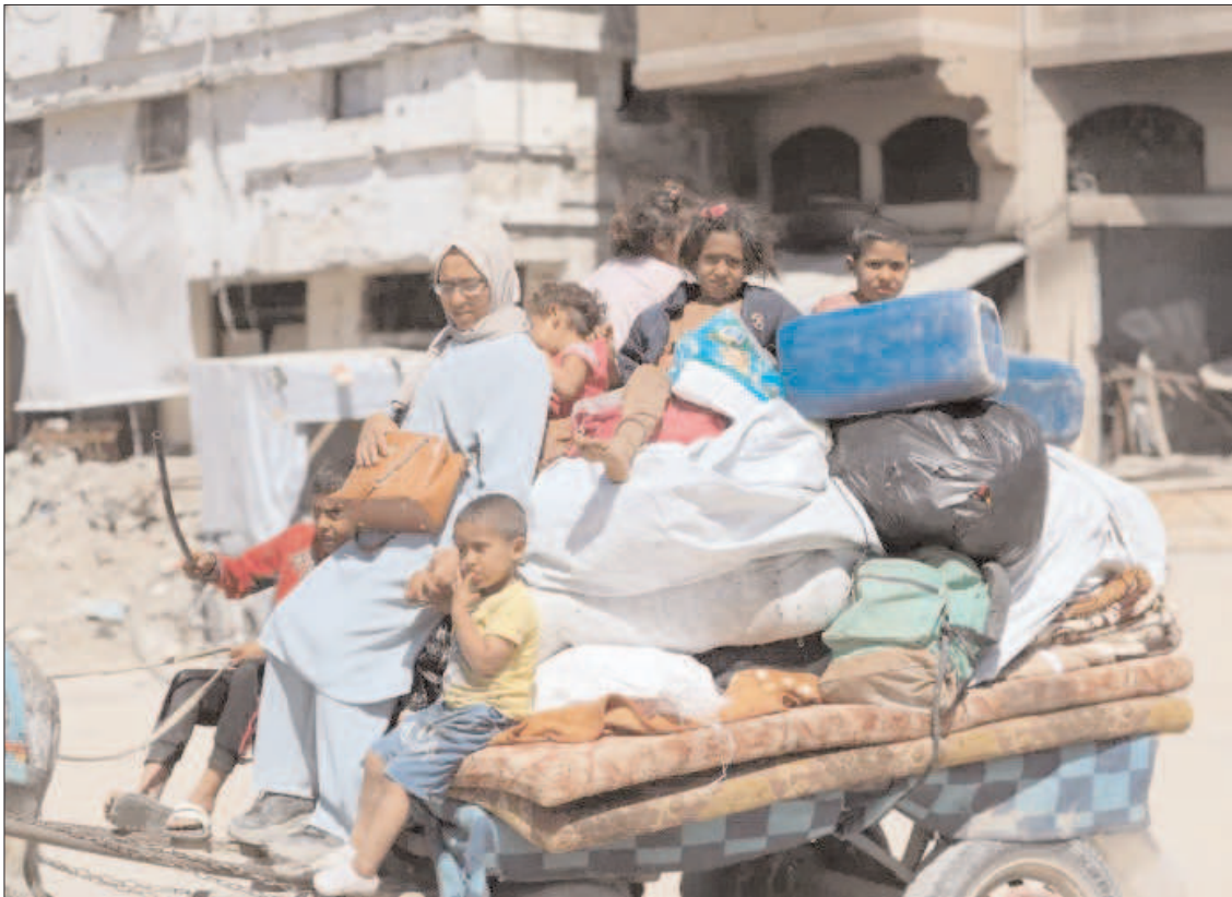
GAZA STRIP: Palestinians flee their homes after heavy Israeli strikes in the area.