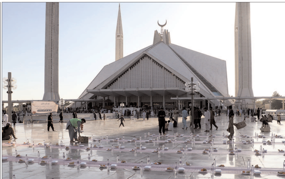
ISLAMABAD: A velometers busy in arrange meals and drinks for people to break thier fast during holy month of Ramadan at Faisal Mosque.