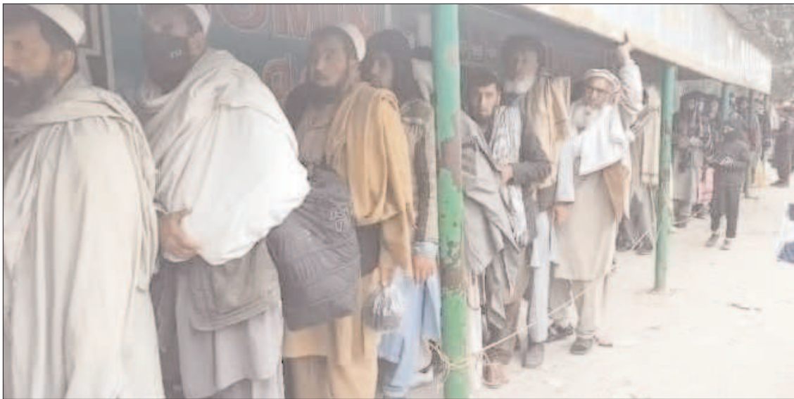
TORKHAM: Passenger mostly Afghan national standing in queue outside pedestrians' terminal to move across the border.