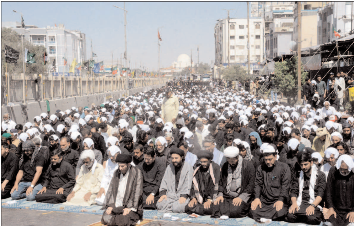
KARACHI: Mourners offering Zuhr prayers at M A Jinnah Road observing the Martyrdom Day of Hazrat Ali (AS).