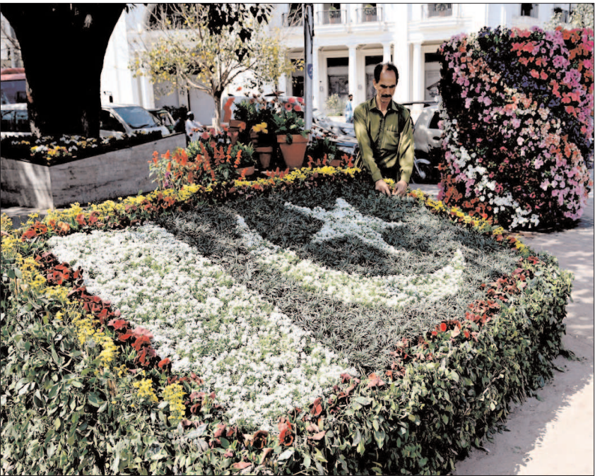
LAHORE: A PHA worker is preparing Pakistan flag with fresh flowers on Pakistan Day celebrations at Cherang Cross.

Later, the minister Ramesh Arora distributed Langar among the Sangat.