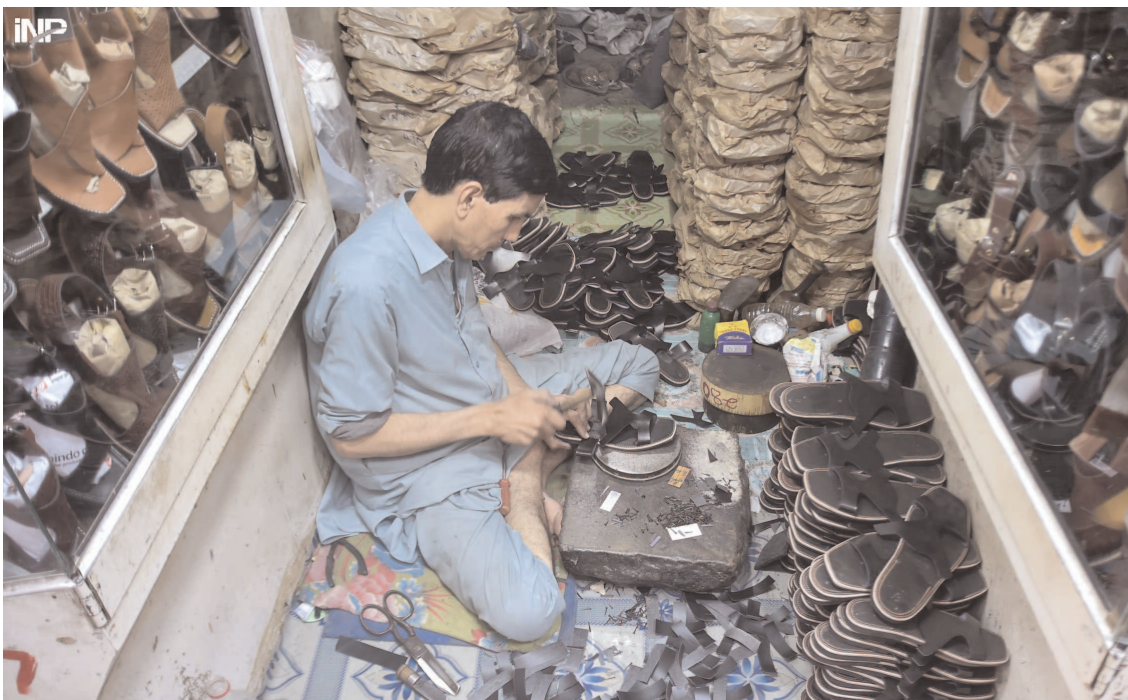
PESHAWAR: Worker busy in making Peshawari Chappal as Eidul Fitr draws near.

abouts, along with the development of a waterproof canal, outdoor advertising regulations, traffic and transportation improvements, and infrastructure upgrades. Measures to remove encroachments and enhance underpasses and bridges were also discussed. During the meeting, the Chief Secretary was briefed on strategies to utilize the commercial potential of the Peshawar Development Authority. The initiative aims to transform Peshawar into a vibrant and attractive city, preserving its rich cultural heritage while ensuring sustainable urban development.