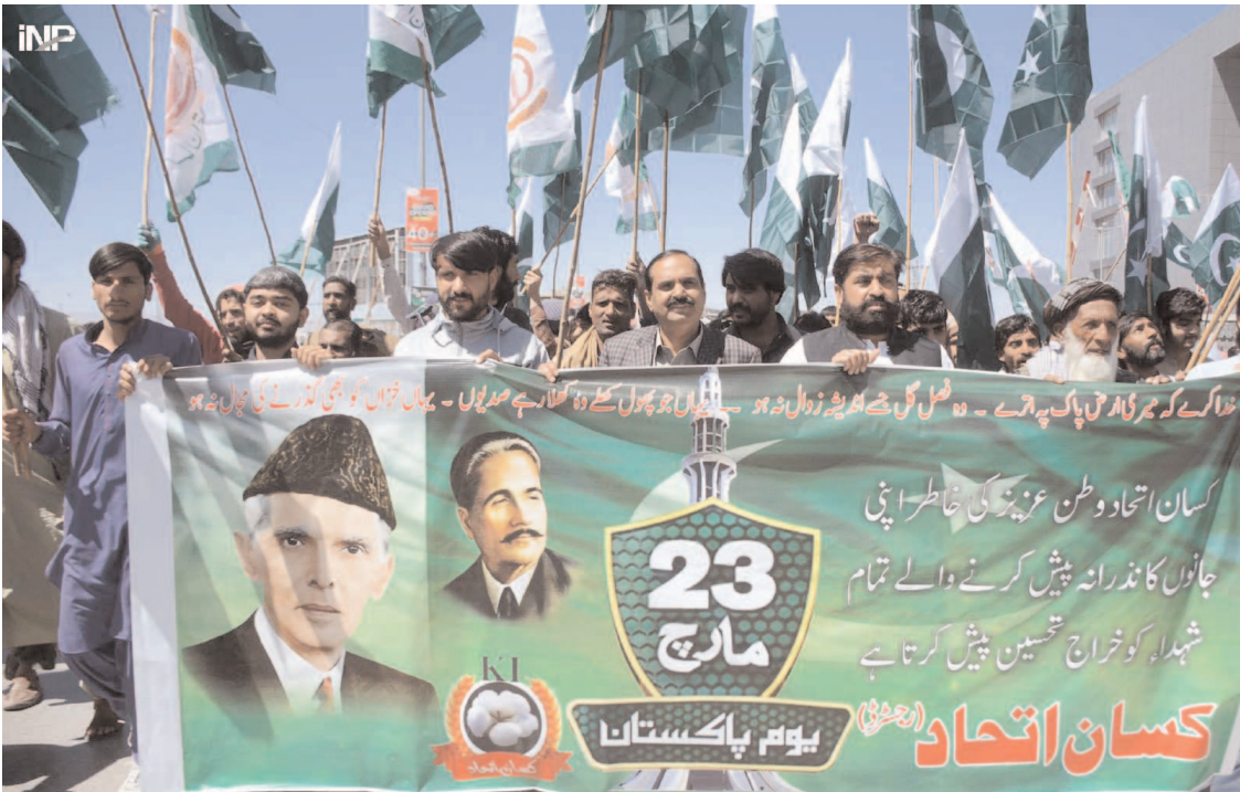
QUETTA: Members of Kisan Etihad holding rally to celebrated Pakistan Day outside Balochistan Assembly.

SUKKUR (APP): Syed Khursheed Ahmed Shah, a senior leader of the Pakistan Peoples Party (PPP) Sunday paying tribute to the country's benefactors who, under the leadership of Quaid-e-Azam, bestowed upon us the blessing of freedom. In his statement issued here, Shah emphasized that Pakistan is our pride and honor, and we will not hesitate to make any sacrifices for its sake. He reiterated the PPP's commitment to Quaid-e-Azam's vision of democracy, peace, progress, and brotherhood, and vowed to continue striving for its realization. Shah also highlighted the PPP's unwavering struggle for the human, democratic, and constitutional rights of the people since its inception. His message served as a testament to the party's dedication to upholding the principles of democracy and the well-being of the Pakistani people.