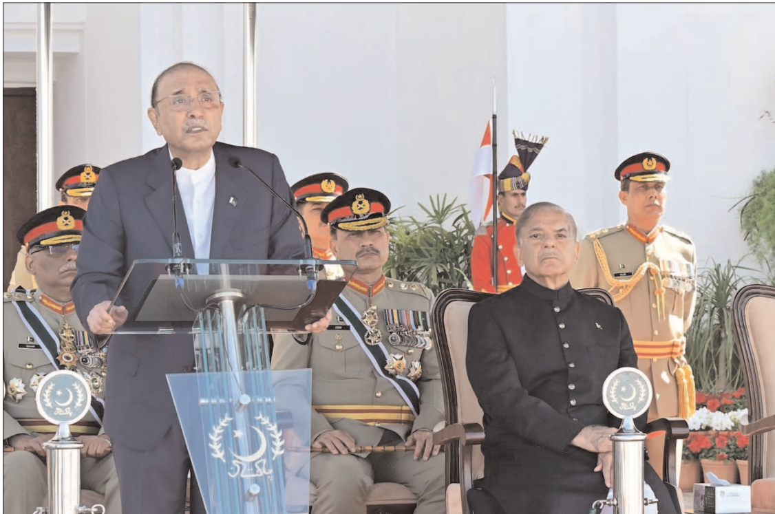
ISLAMABAD: President Asif Ali Zardari addressing the Pakistan Day parade ceremony, at Aiwan-e-Sadr. Prime Minister Shehbaz Sharif and Chief of Army Staff General Asim Munir also present.

He said he and the whole Pakistani nation stood with the brave armed forces which were defending the country with unwavering determination.