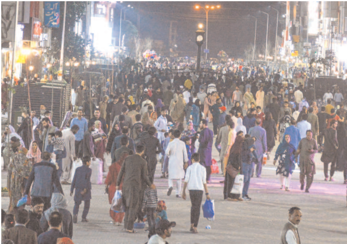
RAWALPINDI: A large number of people visiting Bank Road Sadar for Eidul Fitr shopping.