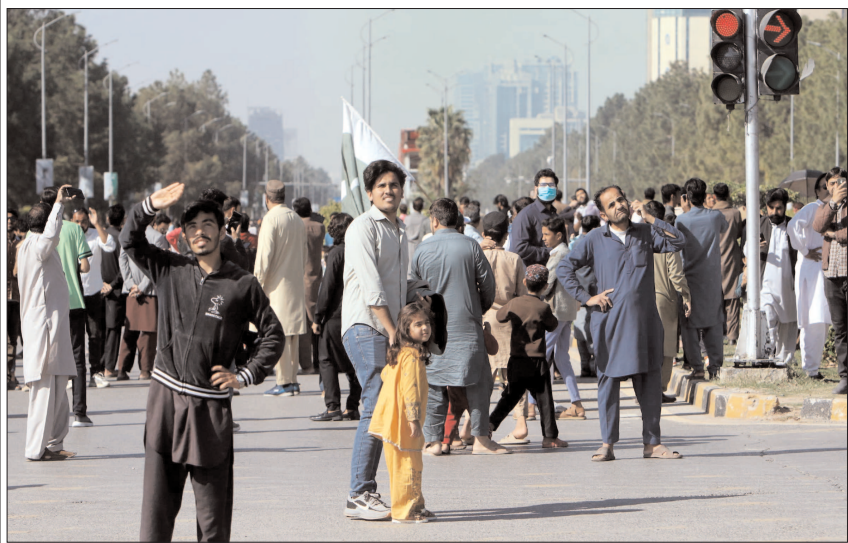
ISLAMABAD: People watch the skill of Pakistan Air Force (PAF)'s jets over the president's House during the Pakistan Day Parade.

Pakistan Day commemorates the resolution that paved the way for the country's independence, serving as a reminder of the nation's enduring commitment to growth and development.