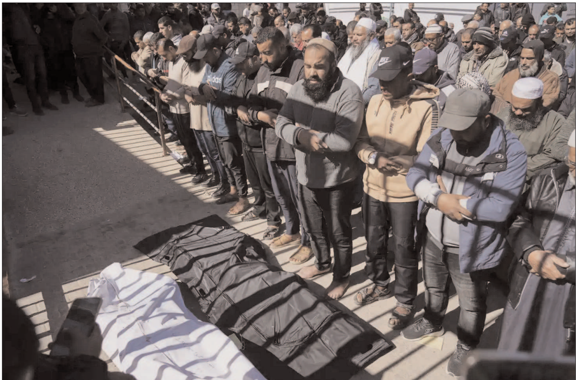
Gaza: Mourners pray next to the bodies of their Palestinians killed in the Israeli bombardment of the Gaza Strip as they are brought for burial at Nasser Hospital in Khan Younis, SundaY.