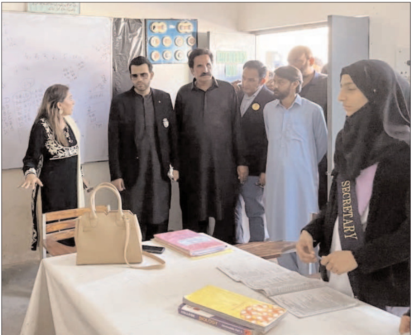
RAWALPINDI: Parliamentary Secretary for Information & Broadcasting celebrated Pakistan's 85th National Day with students at Govt. Associate College for Women, Rawalpindi.