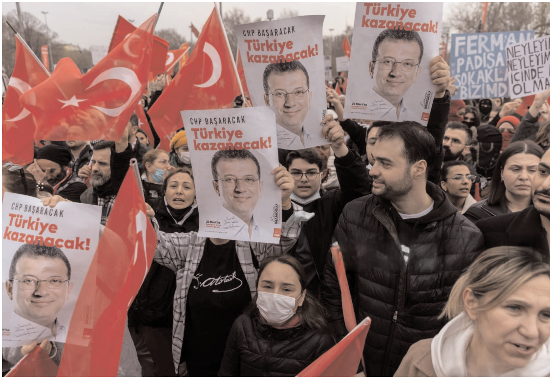
ISTANBUL, TURKEY: Demonstrators chant slogans as they hold posters in support of arrested Istanbul Mayor Ekrem Imamoglu Sunday.

In his talk, Rasool spoke in academic language of the Trump administration's crack-downs on diversity and equity programmes and immigration and mentioned the possibility of a US where white people soon would no longer be in the majority.