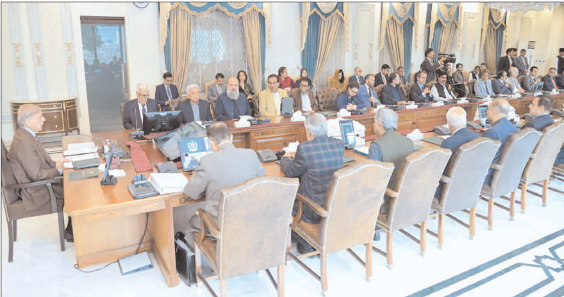
ISLAMABAD: Prime Minister Shehbaz Sharif chairing the federal cabinet meeting.