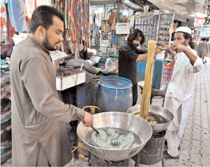
ISLAMABAD: Workers dyeing clothes as per customers demand ahead of Eid-ul-Fitr at Aabpara Market.

Earlier, the Calling Attention Notice regarding the issue of imposition of toll tax without completion of 17 Km road from Rajarasti to Umerkot despite passage of four years since the construction started in 2021 against the scheduled completion time of six months moved by Senator Poonjo Bheel in the Senate sitting held on 14 th February, 2025 was taken up and resolved. The NHA assured the committee after deliberations that the toll plaza will be removed.