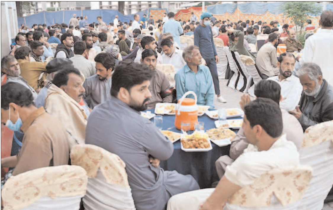
SIALKOT: A large number of people sitting for monthly Iftar program at Allama Iqbal Teaching Hospital.