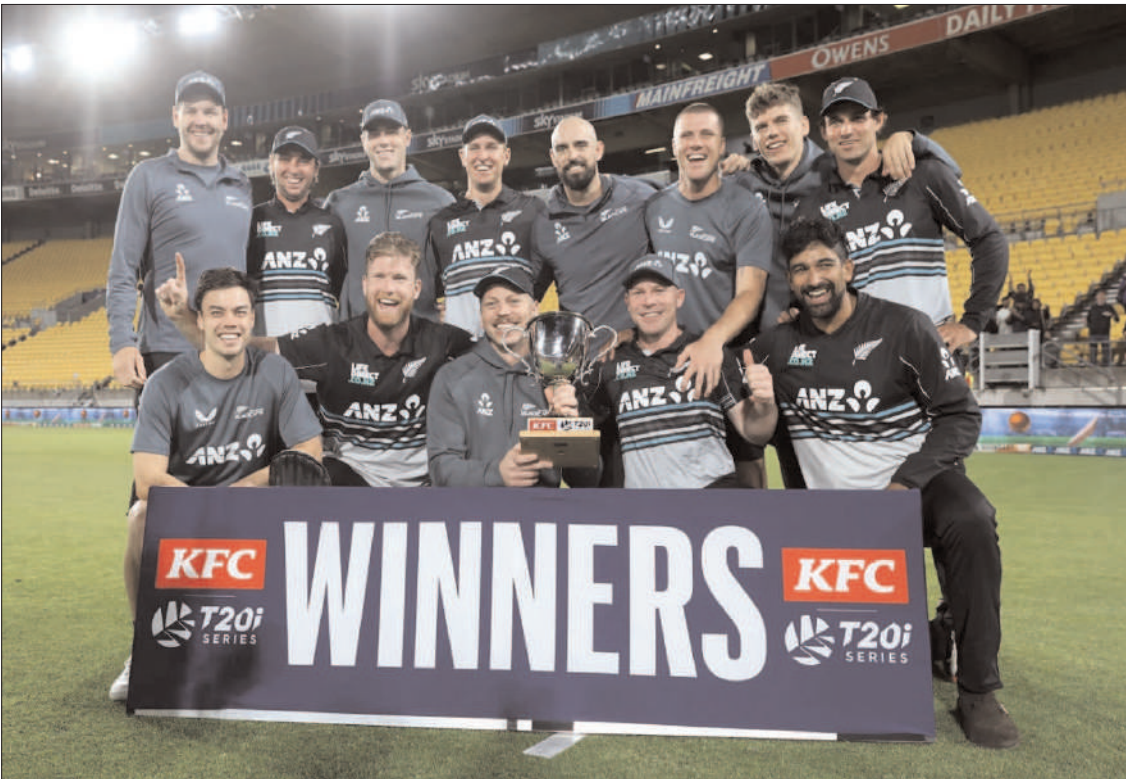
WELLINGTON: New Zealand sealed the series 4-1 against Pakistan.

"He is going to race on a route that is not suited to him. "If ever he wins Paris-Roubaix it will be against the odds. But that is what we all expect: to see champions up against it. "This race could make him even greater than he is now."