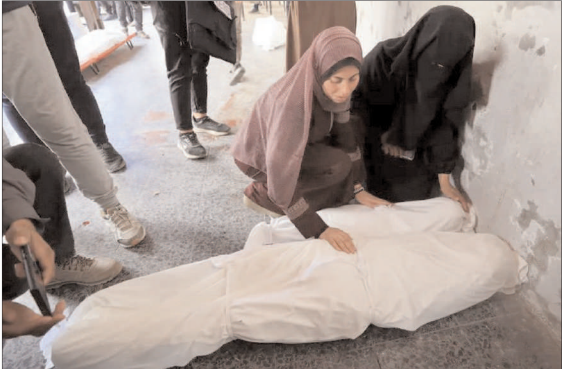
GAZA CITY: Mourners reacting beside the bodies of Palestinians killed in Israeli strikes, at al-Ahli Arab Hospital, also known as the Baptist Hospital.