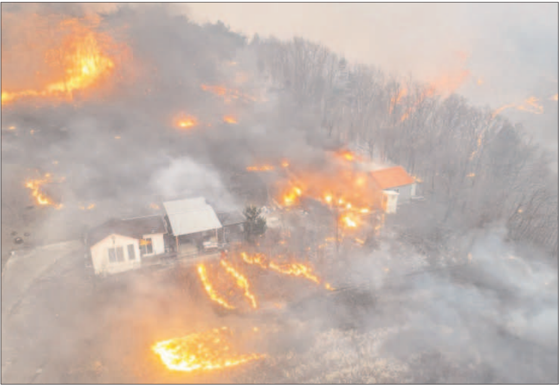
SEOUL: A house is surrounded by wildfire in Uiseong county, South Korea.