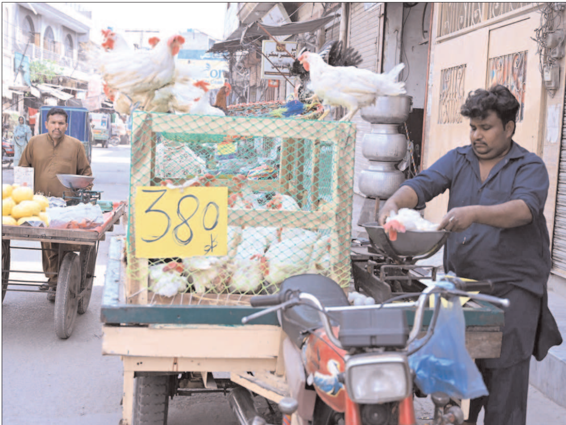
LAHORE: A man is selling chickens at low price on motorcycle at Chowk Noorian.