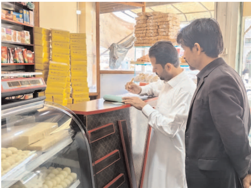
PESHAWAR: Khyber Pakhtunkhwa Food Department team officials taking action against profiteers and violators of official price lists.

PESHAWAR (APP): Mayor of Peshawar, Haji Zubair Ali on Saturday urged the public to refrain from aerial firing on Chand Raat, emphasizing that it is a dangerous and condemnable act. He warned that what seems like a moment of celebration can turn into tragedy, as innocent lives are lost due to stray bullets, turning Eid festivities into sorrow. He called on local government representatives to run awareness campaigns in their respective areas to prevent aerial firing and educate the public on its dangers. The mayor also made a heartfelt appeal to all residents of Peshawar to avoid aerial firing on Eid-ul-Fitr and encourage others to do the same to ensure a safe and joyous celebration for everyone.