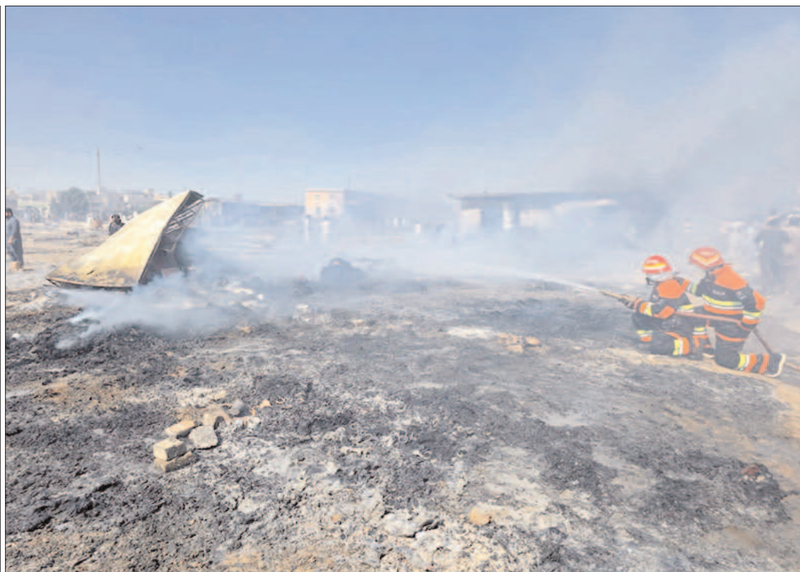
BAHAWALPUR: A sudden fire erupted in Landa Bazaar in Sadiqabad, prompting the Rescue 1122 team to declare a red code. Rescue 1122 teams from all four tehsils of Rahim Yar Khan District are struggling to extinguish the fire.

The writer Public servant at Government of Khyber Pakhtunkhwa.