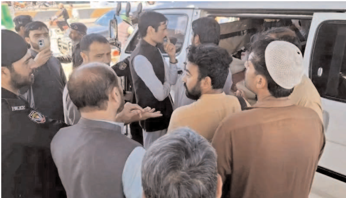
PESHAWAR: Government officials monitoring transport terminals to ensure compliance with official fare rates.

against aerial firing on Chand Raat, emphasizing cooperation with local religious scholars and community leaders to raise awareness against the practice. They have also issued directives to ensure strict implementation of the security plan across all divisions. During Eid holidays, security will remain on high alert at recreational spots, important offices, markets, bus stands, and all city entry and exit points to maintain peace and order.