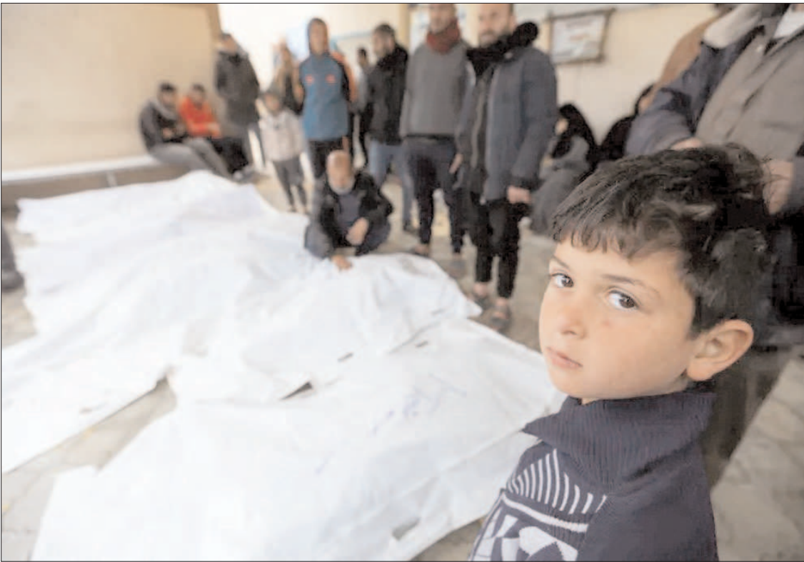
GAZA STRIP: A child looking on as people mourn Palestinians killed in Israeli attacks.

DARFUR (BBC): A Sudanese war monitor has accused the military of killing hundreds of people in an air strike on a market in the country's western Darfur region. The Emergency Lawyers group - which documents abuses by both sides in Sudan's civil war that erupted in April 2023 - said the bombing of Tur'rah market was a "horrific massacre" that had also left hundreds injured. Videos posted on social media - some by the army's rival the Rapid Support Forces (RSF), a paramilitary group that controls much of Darfur - showed the smoking ruins of market stalls and bodies charred beyond recognition. A military spokesperson denied targeting civilians, saying it only attacked legitimate hostile targets. Both the Sudanese armed forces and RSF have repeatedly been accused of shelling civilian areas. The RSF has deployed drones in Darfur, but the army has the warplanes - and regularly strikes RSF positions across the region.