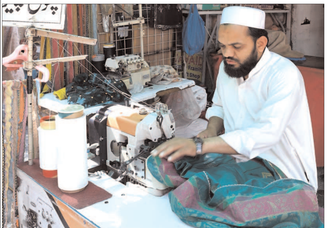
ISLAMABAD: Tailor busy in pico on dupatta at Abpara in the Federal Capital.

In addition, the PMD has advised people to avoid strenuous activities during the peak heat hours and to stay indoors as much as possible. The department will continue to monitor the weather situation and provide updates as necessary.