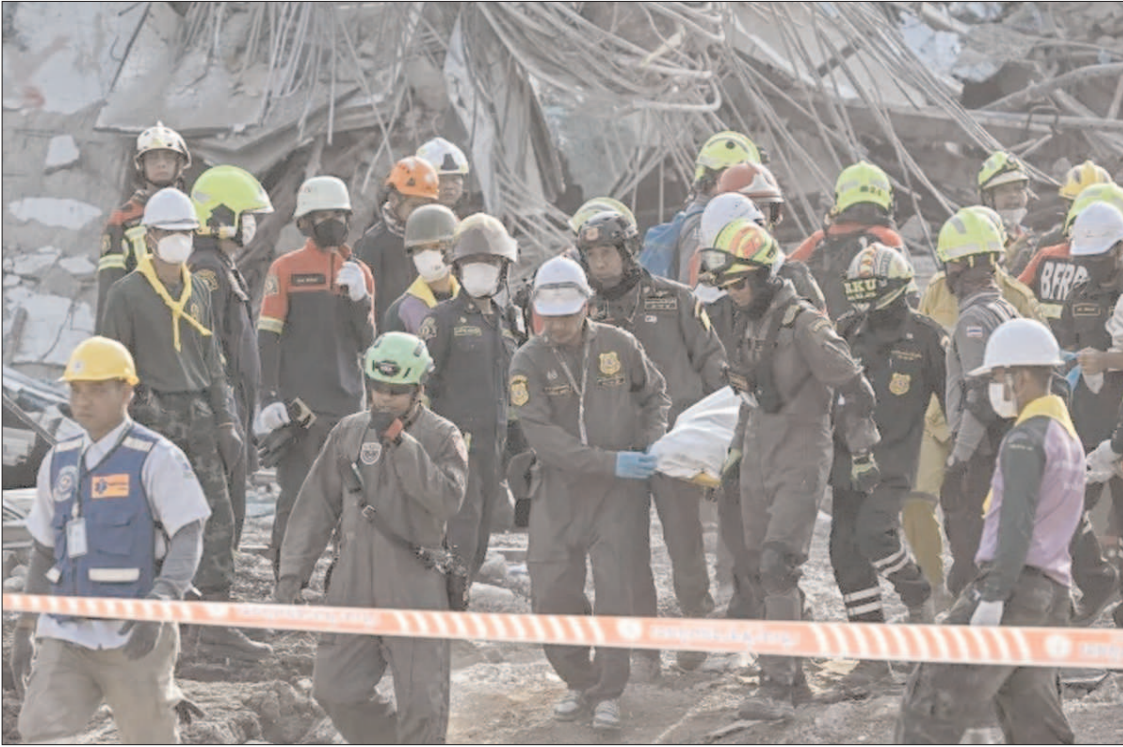
BANGKOK: Rescue workers carrying body of a victim at the site of an under-construction building collapse in Thailand.

The Constitutional Court was given 180 days from the time it took on Yoon's impeachment case to issue a ruling, meaning it has until June to decide his fate. It has typically issued rulings within weeks for past presidential impeachment cases, but it has taken longer over Yoon's case, without providing a reason. — Aljazeera