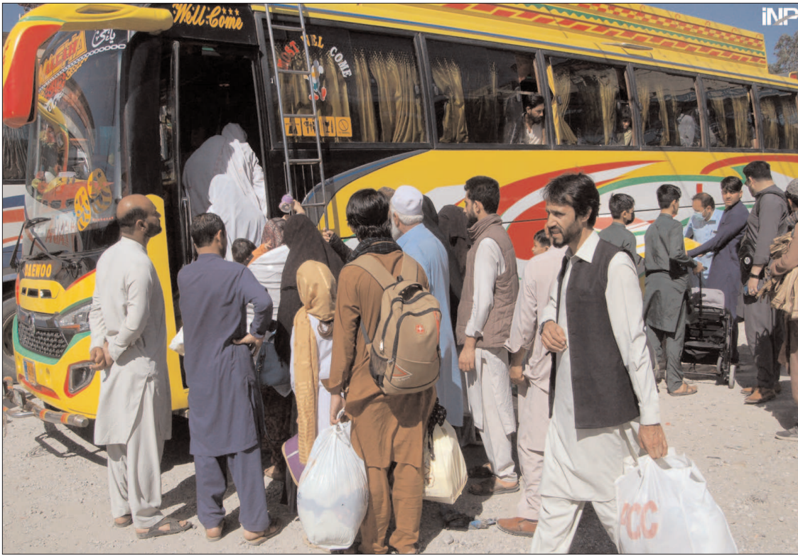
ISLAMABAD: People boarding on bus going to their home town to celebrate eid with their loved ones.