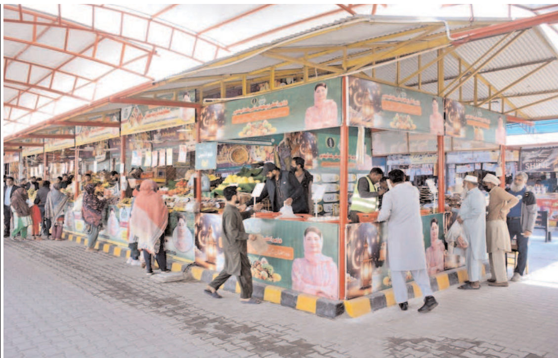
FAISALABAD: People buying various items at subsidized rates from Ramadan Bazaar.

The price of gold in the international market decreased by $28 to $2,893 from $2,921 whereas the prices of silver in international market remained constant at $32.32, the Association reported.