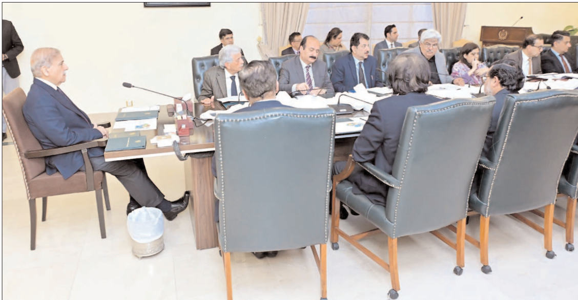
ISLAMABAD: Prime Minister Shehbaz Sharif chairing a meeting of steering committee of Small and Medium Enterprises Development Authority.