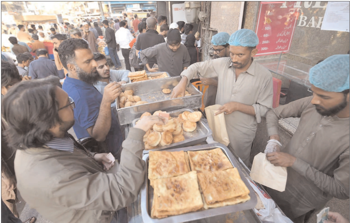
KARACHI: People buying food items from vendors for Iftari.