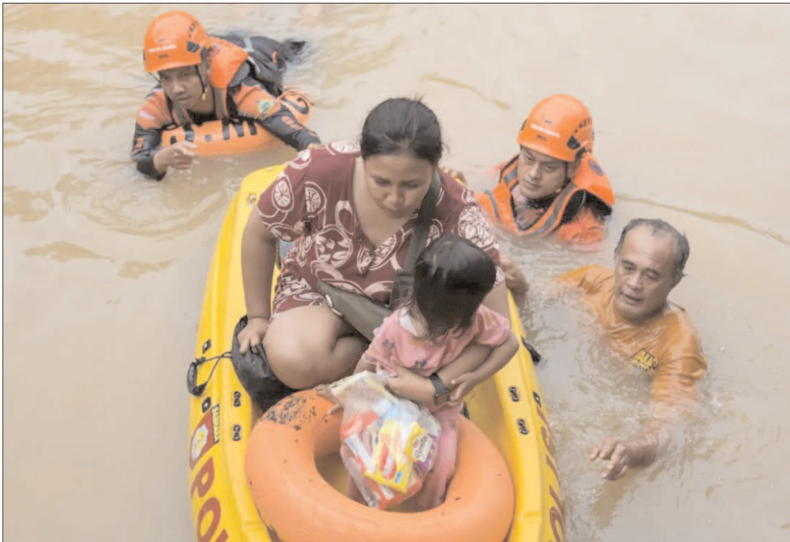
JAKARTA: Rescue teams evacuate people whose homes have been flooded in Pasar Minggu district in Indonesia.