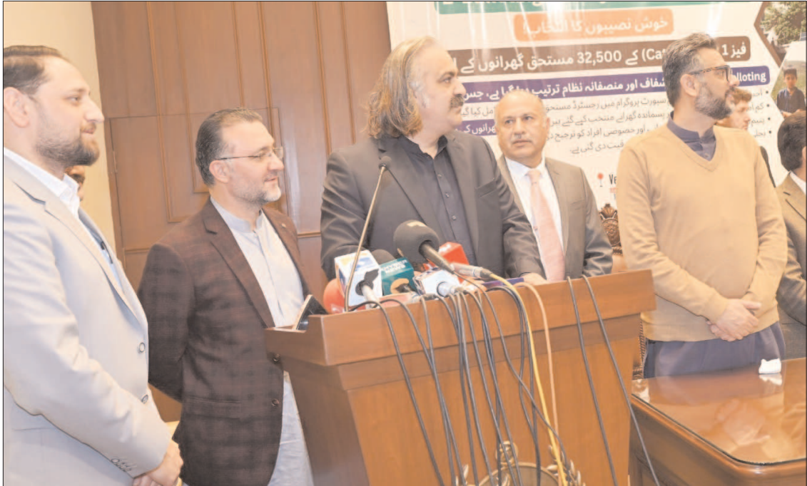
PESHAWAR: Chief Minister of Khyber Pakhtunkhwa, Ali Amin Gandapur inaugurating Solarization of Houses project.