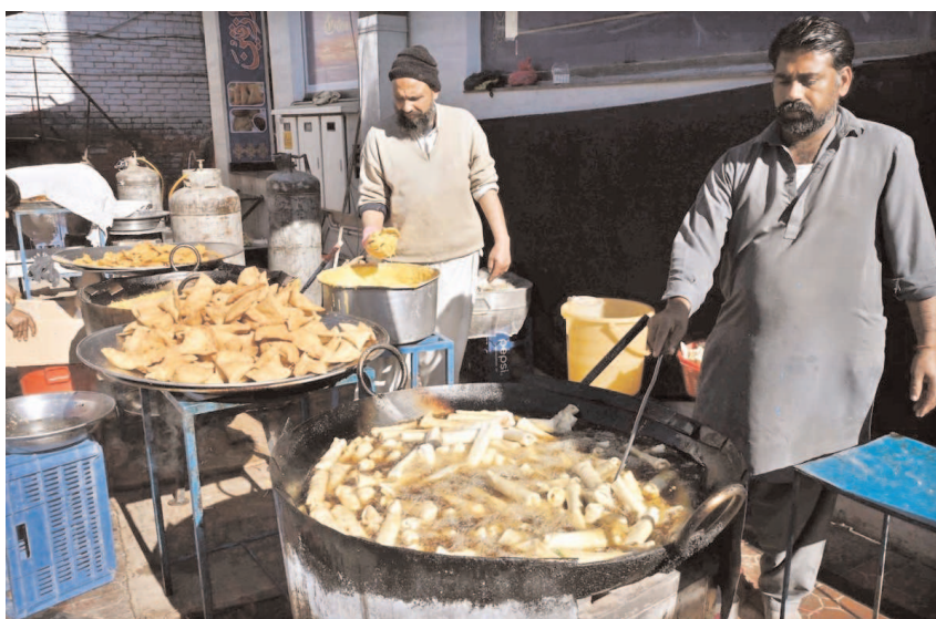
ISLAMABAD: Vendors busy in frying traditional food items for iftar during holy fasting month of Ramzan-ul-Mubark at F-6/I Market.

The spokesman said that fresh ideas and observations by the interns reflected the multi-generational synthesis that the internship program aims to cultivate—bridging the knowledge of experienced professionals with the innovative thinking of young minds.