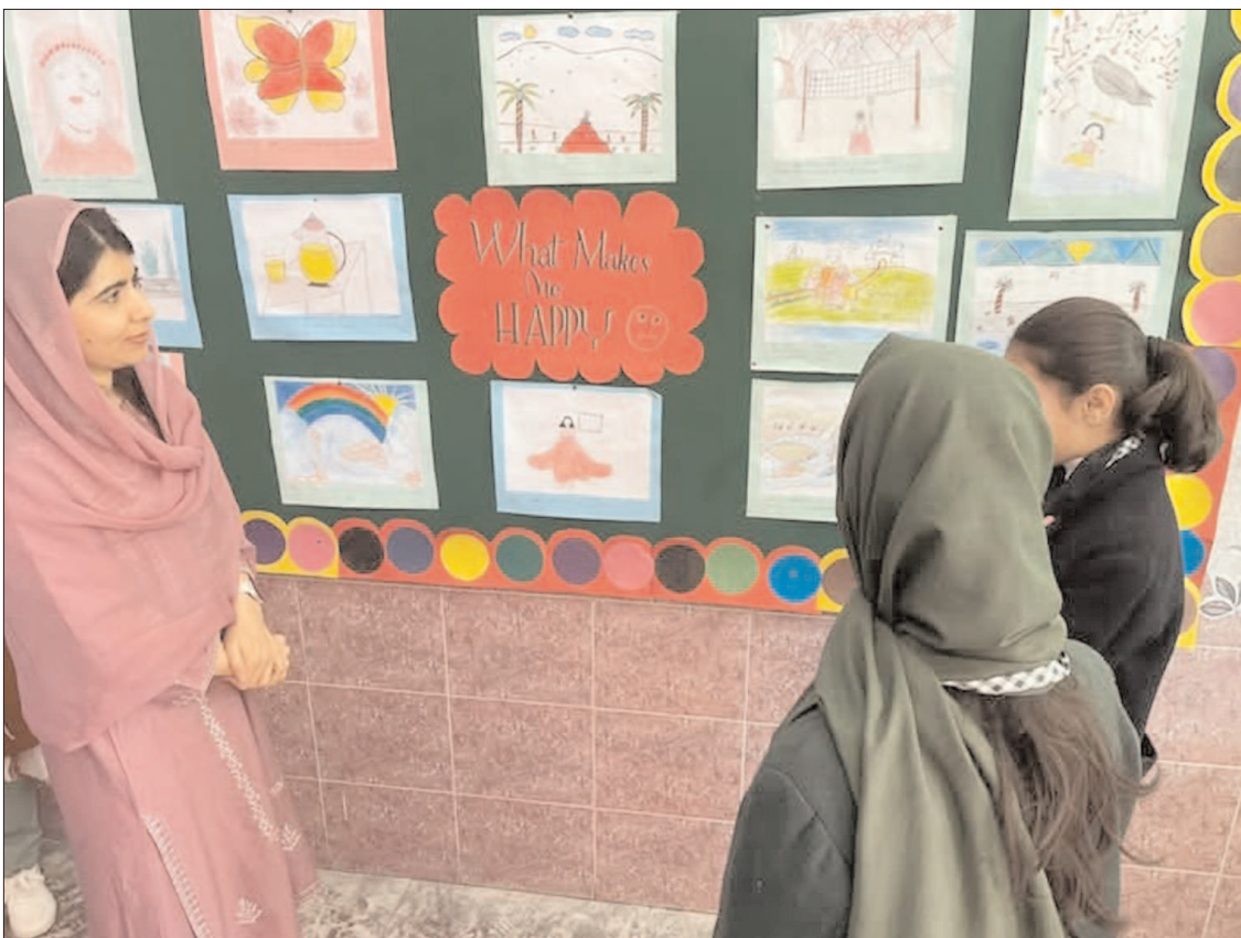
SHANGLA: Nobel laureate Malala Yousafzai taking keen interest in placards during her visit to girl's school.