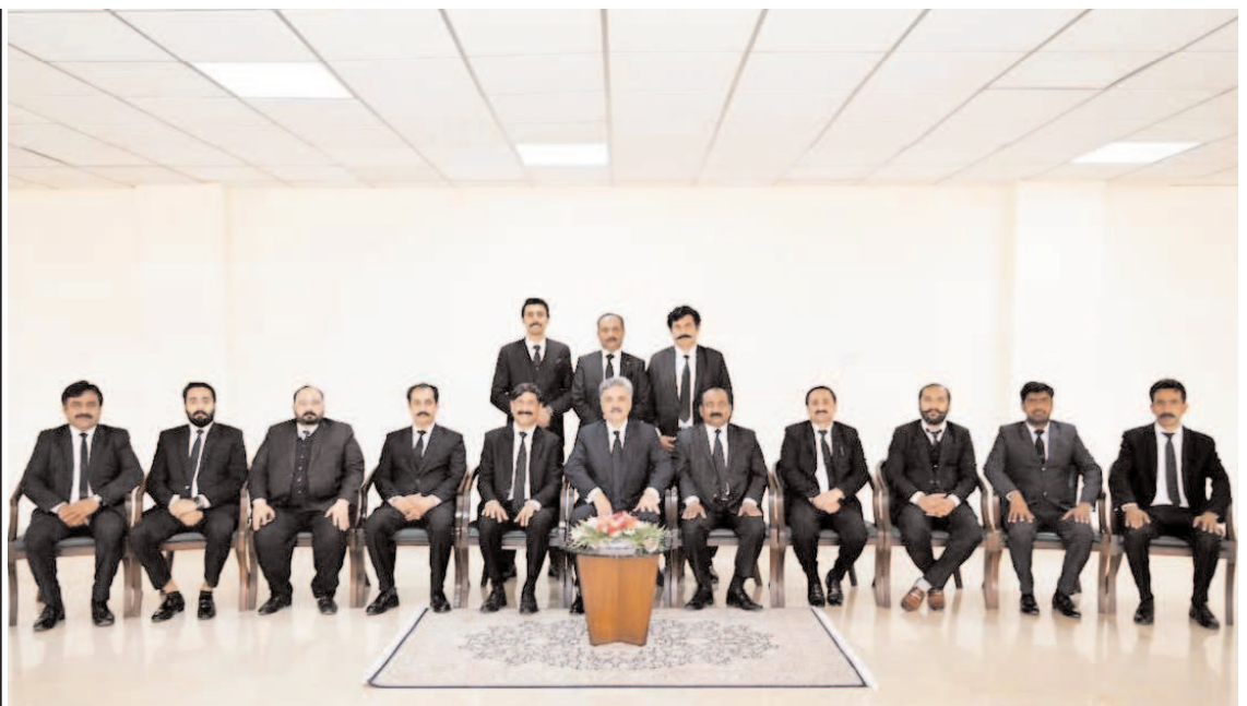
ISLAMABAD: Chief Justice of Pakistan Justice Yahya Afridi in a group photo with District Bar Association of Jhang at Supreme Court of Pakistan.

Meanwhile, stakeholders had commended the Ministry of Climate Change for its proactive approach in coordinating national efforts towards sustainable development.