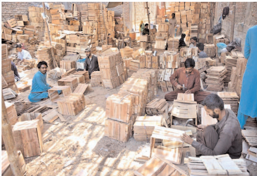
HYDERABAD: Workers busy making wooden boxes at their workplace.

During the week ended on 28-Feb-2025, SBP reserves increased by US$ 27 million to US$ 11,249.5 million.