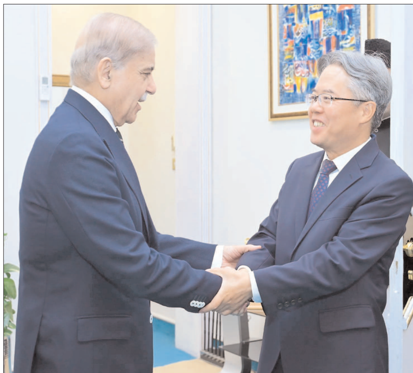
ISLAMABAD: Ambassador of China to Pakistan Jiang Zaidong called on Prime Minister Shehbaz Sharif.

Meanwhile, Chairman Pakistan Peoples Party, Bilawal Bhutto Zardari, in his message on the occasion of International Women's Day, extended heartfelt greetings to women in Pakistan and all around the world. He paid tribute to the strength, resilience, and invaluable contributions of women in every sphere of life and reaffirmed his unwavering commitment to the protection and promotion of women's rights.