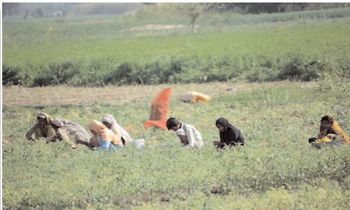
FAISALABAD: Farmer family busy in their routine work in a field.

The session concluded with a collective thought of fostering a collaborative work environment, and promoting gender partnership through equity and inclusion within workplaces across Pakistan. NBP remains committed to empowering women, enhancing their participation in the workforce, and strengthening their role in a progressive society.