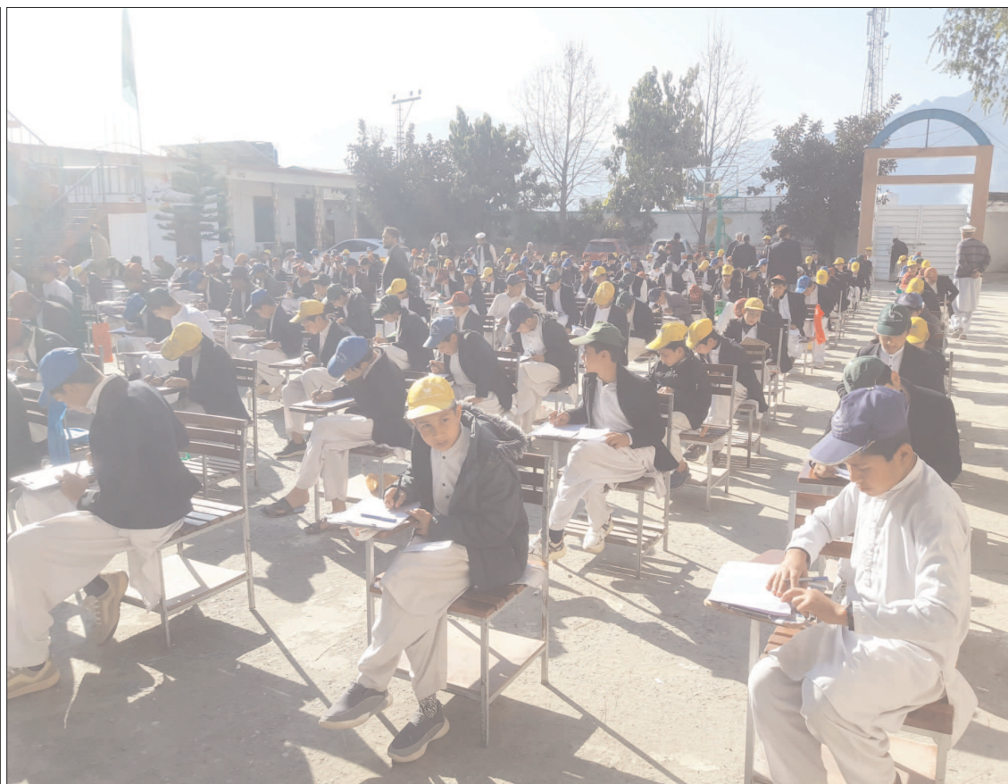
LOWER DIR: Students of a public sector high school attempt their annual exam paper on a sunny day at Talash here on Friday. Schools' internal exams are in progress these days.

As we celebrate International Women's Day under the theme "Accelerate Action," let us commit to transforming words into impactful change. True progress lies in creating opportunities, amplifying voices, and ensuring that every woman has the support and resources to thrive. By working together, we can build a more inclusive and equitable world where women's contributions are acknowledged, valued, and celebrated every day.