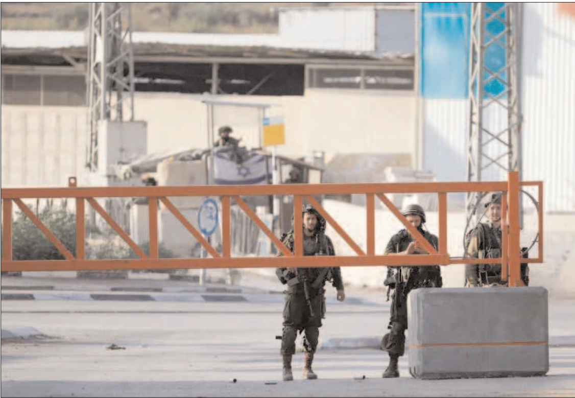
WEST BANK: Israeli troops stand guard at the checkpoint in Deir Sharaf, near Nablus.

The military estimates about 1,000 communist guerrillas remain after decades of battle setbacks, surrenders and factional fighting. Peace talks brokered by Norway collapsed under previous President Rodrigo Duterte after both sides accused the other of continuing deadly attacks despite the negotiations.