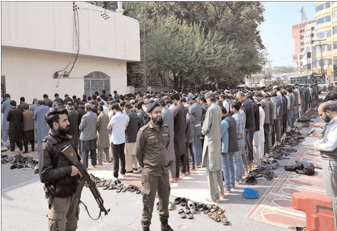
LAHORE: People offer Friday prayer on the first friday of Ramadan ul mubarak while security personnels stand alert at Shimla Pahari Chowk.