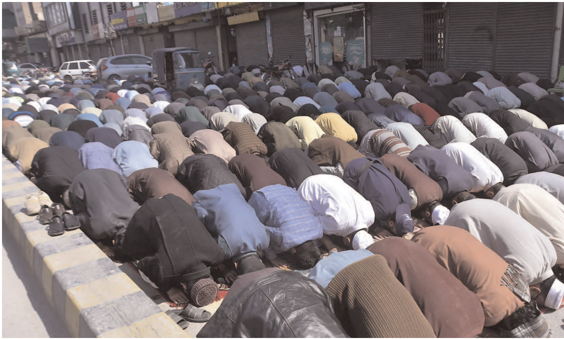
PESHAWAR: Faithfuls offering first Friday prayer during the holy month of Ramadan.

172(3) of the Constitution of Pakistan. Discussions also covered aspects of the Petroleum Policy 2012, and rights related to federal excise duty and windfall levy on crude oil. Chief Secretary Shahab Ali Shah directed the authorities of the Energy and Power Department to develop well-structured proposals and recommendations for consideration by the Federal Government, ensuring that Khyber Pakhtunkhwa's constitutional entitlements are effectively represented.