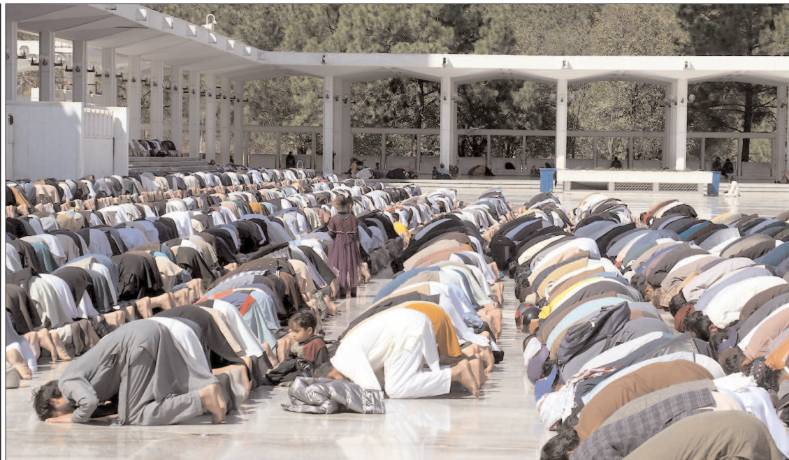
ISLAMABAD: A large number of faithful offering first Jumma prayers during the holy month of Ramadan-ul-Mubarak.