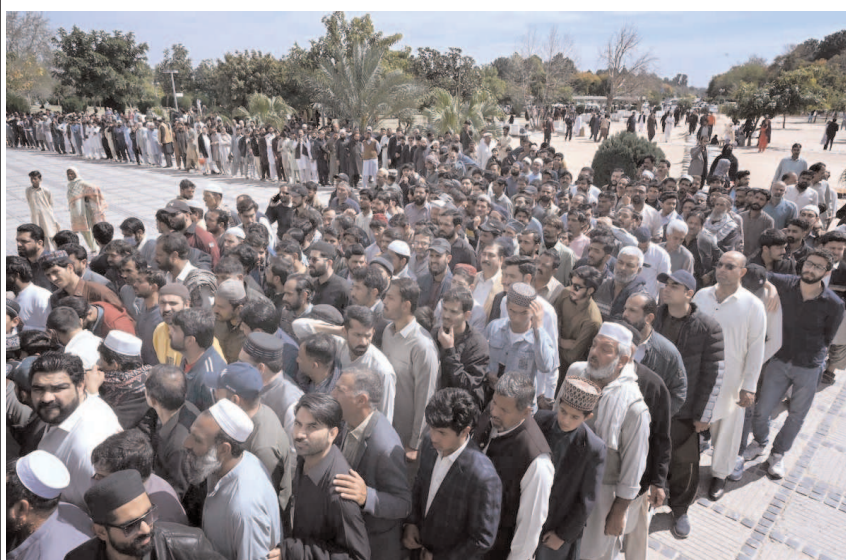
ISLAMABAD: A large number of faithful stand in a queue to enter Faisal Masjid for Namaz-e-Jumma (Friday Prayer) during the holy fasting month of Ramzan-ul-Mubarak.

Their advocacy continues to inspire a global movement, proving that even the youngest voices can resonate across borders in the fight for justice and humanity.