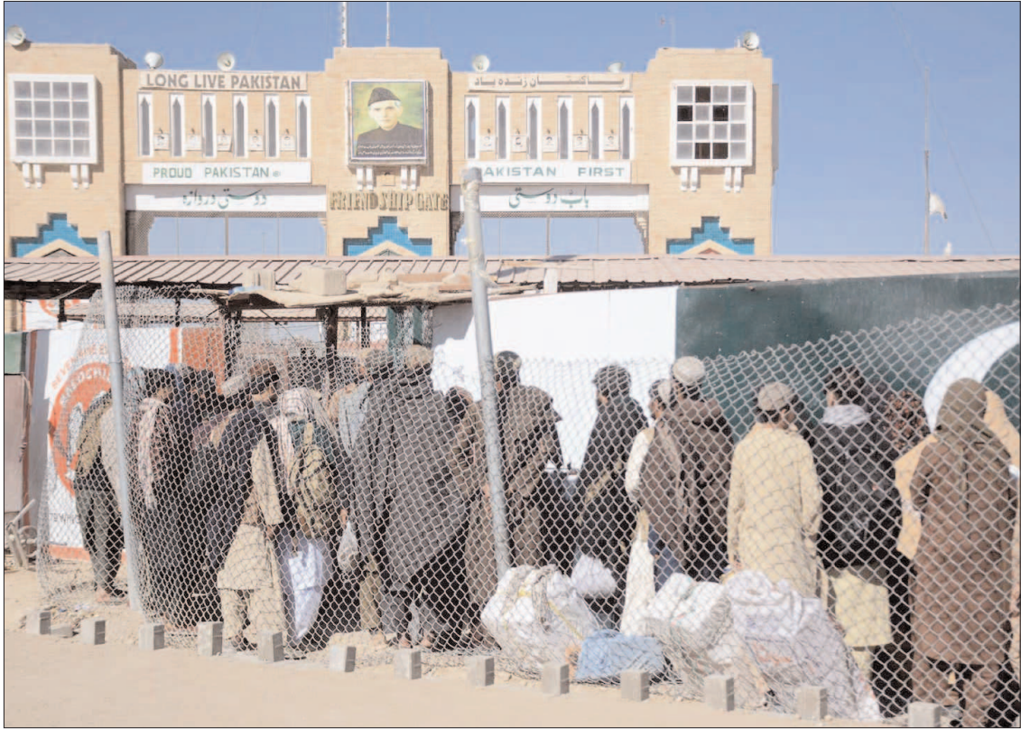
QUETTA: Afghan citizens going back to country via Chaman Border.