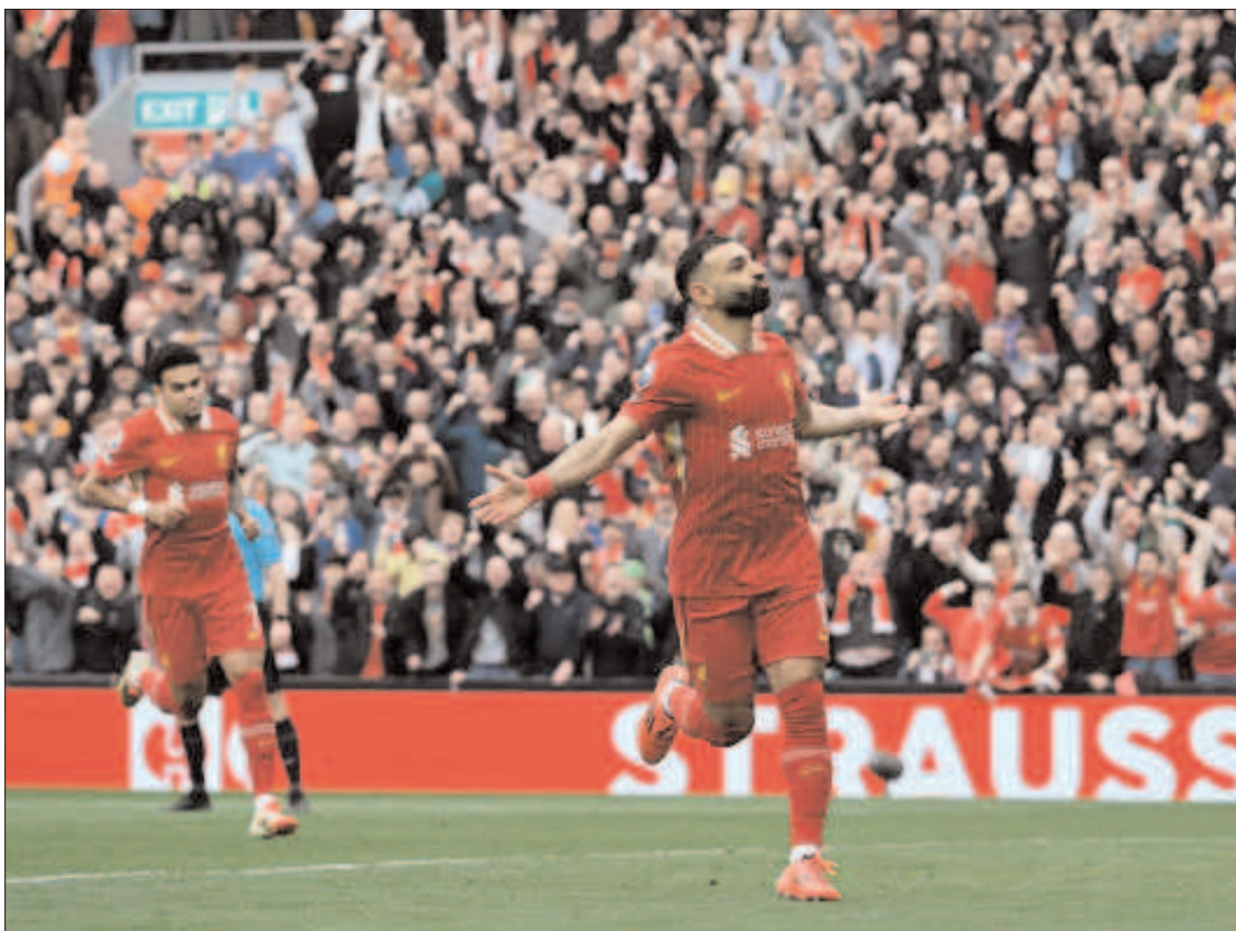
LIVERPOOL: Mohamed Salah of Liverpool celebrates scoring his team's third goal during the Premier League match between Liverpool FC and Southampton FC.

Fast bowler Matt Henry is racing against time to recover for the final after he landed awkwardly on his right shoulder while fielding in the semi-final. "Matt's going to have a bowl just to see how he is," said Santner. "Yeah and then I guess we'll make a call after that." New Zealand will be looking to win the tournament for the second time, having done so in 2000 when they beat India in the final.