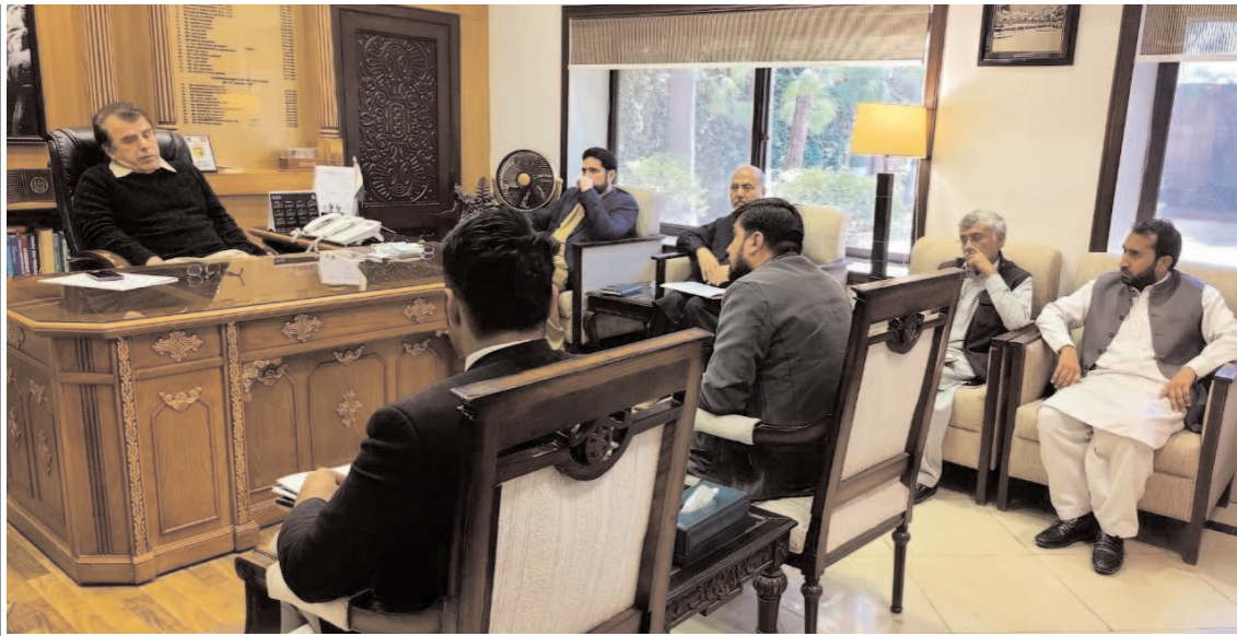
PESHAWAR: Commissioner Peshawar Division Riaz Khan Mehsud chairing a meeting about removing of encroachments from Board Bazaar.

gender equality in Pakistan. Governor Kundi stressed the need for more effective initiatives for women's development and welfare in Khyber Pakhtunkhwa to ensure equal opportunities in all sectors. He reaffirmed that the Governor House Peshawar will continue its efforts to protect women's rights, striving to create a society where women can confidently utilize their talents and contribute to the country's progress.