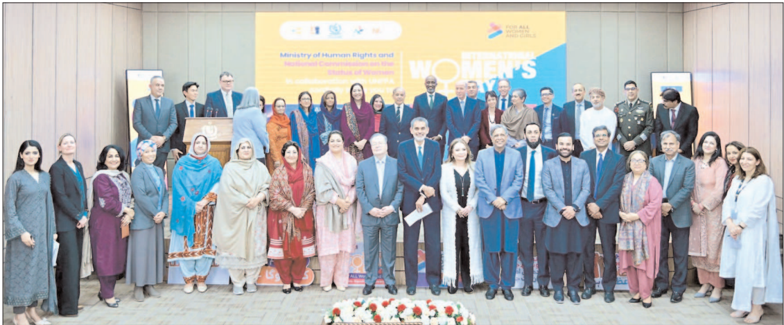
ISLAMABAD: Prime Minister Shehbaz Sharif in a group photo with participants during International Women's Day ceremony.