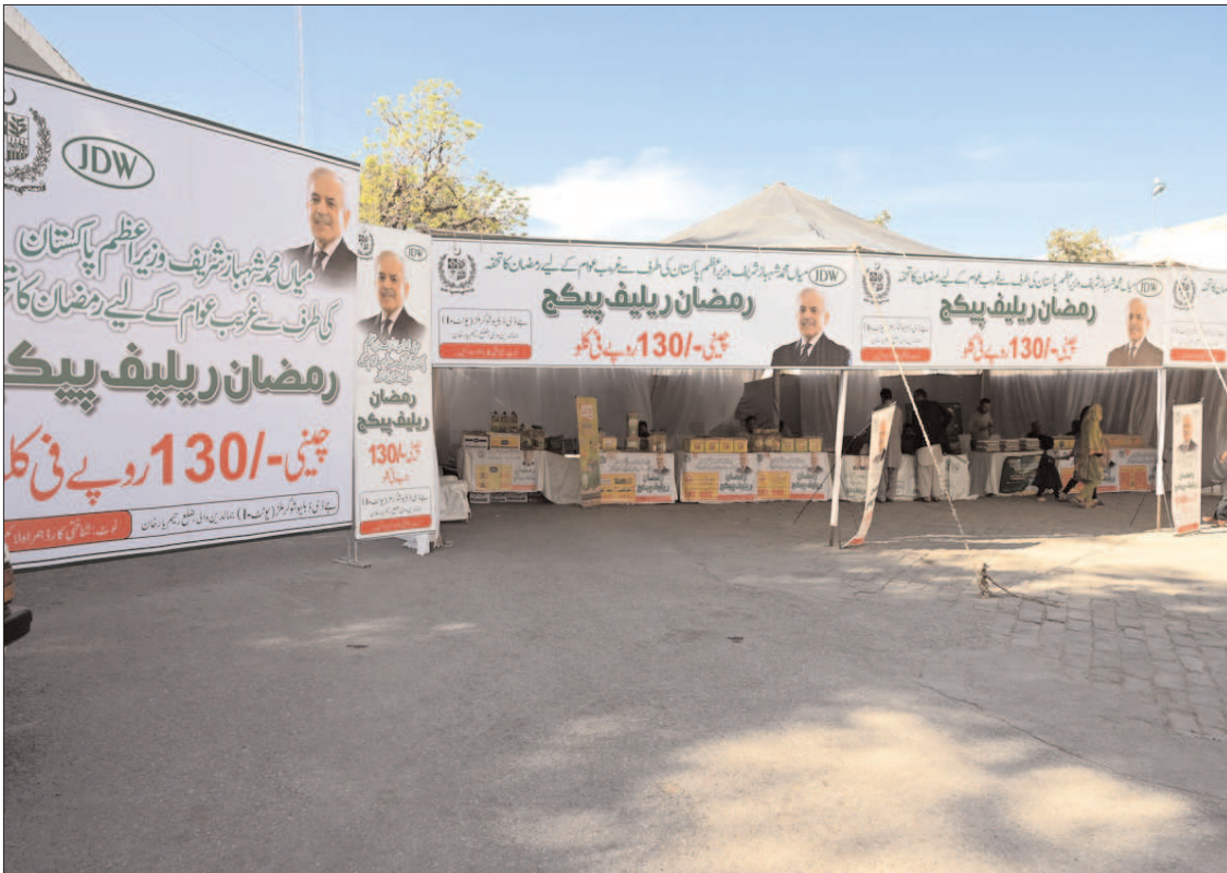
ISLAMABAD: A view of Ramzan Relief Package Sugar stall in sasta Ramzan Bazar G-6 in the Federal Capital.