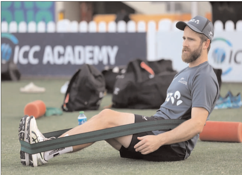
DUBAI: Kane Williamson tunes up for the Champions Trophy final.

The Eagles have won nine of their last 11 games in all competitions and climb to 11th. Brighton boosted their own Champions League hopes courtesy of Joao Pedro's 98th-minute penalty to beat Fulham 2-1. Raul Jimenez's spectacular strike opened the scoring for Fulham, but Jean Paul van Hecke levelled before half-time. Pedro's spot-kick lifts the Seagulls to sixth and within one point of City. Aston Villa travel to Brentford and Wolves host Everton on Saturday's later kick-offs.