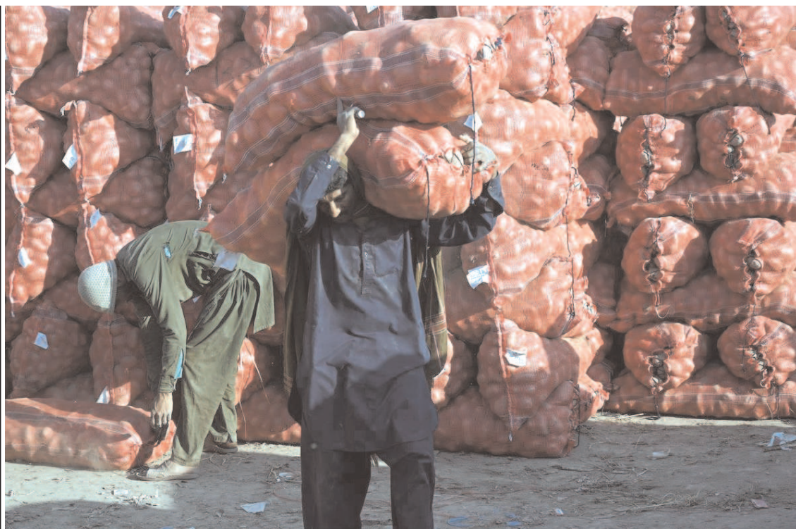
LAHORE: Laborers loading sacks of potatoes and onions on delivery vehicles at vegetable market.

While the government has been claiming improvements, the IMF has put on record that power sector circular debt at Rs2.6tr has remained broadly flat since October 2023 after some slippage earlier in the fiscal year (due largely to lower-than expected recoveries following the large annual tariff rebasing in July 2023).