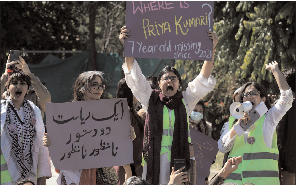
ISLAMABAD: Activates of Aurat Foundation participates in International Women's Day rally outside NPC.