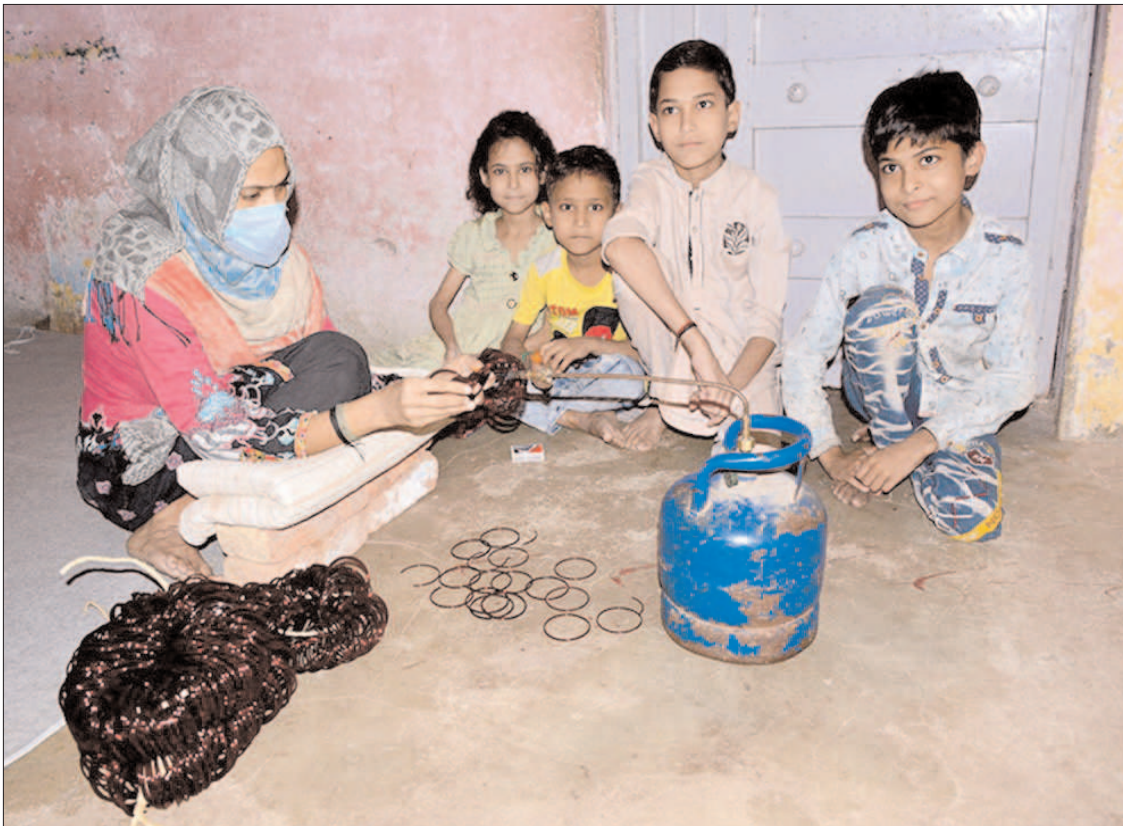
HYDERABAD: A worker woman joints bangles with the help of cylinder gas at her home to earn for livelihood.