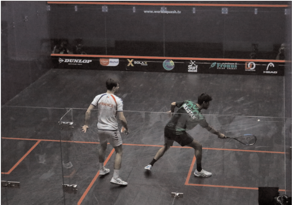
KARACHI: Players of Pakistan and France in action during the first round of Under-23 World Squash Championship being played in Karachi