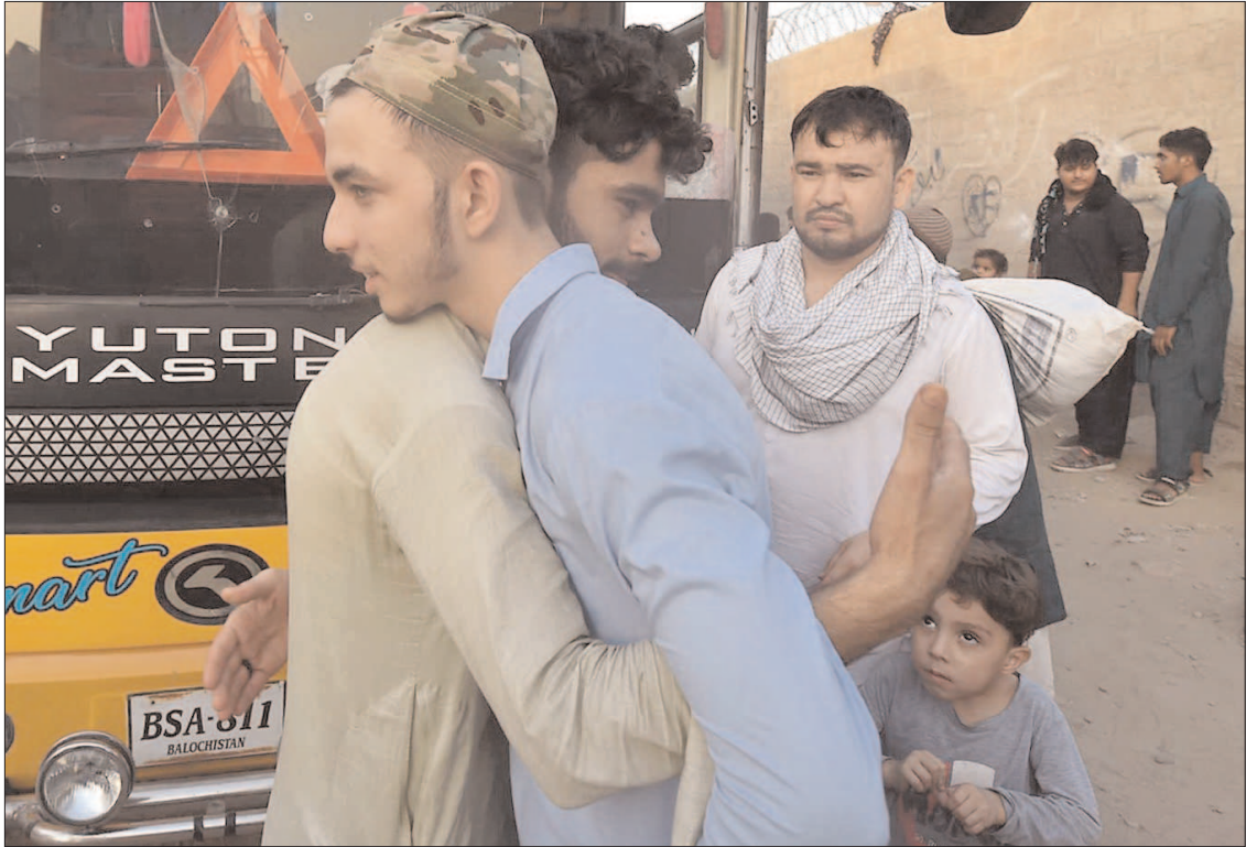
KARACHI: Afghan national going back to their country from Sohrab Goth.