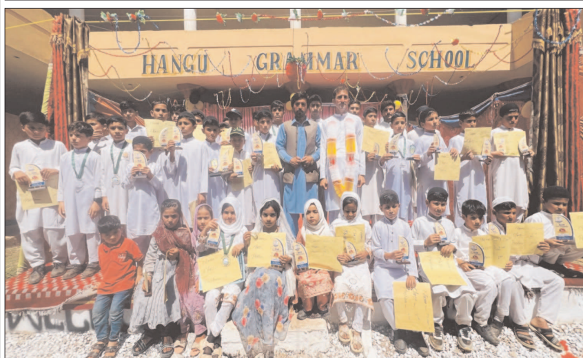
HANGU: A group photo of position-holder students with principal on the occasion of annual prize distribution ceremony at Hangu Grammar School.