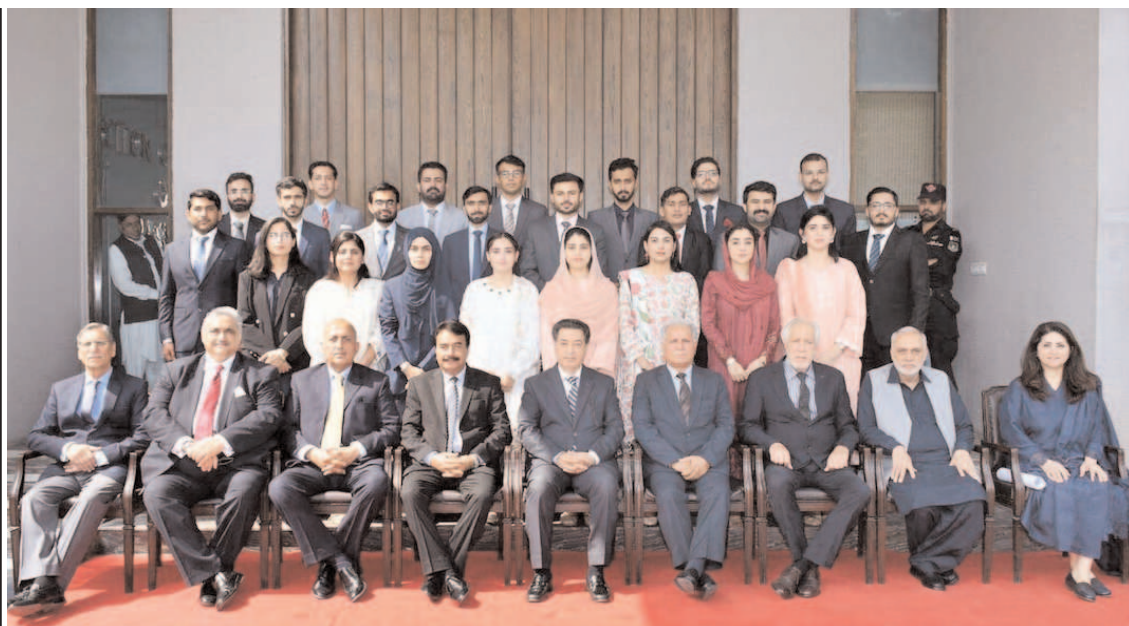
ISLAMABAD: Chief Election Commissioner Sikandar Sultan Raja officers of Service Training of Election Officers (3rd Batch) at ECP Secretariat.

They proposed a series of key recommendations aimed at strengthening national security, including the development of a strong counter-narrative to terrorism.