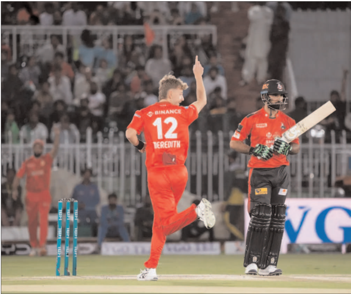
RAWALPINDI: Riley Meredith had Fakhar Zaman caught behind in his first over.

LONDON (APP): Former England fast bowler James Anderson has been awarded a knighthood in ex-Prime Minister Rishi Sunak's resignation honours list. Anderson retired from Test cricket in July 2024 having taken 704 wickets, the most by a fast bowler in the history of the five-day format. The 42-year-old is still playing for Lancashire but has missed the start of the English County Championship season with a calf problem. The resignation honours list is a tradition that gives outgoing Prime Ministers the opportunity to nominate people for honours. Only spin bowling stars Muttiah Muralitharan (800) and Shane Warne (708) took more Test wickets than Anderson. He made his one-day international debut for England against Australia in December 2002 and his Test bow came in May 2003. Anderson finished his international career having played 188 Tests and 194 ODIs. He was nudged into international retirement last year by England captain Ben Stokes and head coach Brendon McCullum. However, Anderson thinks he could still be playing for another three years. He has signed a one-year deal with Lancashire for the County Championship and Vitality Blast, saying: "I am not ruling out playing for another one, two or three years. We'll see how it goes."