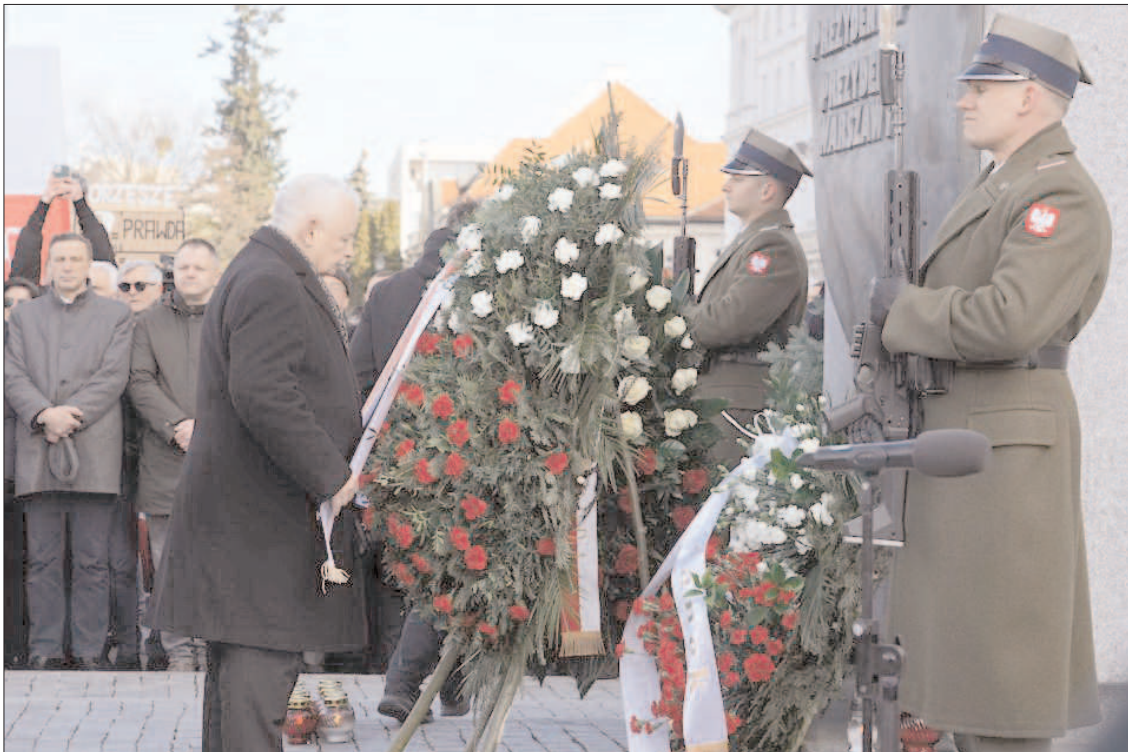
WARSAW: Poland's conservative party leader Jaroslaw Kaczynski attending a memorial service in Poland, during 15th anniversary of plane crash in Russia that killed his brother President Lech Kaczynski.