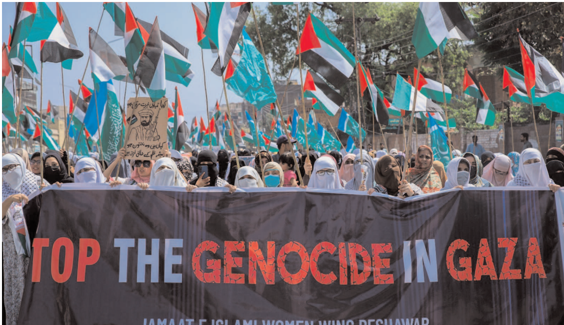
PESHAWAR: Female activities of Jamaat-e-Islami leading a protest demonstration against Israeli atrocities in Gaza.