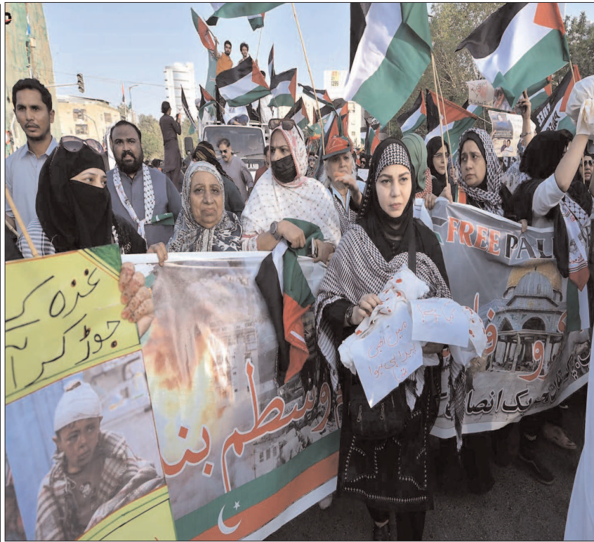
KARACHI: Activists of PTI solidarity rally with palestine peoples.

The question paper scanning App used by the board suddenly collapsed, due to which the bundles of papers had to be opened without scanning at the examination centers. Under normal circumstances, before opening the bundles of question papers, specific codes are scanned by the Distributing Inspector (DI), resident inspector and superintendent to ensure the security of the papers.