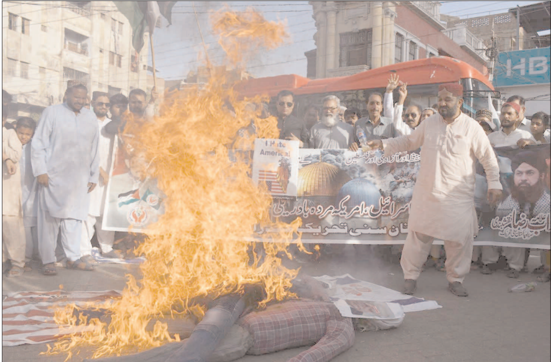
HYDERABAD: Supporters of Sunni Tehreek burning effigy of Israeli PM during a protest against attacks on Gaza.