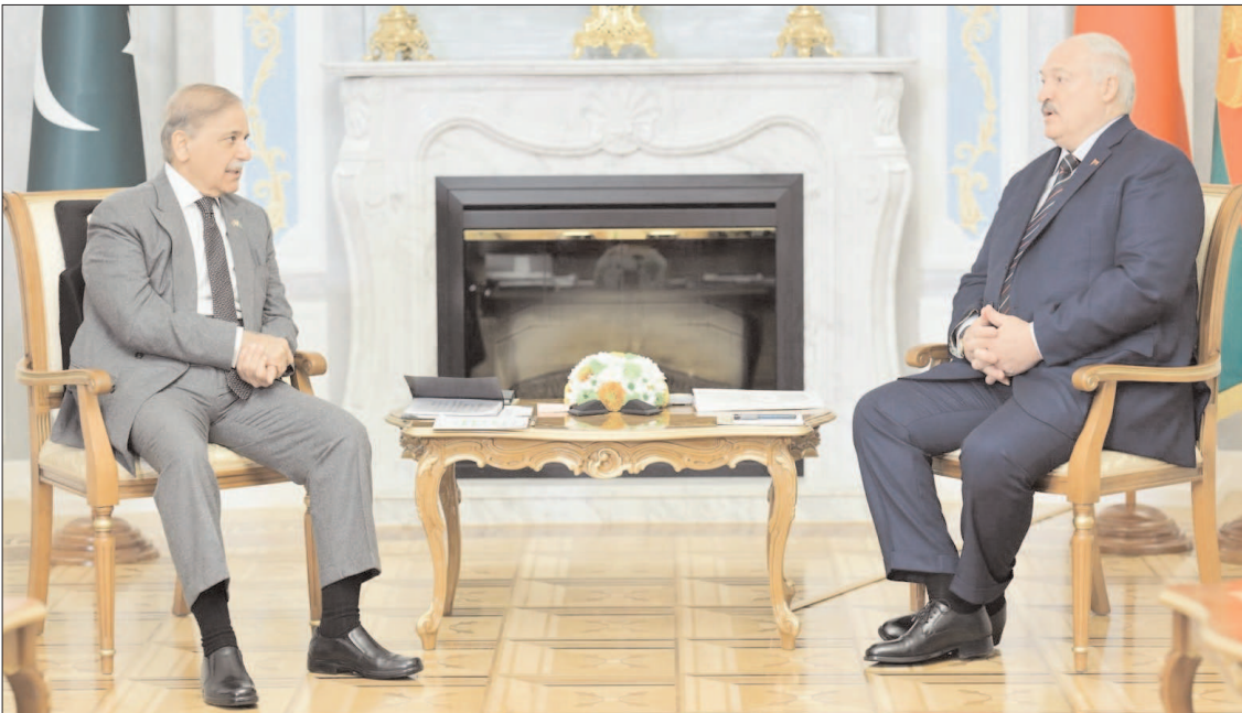
MINSK: President of Belarus, Aleksandr Lukashenko and Prime Minister Shehbaz Sharif in a bilateral meeting at Independence Palace of Belarus.