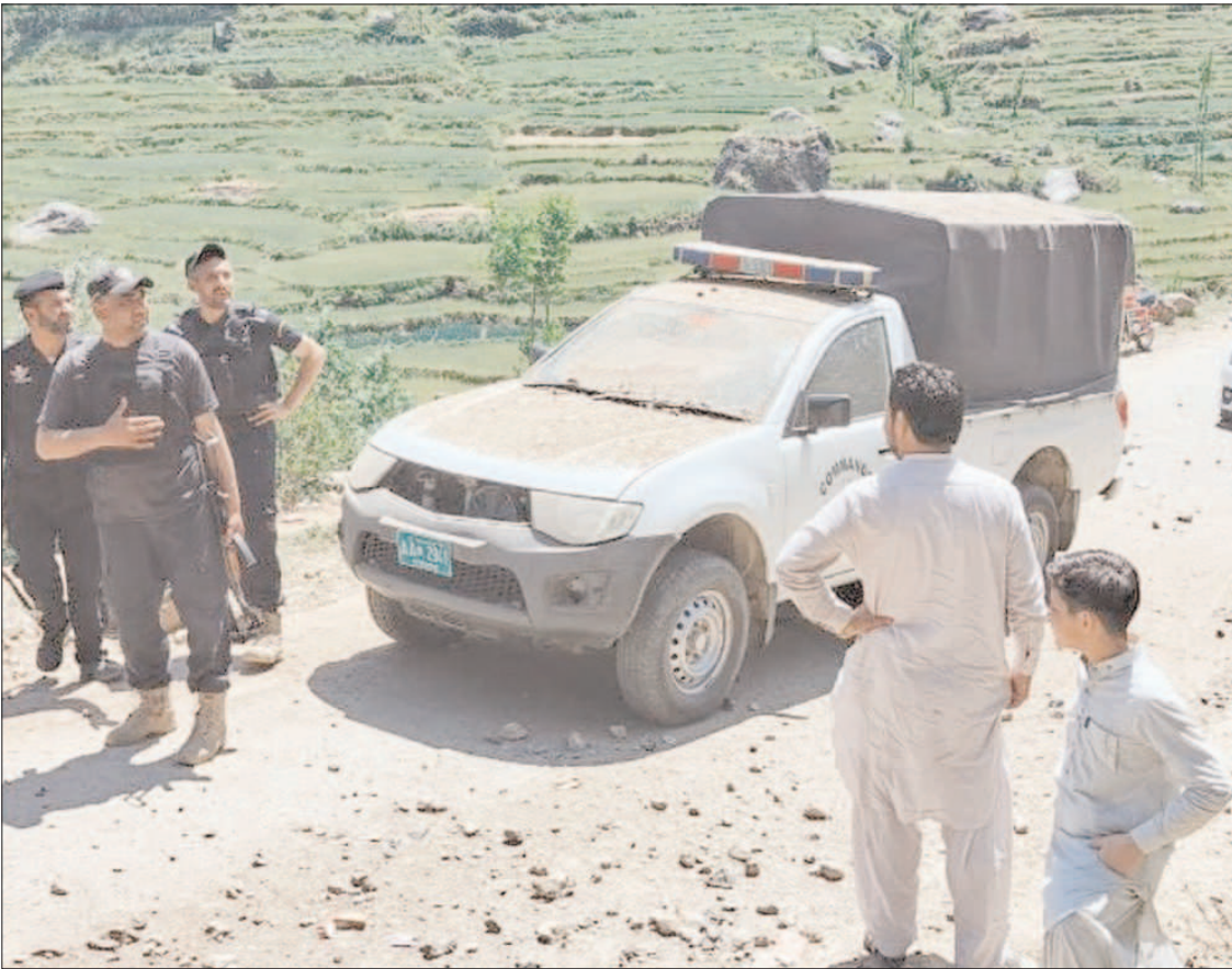
SHANGLA: Officials inspecting the site and vehicles after attack on convoy of DPO.

"We've been very clear what Iran is never going to have a nuclear weapon, and I think that's what led to this meeting," US Secretary of State Marco Rubio said on Thursday. Iran and its supreme leader, Ayatollah Ali Khamenei, have emphasised that the US cannot be trusted and Iran won't sit down with US officials directly