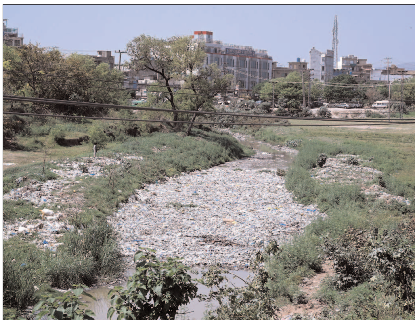
ISLAMABAD: A view of garbage accumulated in the nullah near Expressway, obstructing the water flow and posing a risk of flooding, an issue that requires urgent attention and cleanup by the concerned authorities.

Citing an example from the Sindh Province, Dr. Shazia Sobia Aslam Soomro underscored the value of collaborative efforts among schools, government departments, and non-governmental organizations (NGOs) to address the exploitation of street children by drug traffickers, reduce the number of Out-of-School Children, and provide vocational training through well-designed intervention programs.