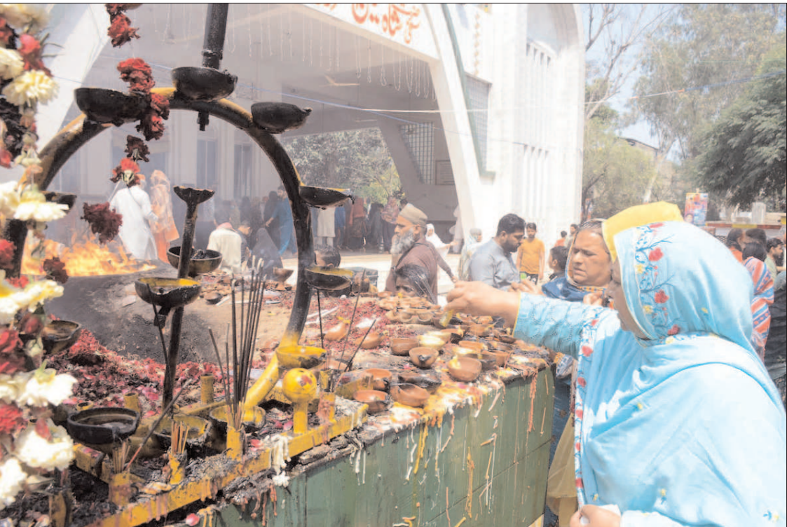
LAHORE: Devotees light oil lamps at the shrine, creating a spiritual ambiance during the Urs celebrations of the Sufi saint Madhu Lal Hussain at Baghbanpura.

This exploration has significant implications for mental health interventions in refugee camps. By assessing the use of narrative therapy in culturally diverse, transient settings, I aim to show how adaptive mental health strategies can bridge gaps in trauma recovery. In contexts where traditional mental health services are scarce or stigmatised, narrative therapy offers a practical, culturally aligned solution. It not only addresses personal trauma but also tackles collective struggles related to discrimination and marginalisation, creating space for individual and community healing. Disclaimer: Permission was obtained before sharing these stories to ensure the privacy and dignity of all participants. The names/description has been altered to maintain confidentiality.