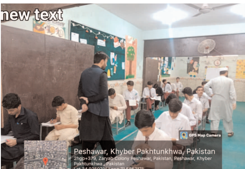
PESHAWAR: Assistant Commissioner visiting examination center in Zaryab Colony to oversee ongoing matriculation examinations.

At our core, we are interconnected. True progress be it personal or societal depends not on standing apart, but on standing together. The challenge of our time is to bridge the gap between our digital connections and our human ones, ensuring that the tools of modernity serve to unite rather than divide. Only then can we reverse the tide of alienation and build a future worth believing in.