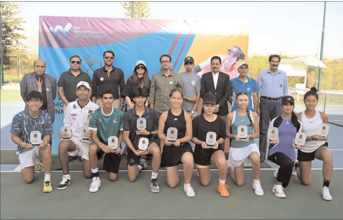
ISLAMABAD: Aisam UL Haq Qureshi President-PTF in a group photograph with int'l players during the closing ceremony of the ITF Pakistan Zainab Ali Naqvi Memorial World Juniors Tennis C'ship 2025.

Rizwan added, "I regret not pursuing education. My focus has always been on cricket. I admit my English isn't great, if you want perfect English, I'll become a professor. Misbah-ul-Haq's decision to play me as an opener during his tenure as head coach was absolutely right." Looking ahead to the match, Rizwan praised the opposition, saying, "Karachi Kings is a strong team with excellent players. I have love for both the Karachi Kings and the city of Karachi. Multan Sultans also have quality players—ultimately, team performance depends on the right combination."