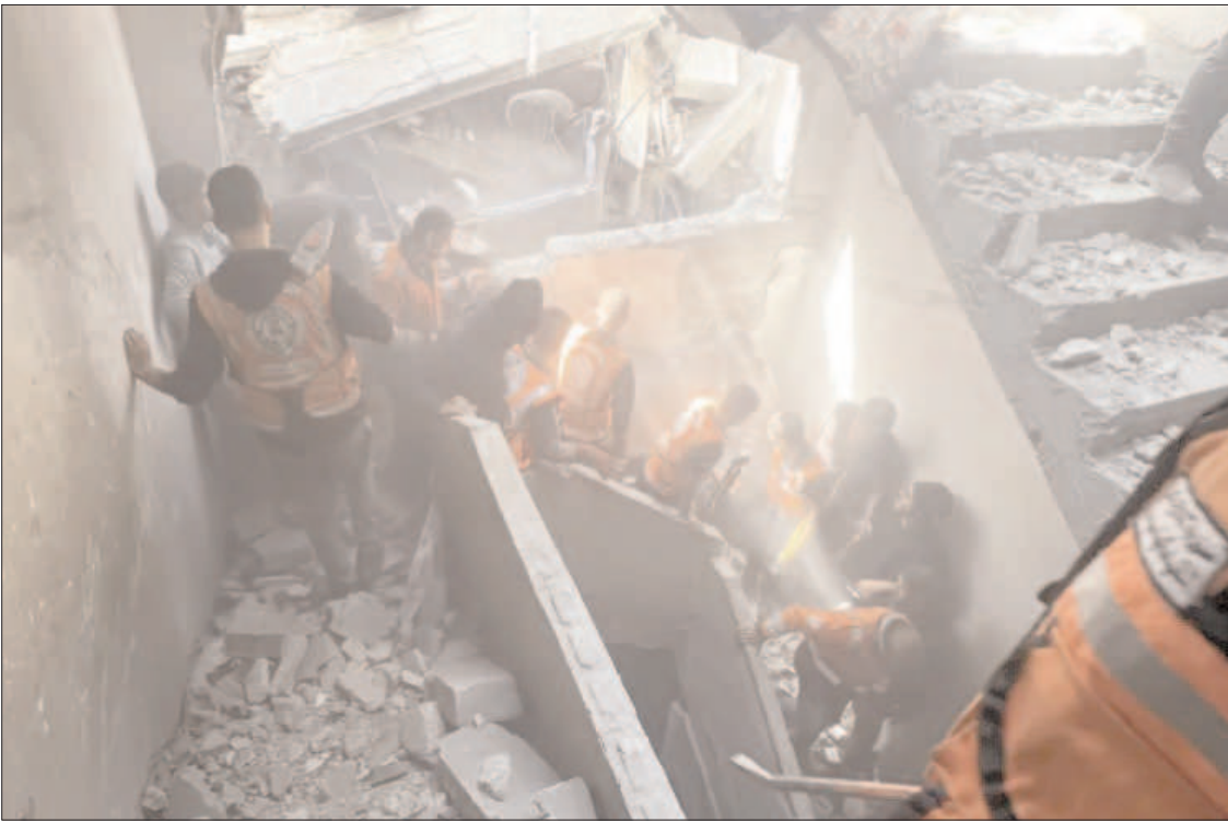
GAZA CITY: Civil defence teams conducting a search and rescue operation amid the rubble of a collapsed building following an Israeli attack on the Shujayea neighbourhood.