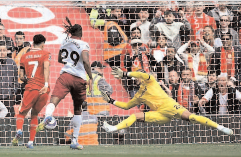
Luis Diaz scored his 11th league goal of the season to put Liverpool ahead.

There was still more drama to come as Nicolas Fullkrug hit the bar for West Ham in stoppage time. But Liverpool held out to take another step towards the title in Arne Slot's first season in charge.