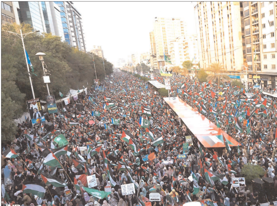
KARACHI: Activists of Jamaat-e-Islami holding Gaza Solidarity March in Karachi against Israel's military aggression against Palestinians

The national economy is all set to take off under the "Uraan Pakistan" initiative, he said while giving credit to the prime minister for taking strategic measures to reinvigorate the economy.