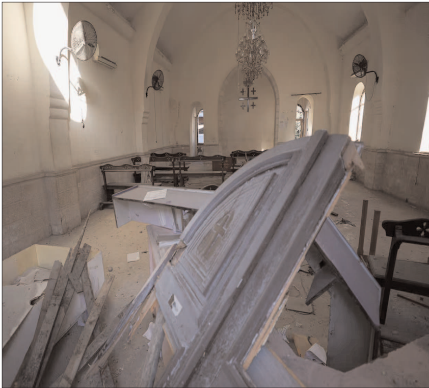
GAZA CITY: A view shows a damaged church at a site where medics said two Israeli missiles hit a building inside the Al-Ahli Arab Baptist Hospital, shortly after patients were evacuated following a call from someone who identified himself with Israeli security, in Gaza City on Sunday.