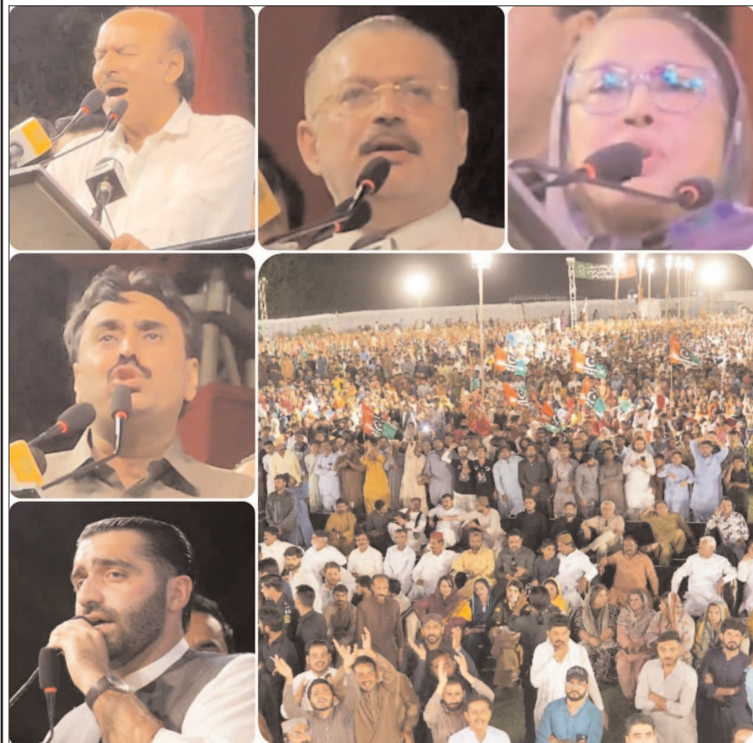
HYDERABAD: PPP leaders addressing public meeting at Rawal House Tando Jam.