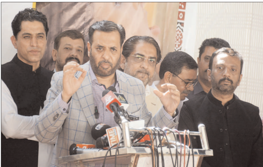
KARACHI: The Federal Minister for National Health Services, Regulation and Coordination Syed Mustaf Kamal talking to media persons at Polio office.

He lamented that, despite ceasefire agreements, violence in Gaza persists, an ongoing tragedy he described as a stain on the conscience of humanity. He stressed that it is the duty of the United Nations and the Security Council to play an active role in restoring peace wherever injustice prevails.