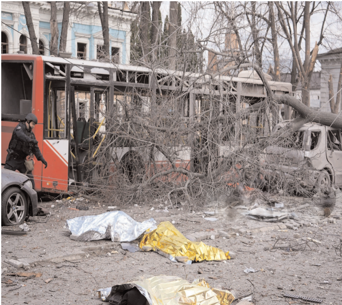
SUMY, UKRAINE: Rescuers work at the site of Russian ballistic strike next to bodies covered in foil blankets on Sunday in Sumy, Ukraine.

assisting with the Manchester terror plot, in which his suicide bomber brother Salman Abedi killed 22 people by detonating a bomb hidden in a knapsack as fans were leaving the Grande concert. In addition to those killed, more than 260 people were wounded and hundreds of others were left with psychological injuries. Counterterrorism officials are leading the investigation into the attack, with assistance from local police.