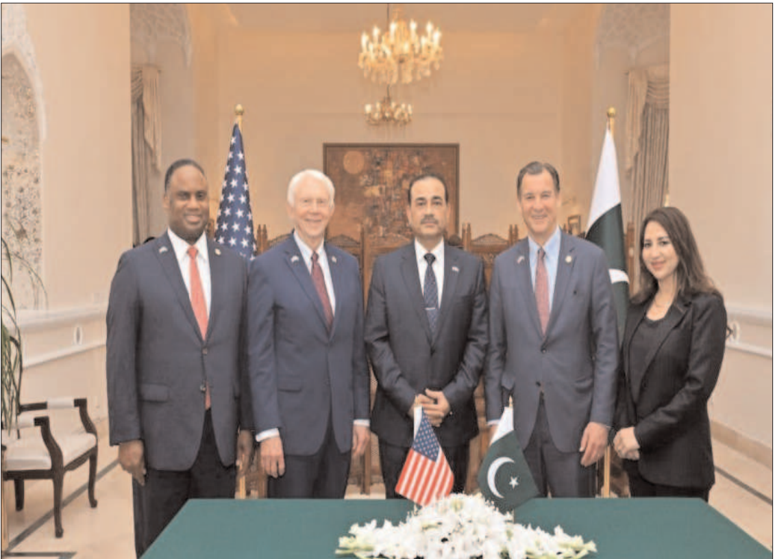
RAWALPINDI: US Congress delegation called on Chief of Army Staff General Syed Asim Munir.

Three terrorists killed PESHAWAR (APP): In a joint operation conducted by the police and a local peace committee in Lakki Marwat, three terrorists were killed. According to police on Sunday, the exchange of fire took place in the forest area of Khankhel Manduzai, located within the jurisdiction of Tajori and Bargai police stations. The armed clash occurred when a group of around 25 terrorists was moving from one location to another.