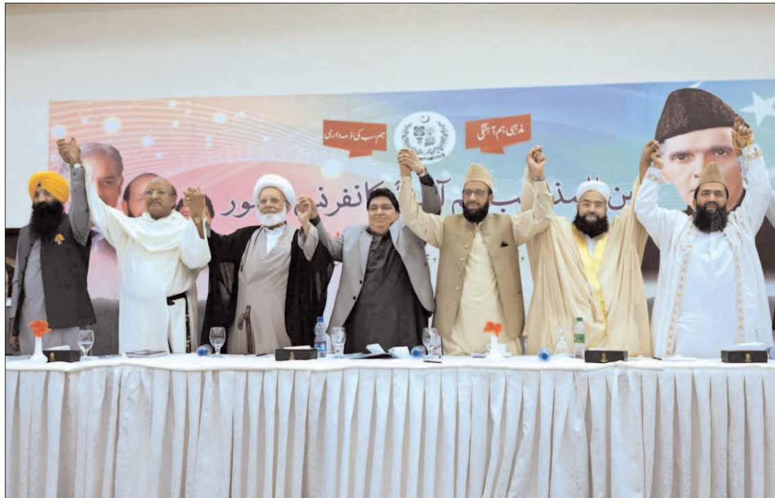
LAHORE: Federal Minister for Religious Affairs Sardar Muhammad Yousuf, Minister of State Kehildas Kohistani, Allama Tahir Ashrafi, Allama Azad Kabir, Provincial Minister Ramesh Singh, Allama Ghulam Muhammad Akbar, and other dignitaries express solidarity by forming a hand chain during the Interfaith Harmony Conference held at a local hotel.

"The authorities must ensure that every grain of wheat is purchased at a fair price," he stressed, adding that timely intervention is crucial to avoid long-term setbacks for the farming community. He also called for an immediate and practical policy framework to safeguard farmers' interests and reinvigorate the agricultural sector, which remains the backbone of Pakistan's economy.