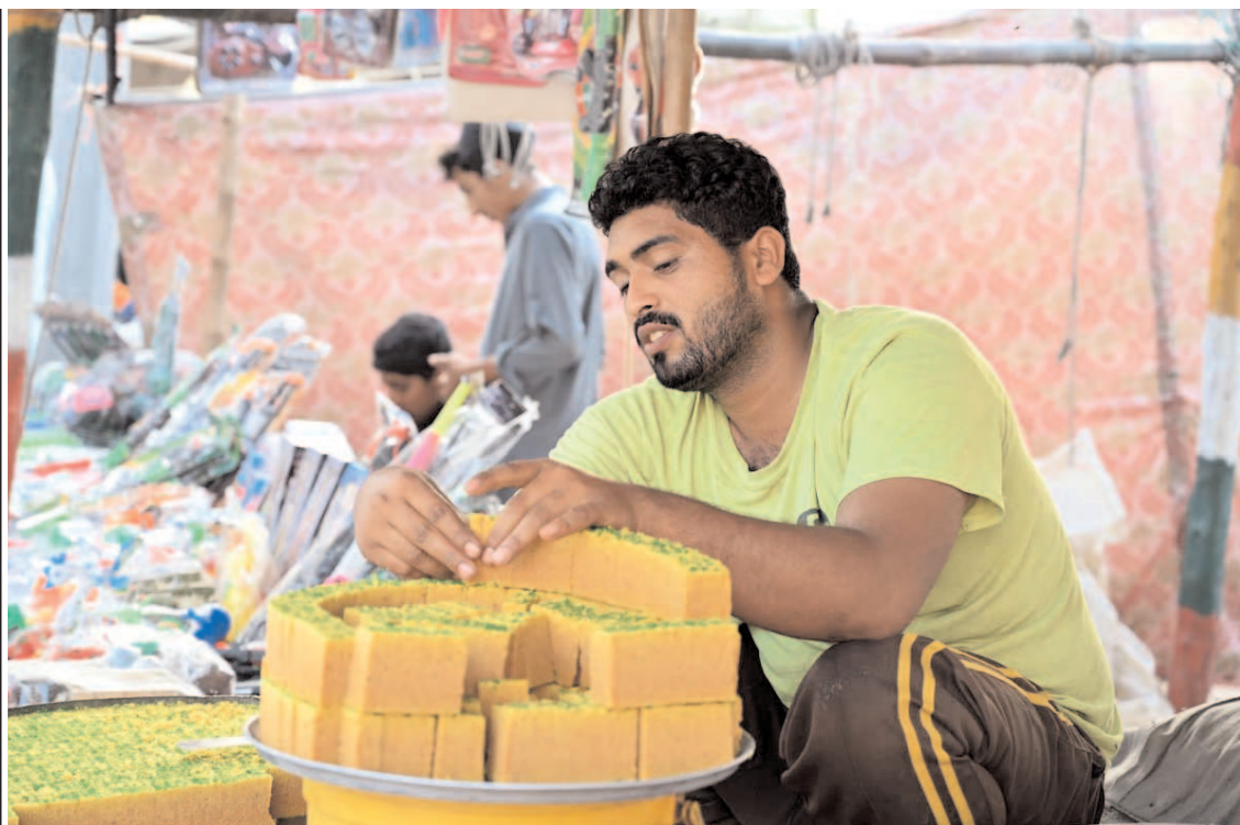
SIALKOT: A vendor arranging and selling traditional sweet to attract customers.

Shinwari said Pakistan is a lucrative destination for foreign investment and stressed the need of fully capitalizing potentials and taking benefits from each other's experiences and advantages to improve the mutual trade and economic trade relations between the two countries.