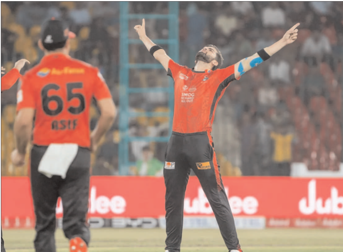
KARACHI: Shaheen Shah Afridi struck twice in his first over.

NEW DELHI (INP): Punjab Kings (PBKS) fast bowler Lockie Ferguson has been all but ruled out of the remainder of IPL 2025, their fast-bowling coach James Hopes has said. Ferguson had hobbled off the field in their previous game, against Sunrisers Hyderabad (SRH) on Saturday after bowling just two balls. "Ferguson is out indefinitely, and the chances of us getting him back by the end of the tournament are very slim, I would have thought," Hopes said ahead of PBKS' match against Kolkata Knight Riders (KKR) in Mullanpur on Tuesday. "I think he has sustained a pretty serious injury." Ferguson had pulled up after the second delivery of the sixth over against SRH and was seen holding the side of his left leg just below the hip. He had to leave the field after consultation with the physio and did not return to bowl again as SRH pulled off the second-highest successful chase in IPL history with eight wickets in hand.