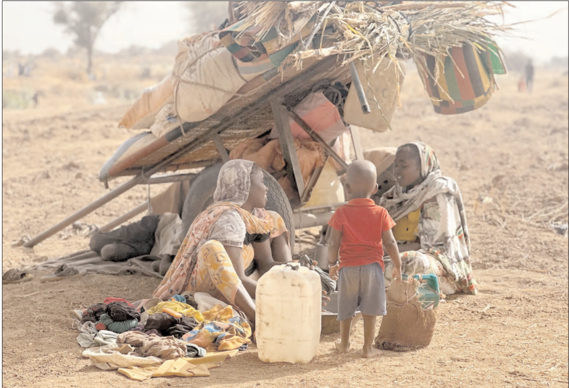
DARFUR: Displaced Sudanese gathered at a camp near the town of Tawila.