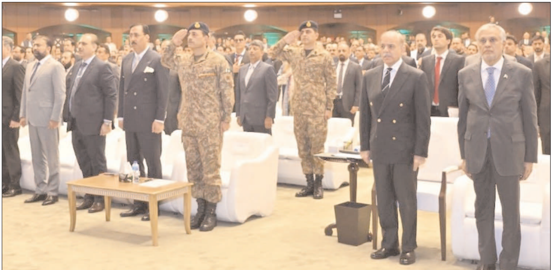
ISLAMABAD: Prime Minister Shehbaz Sharif and Chief of the Army Staff, General Asim Munir attending Overseas Pakistanis Convention.