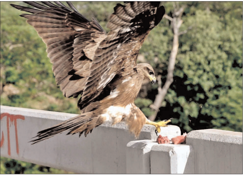
ISLAMABAD: A kite picks pieces of meat thrown by people as an act of mercy at Chak Shahzad area in the Federal Capital.

In conclusion, Deputy Chairman Senate urged EU member states to take a firm stance against the ongoing atrocities and human rights violations in Palestine and occupied Kashmir. He stressed that a just resolution of these issues is essential for lasting peace and stability. He expressed confidence that the EU delegation's visit would serve to further deepen bilateral cooperation, mutual understanding, and strategic partnership.