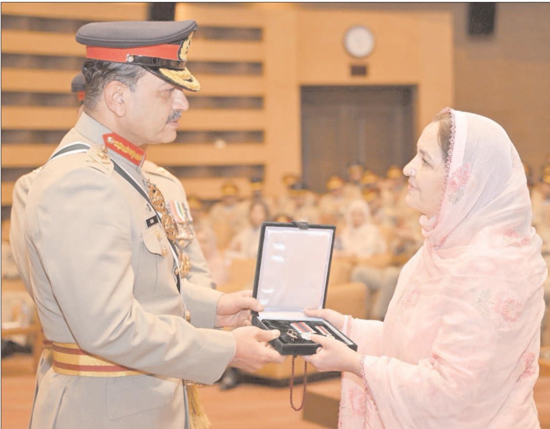
RAWALPINDI: Chief of Army Staff, General Asim Munir conferring military honour to the family member of a military official.