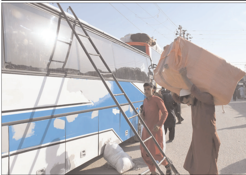
KARACHI: An Afghan refugee loading his belongings on the rooftop of a bus as they leave for their homeland, Afghanistan.

In a political overture to the legal community, the KP chief minister announced a Rs50 million grant for the Lahore High Court Bar Association, asserting that Khyber Pakhtunkhwa was among the country's wealthiest provinces. "If things continue like this, people will leave this country. Is that the war you want — a war against your people? he questioned.