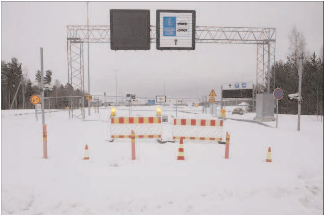
HELSINKI: A view of closed crossing on Finland's border with Russia, in Virolahti.