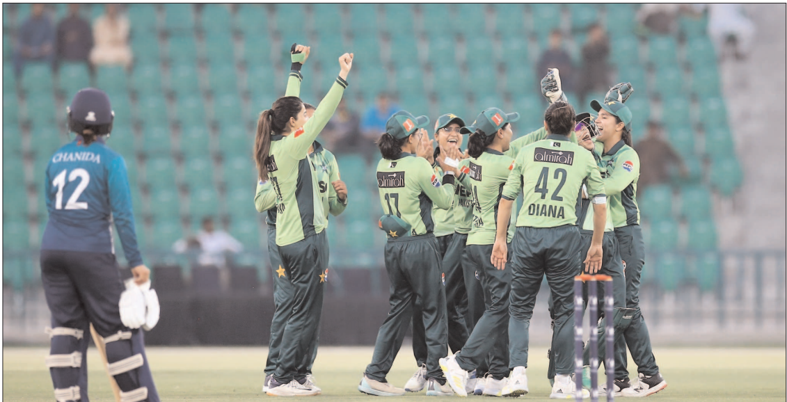
LAHORE: Pakistan team celebrating after beating Thailand by 87 runs to qualify for the Women World Cup.