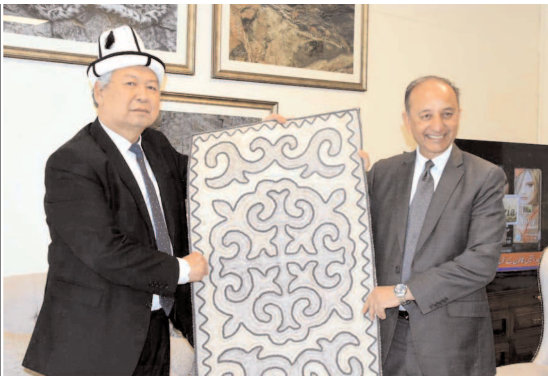
ISLAMABAD: Ambassador of Kyrgyz Avazbek Atakhanov presenting hand-made carpet to Federal Minister for Climate Change and Environmental Coordination Senator Musadik Masood Malik.

Meanwhile, the authorities urge citizens to report violations via helpline or in-person complaints. Inspections are expected to expand to other sectors in the coming weeks. Data from the district office shows over 150 fines issued since January for pricing-related offenses, signaling a zero-tolerance approach.