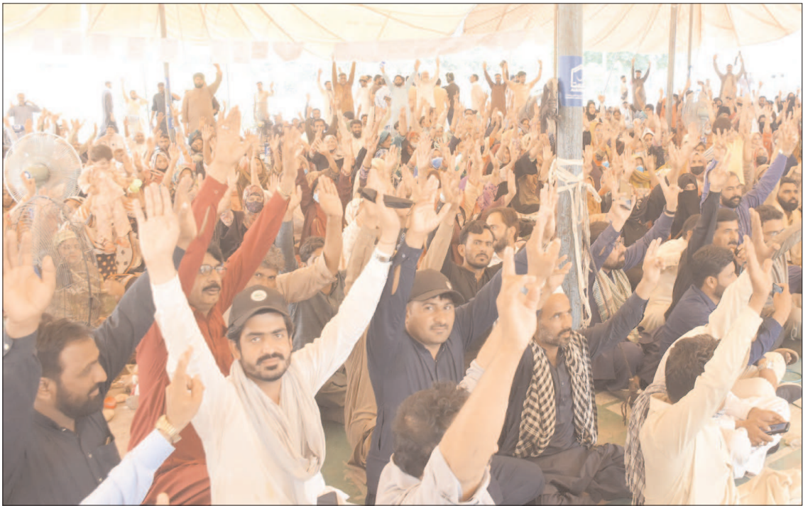
LAHORE: Activists of Grand Health Alliance and APCA holding a protest in favour of demands at Mall Road.