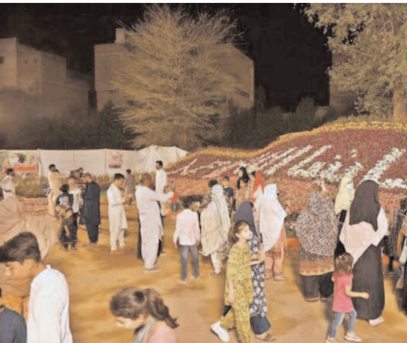
SARGODHA: People viewing a variety of flowers at a floral exhibition organized by the PHA.