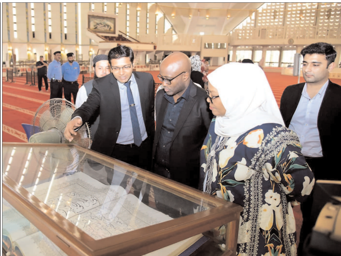
ISLAMABAD: Rwanda Foreign Minister Olivier Nduhugirehe, accompanied by his delegation, visits Faisal Mosque, Pakistan-based Rwandan High Commissioner Ms Fatou Harerimana and senior officials of the Ministry of Foreign Affairs are also presents.

The special repairs of 100 newer locomotives are currently in progress. The official also said that production of 230 ZBK wagons is underway, including 115 Semi-Knocked Down (SKD) ZBK units under the 800 HCW project and 20 Brake Vans (BV) already completed.