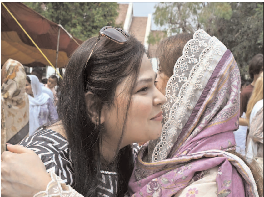
ISLAMABAD: Christian women exchange greetings following Easter Mass and religious rituals at Fatima Church in F-8 in the Federal Capital.