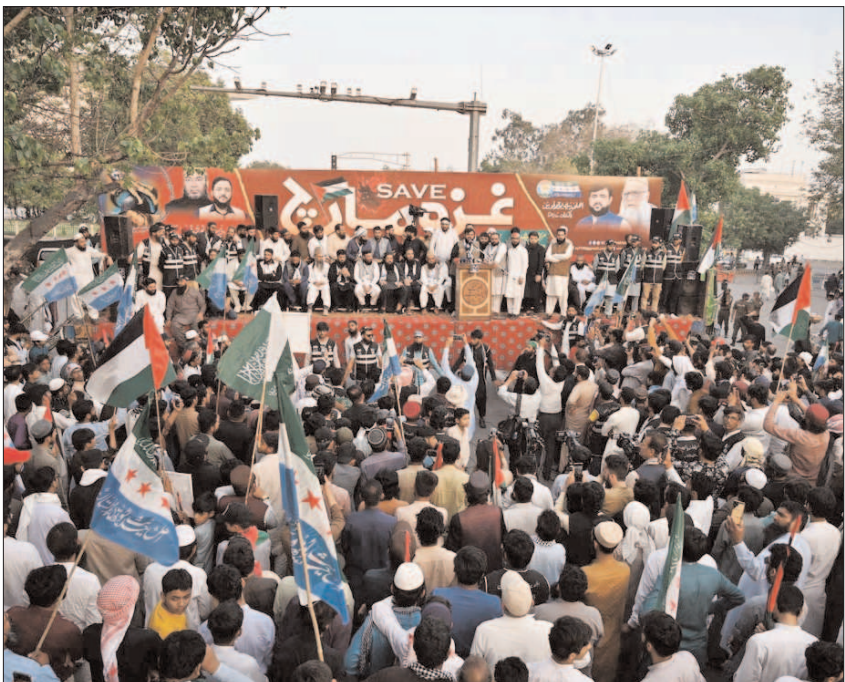
LAHORE: Ahle Hadith Youth Force representative addresses the gathering to express solidarity with the Gaza March at Mall Road.

The first meeting of the committee, chaired by Senior Minister Mariyumi Aurangzeb, was held, during which key decisions were made to implement Chief Minister Maryam Nawaz Sharif's vision for a thriving and modernized film industry in Punjab.