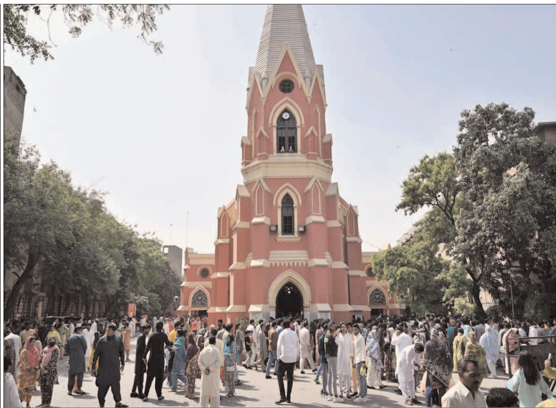
LAHORE: People of the Christian community gather to performing their religious rituals on the occasion of Easter at Don Bosco Church.

During his visit, the minister also inaugurated the newly restored road from Nakoder Chowk to Mirabad in Dina Tehsil, completed as part of local development projects.