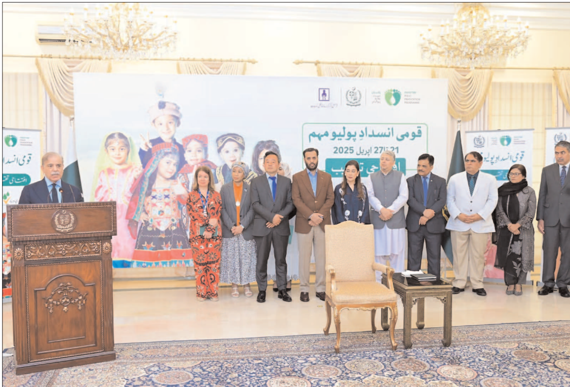
ISLAMABAD: Prime Minister Muhammad Shehbaz Sharif addressing the inaugural ceremony of the National Polio Eradication Campaign.