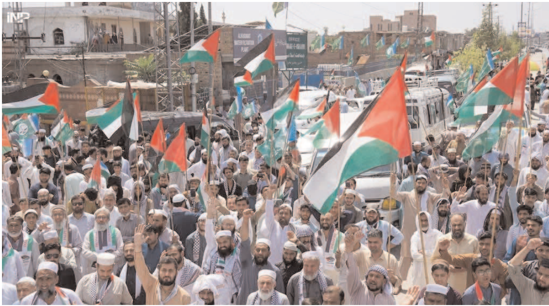
PESHAWAR: Jamaat-e-Islami activists protesting against Israel.

The deteriorating performance of institutions in the province, he said, serves as clear evidence of this claim.