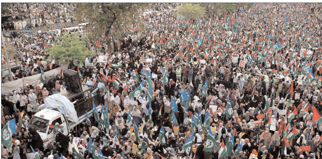
ISLAMABAD: Activists of Jamaat-e-Islami gathered at Islamabad Expressway during Gaza Solidarity March.

The event concluded with a message of peace, inclusivity, and national unity, with the minister reaffirming the government's commitment to standing with minority communities and ensuring their rightful place in Pakistan's journey forward.