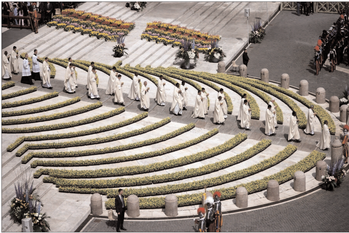
VATICAN CITY: Members of the clergy walk during the Easter Sunday Mass in St. Peter's Square at the Vatican on Sunday.

The Chief Minister concluded by reiterating that all decisions and actions under his administration are being made on merit, in line with Imran Khan's policies. Since taking office, he said, sports events are being held regularly without any reported complaints of bias or unfairness. He urged other departments to maintain the same standards of merit and transparency in their operations.