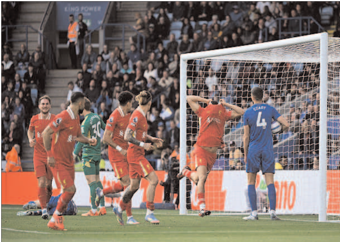
LEICESTER: Trent Alexander-Arnold of Liverpool celebrates scoring his team's first goal during the Premier League match between Leicester City FC and Liverpool FC at The King Power Stadium.

Toss: Bangladesh won the toss and decided to bat first.