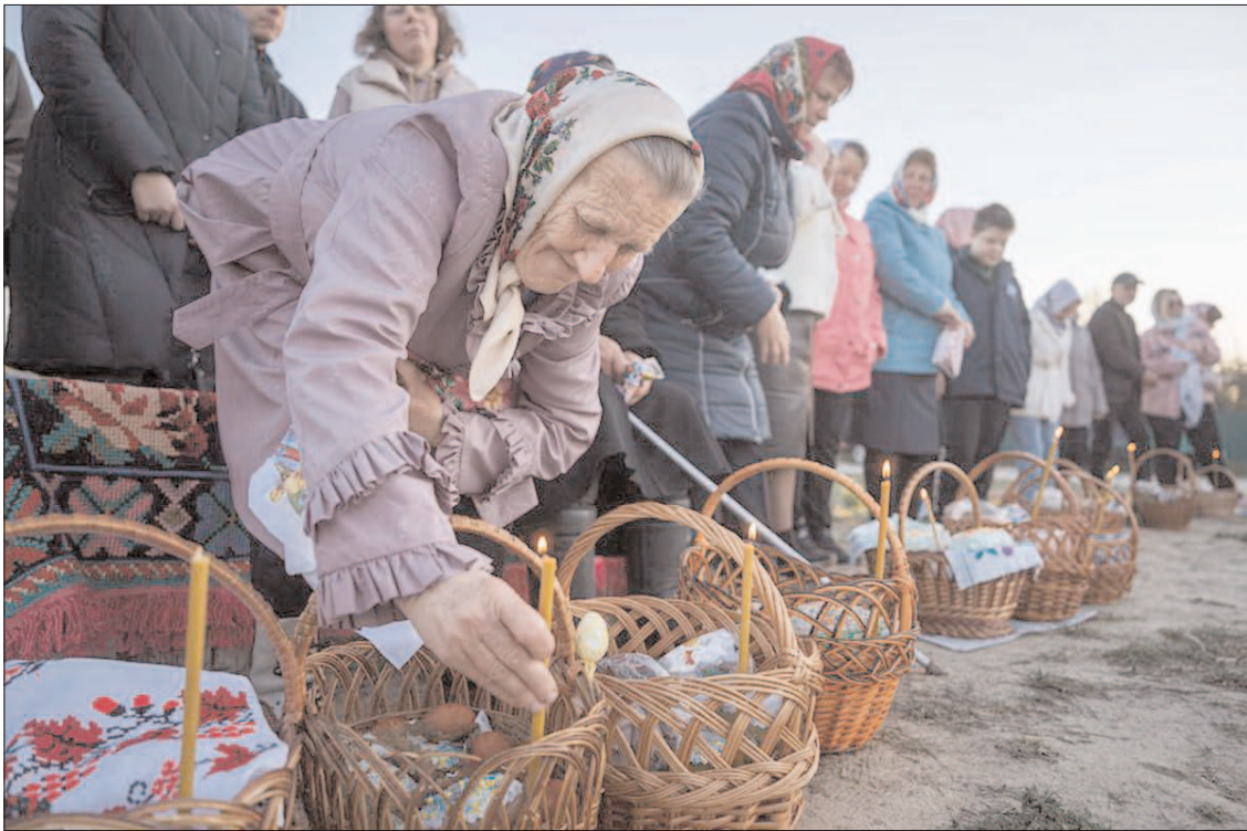
KYIV: An elderly woman preparing her Easter baskets to be blessed during celebration of the Orthodox Easter in Krasne village, Ukraine.