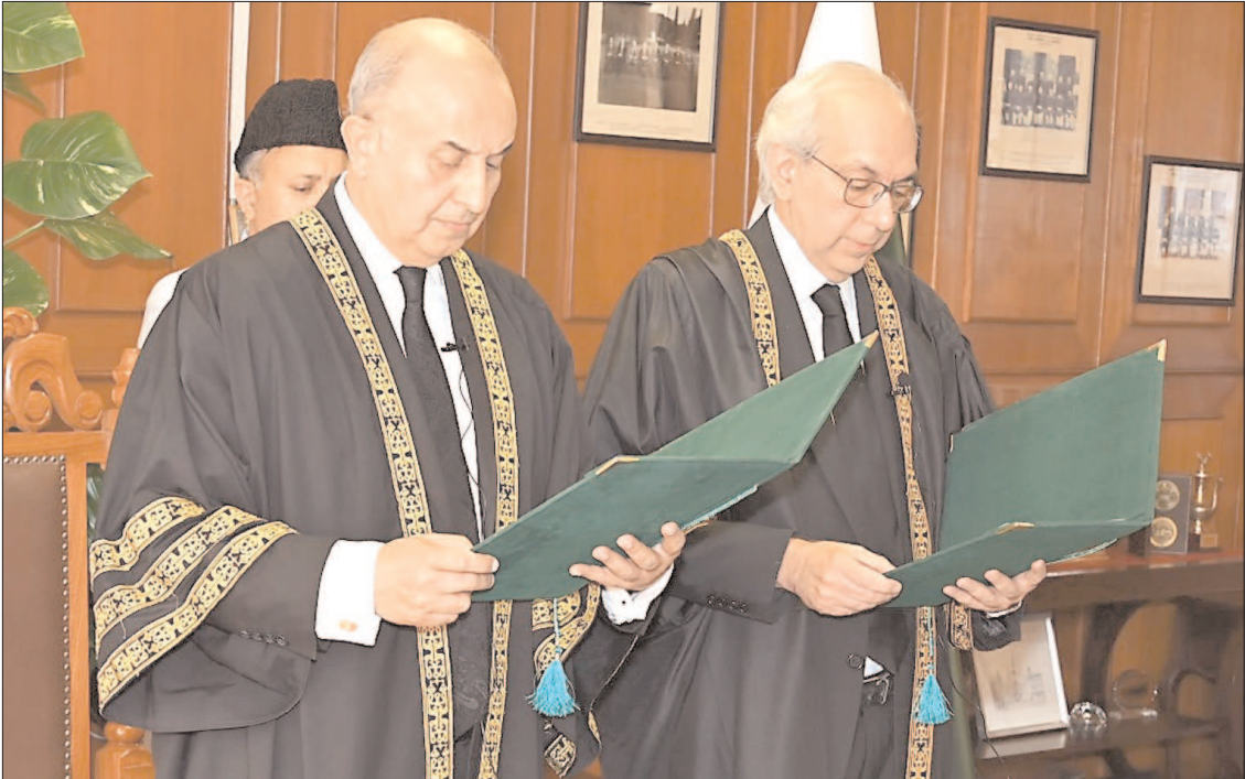
ISLAMABAD: Justice Syed Mansoor Ali Shah, the most senior judge Supreme Court, taking oath as Acting Chief Justice of Pakistan.