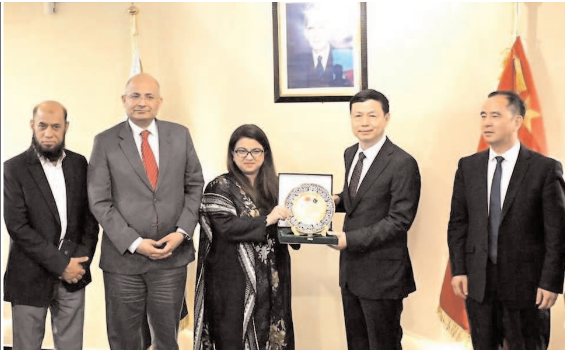
ISLAMABAD: Delegation of China Mobile Communication led by Chairman Yang Jie after meeting with Minister for Information and Telecommunication Shaza Fatima Khawaja.

The exchange rates of the Emirates Dirham and the Saudi Riyal increased by 04 paisa each to close at Rs76.46 and 74.85 respectively.