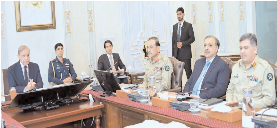
ISLAMABAD: Prime Minister Shehbaz Sharif chairing a meeting on matters related to overseas Pakistanis.

Vol. XXXIXII No. 83 Regd. No. 241 SHAWWAL 23 1446 -- TUESDAY, APRIL 22 2025 PESHAWAR EDITION 12 PAGES PRICE. 30