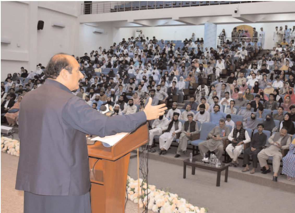
PESHAWAR: Chairman Prime Minister's youth programme Rana Mashhood Ahmed Khan addressing a consultation session with Youth on National Adolescent and Youth policy at IM Sciences University