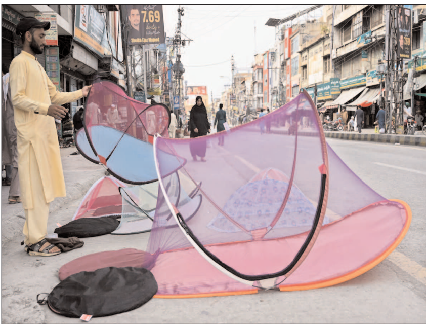
RAWALPINDI: A vendor displays mosquito nets to attract customers at Bara Market.

He appreciated Pakistan's hospitality and sincere efforts to promote mutual interests and assured that Rwanda would further strengthen high-level engagements and parliamentary exchanges with Pakistan in the future.