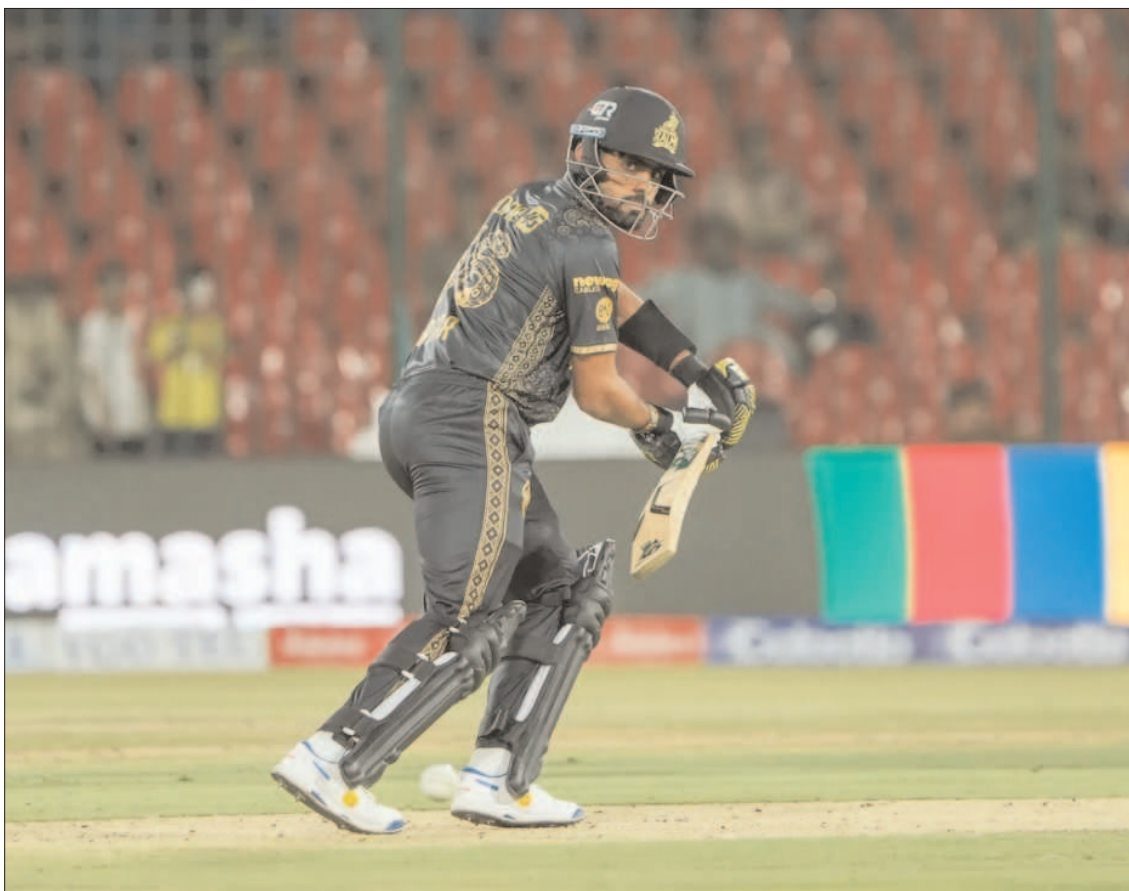
KARACHI: Babar Azam picked up pace after a patient start.