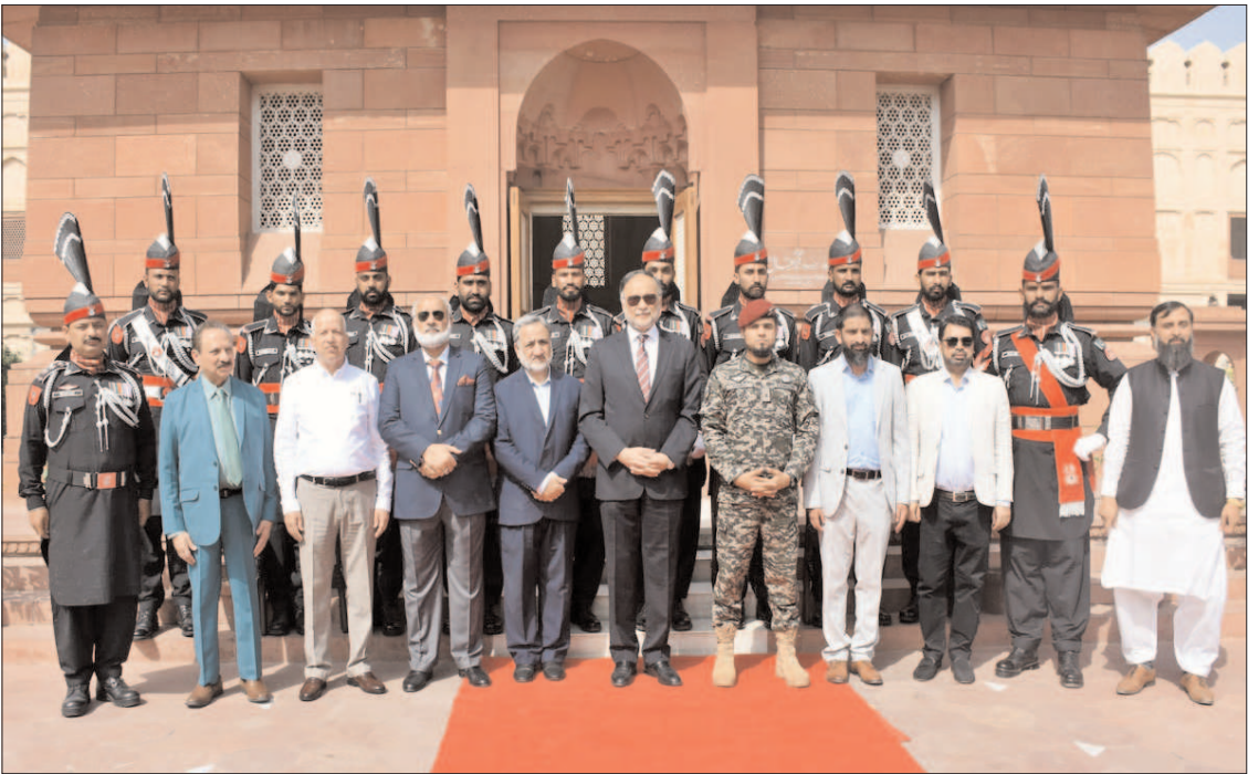
LAHORE: Minister for Planning Ahsan Iqbal in a group photograph during his visit to the mausoleum of Allama Muhammad Iqbal, Pakistan's national poet, on the occasion of his 87th death anniversary.