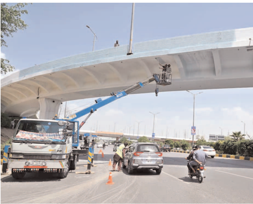
ISLAMABAD: Labourers are busy painting bridge at Peshawar Morr Interchange in the Federal Capital.

There were positive indicators from international institutions about promising improvement in the national economy, he added. Hanif Abbasi said the talks with Afghanistan were not started on the behest of the KP chief minister. It was the Federal Government which decided to initiate negotiations with the neighbouring country, and whatever issues there were with Afghanistan were being looked at by Islamabad. The minister said that a major operation was underway across the country to recover railway land from the occupants.