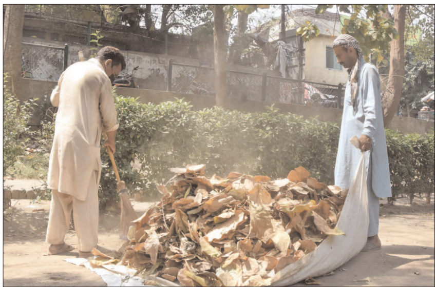
LAHORE: PHA workers improve the sanitation system by collecting dry leaves from trees during a cleanup of a local park near the tomb of Nadira Begum historic site in Lahore.

The ANF had registered a case, and further investigation was underway.