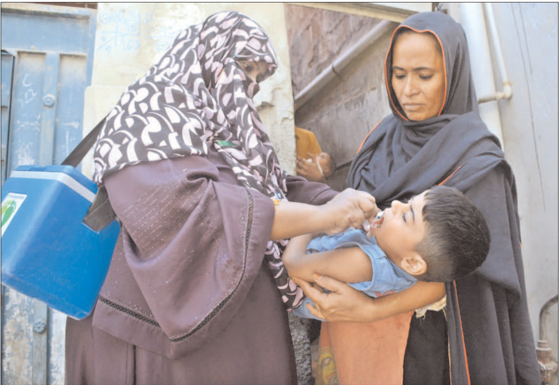
KARACHI: Health worker administering polio drops to a child.