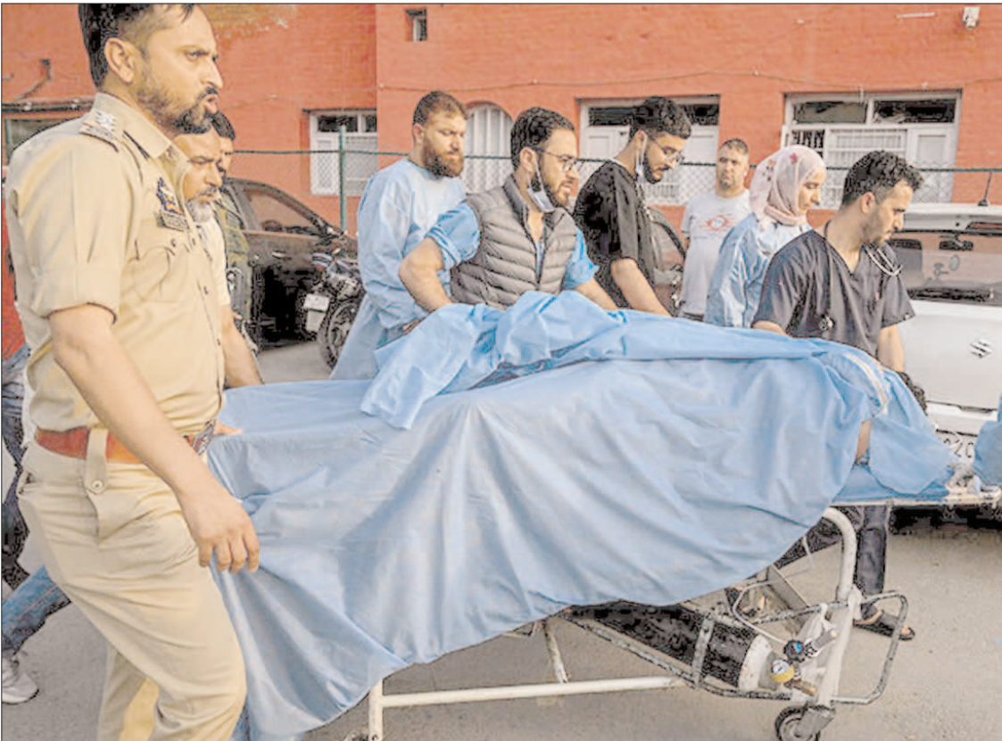
SRINAGAR: Paramedics and police personnel carrying an injured tourist at a hospital in Anantnag, Indian Occupied Jammu and Kashmir.

Meanwhile, Sindh Chief Minister Syed Murad Ali Shah has warned that if the controversial canal project proceeds without Sindh’s approval, people in the province will be forced to take to the street.