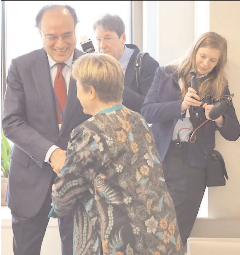
WASHINGTON: Federal Minister for Finance and Revenue, Senator Aurangzeb shaking hands with Managing Director, IMF, Kristalina Georgieva prior to a meeting.