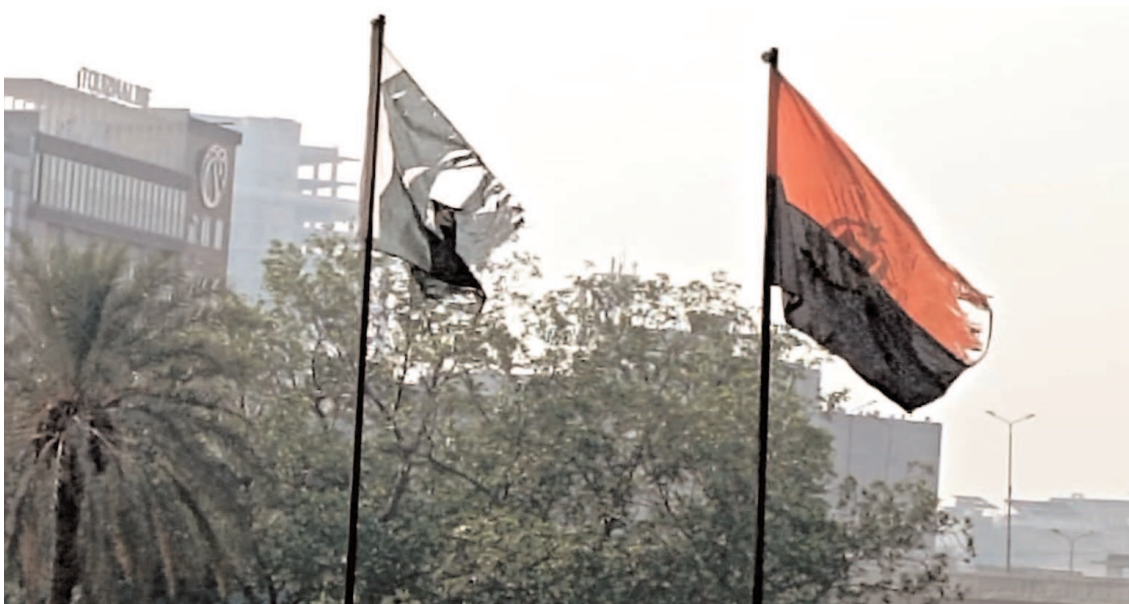
PESHAWAR: A view of national and police flags in dilapidated condition being hoisted at Traffic Police Headquarters needs attention of the authorities concerned.

province's economic growth but also play a pivotal role in improving the quality of life for its citizens. The meeting concluded with a consensus that immediate and priority-based actions are required to overcome barriers in the tourism sector. It was agreed that efforts will be intensified to enhance tourism infrastructure in line with international standards.