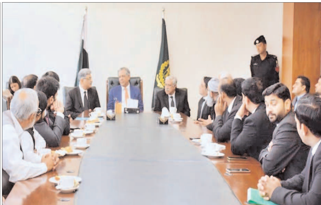
ISLAMABAD: Representatives from various Bar Associations called on Federal Minister for Law and Justice, Azam Nazir Tara in the federal capital.

SSP Shoaib further said that, these people bring outsiders with no connection to the area to occupy land. If a police station fails to handle a case properly the matter reaches us through open courts. No one is allowed to sit on land with weapons. The presence of armed individuals in any area leads to a rise in crime.