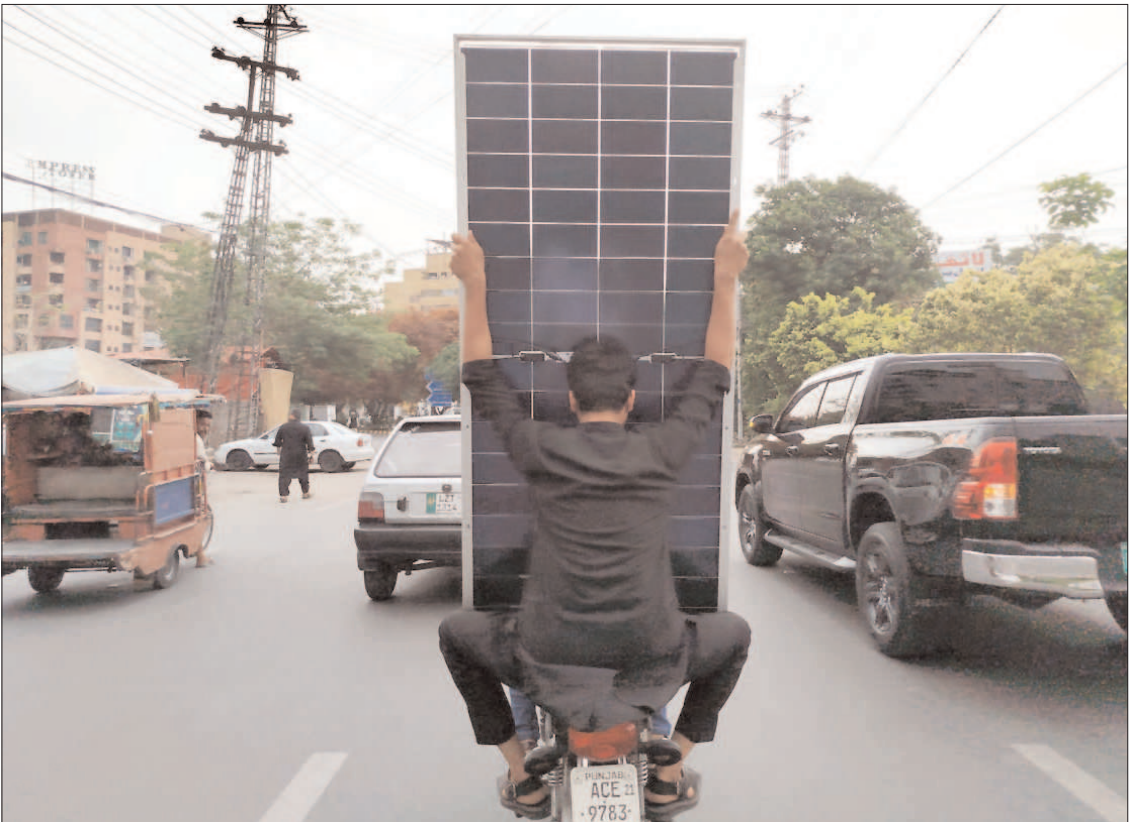
LAHORE: Motorcyclists carry solar panels on Davis Road under Punjab Chief Minister's solar scheme, aimed at reducing electricity bills for low-consumption households.