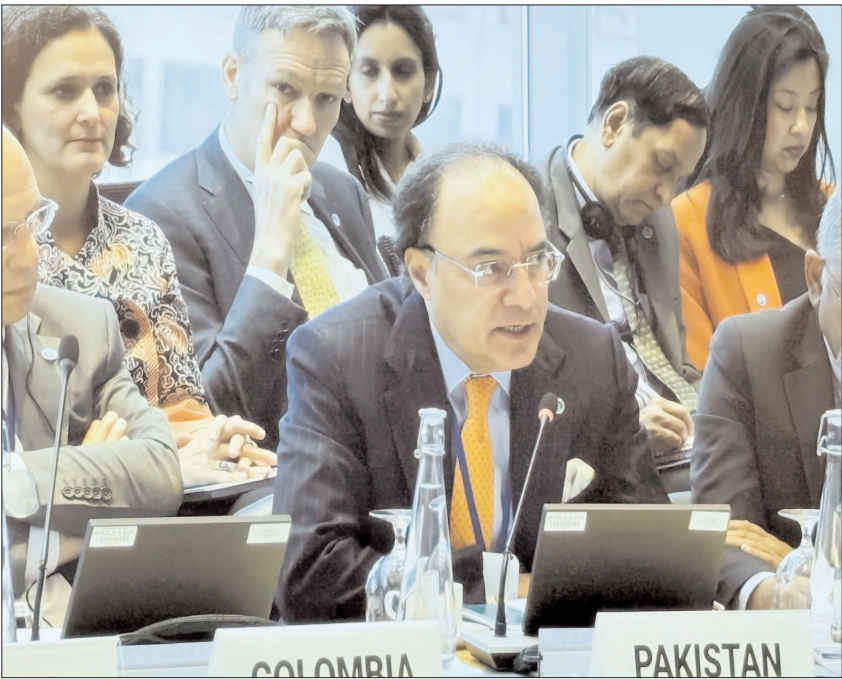
WASHINGTON: Finance Minister, Senator Aurangzeb participating in 13th ministerial meeting of coalition of finance ministers for climate action on the sidelines of IMF-World Bank Spring Meetings 2025.

Meanwhile, a fatal road accident near Sapat on the Mekran coastal highway resulted in the death of four individuals and left four others injured on Wednesday. Rescue officials revealed that a collision occurred between a Chinken car and a truck on the highway in Lasbella district, Balochistan. The victims, all from the Khyber Pakhtunkhwa province, were transported to Civil Hospital Uthal. The deceased underwent medico-legal procedures, while the injured received medical attention.