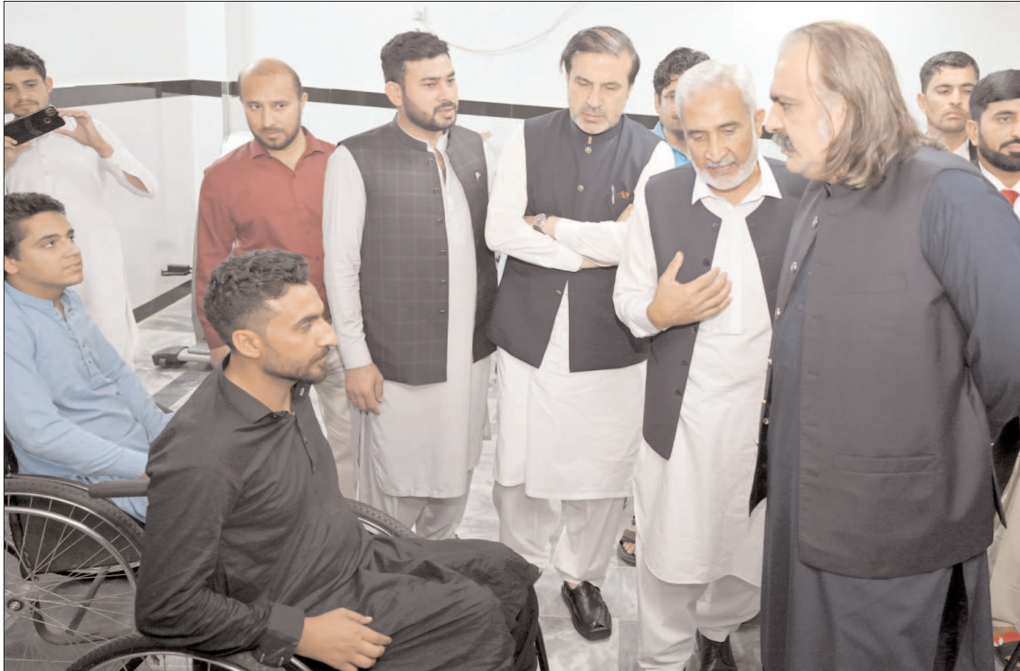
PESHAWAR: Chief Minister of Khyber Pakhtunkhwa, Ali Amin Khan Gandapur interacting with patients during his visit to Paraplegic Center.