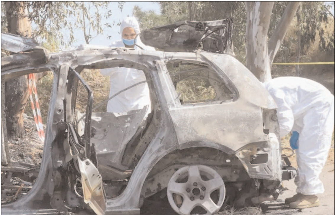
BEIRUT: Members of Lebanese army forensic team inspecting a destroyed car hit by an Israeli air raid near coastal town of Damour.