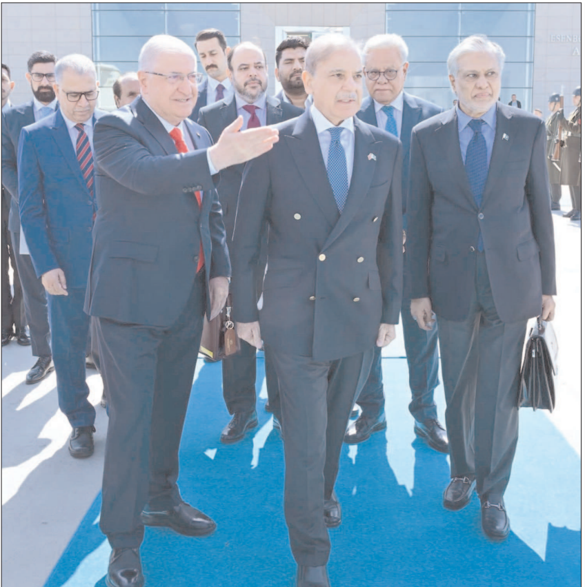
ANKARA: Prime Minister Shehbaz Sharif departs for Islamabad after completion of his two day official visit to Turkiye.