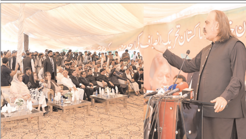
ISLAMABAD: Chief Minister of Khyber Pakhtunkhwa, Ali Amin Gandapur addressing during 29th Founding Day of PTI.