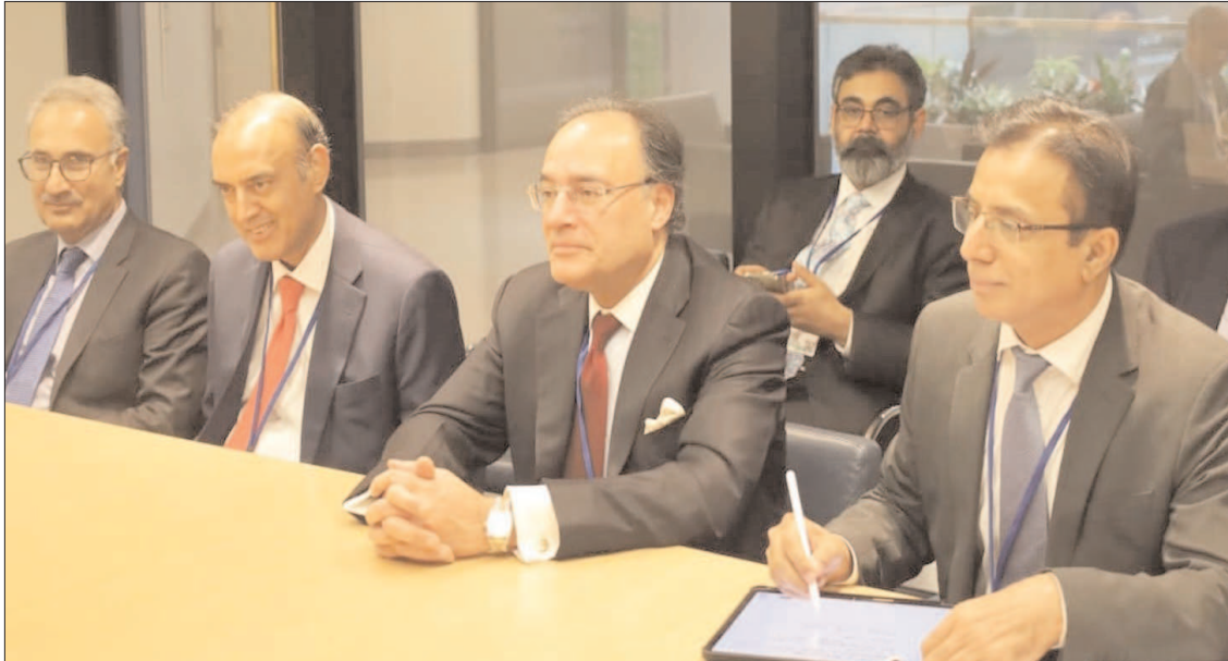
WASHINGTON: Finance Minister Senator Aurangzeb meeting with Jihad Azour, IMF Director for Middle East and Central Asia.