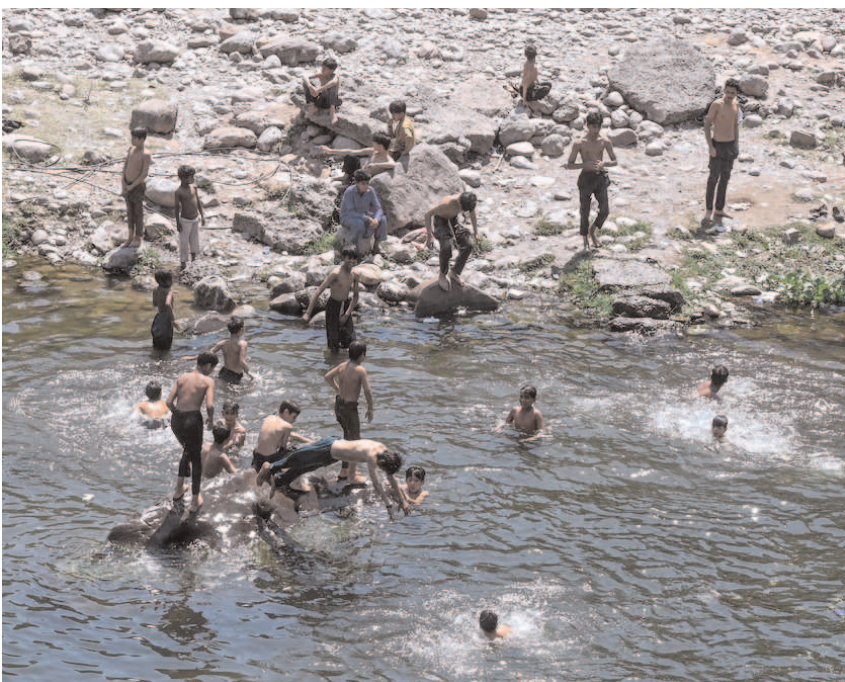
ISLAMABAD: Youngsters swimming in a pond of water near Rawal Dam to cool themselves in hot weather in the Federal Capital.

This initiative reflects a growing focus on improving public service and trust in the police through direct communication and community engagement.