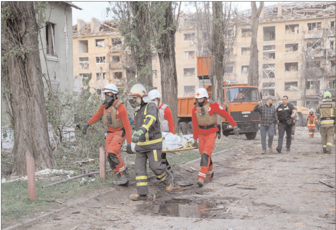
KYIV: Paramedics and a rescuer carrying a body found under debris of an apartment building hit by a Russian missile strike in Ukraine.