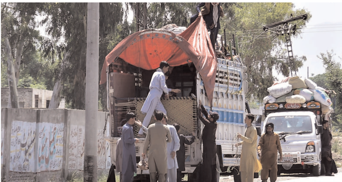
PESHAWAR: Afghan refugees preparing to go back to their country.