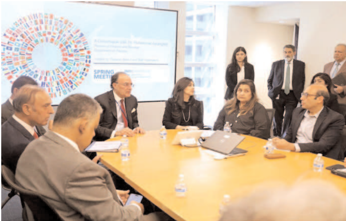
WASHINGTON: Finance Minister Senator Muhammad Aurangzeb participating in a discussion with the Pakistan Bank-Fund Staff Association regarding the country's macroeconomic indicators and structural reforms in Washington D.C.

Express Train from Peshawar to Karachi, the SCCI raised the issue of non-functionalization of Azakhel dryport and other issues being faced by the business community before Federal Minister for Railways Hanif Abbasi and other senior officials concerned. Office bearers took the stance that improvement in bilateral trade, export and economic growth would only be possible by providing facilities and resolving issues of the business community. SCCI assured to continue its role in economic growth and betterment of Pakistan Railways.