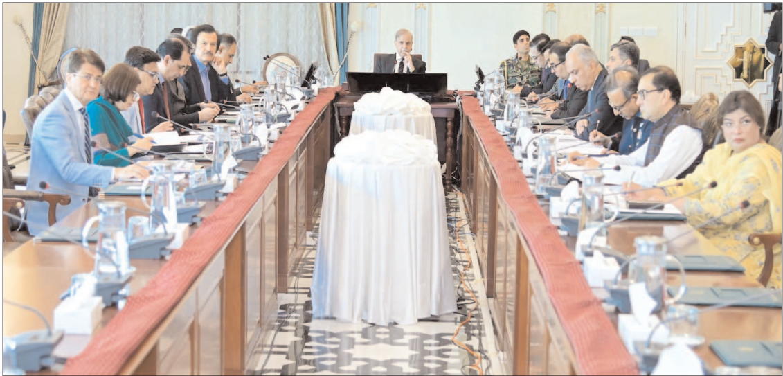
ISLAMABAD: Prime Minister Shehbaz Sharif chairing a meeting to review ongoing process of privatization of PIA.

Naqvi briefs Zardari F.P. Report KARACHI: Federal Interior Minister Syed Mohsin Raza Naqvi held an important meeting with President Asif Ali Zardari in Karachi, where he gave a detailed briefing in the context of India's irresponsible actions following the Pahalgam incident. Naqvi informed President Zardari about the decisions taken by the NSC and the retaliatory measures initiated in response to India's recent behaviour.