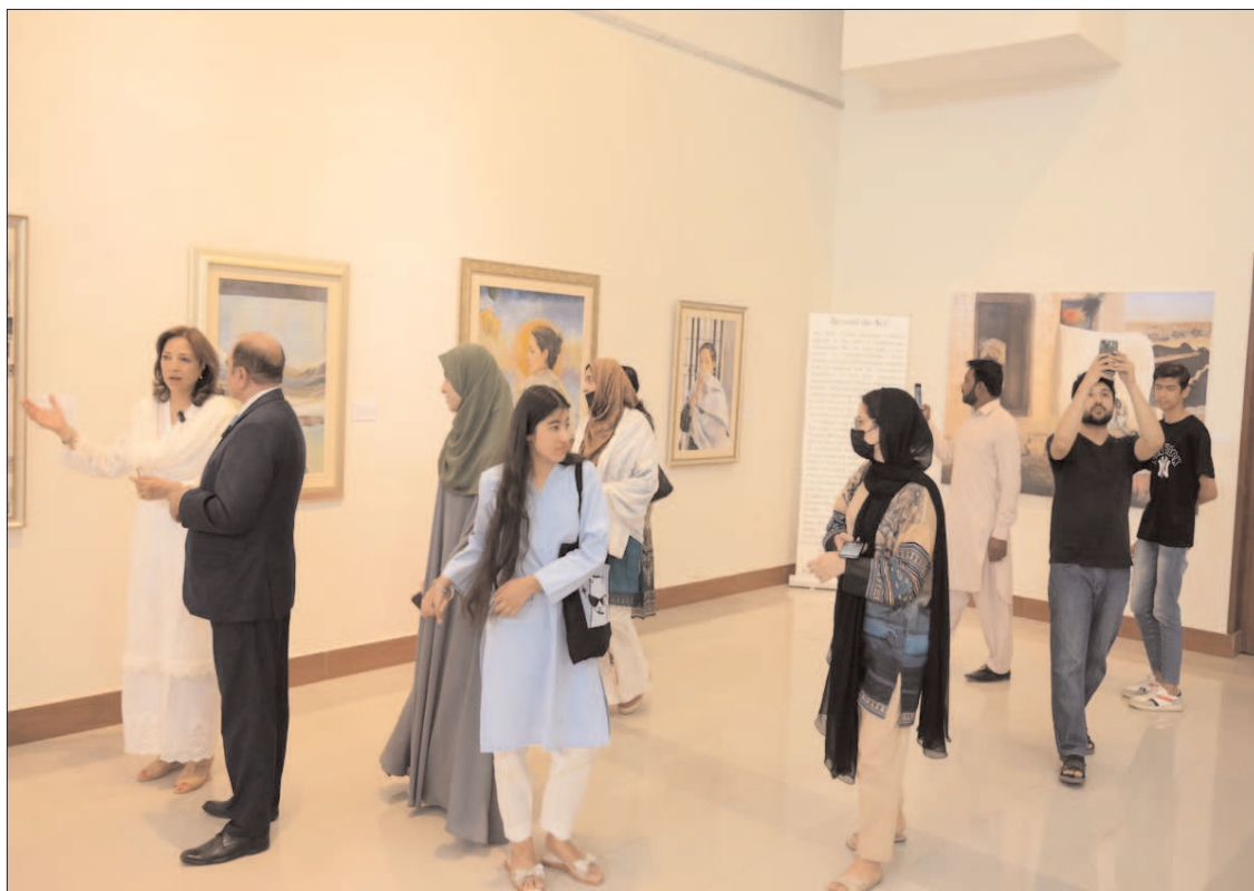
ISLAMABAD: Visitors view the "A Moment in Time" painting exhibition, at the National Art Gallery, organized by ForArtSake and the Pakistan National Council of the Arts (PNCA).