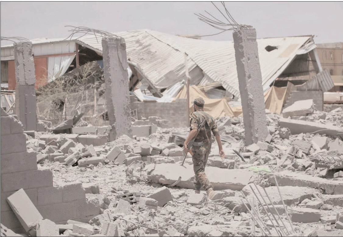
SANAA: A Yemeni soldier inspecting the damage caused by US airstrikes in Yemen.

The crackdown has included detaining more than 1,000 international college students, some of whom have seen their legal status restored, at least temporarily. The policies have slowed immigration at the southern border to a relative trickle. In Colorado, US Immigration and Customs Enforcement took the club-going immigrants into custody, said Jonathan Pullen, special agent in charge of the DEA's Rocky Mountain Division. "Colorado Springs is waking up to a safer community today," he said. The city, Colorado's second largest, lies about 70 miles (113 kilometers) south of Denver.