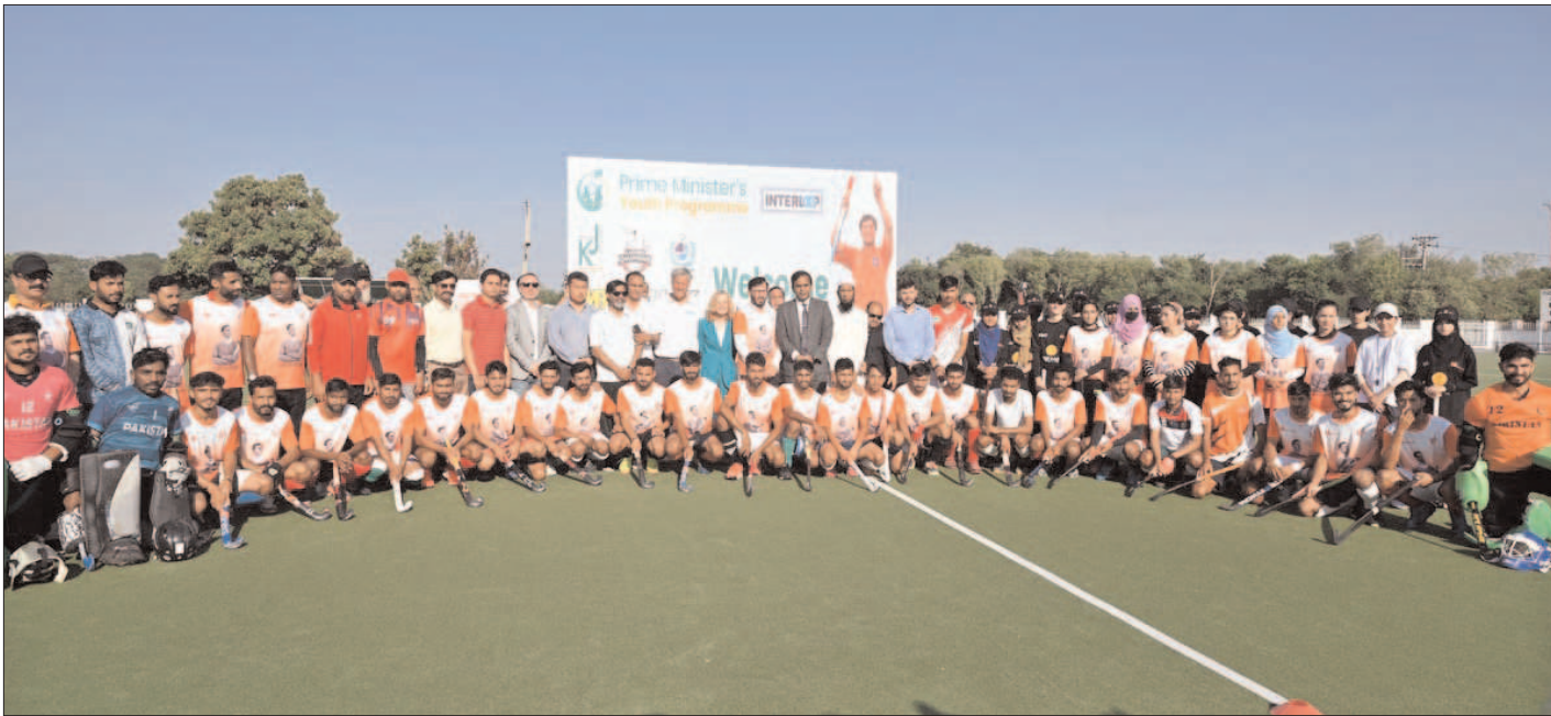
KARACHI: Dutch hockey legend Floris Jan Bovelander in a group photograph with hockey players during a special training clinic organized by the Khawaja Junaid Hockey Academy (KJHA) at Naseer Bunda Hockey Stadium, Pakistan Sports Complex.

NEW DELHI (Agencies): India has blocked Shoaib Akhtar's YouTube channel following the Pahalgam attack in Illegal Indian Occupied Kashmir (IIOK). In an apparent attempt to suppress freedom of speech, the Indian government has also blocked YouTube channels of former cricketers Basit Ali and Rashid Latif, along with Shoaib Akhtar. Shoaib Akhtar, the renowned Pakistani speedster, has a popular channel with over 3.5 million followers worldwide, where he shares his candid views on cricket and societal issues. In addition to blocking Akhtar's channel, India has shut down 16 Pakistani news channels that raised questions about the Pahalgam tragedy.