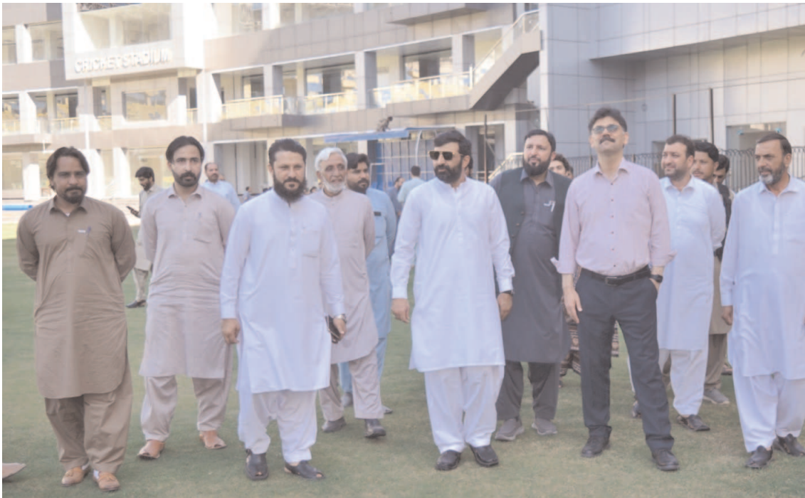
PESHAWAR: Khyber Pakhtunkhwa's Minister for Sports and Youth Affairs, Syed Fakhar Jahan inspecting work on Imran Khan Cricket Stadium.