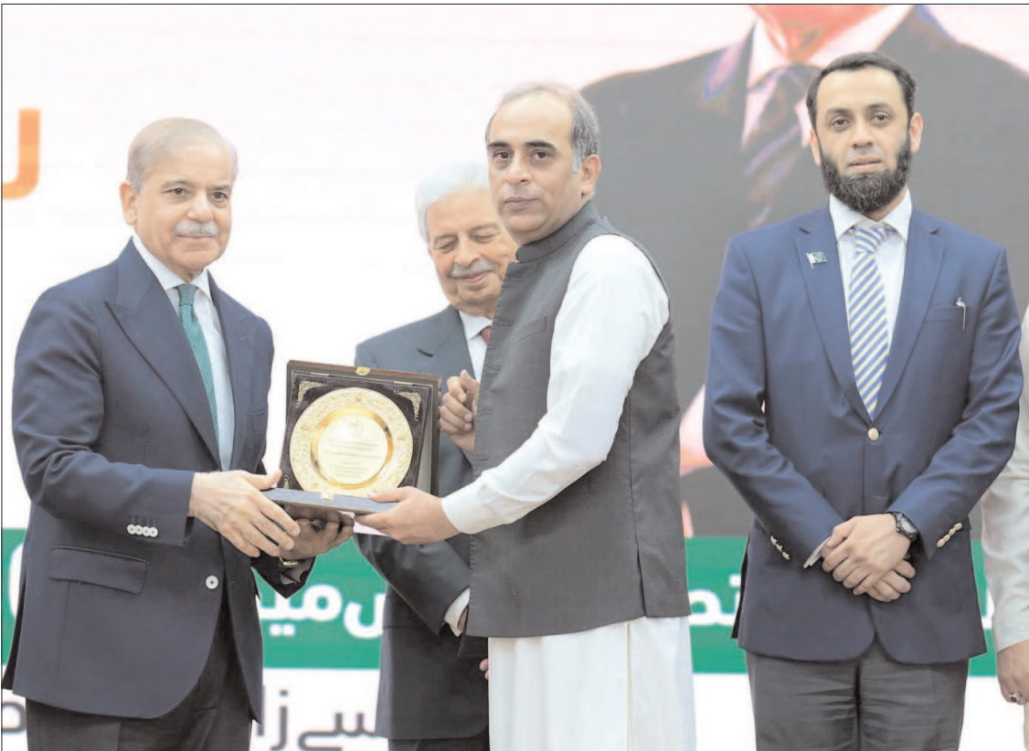
ISLAMABAD: Prime Minister Muhammad Shehbaz Sharif awarding shields to the officers of public and private sector organizations in acknowledgement of their services for Ramzan Relief Package.