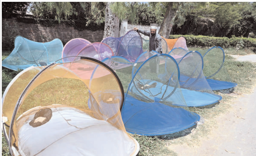
ISLAMABAD: A vendor is busy arranging and displaying mosquito nets to attract the customers along Lehtar Road.

At the same imperative meetings could also be called in emergencies. The RPCC will monitor the implementation of extremism, hate speech, monitoring of madrassas, and other security issues in light of the NAP. In addition, specific sub-committees may also be formed, which will include intelligence, counter-terrorism, drug and smuggling control, community policing, and other important topics. Regular monitoring of the performance of regional committees, digital documentation, and a reporting system to higher authorities (IGP, Home Department) was also finalised.