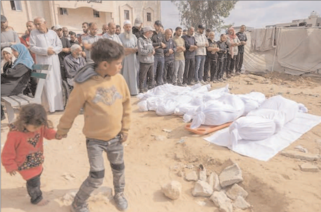
GAZA: Palestinians pray by the bodies of members of the Abou Mahadi family, killed in Israeli strikes on the family home in Beit Lahia.

"International recognition of Russia's ownership of Crimea, Sevastopol, the Donetsk People's Republic, the Lugansk People's Republic, the Kherson and Zaporizhzhia regions is imperative," he said, using the Kremlin's names for the Ukrainian regions. Zelensky said last Friday that Ukraine would "not legally recognise any temporarily occupied territories", and has previously called the demilitarisation demand "incomprehensible".