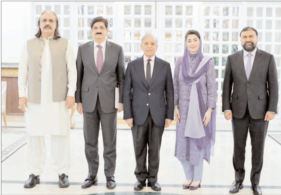
ISLAMABAD: Prime Minister Shehbaz Sharif in a group photo with Chief Ministers of four provinces, before 52nd meeting of Council of Common Interests.

During the meeting, he confirmed, the decision to construct new canals from the Indus River had been withdrawn. "It has been decided to resolve issues through mutual understanding," he added. Gandapur added that three of Khyber Pakhtunkhwa's demands were approved to be included in the agenda for the next CCI meeting. He stated that a review of the National Finance Commission (NFC) Award will also be part of the next session's agenda. The chief minister further said that the agenda to recognise tobacco as a formal crop will be included in the next meeting as well. He termed the inclusion of these demands in the agenda as a major victory for KP people.