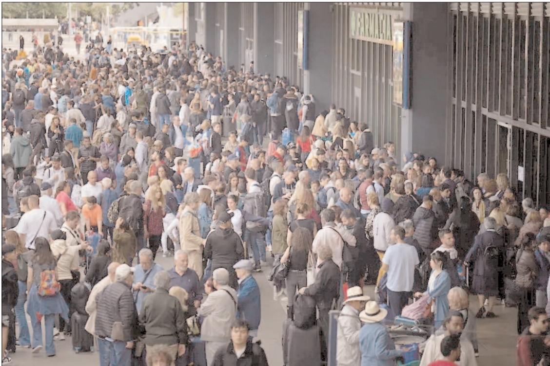
BARCELONA: People waiting outside a closed train station, during a major power outage in Spain.