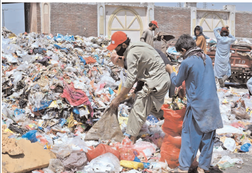
ISLAMABAD: Gypsy youngsters search and collect valuables from a garbage heap along Lehtar Road in Islamabad to earn their livelihood.

As the demand for solar panels continues to rise, industry observers say the trend is likely to accelerate in the coming months signaling a long-term shift toward cleaner, more reliable energy in the twin cities.