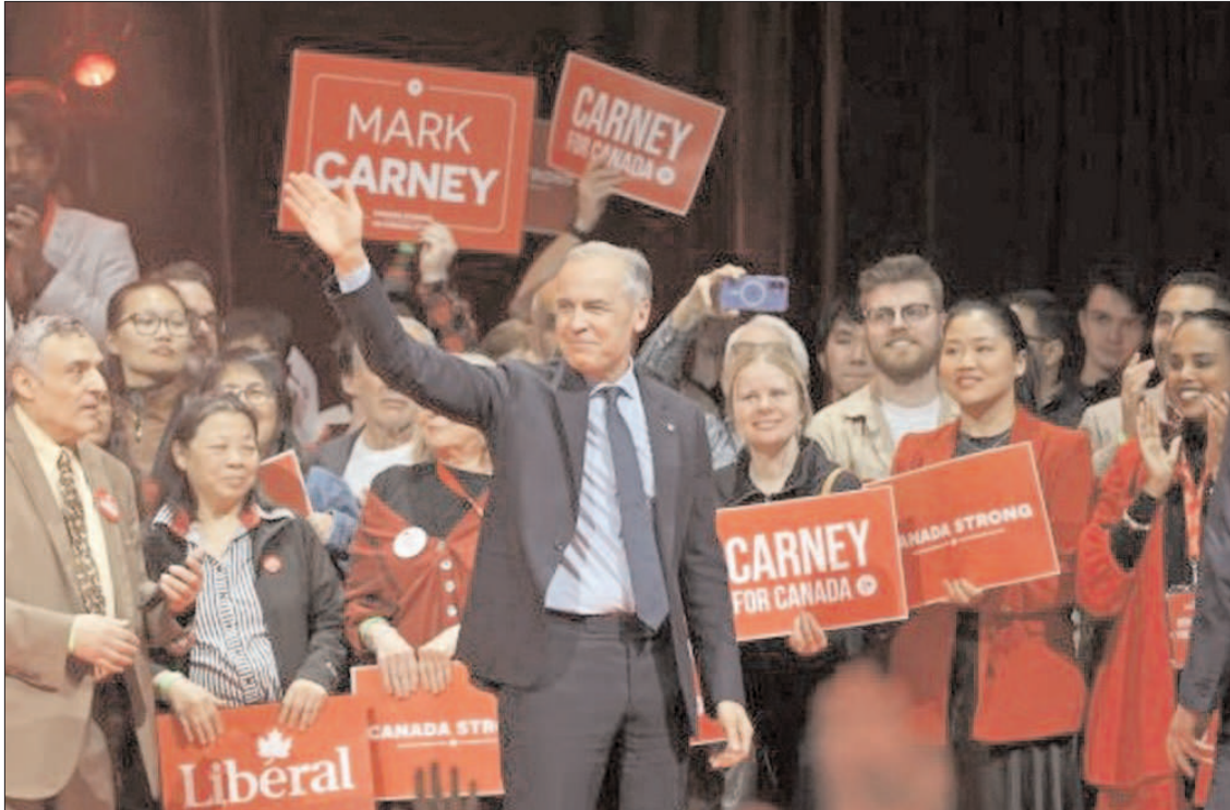
OTTAWA: Canada's Prime Minister Mark Carney waving to supporters following his Liberal Party's victory in the parliamentary election.