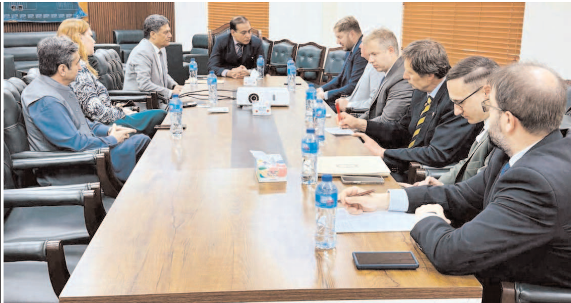
ISLAMABAD: Officials of PPRA Pakistan meeting with a delegation of EU and Foreign Trade Section of Ministry of Industry and Trade of Czech Republic.

The exchange rates of the Emirates Dirham and the Saudi Riyal decreased by 02 and 01 paise each to close at Rs76.50 and Rs74.91 respectively.