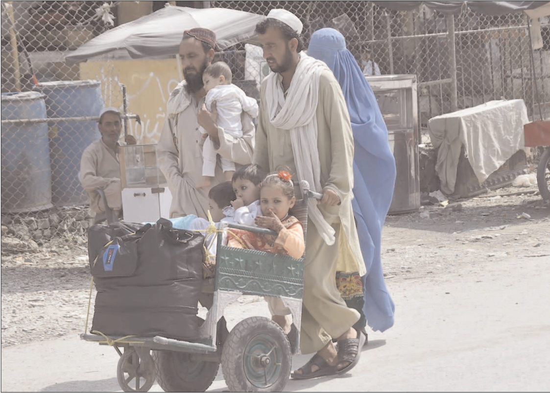
TORKHAM: Afghan family going back to Afghanistan while crossing border.

He mentioned that the economy will improve when industries operate, and the IT industry is developed. Jamaat-i-Islami raised questions about the performance of the FBR and stated that reforms in the tax system are necessary.