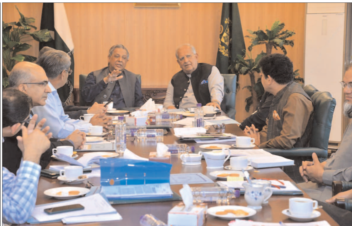
ISLAMABAD: Minister for Housing and Works Mian Riaz Hussain Pirzada chairing meeting to discuss the litigation issues on Constantia Lodge Murree.

schemes for police officers, educational institutions for their children, and health-care services are being further activated. He said several new projects are also in the pipeline and will be launched in the near future.