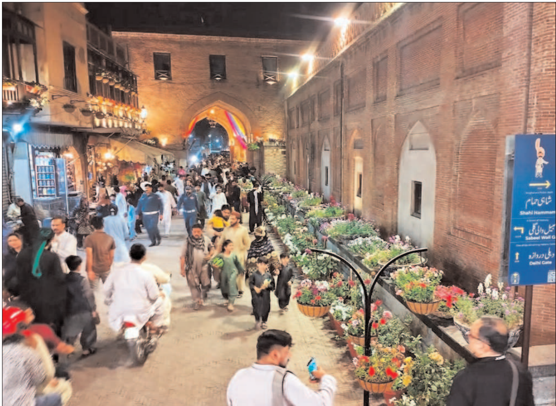
LAHORE: A large number of people gather at Mela Baharan 2025, organized by the Punjab Govt in collaboration with the Pakistan Institute of Fashion Design (PIFD) and the Walled City of Lahore Authority (WCLA).

pleting the first phase of the hospital, which will also include the establishment of the country’s first public-sector bone-marrow transplant centre. This project is seen as a critical development, addressing the urgent need for comprehensive cancer care under one roof. The hospital will be built on a 333-kanal plot of land in the southwest of Lahore, on Pine Avenue Road. Its strategic location, with direct access from major highways, makes it highly accessible for patients traveling from across the province and beyond.