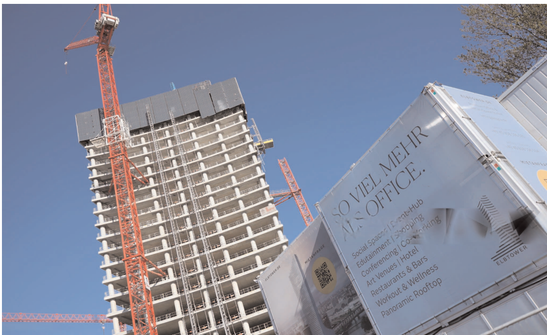
HAMBURG, GERMANY: The Elbtower high rise stands partially complete on Friday in Hamburg, Germany. Construction of the prestige building, designed by David Chipperfield Architects, was halted in 2023 following the bankruptcy of billionaire investor Rene Benko. A new investor, Klaus-Michael Kuehne, is now threatening to cancel his investment, which would leave the city saddled with either the construction completion or the demolition.

remained unchanged. The three top trading companies were Energyco PK with 61,333,939 shares at Rs 8.29 per share, Bank Al-Falah with 43,523,860 shares at Rs74.37 per share and Bank of Punjab 21,774,098 shares at Rs 11.01 per share. Philip Morris (Pakistan) Limited witnessed a maximum increase of Rs 89.27 per share closing at Rs 981.98 whereas runner-up was Ismail Industries Limited with Rs 52.25 rise in its share price to close at Rs 1,852.50. Rafhan Maize Products Company Limited witnessed a maximum decrease of Rs 100.00 per share price, closing at Rs 9,000.00, whereas the runner-up was Siemens (Pakistan) Engineering with Rs 66.00 decline in its per share price to Rs 1,517.82.