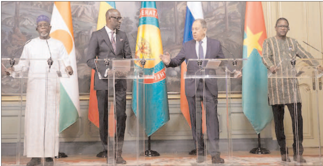
MOSCOW: Niger Foreign Minister Bakary Yaou Sangare, Mali's Foreign Minister Abdoulaye Diop, Russian Foreign Minister Sergey Lavrov and Burkina Faso Foreign Minister Karamoko Jean Marie Traore attendNG a joint news conference following a meeting of Russian foreign Minister with foreign Ministers of the Confederation of Sahel States.