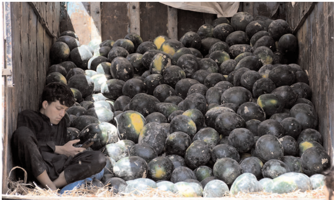
ISLAMABAD: A boy selling watermelon on his truck at fruit market.

U.S. bank stocks (.SPSY), opens new tab dropped further on Friday, with the sector under pressure globally, as investors anticipated more interest rate cuts from central banks and a hit to economic growth from tariffs. The yield on the benchmark 10-year Treasury notes was down to a six-month low of 3.938%. A Labor Department report showed the U.S. economy added far more jobs than expected in March, but Trump's sweeping import tariffs could test the labor market's resilience in the months ahead amid sagging business confidence. Declining issues outnumbered advances by an 8.82-to-1 ratio on the NYSE and a 6.38-to-1 ratio on the Nasdaq. The S&P 500 posted 10 new 52-week highs and 138 new lows while the Nasdaq Composite recorded 11 new highs and 946 new lows.