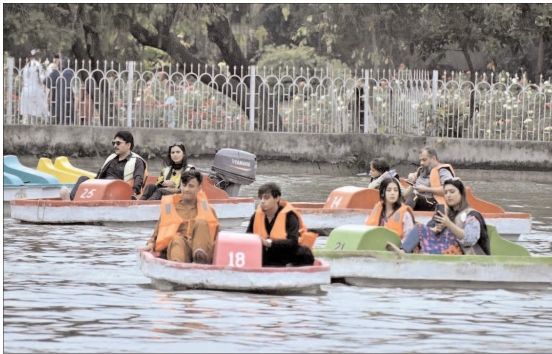
LAHORE: Families enjoy boat riding at Jilani Park.