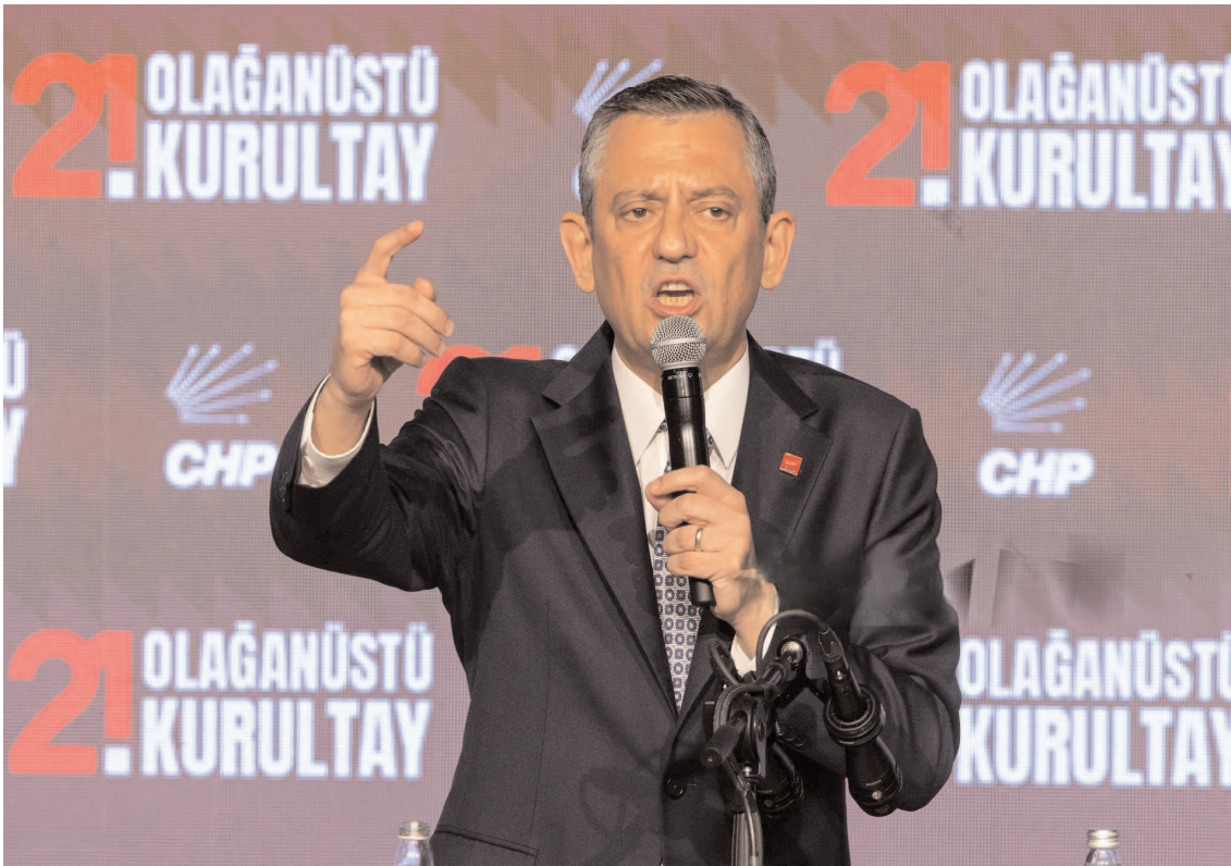
ANKARA, TURKEY: Republican People's Party (CHP) leader Ozgür Ozel addresses to party members during the CHP's Extraordinary Congress on Sunday.