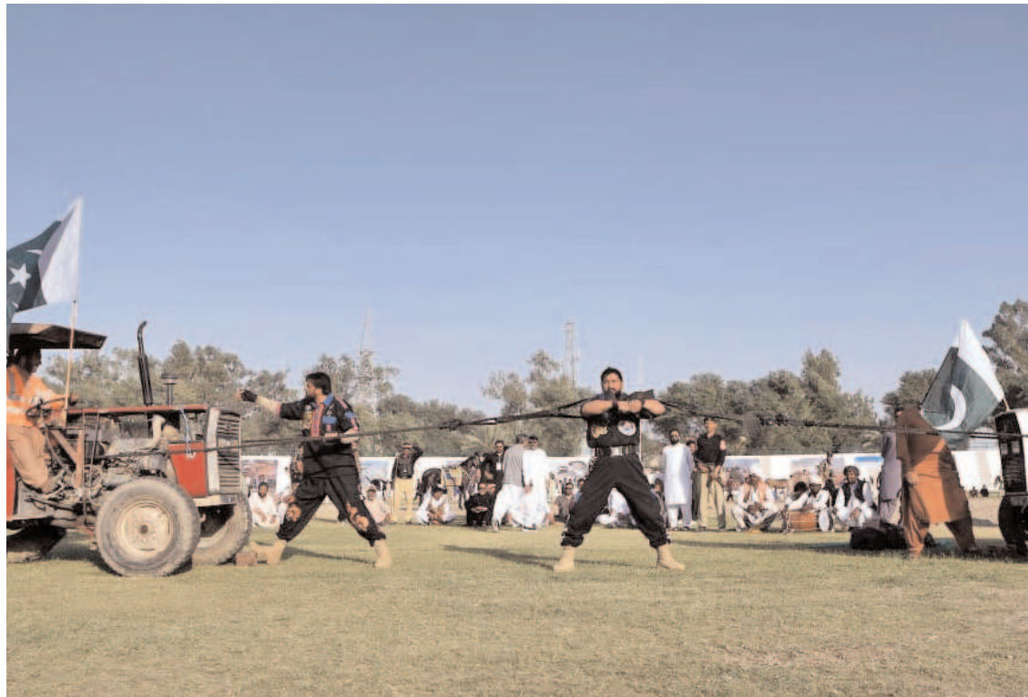
DERA ISMAIL KHAN: Players demonstrating their skills during the ongoing Derajat Festival which also mark the begining of Mela Espan organized by KP government's Directorate General of Sports, at Ratta Kulachi Stadium.

According to Climate Knowledge Portal of the World Bank (WB), changes in monsoon patterns and high temperatures are likely to bring considerable challenges to agricultural