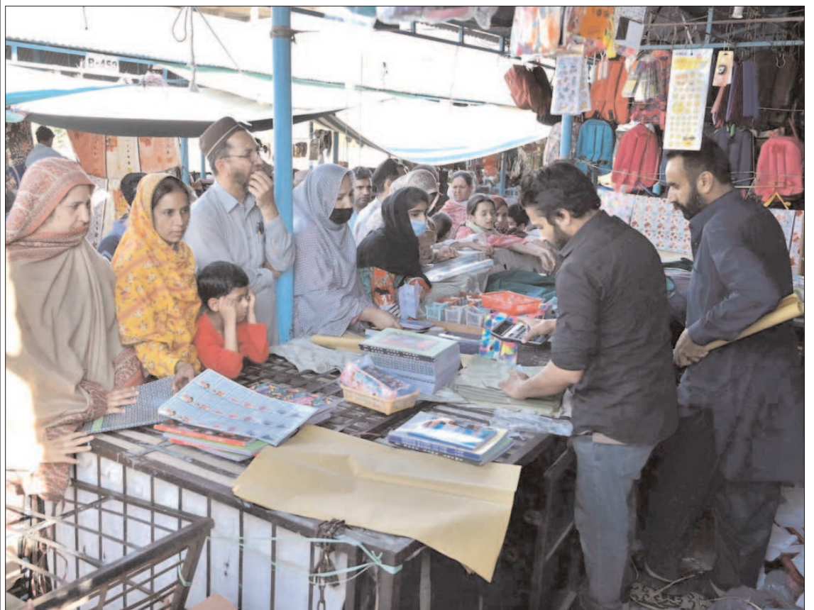
ISLAMABAD: People busy in purchasing stationary items for their children at G-6 sunday bazar.

The Ramadan package initiative not only reflects the values of empathy and solidarity but also highlights the powerful role of community-driven support systems in responding to local needs with respect and compassion.