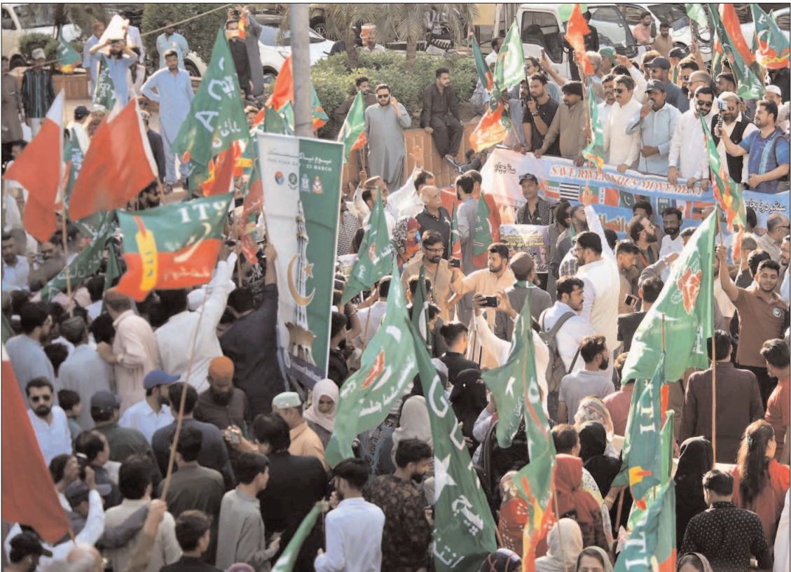
KARACHI: Activists of GDA and PTI holding protest rally outside Karachi Press Club against the six-canal project on Indus River,