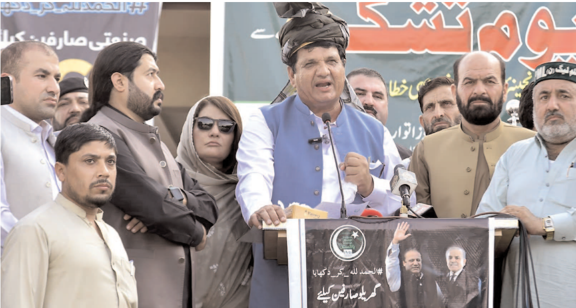
PESHAWAR: Federal Minister for SAFRON and Kashmir Affairs and Gilgit-Baltistan, Amir Muqam addressing a gathering on Youm-e-Tashakur to celebrate the federal government's performance.

been completed in the terrorism-affected southern districts, including Dera Ismail Khan, Lakki Marwat, and Bannu. Further surveys are underway in Karak, Tank, and North Waziristan for future implementation. The IGP emphasized that the Safe City Project is expected to be a game-changer not only in the fight against terrorism but also in addressing various social and street-level crimes.