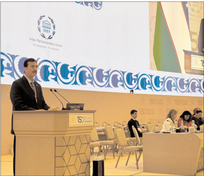
TASHKENT: Chairman Senate, Syed Yousaf Raza Gilani, addressing the 150th Inter-Parliamentary Union Assembly in Tashkent.