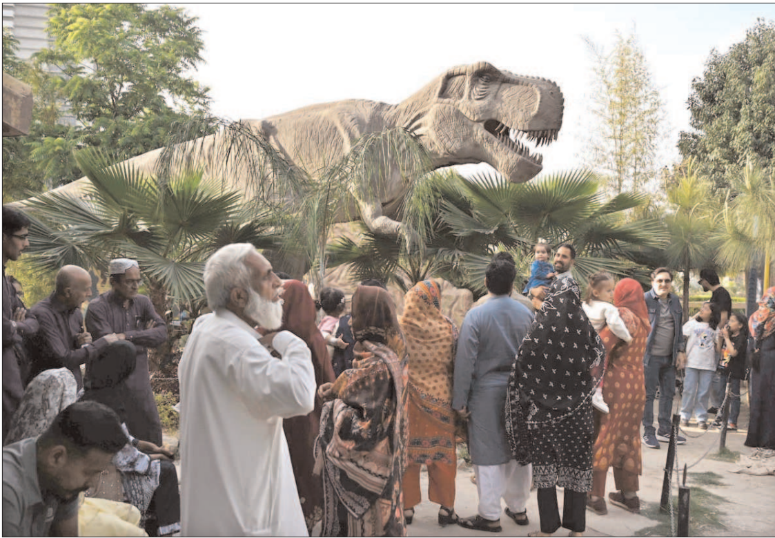
ISLAMABAD: A large number of people viewing dinosaur replica while visiting Multi Garden Zoo.

ISLAMABAD (APP): In a continued effort to safeguard public health, the Punjab Food Authority (PFA) conducted extensive inspections across Multan, targeting juice plants, milk shops, bakeries, and sweet shops. The operation led to the disposal of 200 liters of adulterated food products and fines amounting to Rs190,000 imposed on six food business operators for violating food safety regulations. According to the PFA spokesperson, the inspection drive covered areas including Pul Muzaffarabad, Bahawalpur Road, Chungi No. 5, Tatyapur, and Makhdoom Rasheed. A juice production unit was fined Rs50,000 for manufacturing substandard mango-flavored drinks in Bahawalpur road. A milk shop was penalized Rs15,000 for selling milk adulterated with water in Chungi No 5. Two bakeries were fined Rs80,000 collectively for using loose and prohibited ingredients in bakery items in Makhdoom Rasheed.