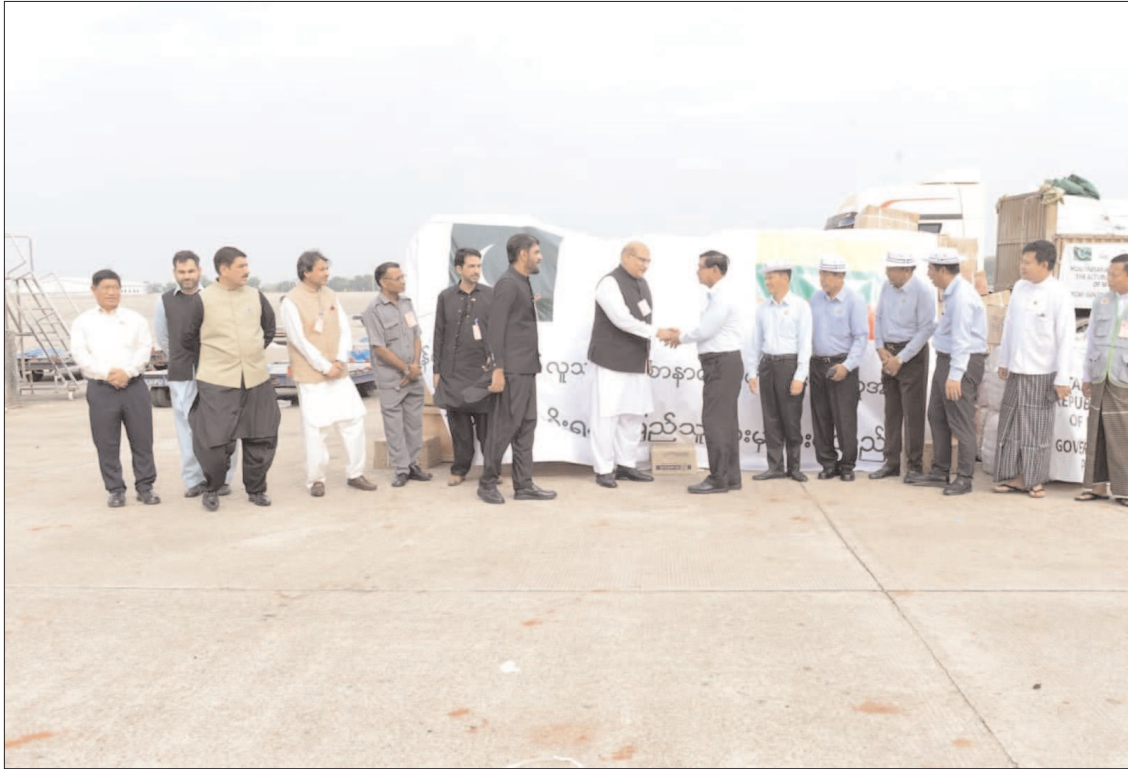
ISLAMABAD: Pakistan's second consignment handed over to Myanmar authorities at Yangon International Airport on Sunday.