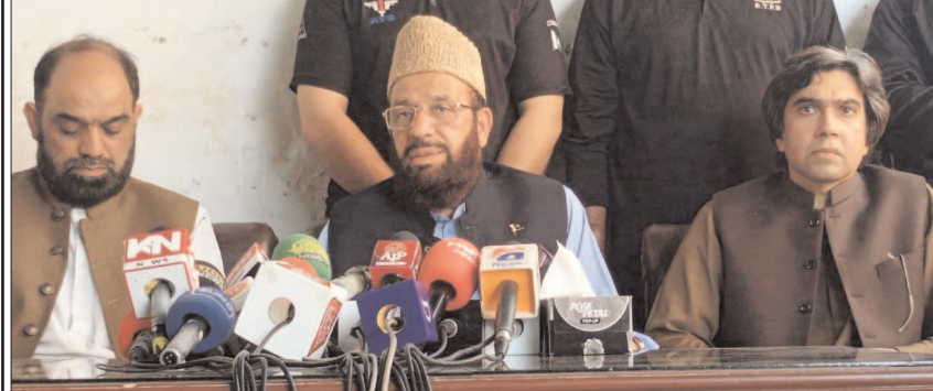
LAHORE: Federal Minister for Religious Affairs and Inter-Faith Harmony Sardar Muhammad Yousef talking to media regarding Hajj 2025 preparations.

The fusion of cultural festivities with nature's beauty created an unforgettable atmosphere, making Mela Baharan a true celebration of spring. The final day's events featured a magnificent live 'Sarangi' performance at Gali Surjan Singh, transporting audiences to the golden era of classical music. The festival also witnessed a special closing Dastangoi session, where storytellers narrated enchanting tales, capturing the audience's imagination.