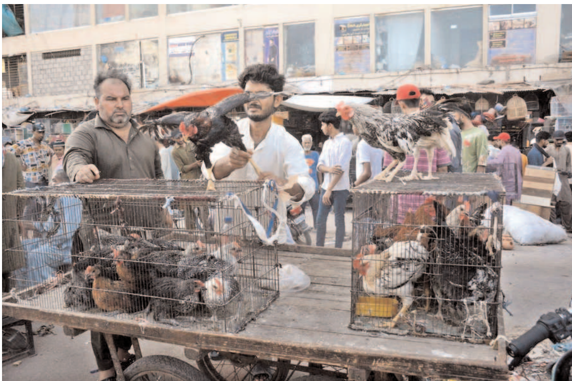
KARACHI: People showing interest in purchasing chicken at Saddar Bird Market.

He underscored that the inflation rate in March 2025 was recorded at just 0.7 percent, a dramatic drop from 20.7 percent in the same month last year which was the lowest inflation level in six decades.