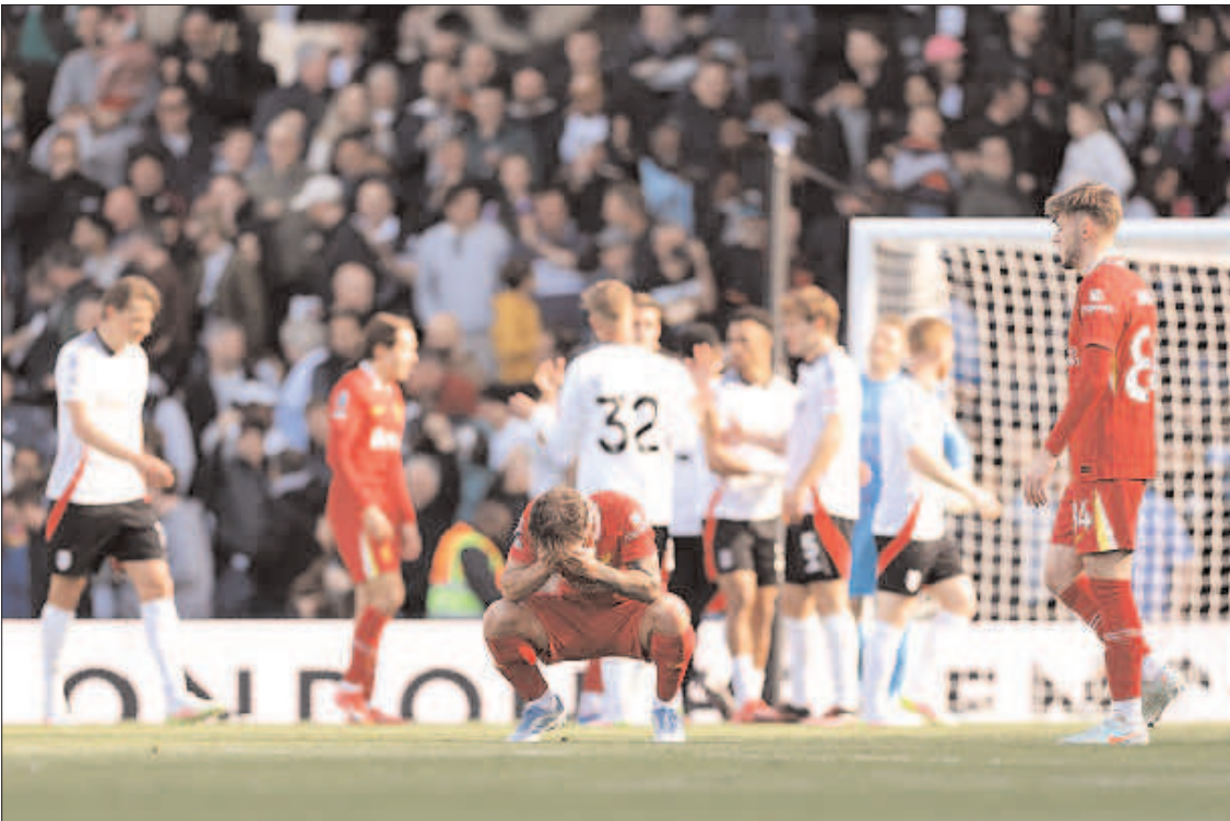
LONDON: Alexis Mac Allister of Liverpool looks dejected after the Premier League match between Fulham FC and Liverpool FC at Craven Cottage.

On Saturday, two amateur cyclists died from heart failure in unrelated incidents on the "We Ride Flanders" mass ride that precedes the main event along the same roads.