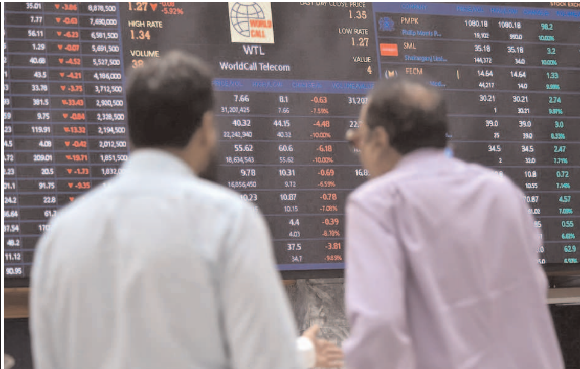
KARACHI: Stockbrokers monitoring stock prices at Pakistan Stock Exchange.

phase due by 2034, promising a new revenue stream for the country. Numerous MOUs are anticipated to be signed during the forum, paving the way for new opportunities in mineral sector development and investment. Additionally, a detailed action plan for the sector's future has been prepared, with the government, in collaboration with military institutions and the SIFC, assuring security to both local and foreign investors.