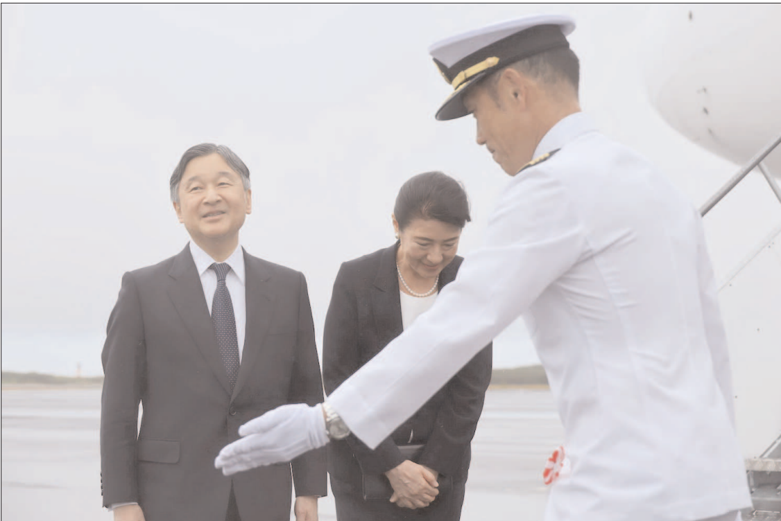
IWO TO: Japanese Emperor Naruhito and Empress Masako, center, escorted by a member of Japan Self Defense Force as they arrive at the island of Iwo Jima, now officially called Iwo To in Japan.