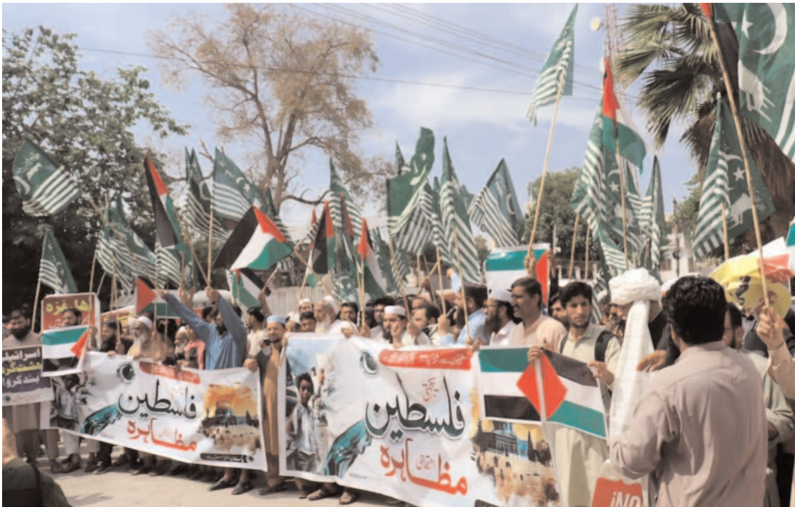
PESHAWAR: Members of Pakistan Markazi Muslim League outside Peshawar Press Club protesting against Israeli atrocities against Palestinians.

Gandapur, prioritizing agricultural growth, resolving landowner issues, and boosting crop yields. "We are mobilizing all resources to ensure farmers' challenges are addressed and food security is strengthened," he added. Provincial minister reiterated the administration's commitment to modernizing farming techniques, enhancing productivity, and aligning policies with public needs to position KP as a model of agricultural progress.