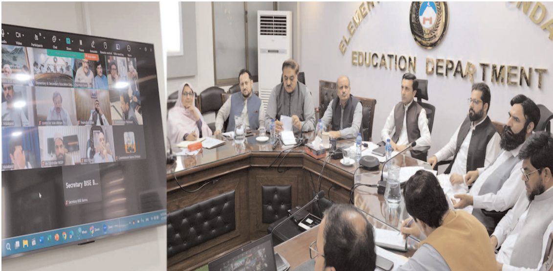
PESHAWAR: Provincial Minister for Education Faisal Khan Tarakai chairing a meeting of all boards chairmen before the start of SSC examinations.

innocent people. In a statement, the bar council expressed its outrage, questioning why the world remains silent on the issue, with innocent children and people being killed daily. They emphasized that the genocide of Muslims in Palestine must stop, and it's time for Muslims to speak out.