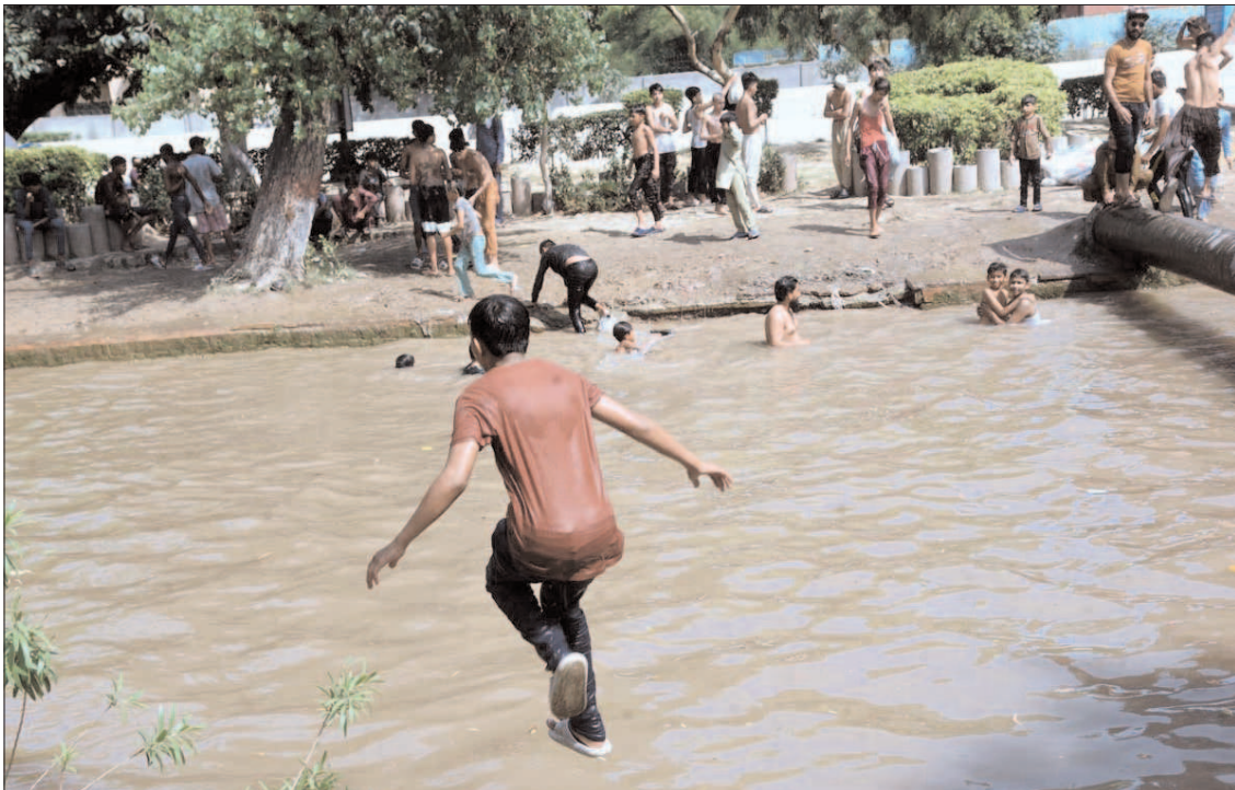
LAHORE: A youngster beats the heat with a splash, bathing and swimming in a water canal to enjoy some relief from the scorching weather.