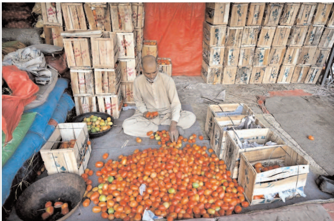
LAHORE: A vendor sorting tomatoes for packing in wooden boxes at vegetable market.