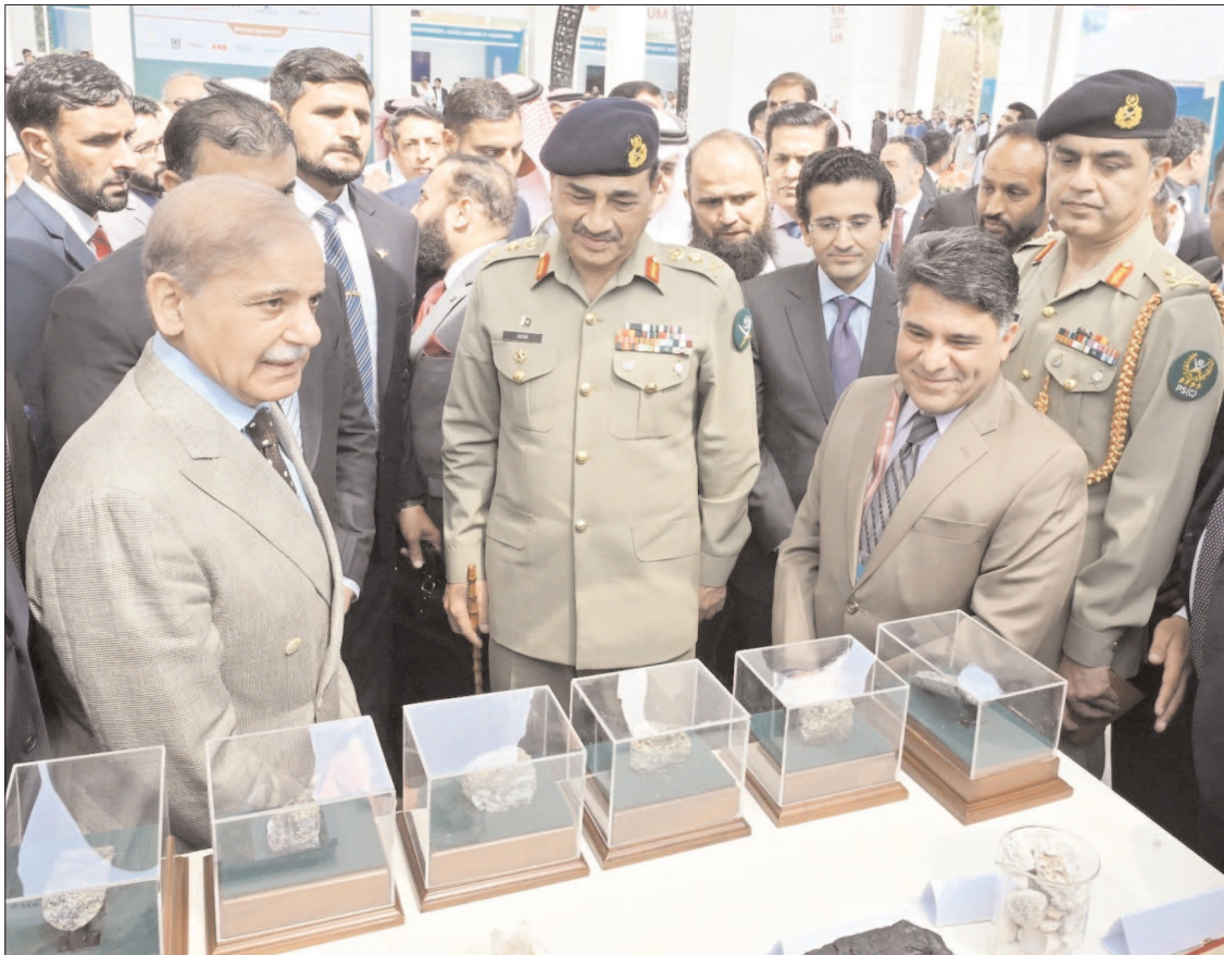
ISLAMABAD: Prime Minister Shehbaz Sharif visiting stalls at the exhibition 'Pakistan Minerals Investment Forum 2025.'