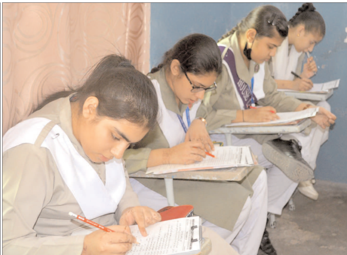
HYDERABAD: Students solving first paper of class 10th in examination centre at Hayat Girls Higher Secondary School, Cantt.