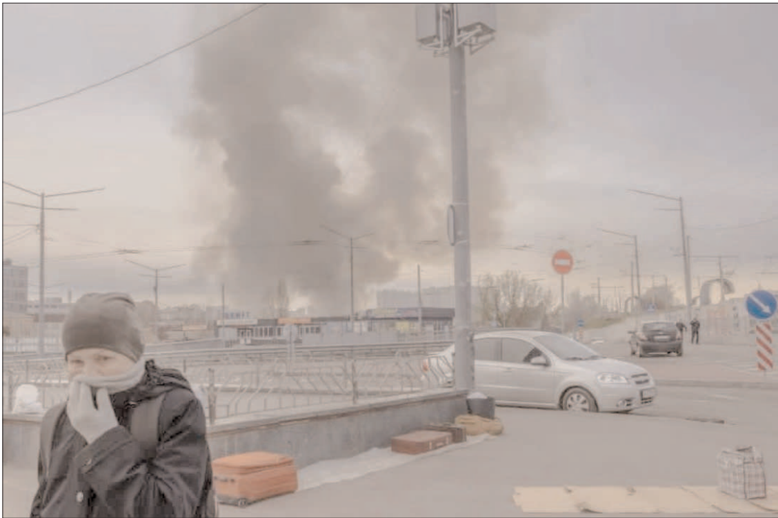
KYIV: Explosions were heard overnight and a dark plume of smoke rose up from the city in Ukraine.