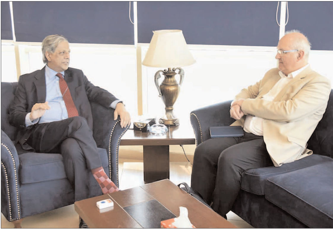
ISLAMABAD: UN Special Rapporteur Professor Nicolas Levrat in a meeting with Federal Minister for Law and Human Rights, Senator Azam Nazeer Tarar, to discuss Pakistan's Efforts to promote minority rights and interfaith harmony.

ISLAMABAD (APP): Indus River System Authority (IRSA) on Tuesday released 64,400 cusecs water from various rim stations with inflow of 76,000 cusecs. According to the data released by IRSA, the water level in River Indus at Tarbela Dam was 1410.32 feet which was 8.32 feet higher than dead level of 1402.00 feet. Water inflow and outflow in the dam was recorded as 22,600 cusecs and 20,000 cusecs respectively. The water level in River Jhelum at Mangla Dam was 1092.30 feet, which was 42.30 feet higher than its dead level of 1,050 feet. The inflow and outflow of water was recorded 24,000 cusecs and 15,000 cusecs respectively. The release of water at Kalabagh, Taunsa, Guddu and Sukkur was recorded as 29,500, 31,600, 21,900 and 6,100 cusecs respectively. Similarly, from River Kabul, a total of 18,200 cusecs of water released at Nowshera and 6,200 cusecs released from River Chenab at Marala.