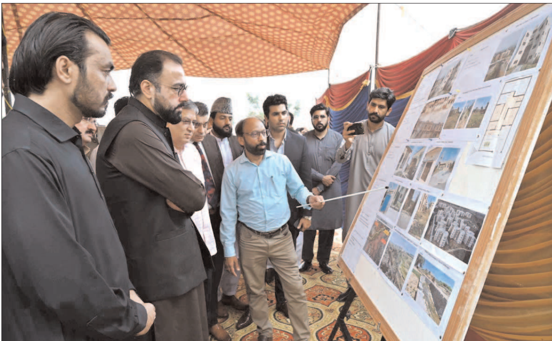
ISLAMABAD: Federal Minister for Overseas Pakistan, Salik Hussain is being briefed during the inauguration ceremony of Electricity supply service to Workers Welfare Fund Labour Complex Zone-V Islamabad.

He went on saying that sometime negligence or carelessness of few seconds turned into a tragedy in one's life. He hoped that road users will following prescribed rules and regulations while crossing motorways.