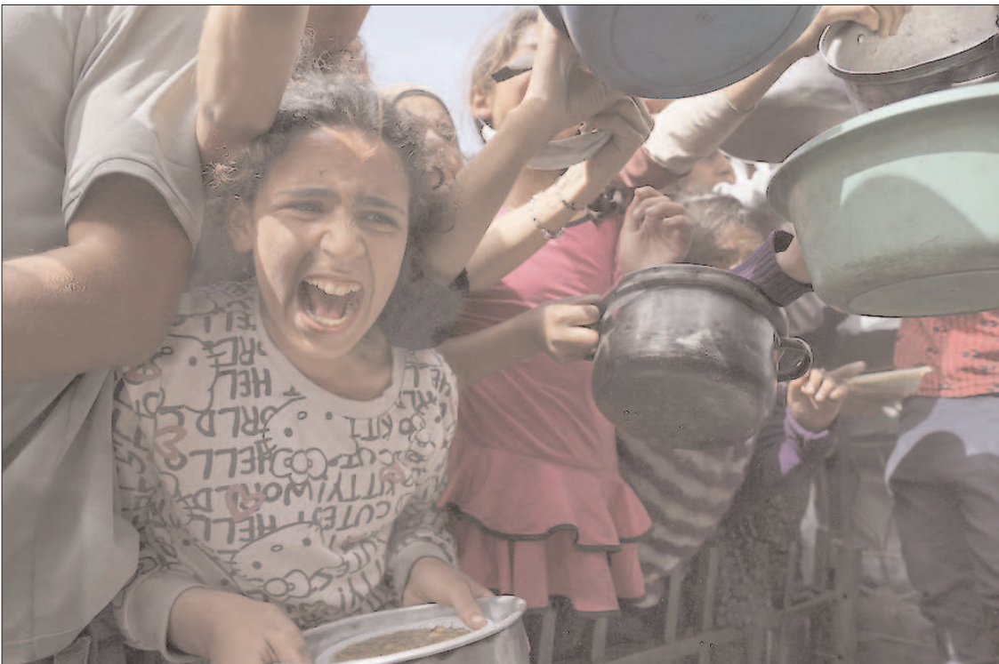
GAZA STRIP: A Palestinian girl struggling as she and others try to get donated food at a distribution center in Beit Lahiya.

He further added that MQM is losing public support and, as an alternative, has resorted to the politics of hatred in hopes of regaining some influence. "Chairman Bilawal Bhutto also emphasized during his speech in Larkana that all provinces must stay united and confront Pakistan's challenges together."