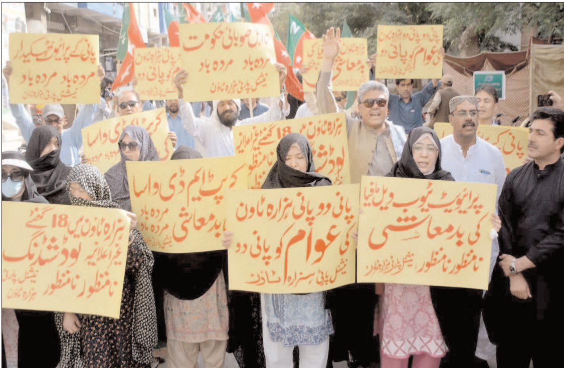
QUETTA: Residents of Hazara Town holding placards during a protest against shortage of water supply and electricity.