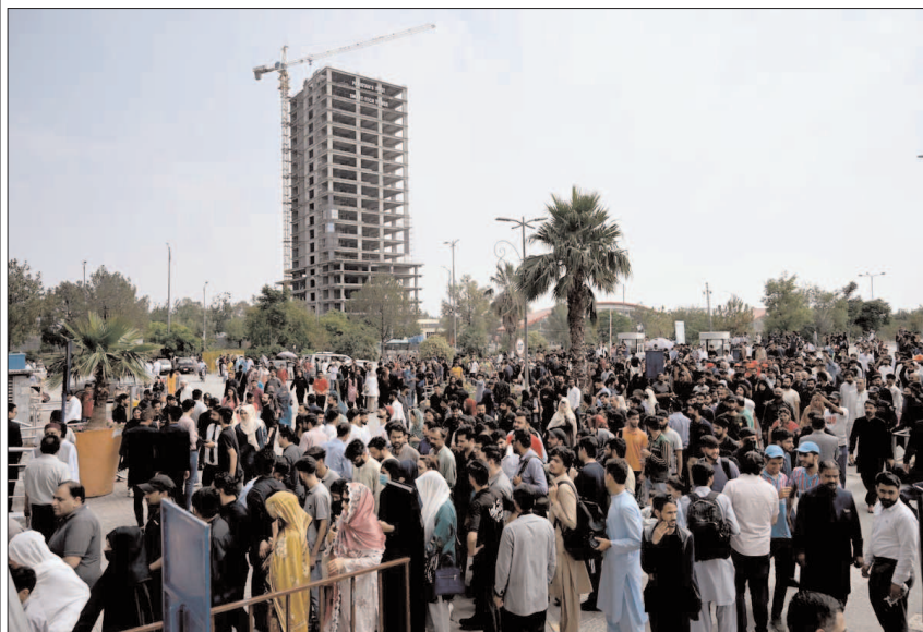
ISLAMABAD: People evacuate from Centaurus Mall as rescue teams conduct a mock drill as part of emergency response training.

The meeting was briefed on key matters by the Federal Secretary for Communications and the Chairman of the National Highway Authority.