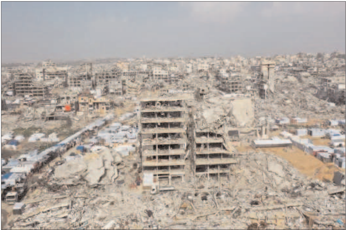
GAZA: A drone view showing houses destroyed by Israel in Beit Hanoun.