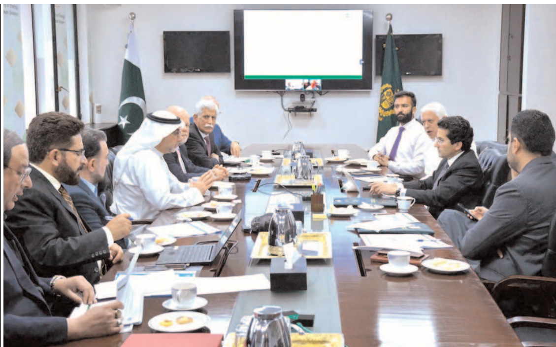
ISLAMABAD: Federal Minister for Petroleum Ali Pervaiz Malik meeting with representatives of Pakistan Petroleum Exploration & Production Companies Association.