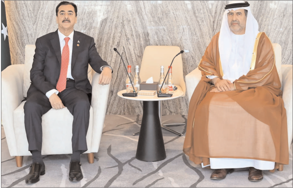
DUBAI: Chairman Senate, Syed Yousaf Raza Gilani, held a meeting on Friday in Dubai with Dr. Tariq Humaid Al Tayer, First Deputy Speaker of the Federal National Council (FNC) of the United Arab Emirates. During the meeting, both dignitaries discussed strengthening parliamentary cooperation, regional developments, and enhancing bilateral relations between Pakistan and UAE. The interaction took place in a cordial atmosphere, reflecting the deep-rooted ties between the two nations.