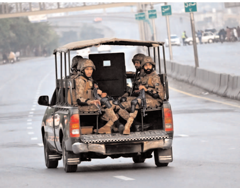
RAWALPINDI: Security personnel high alert at PAF area for emergency response in the city.

"We salute the bravery of our armed forces" they roared. "Long live Pakistan! Long live the Pakistan Army!"