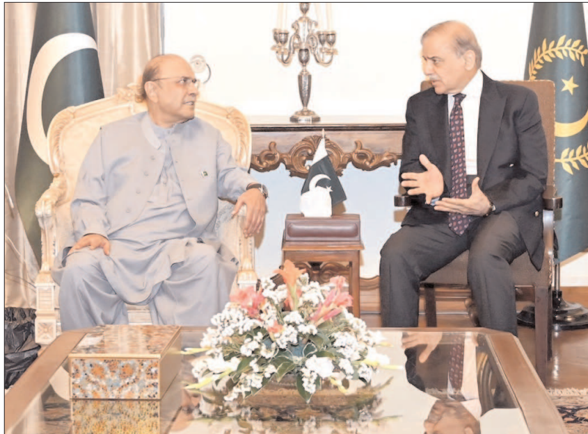
ISLAMABAD: Prime Minister Shehbaz Sharif called on President Asif Ali Zardari at Aiwan-e-Sadr.