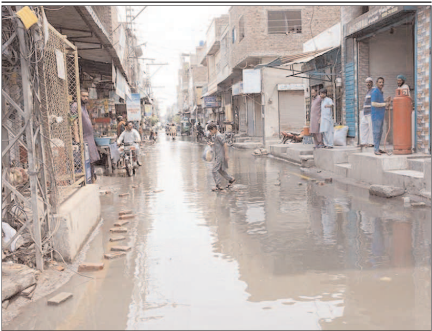
FAISALABAD: A view of sewerage water accumulated on Jamilaabad Chowk needs attention of authorities concerned.

The committee directed officials from the Education Department to prioritize funding for schools that have been overlooked in previous allocations, ensuring equitable support and development across all institutions.