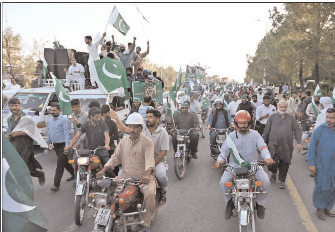
ISLAMABAD: A large number of people participating in rally to express solidarity with the Pakistan Armed Forces in the federal capital.

Tarar emphasized that despite Pakistan's 40-year struggle against terrorism with numerous sacrifices made India persists in spreading falsehoods and maligning the country.