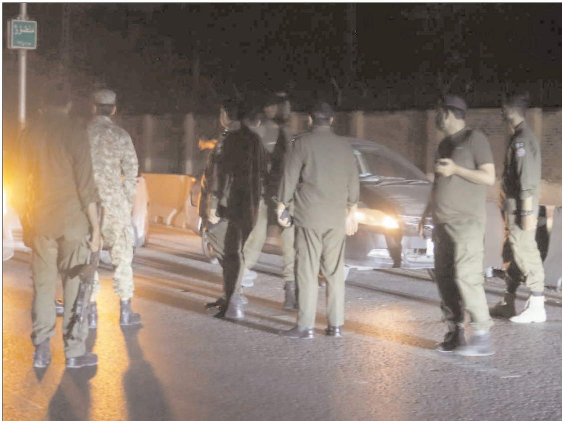
RAWALPINDI: Security personnel standing alert at Nur Khan air base following an Indian missile strike.

To a question about steps for de-escalation, he said it was India which started aggression and now India will have to take a step back. "India stated the aggression and now it is upto India to take a step back and deescalate the situation because they are the aggressors", he categorically said. To a question, he said that the leadership of many friendly countries like the United States, Saudi Arabia, China, etc were in contact with Pakistan and had discussed the current situation.