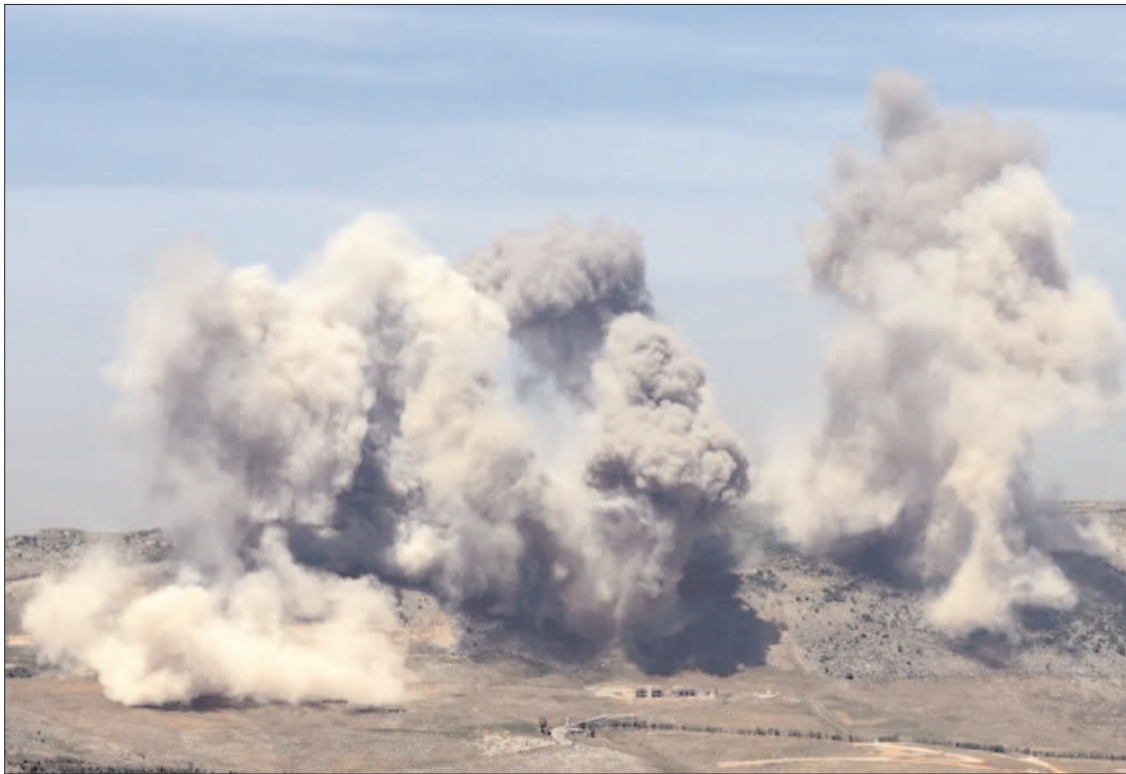
BEIRUT: A picture taken from the southern Lebanese area of Marjayoun shows smoke billowing from the site of Israeli air strikes on the hills of the southern Lebanese village of Nabatieh.

"Lack of compliance with these orders can lead to severe sanctions, including throttling of the entire platform in Türkiye," its global government affairs division said on X. Istanbul prosecutors opened an investigation into an April 24 post on Imamoglu's account on the grounds that it may constitute incitement to commit a crime, the presidential communication's directorate said in a statement on X.