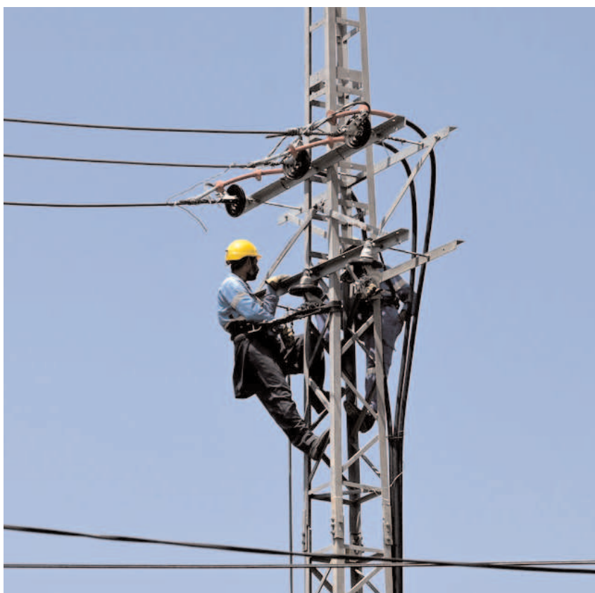
ISLAMABAD: IESCO workers are busy in installing electricity line on poles near IJP Road in the Federal Capital.

This program includes scenario-based orientation on key areas such as Mina, Arafat, Muzdalifah, Jamarat, and transportation management, he added. Pilgrims can expect a truly ideal experience, he affirmed, with their physical needs met and their spiritual aspirations fulfilled.