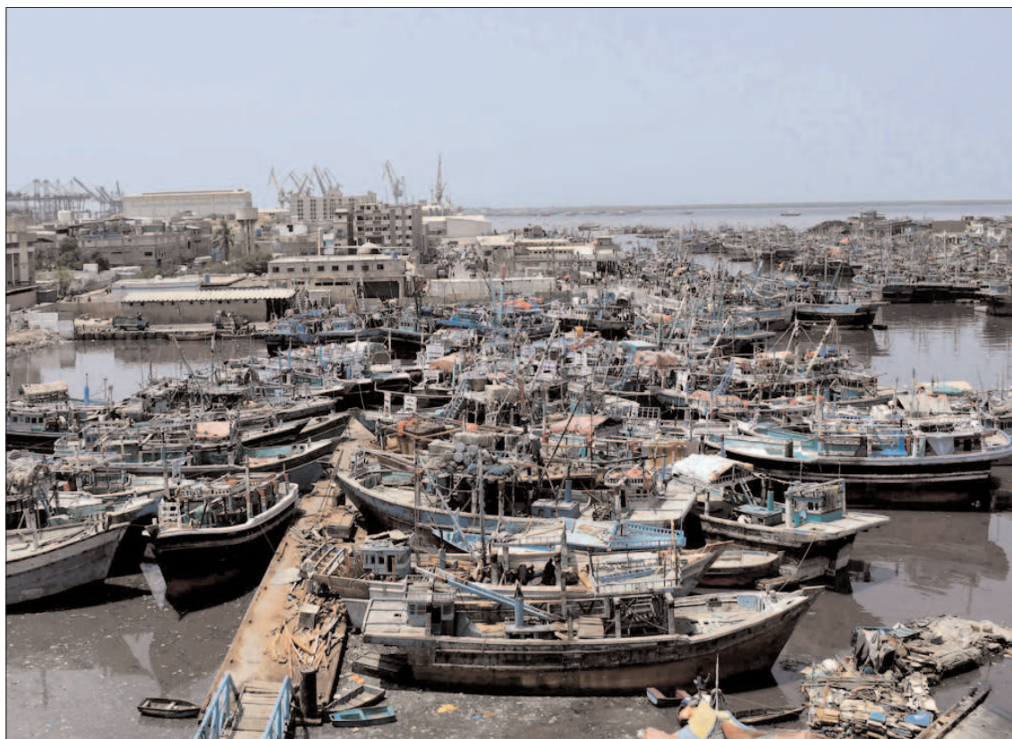
KARACHI: Fishing boats seen anchored at Fisheries area as authorities imposed a temporary ban on fishing in the country's territorial waters due to escalating tensions with India.