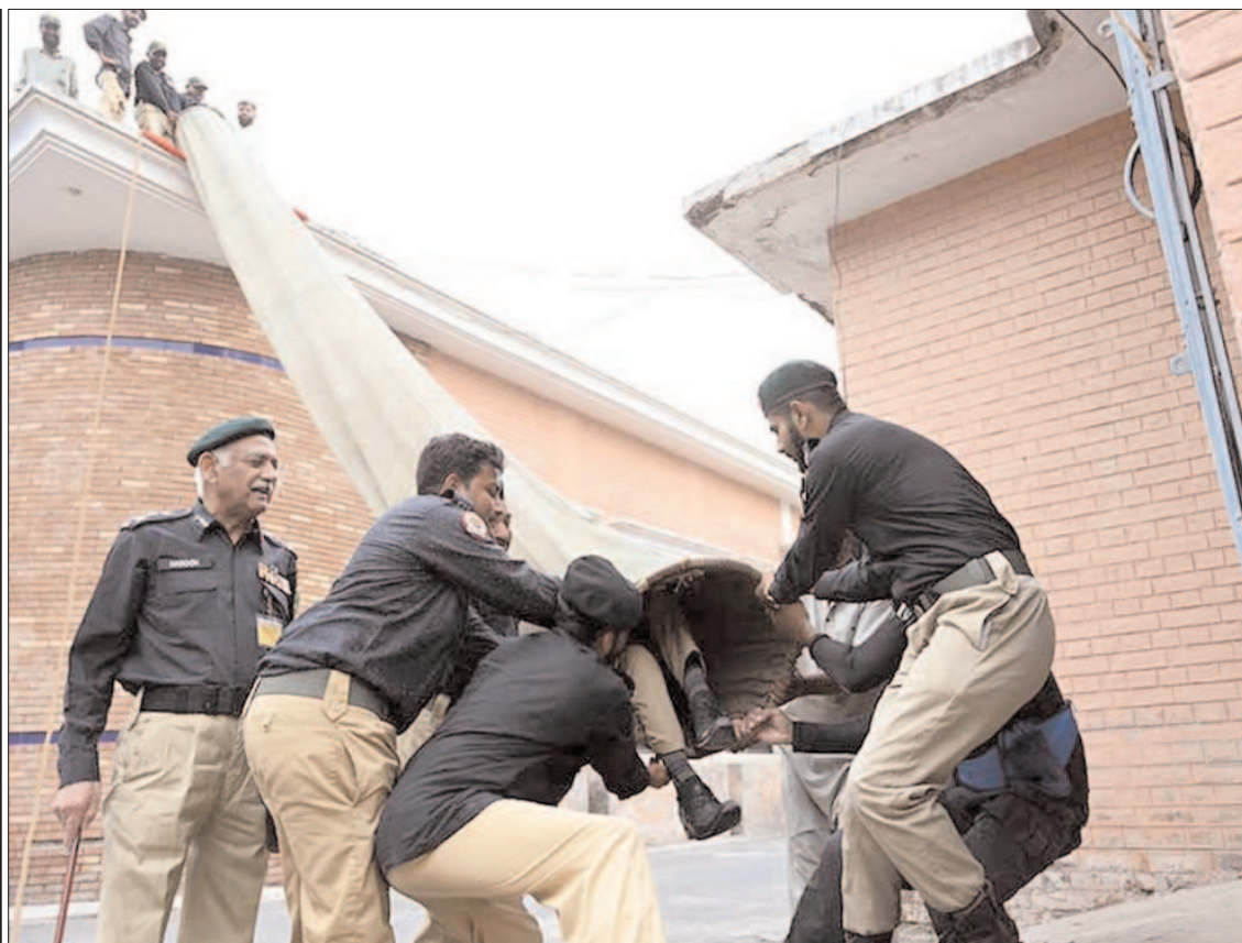
SARGODHA: A view of joint mock exercises conducted by Rescue 1122, Civil Defense, Police, and STD to enhance preparedness for emergency situations.

The exercise was conducted as part of the government's contingency plan to train hospital staff, patients, and the public on responding effectively to war or emergency situations. During the drill, Rescue 1122 teams provided training on firefighting, first aid, evacuation procedures, and accessing emergency shelters. Doctors, nurses, paramedics, and other hospital staff actively participated in the session.