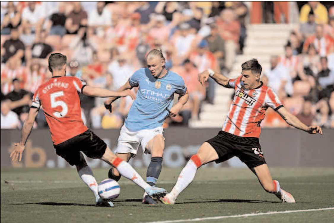
SOUTHAMPTON: Erling Haaland of Manchester City is challenged by Jack Stephens and Jan Bednarek of Southampton during the Premier League match.