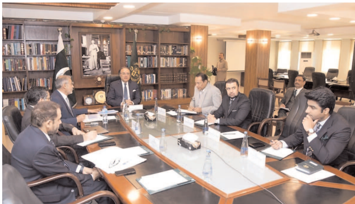
ISLAMABAD: Finance Minister Senator Muhammad Aurangzeb engaging with leading exporters and businessmen led by Shabbir Diwan on driving export-led growth and policy reforms.

Aurangzeb assured that all stakeholders inputs will be considered in shaping the next phase of reforms. He emphasized the importance of public-private collaboration to lay down a resilient, productive, and globally integrated economic framework.