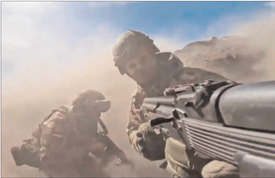
KYIV: Russian servicemen attend combat training for assault units in an undisclosed location in Ukraine.