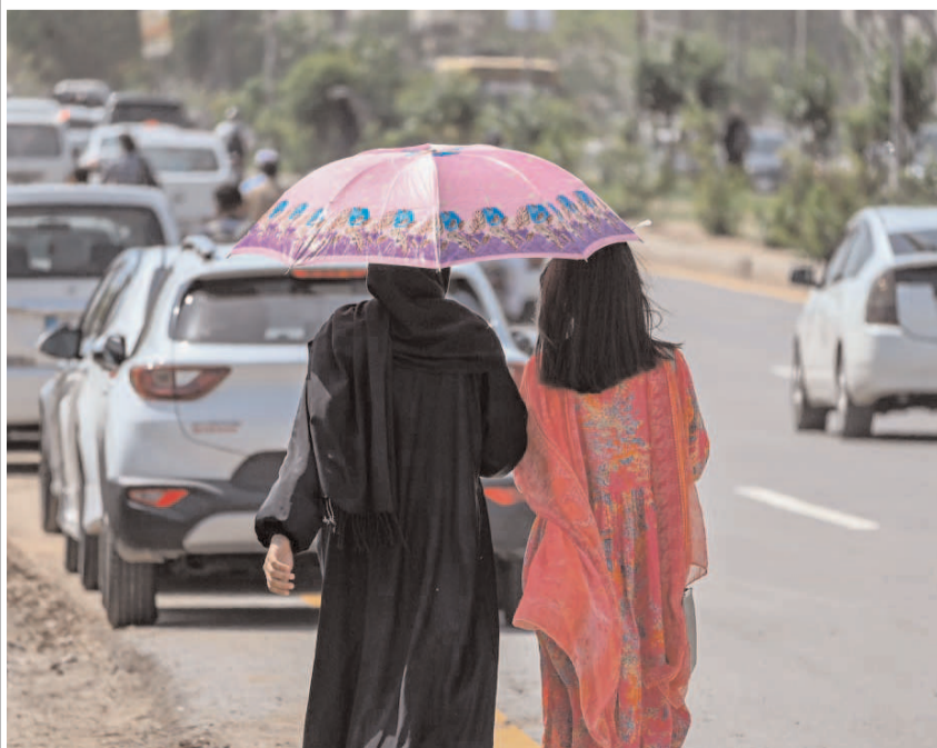
ISLAMABAD: Women take shelter under umbrellas to shield themselves from the scorching sun on a hot summer day in the federal capital.

Parliamentary Secretary. In response to the question, he added that sufficient funds have been allocated for the repair and maintenance of the Lahore-Islamabad M-2 Motorway. "We have already completed work on most sections. Now, only selected areas on the M-2 and M-9 motorways remain. Around 30 percent of the work in these remaining sections is expected to be completed within the next six months," he added.