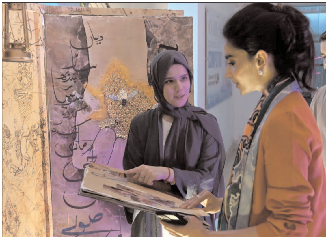
ISLAMABAD: Students of UCA BA (Hons) Fashion Textiles showcase their work during the Annual Thesis Display | Class of 2025, organized by the Department of Art and Design at TMUC.