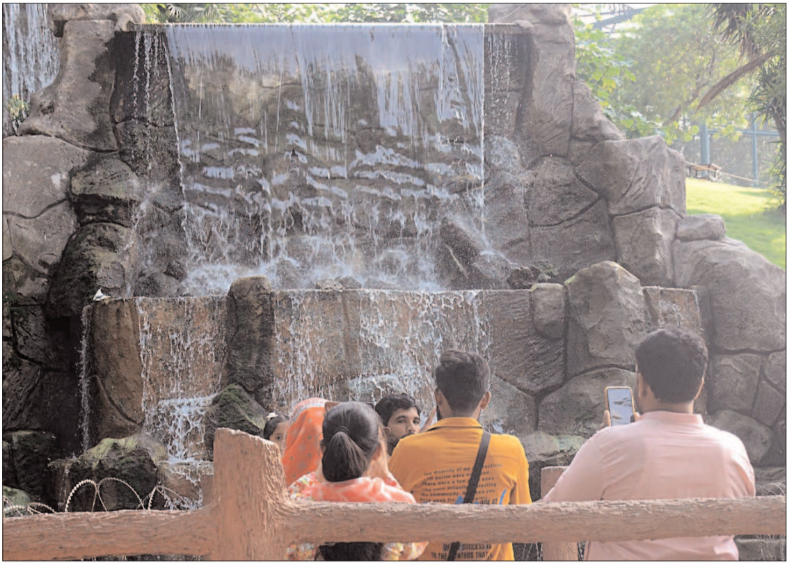
LAHORE: Visitors take pictures near the water fall point during their visit to the zoo.