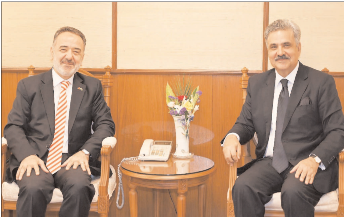
ISLAMABAD: Chief Justice of Pakistan, Justice Yahya Afridi in a meeting with Ambassador of Turkey to Pakistan, Irfan Neziroglu.