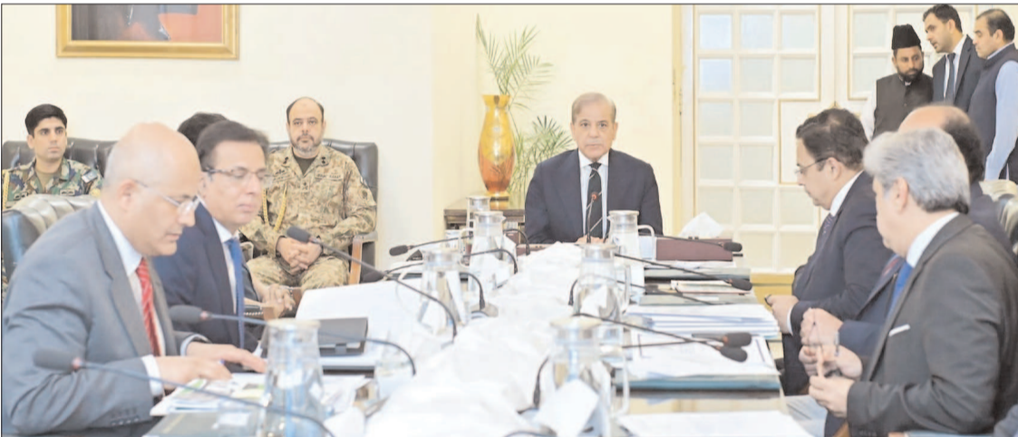
ISLAMABAD: Prime Minister Shehbaz Sharif chairing a review meeting on Danish schools and University.

The Chief Justice had visited Türkiye to participate in the 63rd Anniversary celebrations of the Constitutional Court of the Republic of Türkiye. The Chief Justice highlighted the long-standing and cordial judicial relations between Pakistan and Türkiye, rooted in mutual respect, shared legal traditions, and deep cultural ties. He appreciated the ongoing cooperation in the field of judicial education and capacity building of various tiers of judicial system.