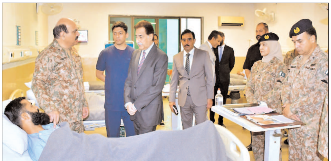
RAWALPINDI: Speaker National Assembly Sardar Ayaz Sadiq visits CMH Rawalpindi to inquire about the well-being of those injured in the aftermath of the recent Indian attack on Pakistan.