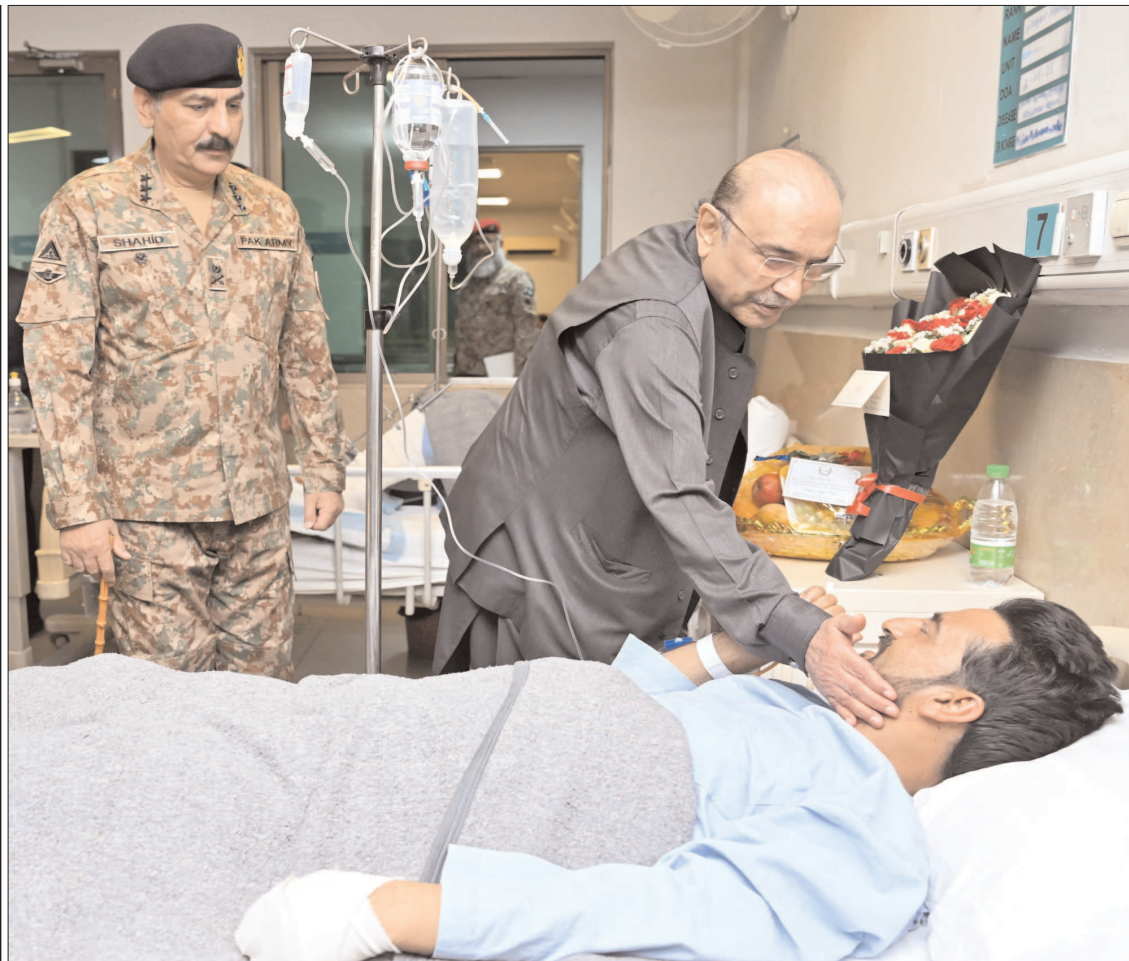
RAWALPINDI: President Asif Ali Zardari visited CMH to inquire after the health of Jawans of Pakistan Army and civilians who were injured during the Indian aggression.

Sharjeel Inam Memon stated that the international media was eager to hear Pakistan's position, and Chairman Bilawal Bhutto Zardari effectively presented it in a comprehensive and articulate manner. He said that a new Pakistan has emerged after the war-a Pakistan that stood united during a time of great challenge.