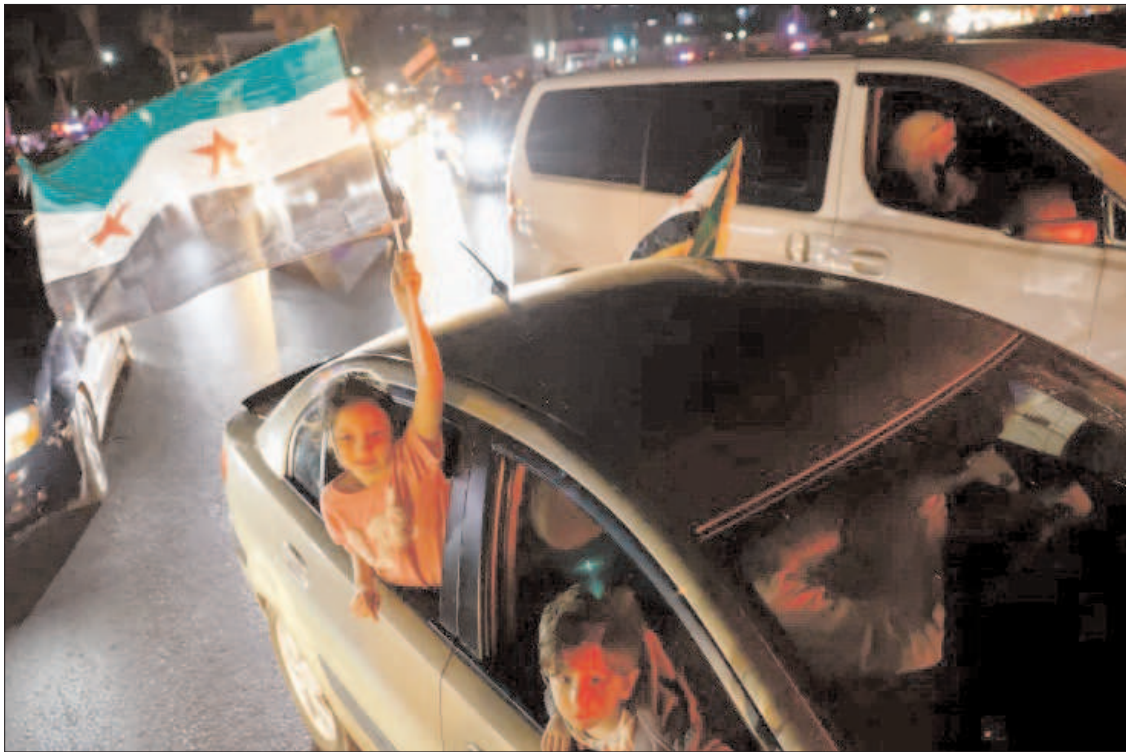
DAMASCUS: A girl holding a Syrian flag as people celebrate after US President Donald Trump said he would order the lifting of sanctions on Syria.