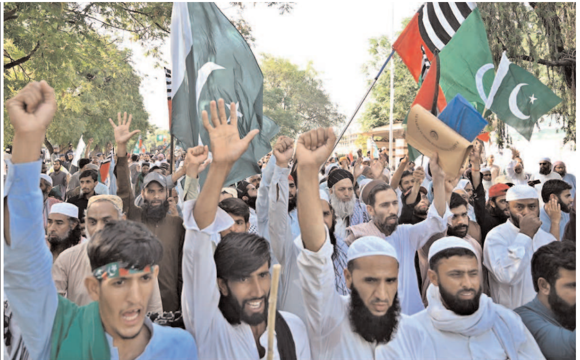
ISLAMABAD: Members of the Sunni Ulema Council hold a rally to mark Thanksgiving Day, expressing gratitude for the success of Operation 'Bunyan al-Marsoos'.