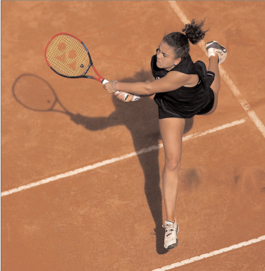
ROME, ITALY: Jasmine Paolini of Italy plays a backhand against Peyton Stearns of the United States during the Women's Singles Semi Final match on Day Eleven of the Internazionali BNL D'Italia 2025 at Foro Italico on May 15, 2025 in Rome, Italy.

play. Edwards helped Minnesota regain a double-digit advantage moments later. He knocked down a 3-pointer to put the Timberwolves on top 102-90, and Jaden McDaniels increased the lead to 14 points with a steal and a layup with 6:36 remaining. "The team has come together at the right time and is playing its best basketball," Finch said. The Timberwolves led 62-47 at the half. Golden State trailed 45-42 after Podziemski made a jump shot with 4:11 left in the half. Minnesota closed the second quarter on a 17-5 run to grab a 15-point lead. Randle finished the first-half scoring with a three-point play after making a layup and drawing a foul. The Timberwolves shot 62.8 percent (49 of 78) overall and 41.9 percent (13 of 31) from beyond the arc. The Warriors shot 43.3 percent (39 of 90) from the field and 28.2 percent (11 of 39) from 3-point range.