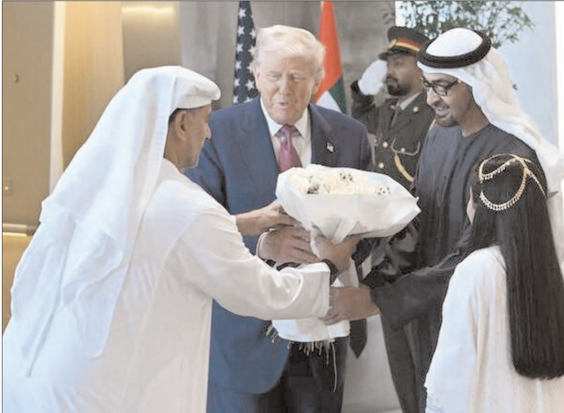
ABU DHABI: UAE President Sheikh Mohamed bin Zayed looks on as his US counterpart Donald Trump is welcomed at the presidential terminal.