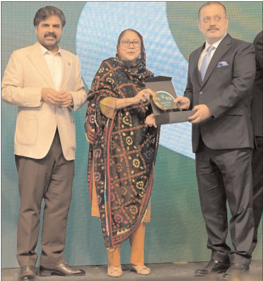
KARACHI: Senior Sindh Minister for Information, Transport, and Mass Transit, Sharjeel Inam Memon presenting shield to PPP leader Faryal Talpur at a ceremony.