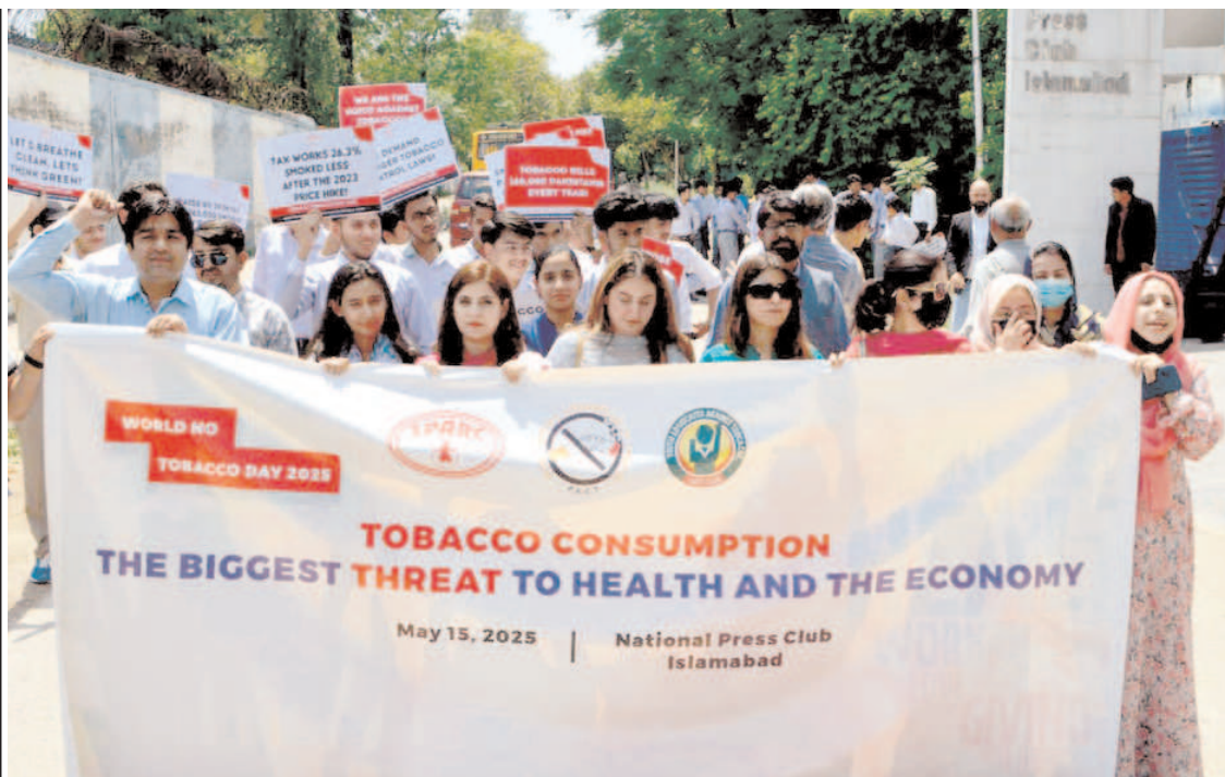
ISLAMABAD: Participants hold banners and placards with strong messages like "Say No to Tobacco" and "Protect Our Future" during an awareness walk.